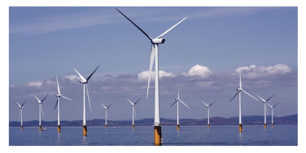
1 One of the increasing numbers of offshore wind farms being built as we move to a renewable based power system.

In 2013, at the start of the regulatory price control period RIIO T1, it was recognised that there was a need to accelerate generation connections ahead of network reinforcement if climate targets were to be achieved using a process called Connect and Manage. It was also recognised that when necessary network reinforcement outages were later required, this could cause increased system constraint costs. It would also restrict system access for those connected ahead of reinforcement as well as existing customers. It was these issues that determined the need for a Network Access Policy (NAP).