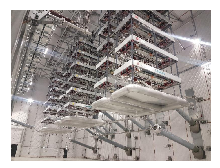
3 – Thyristor valve hall, part of HVDC systems used in subsea links. Outages on transmission equipment are required for maintenance to keep the network safe and reliable as well as to carry out upgrades to increase capacity

The Enhanced Service Provision the TOs will offer to NGESO and our stakeholder engagement commitments stated in the Three – Six year ahead period will also be applicable during this stage of the long-term outage planning process where timescales allow.