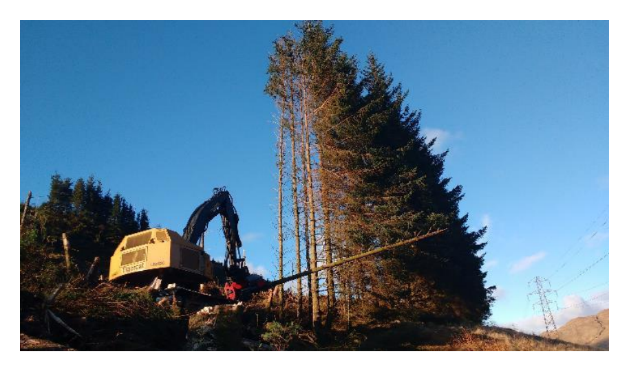
2 - Live overhead line techniques using Tigercat to remove trees that would otherwise require an outage due to the proximity of the transmission circuit to the right.

We commit to enhanced stakeholder engagement therefore the TOs will continuously review our long-term outage plans to identify, in conjunction with the ESO, any outage that is greater than 4 weeks and communicate this during this planning timeframe to the relevant stakeholder. The TOs will commit to working with NGESO and the relevant stakeholder to identify solutions to minimise the impact of long duration outages.