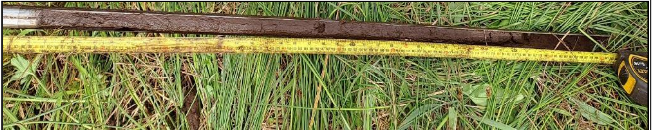
Peat Auger 07 1.0 – 1.5m