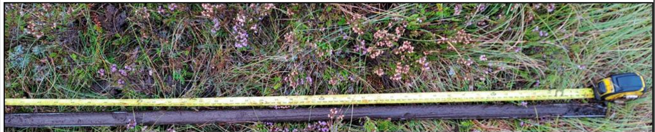
Peat Auger 02 1 – 2.0m