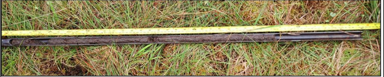
Peat Auger 01 0 – 1.0m