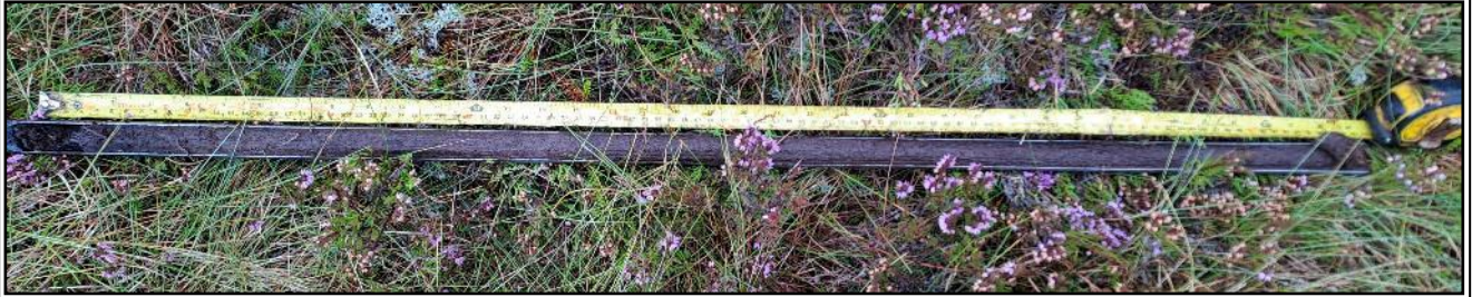
Peat Auger 02 0 – 1.0m