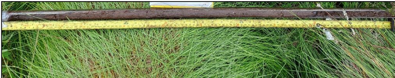
Peat Auger 06 0 – 1.0m