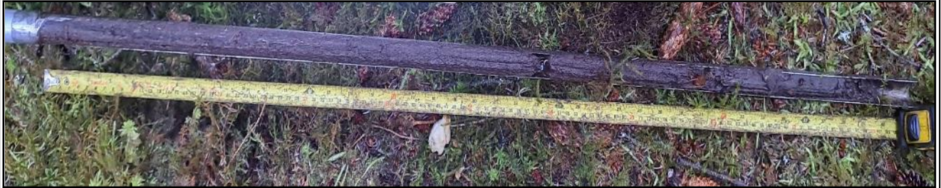
Peat Auger 03 0 – 1.0m