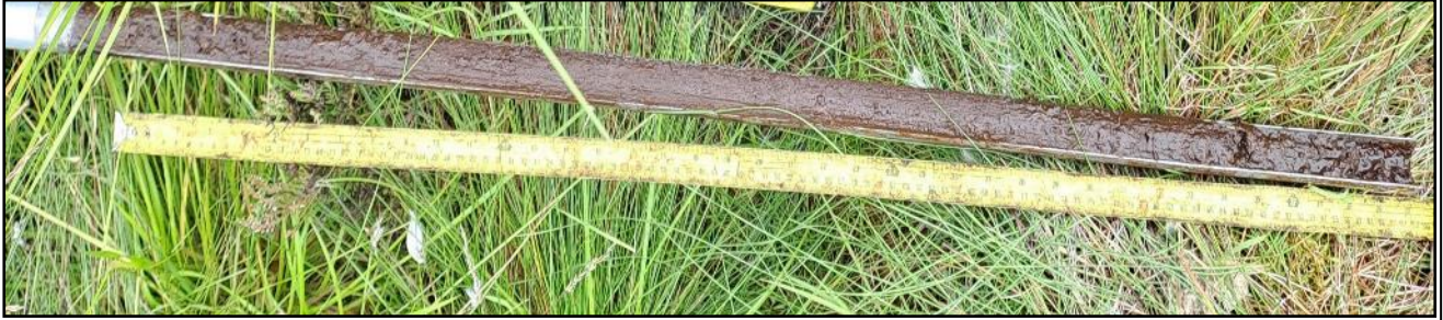
Peat Auger 05 0 – 1.0m