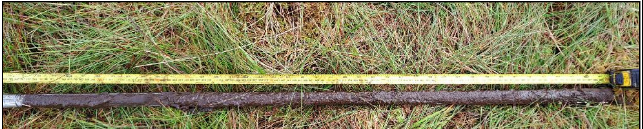
Peat Auger 01 1 – 2m