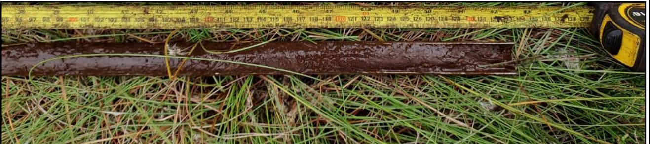
Peat Auger 05 1.0 – 1.3m