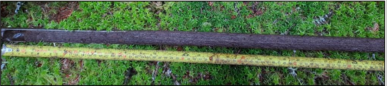
Peat Auger 04 1.0 – 2.0m