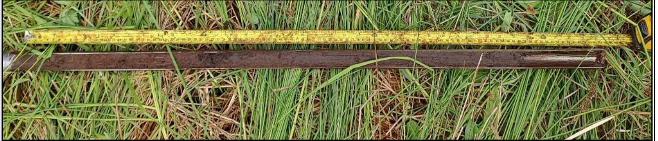
Peat Auger 07 0 – 1.0m