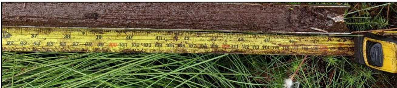
Peat Auger 06 1.0 – 1.2m