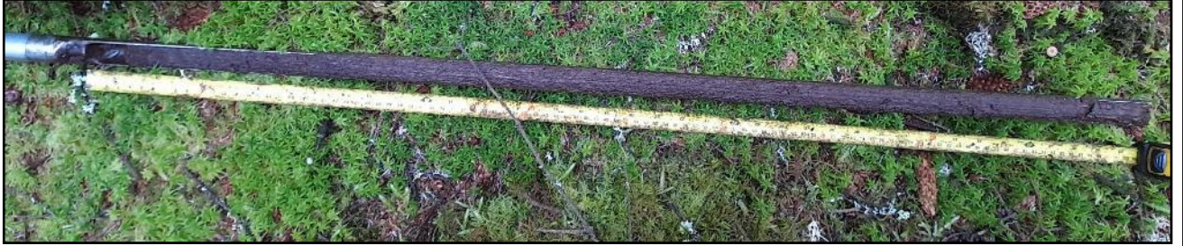
Peat Auger 04 0 – 1.0m