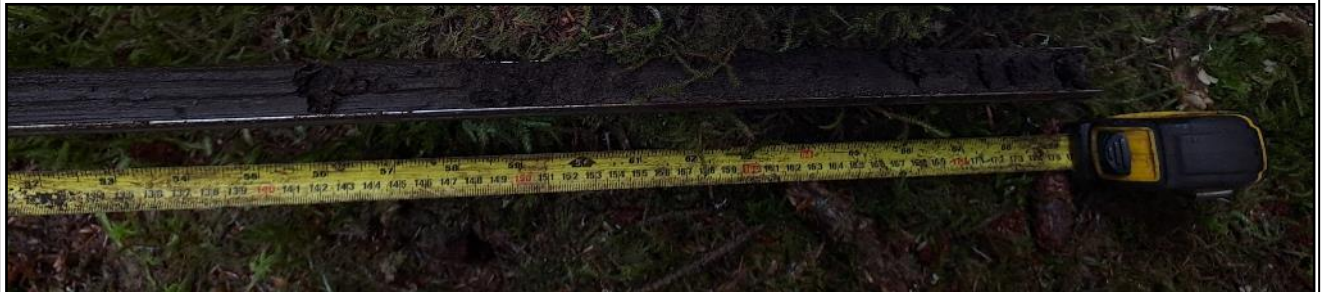
Peat Auger 03 1 – 1.7m