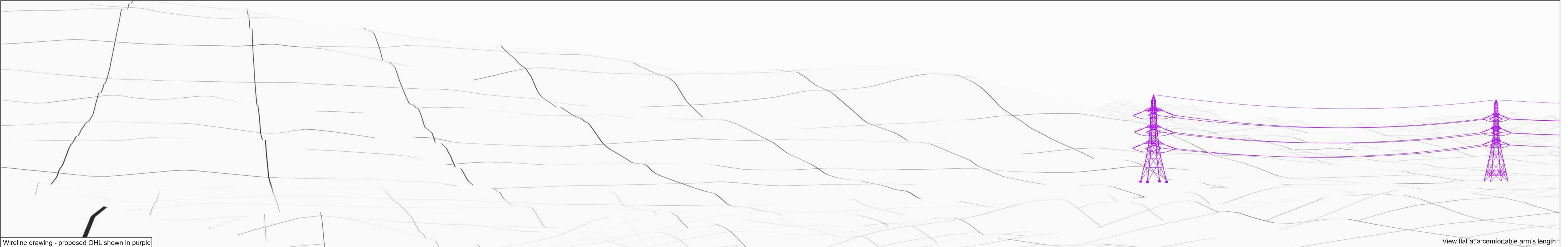
Wireline drawing - proposed OHL shown in purple