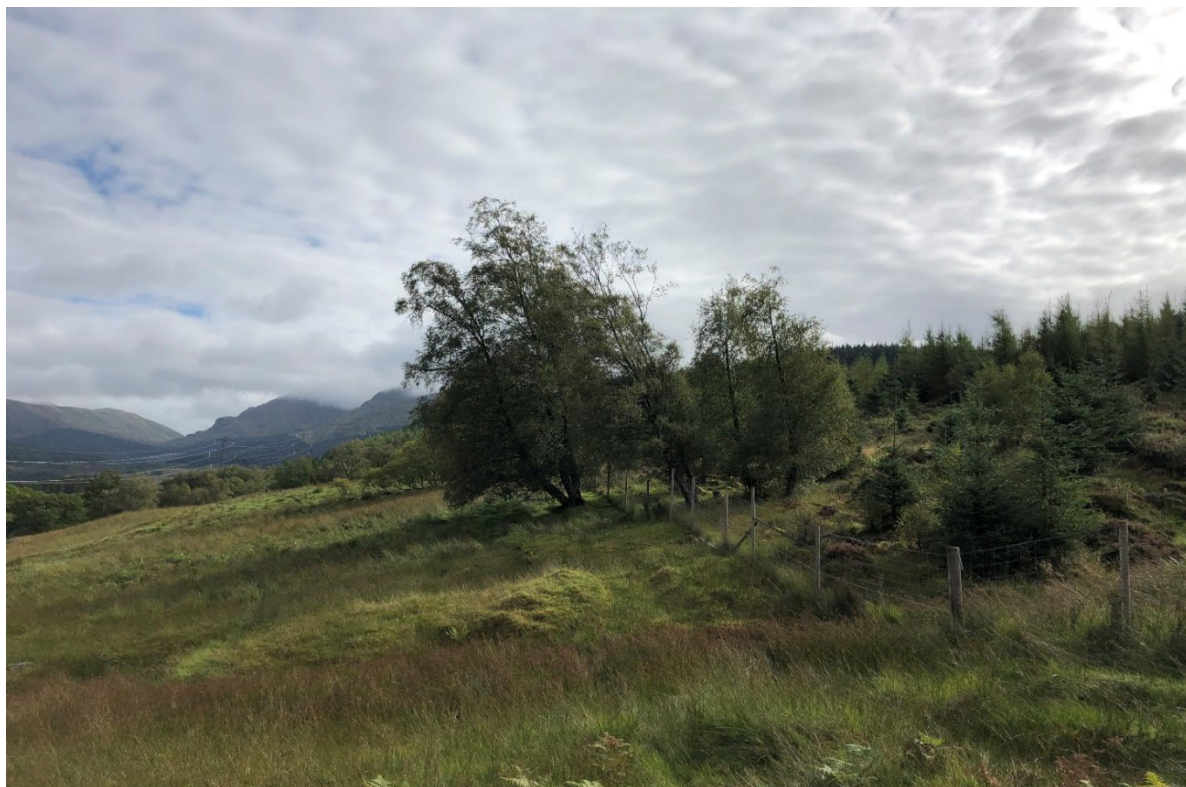
Plate 5.2: Looking east to tower 46.