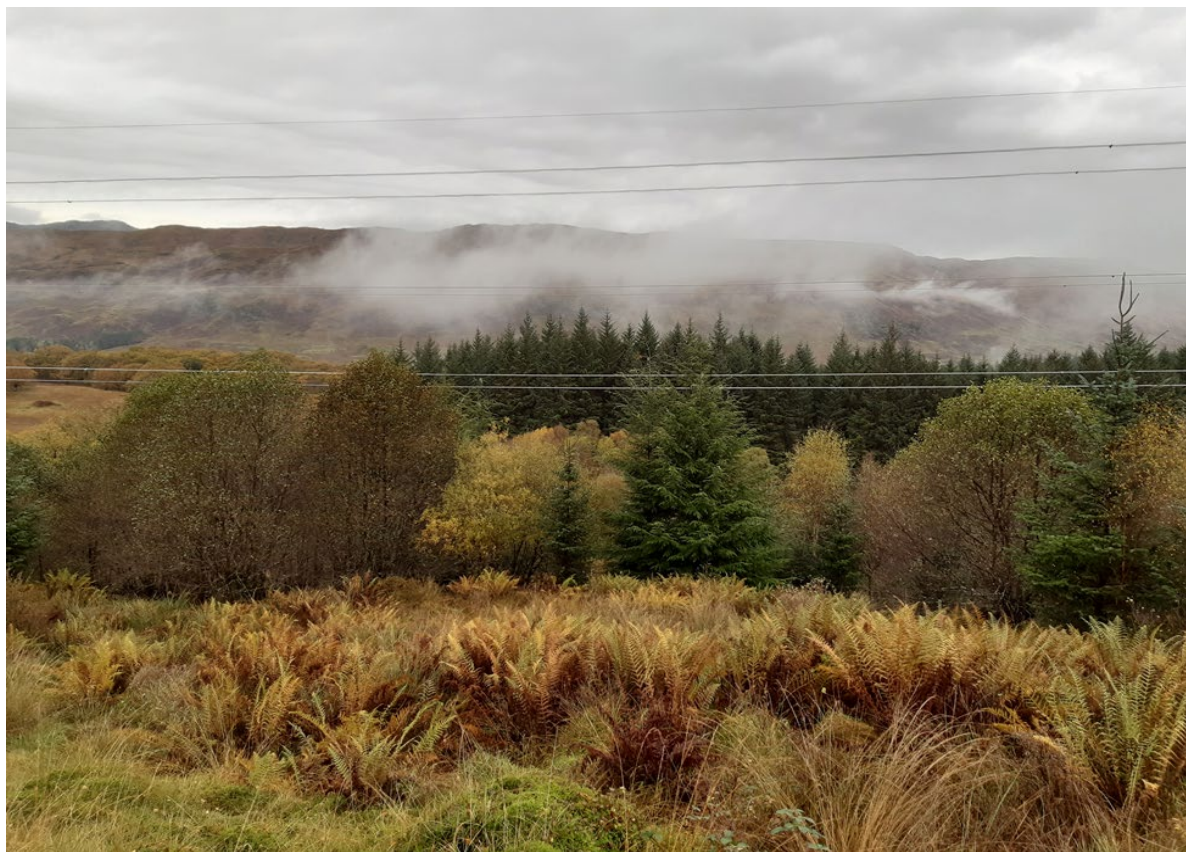
Plate 5.7: Looking north from tower location 47.