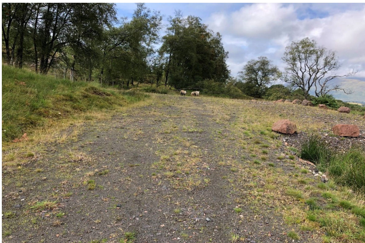
Plate 5.4: Looking south west along the access track section between towers 46 and 47 on the neighbouring property Brackley Farm.