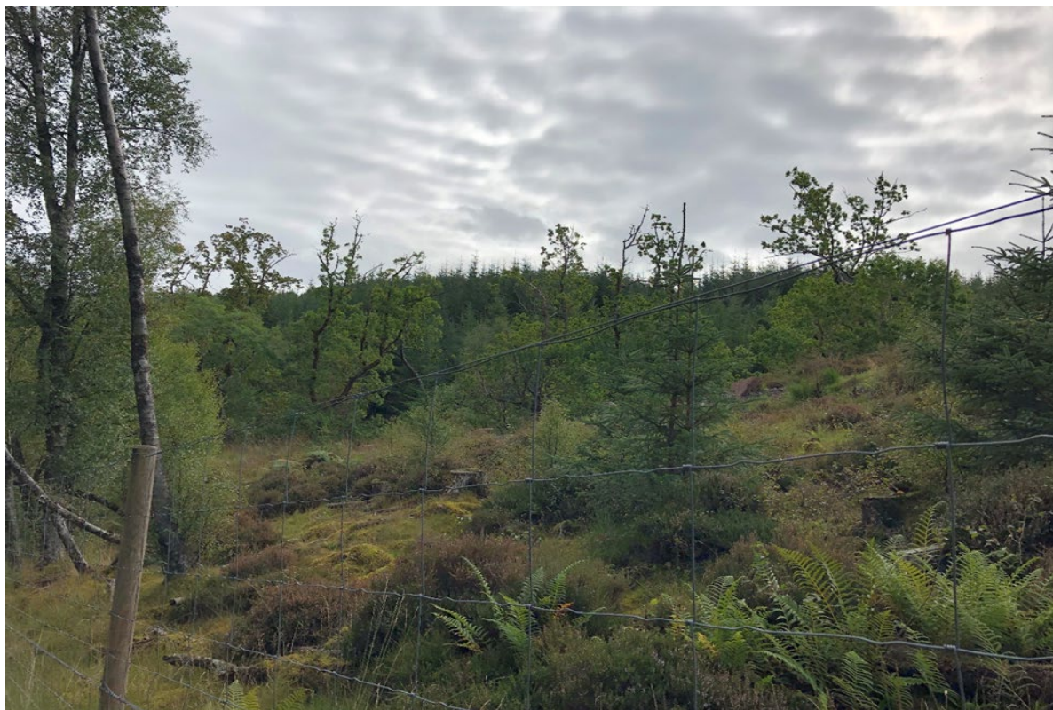
Plate 5.3: Looking north east from tower location 45.