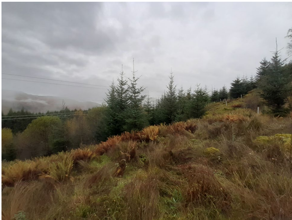
Plate 5.5: Looking east from tower location 47.