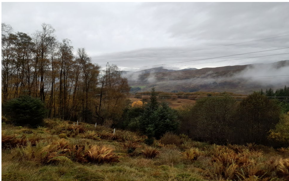
Plate 5.6: Looking north west from tower location 47.