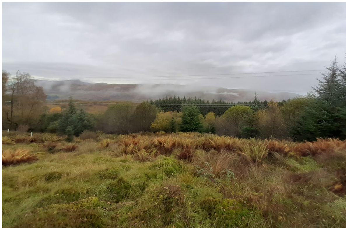
Plate 5.8: Looking north from tower location 47.