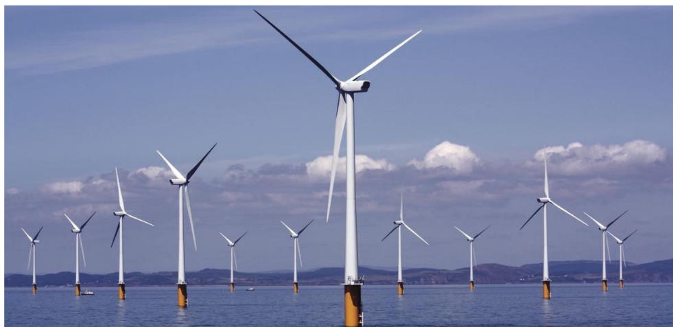
1 One of the increasing numbers of offshore wind farms being built as we move to a renewable based power system.

In 2013, at the start of the regulatory price control period RIIO T1, it was recognised that there was a need to accelerate generation connections ahead of network reinforcement if climate targets were to be achieved using a process called Connect and Manage. It was also recognised that when necessary network reinforcement outages were later required, this could cause increased system constraint costs. It would also restrict system access for those connected ahead of reinforcement as well as existing customers. It was these issues that determined the need for a Network Access Policy (NAP).