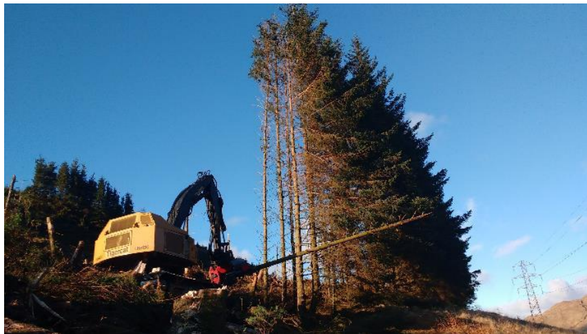
2 - Live overhead line techniques using Tigercat to remove trees that would otherwise require an outage due to the proximity of the transmission circuit to the right.

We commit to enhanced stakeholder engagement therefore the TOs will continuously review our long-term outage plans to identify, in conjunction with the ESO, any outage that is greater than 4 weeks and communicate this during this planning timeframe to the relevant stakeholder. The TOs will commit to working with NGESO and the relevant stakeholder to identify solutions to minimise the impact of long duration outages.