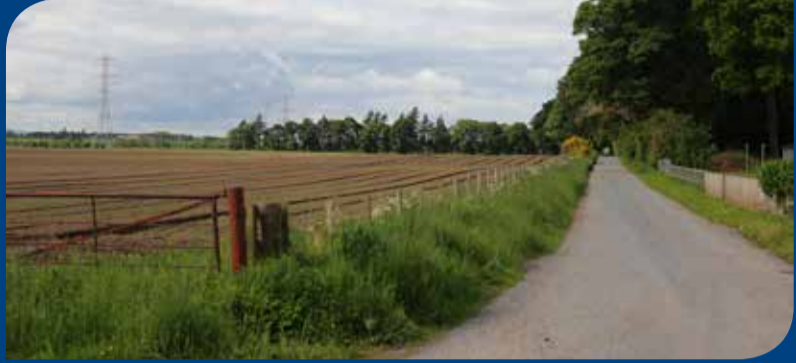
Existing tree line acting as natural screening.

SSEN have committed to delivering Biodiversity Net Gain for all Projects by 2025 as one of our main sustainability goals. The planting and screening will be designed to take this into account. Utilising native species to screen and enhance the site.