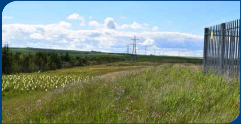
Shows Wildflower Meadow one year after seeding at recently constructed Spittal Substation in Caithness.