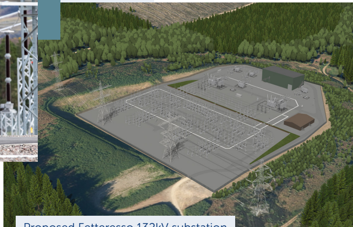
Proposed Fetteresso 132kV substation