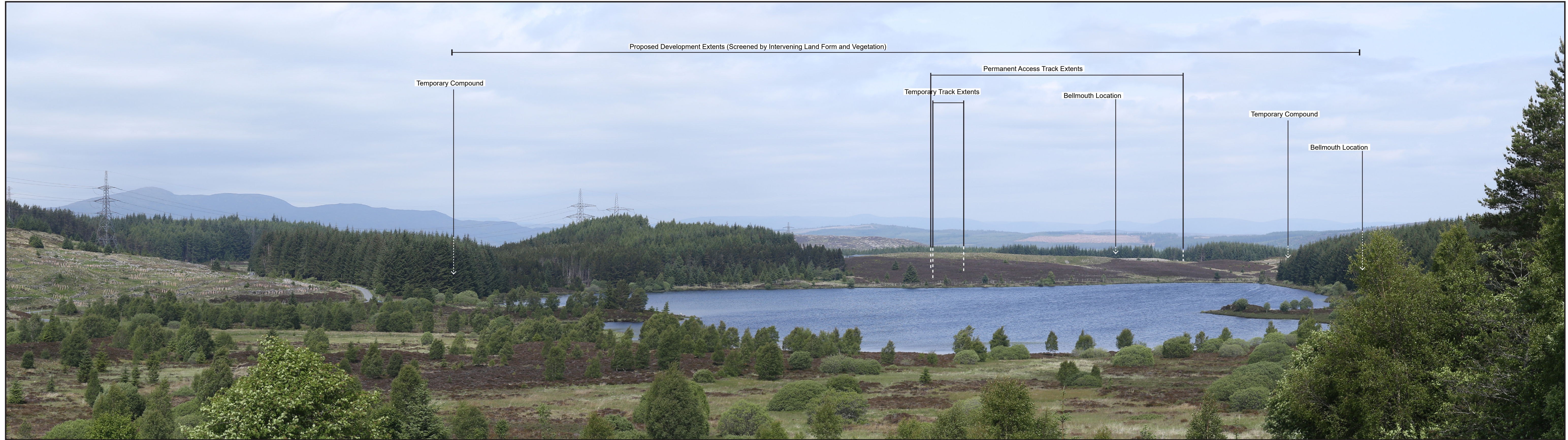
Photography showing extents of development