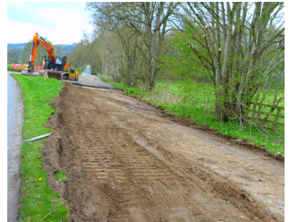
Strathtay Junction, Transhipment area for the transformer delivery to site