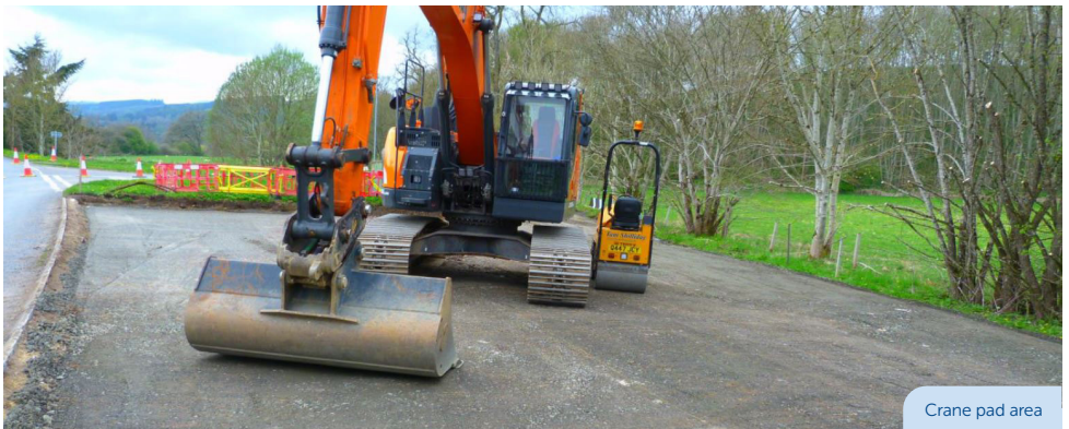
Crane pad area