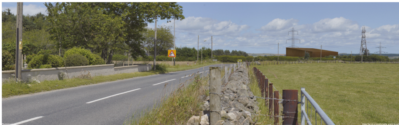
View of Option 2 in the absence of landscaping from B977 looking east towards the substation