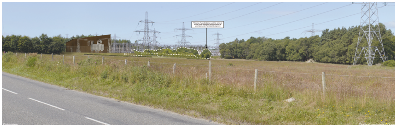
View of Option 1 in the absence of landscaping from B977 looking west towards the substation

The area of woodland/scrub marked out with the dotted line would be removed as part of the associated cabling works to be undertaken under Permitted Development.