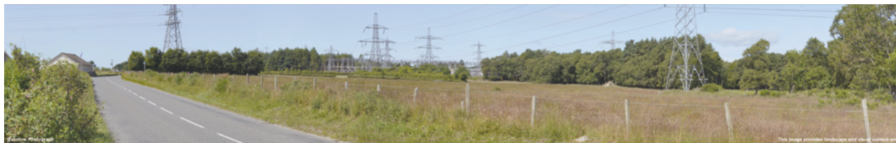
Existing view from B977 looking east towards the substation