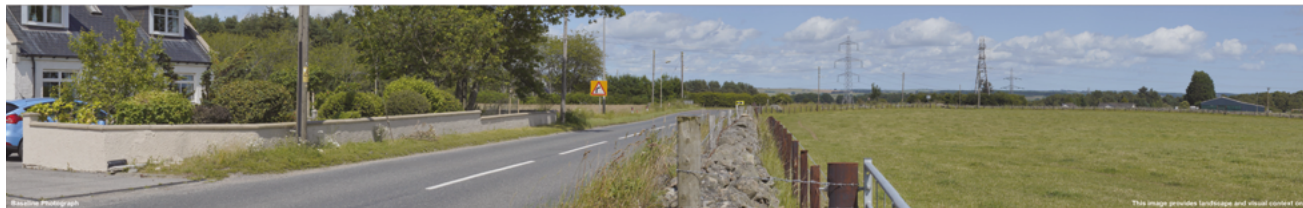
Existing view from B977 looking east towards the substation