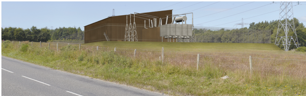
View of Option 2 in the absence of landscaping from B977 looking west towards the substation