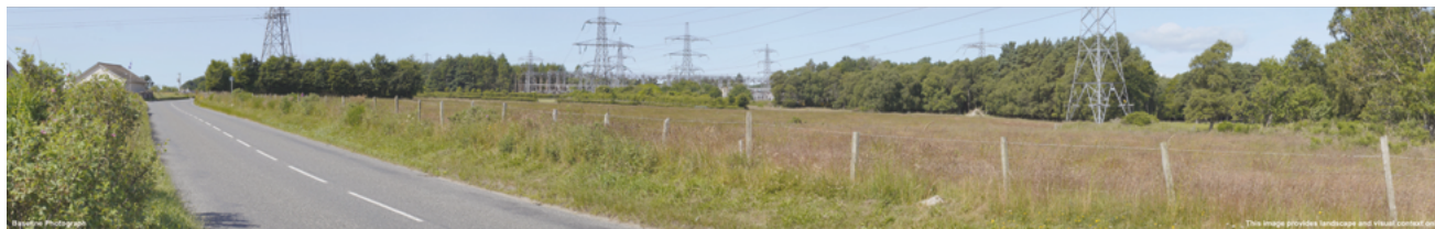
Existing view from B977 looking east towards the substation