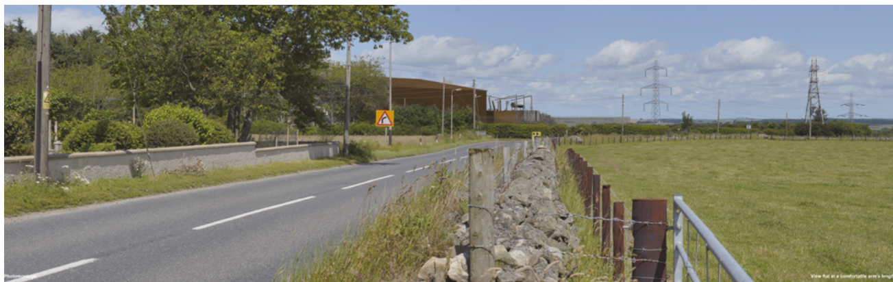
View of Option 1 in the absence of landscaping from B977 looking east towards the substation