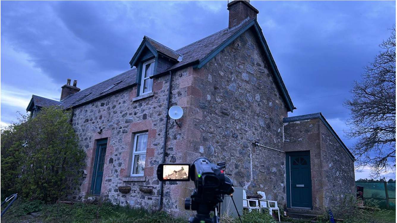
East elevation gable end