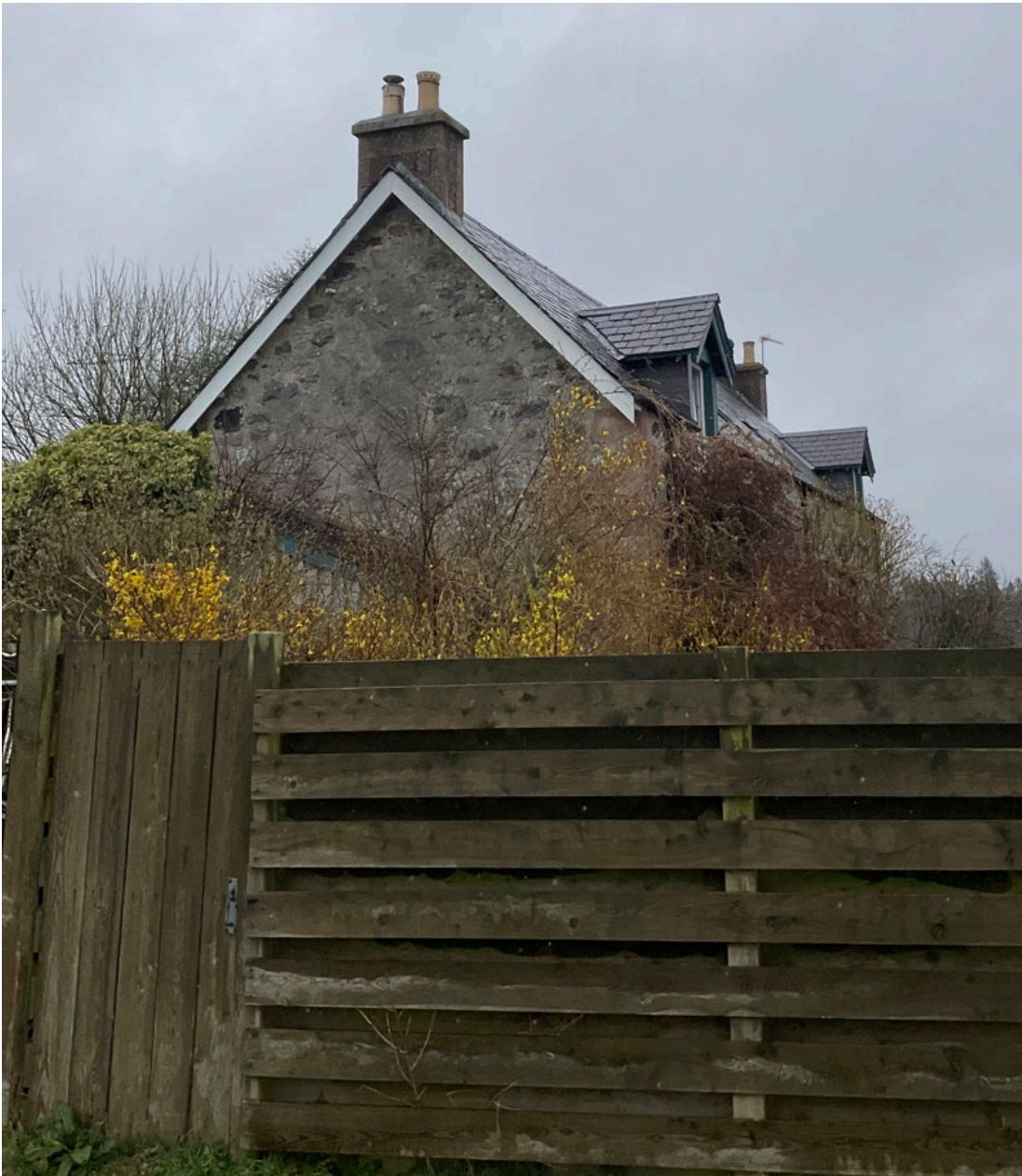
West elevation gable end