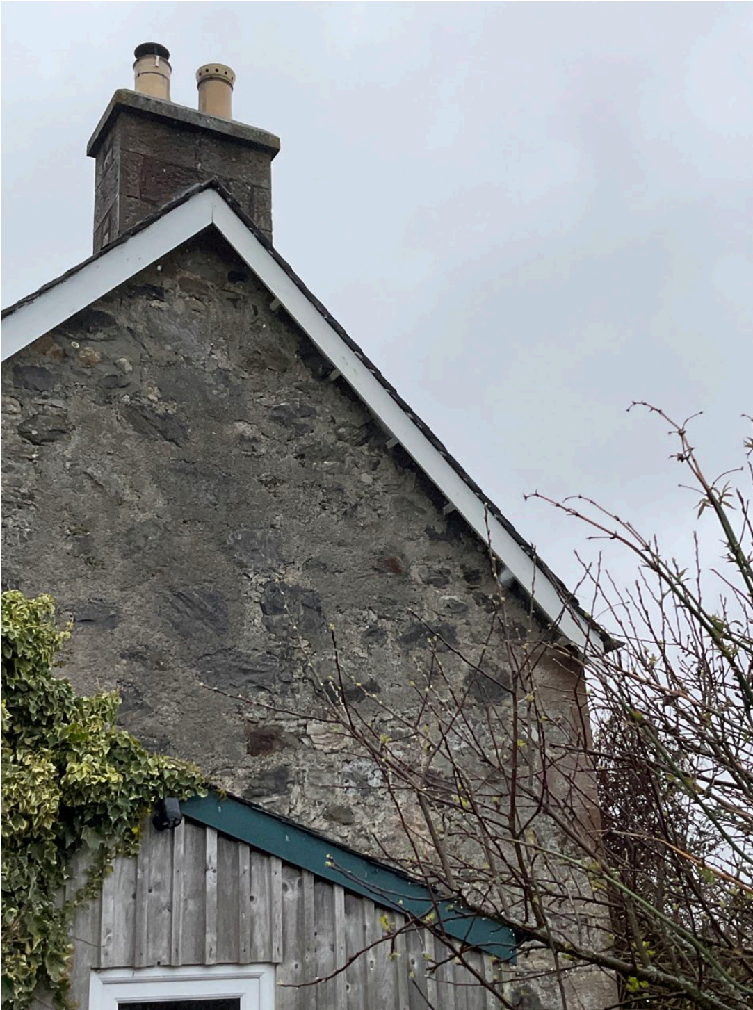
West elevation gable end