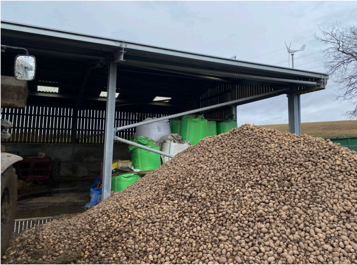
East elevation, north end