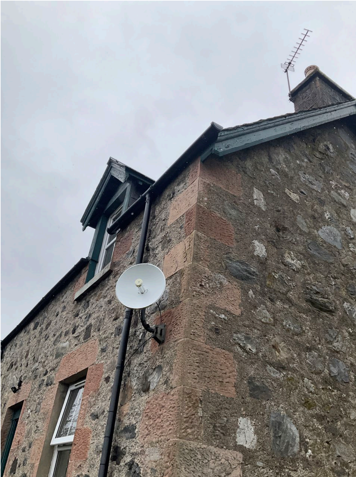
South east corner elevation