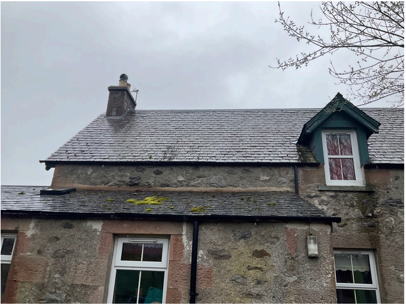
North elevation, east side