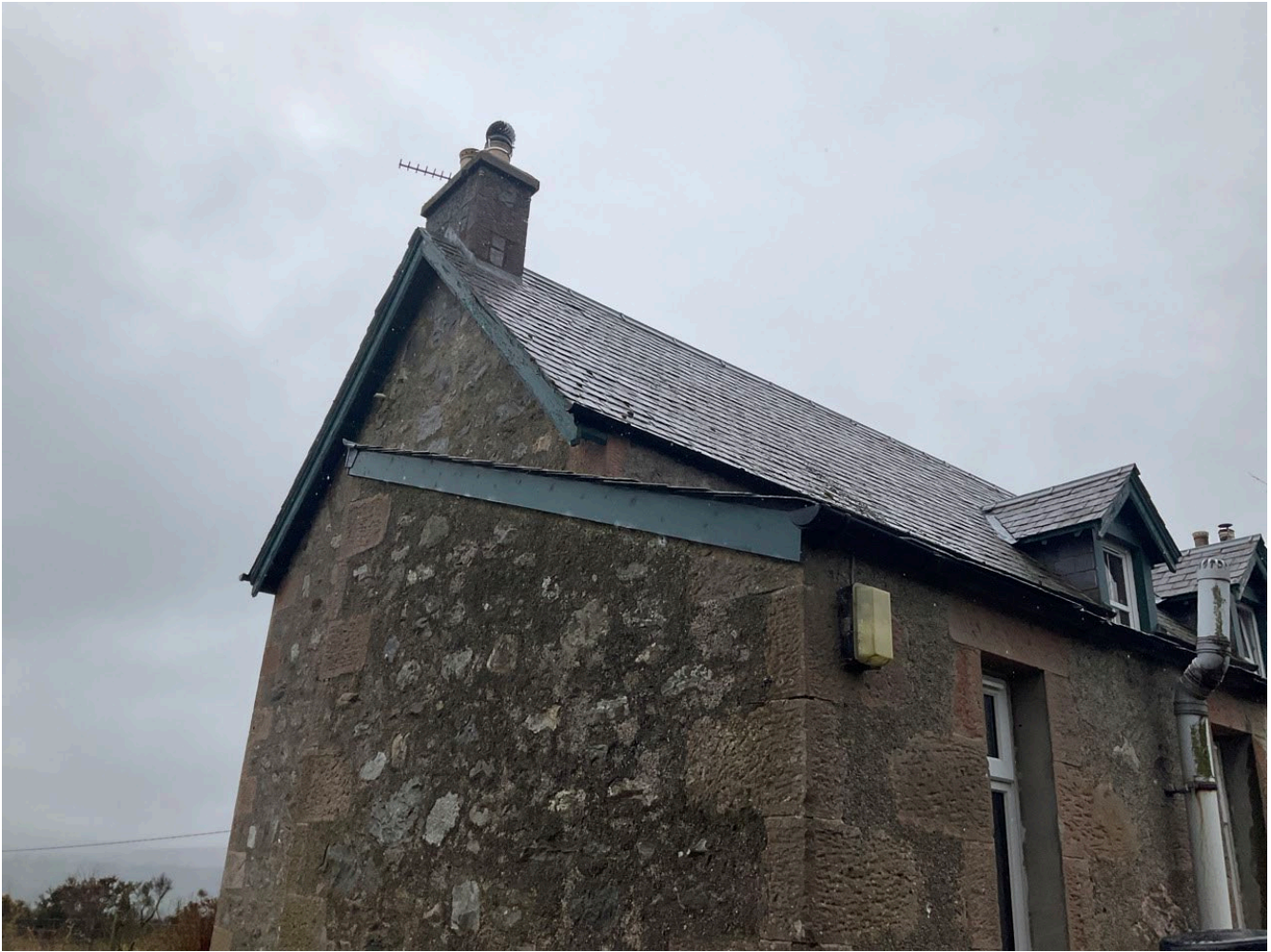
East elevation, north east corner