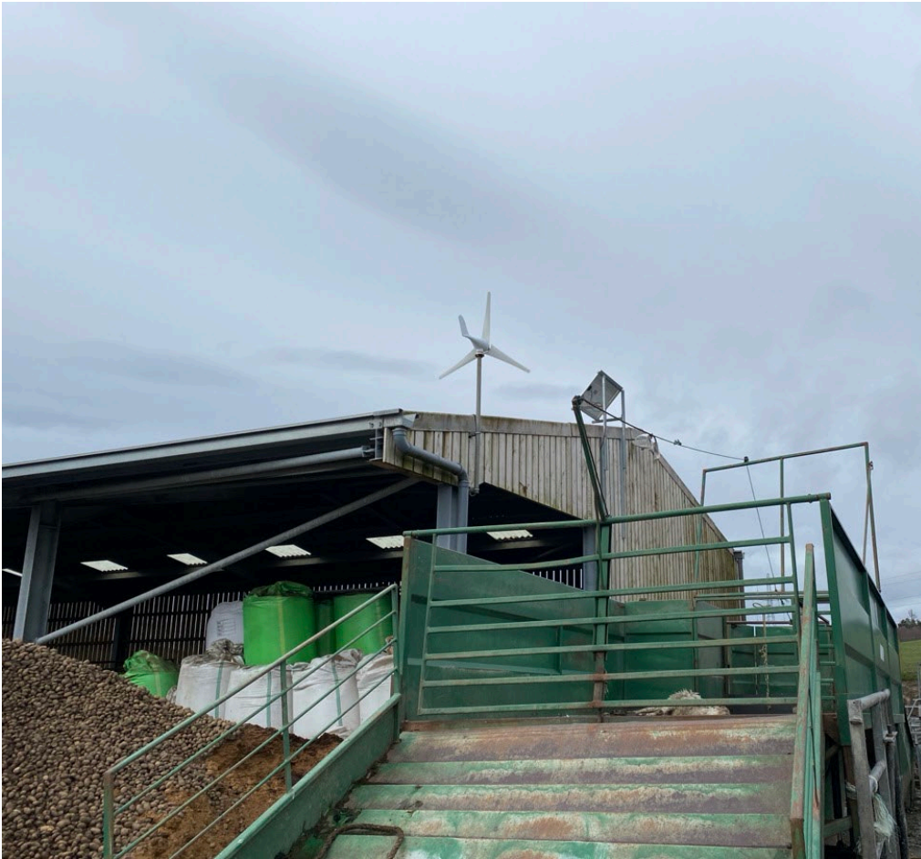
North east corner, north elevation