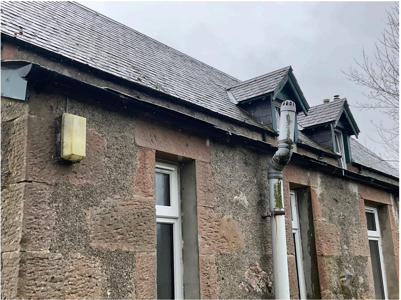
North elevation, east end