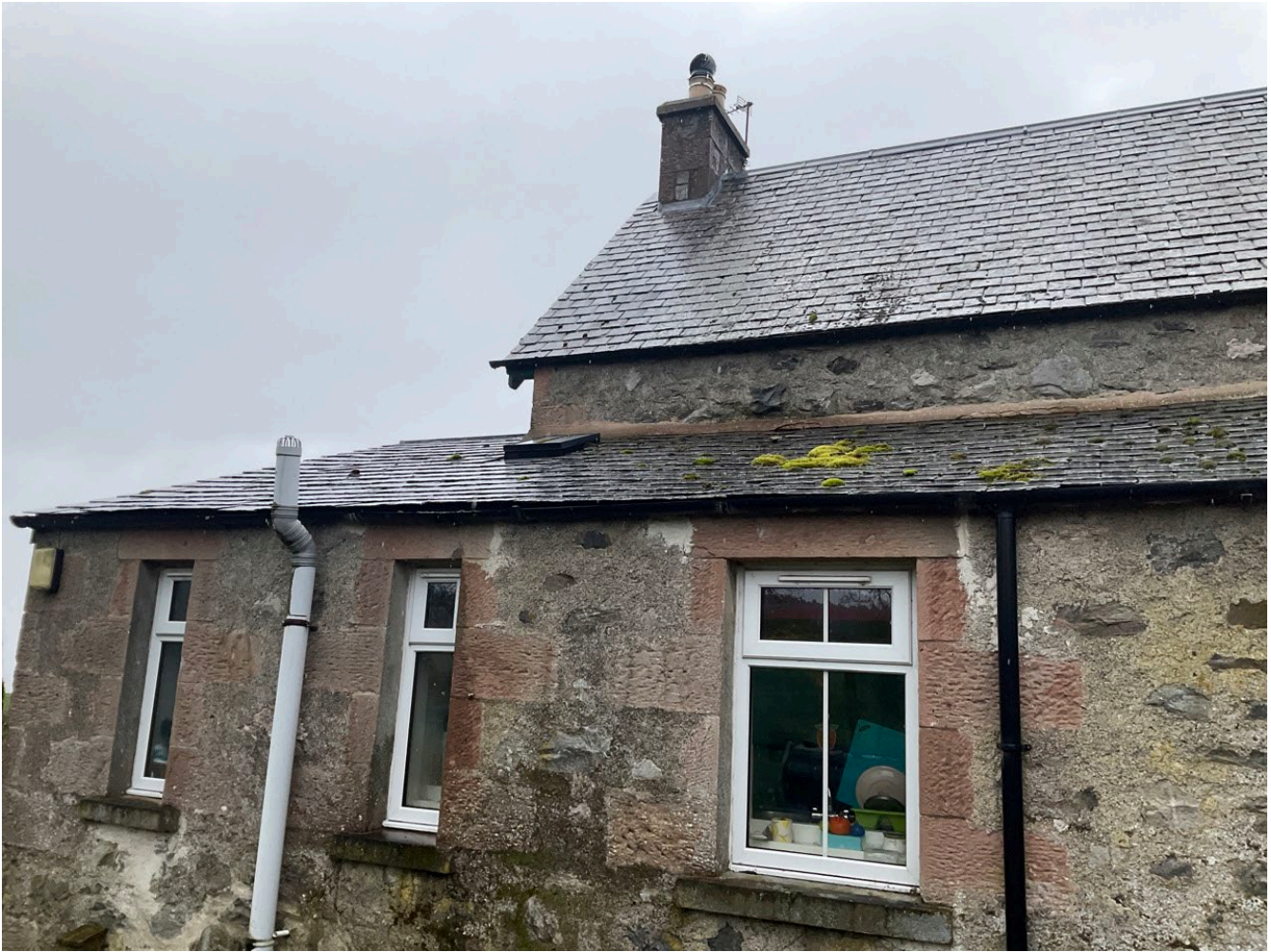
North elevation, east side