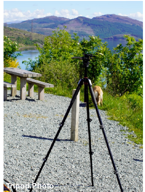
Ordnance Survey Grid Reference: NG 178671, 821149

Reproduced by permission of Ordnance Survey on behalf of HMSO. Crown copyright and database right 2022 all rights reserved. Ordnance Survey Licence number EL273236.