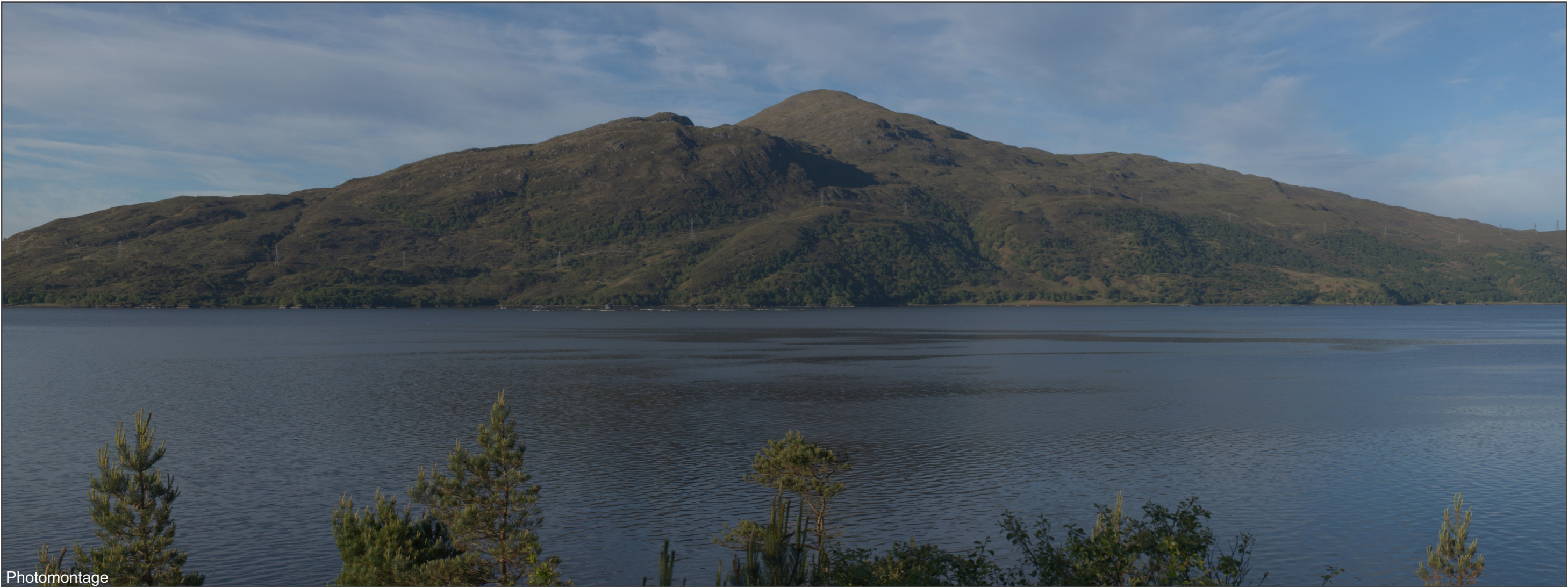
Figure V4B-3.3b - Visualisation Location 3-3: Donald Murchison’s Monument

OS reference: 178703 E 827081 N Nearest proposed tower: 2.03km Ground level: 11.9m AOD Direction of view: 199° Camera: Sony ILCE 7RM3 Focal length: 50mm vertical (27°) x 28mm horizontal (65.5°) Camera height: 1.5m Date: 02/06/2022 Time: 06:32 Drawing No. - 119026-D-EIA-V4B-3.3B-C-1.0.0 Date - 01.08.2022