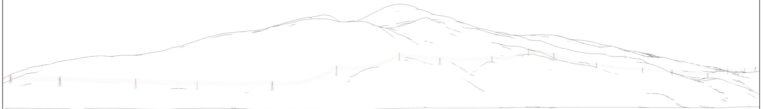
Figure V4B-3.3c - Visualisation Location 3-3: Donald Murchison's Monument

OS reference: 178703 E 827081 N Nearest proposed tower: 2.03km Ground level: 11.9m AOD Direction of view: 199° Camera: Sony ILCE 7RM3 Focal length: 50mm vertical (27°) x 28mm horizontal (65.5°) Camera height: 1.5m Date: 02/06/2022 Time: 06:32