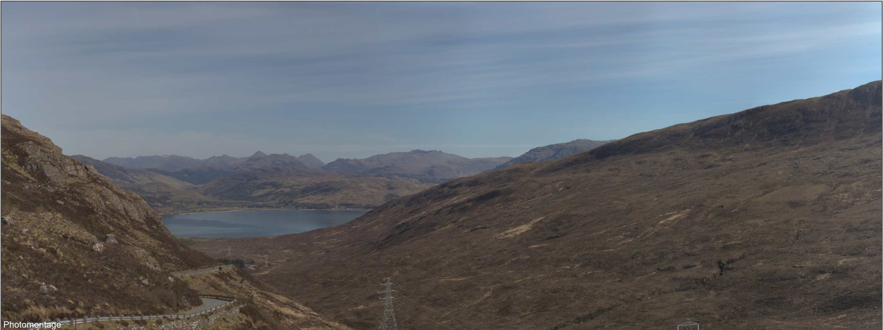
Figure V4B-3.4b - Visualisation Location 3-4: Bealach Udal

OS reference: 175560 E 820650 N Nearest proposed tower: 0.17km Ground level: 266.8m AOD Direction of view: 115° Camera: Canon EOS 5D Mk II Focal length: 50mm vertical (27°) x 28mm horizontal (65.5°) Camera height: 1.5m Date: 03/05/2017 Time: 13:40 Drawing No. - 119026-D-EIA-V4B-3.4B-C-1.0.0 Date - 01.08.2022