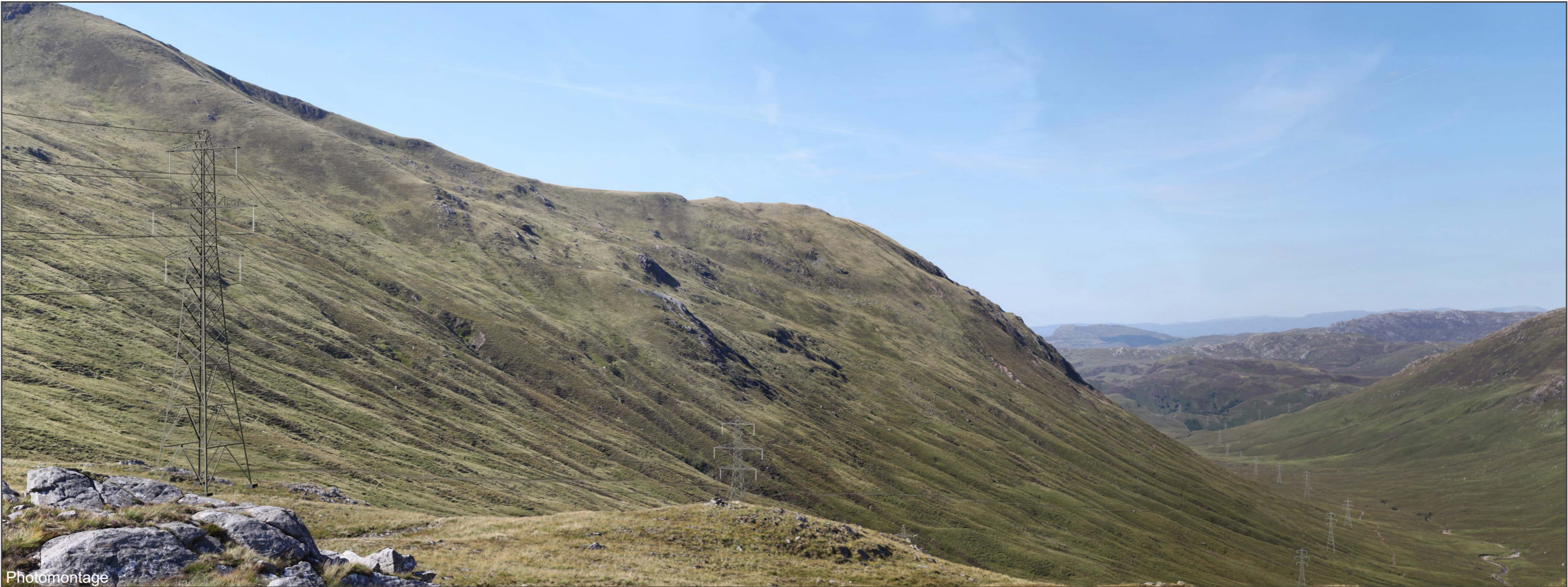
Figure V4B-4.2b - Visualisation Location 4-2: Bealach Aoidhdailean

OS reference: 188393 E 812087 N Nearest proposed tower: 0.10km Ground level: 475.5m AOD Direction of view: 310° Camera: Canon EOS 5D Mk II Focal length: 50mm vertical (27°) x 28mm horizontal (65.5°) Camera height: 1.5m Date: 16/08/2016 Time: 15:06 Drawing No. - 119026-D-EIA-V4B-4.2B-C-1.0.0 Date - 01.08.2022