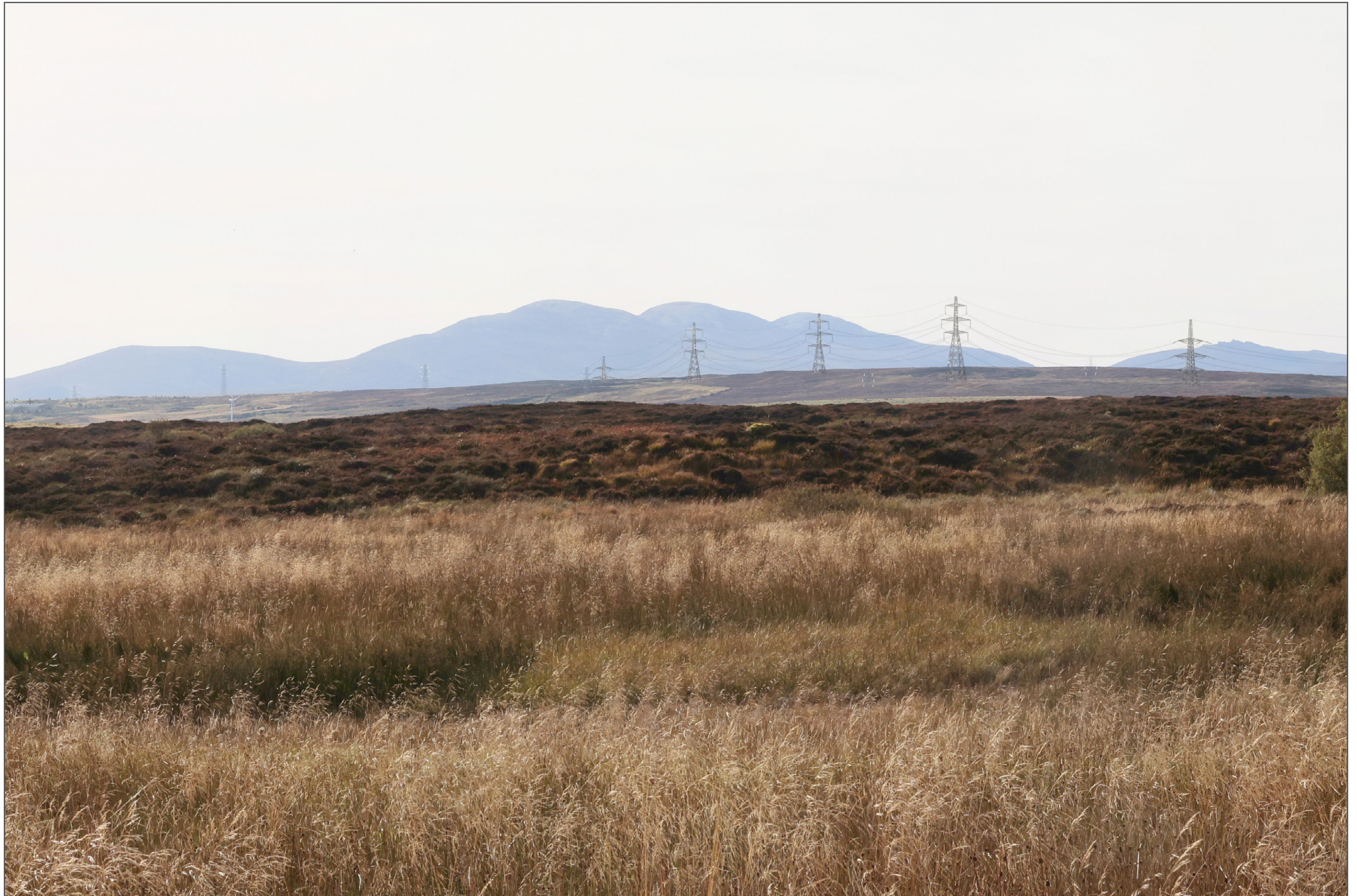
V4b Figure 7- 13b(ii) - Viewpoint 13: A9 (north east of Guidebest)

Distance to the development: 1600m Camera: Canon EOS R5 Focal Length: 75mm Camera height: 1.5m Date: 03/10/2024 14:00