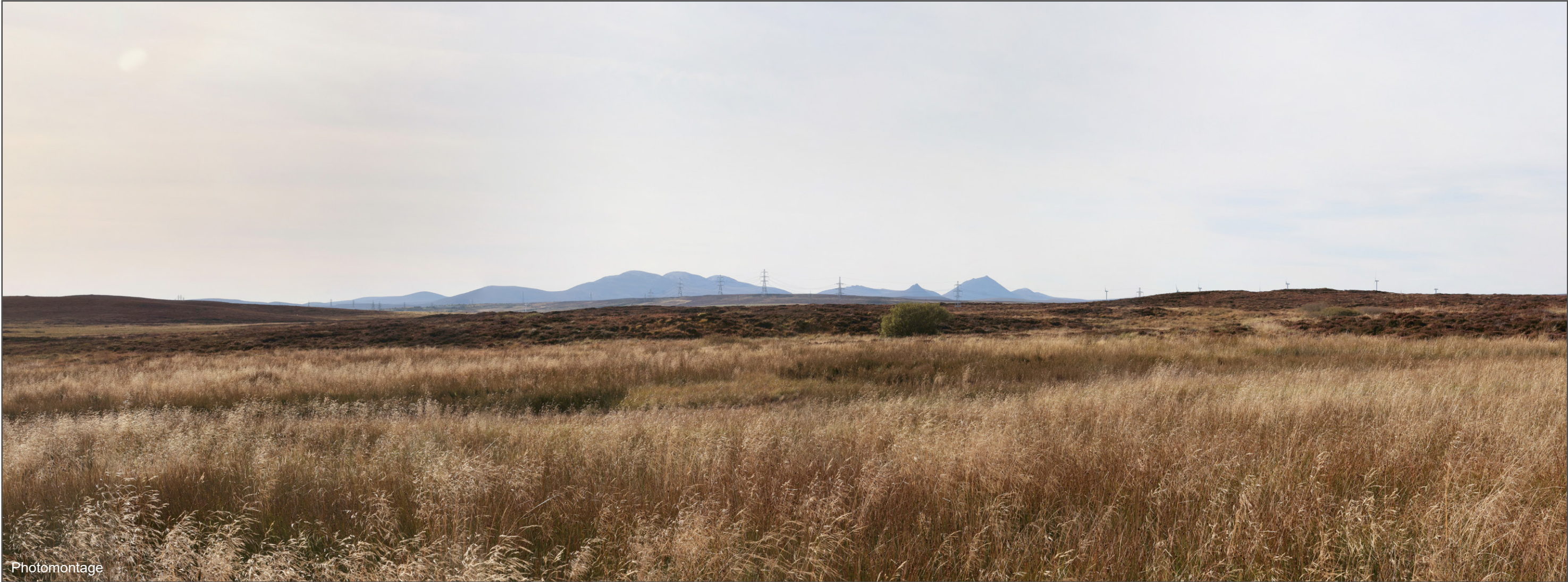
V4b Figure 7- 13b - Viewpoint 13: A9 (north east of Guidebest)

Distance to the development: 1600m Camera: Canon EOS R5 Focal Length: 50mm vertical (27°) x 28mm horizontal (65.5°) Camera height: 1.5m Date: 03/10/2024 14:00