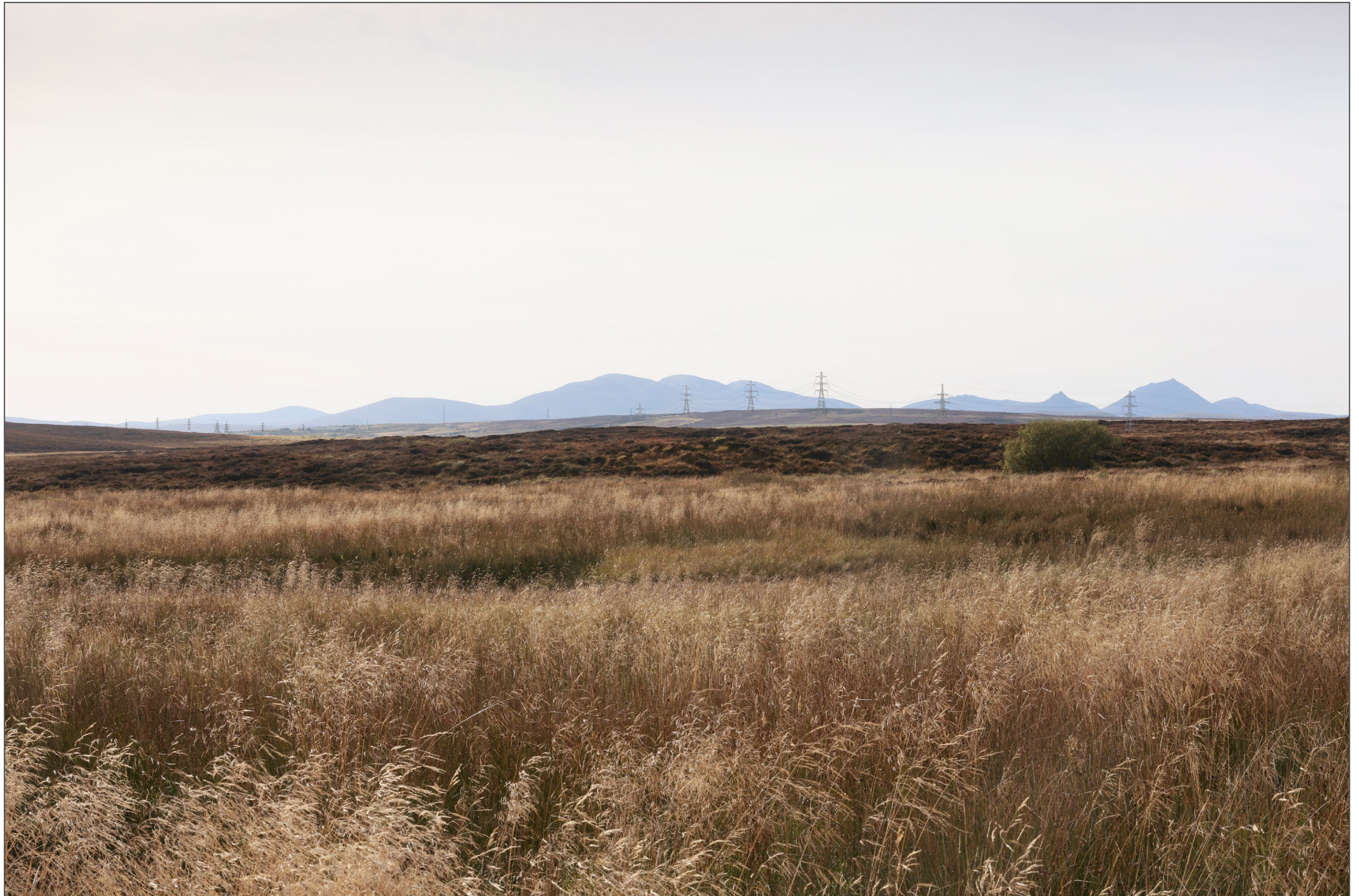
V4b Figure 7- 13b(i) - Viewpoint 13: A9 (north east of Guidebest)

This image should be viewed at a comfortable arms length (approx. 500mm)