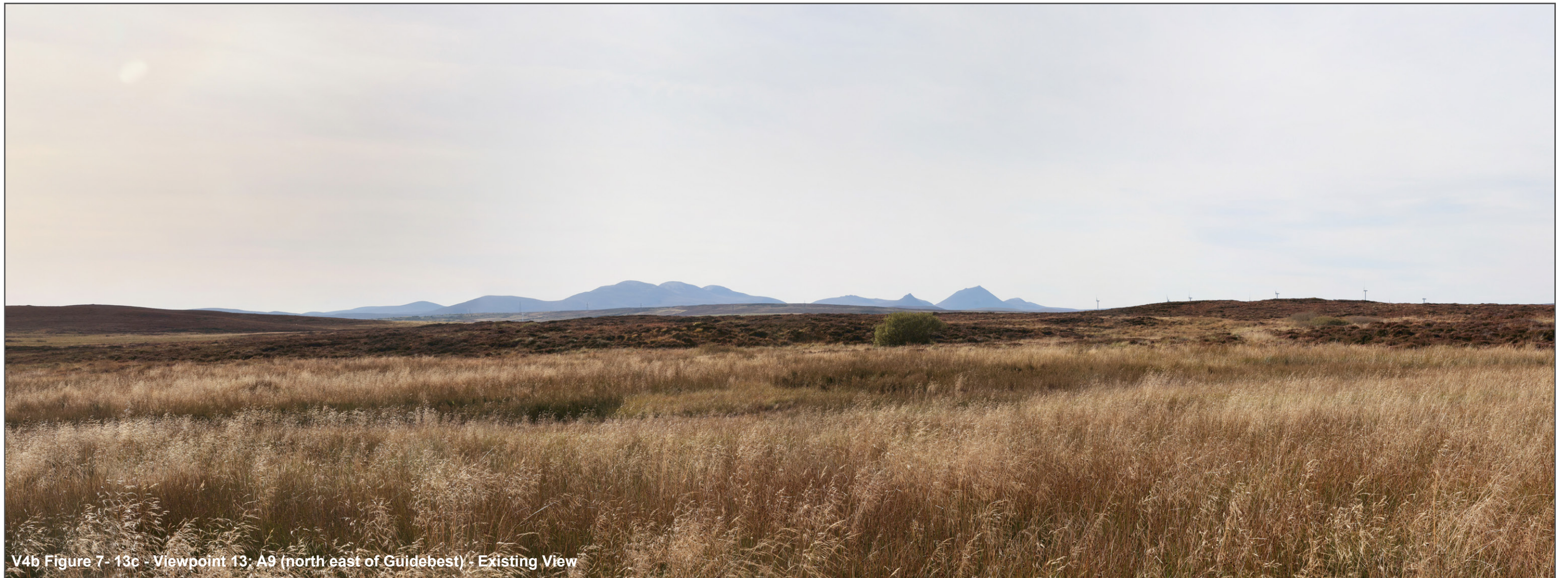
V4b Figure 7- 13c - Viewpoint 13: A9 (north east of Guidebest) - Existing View