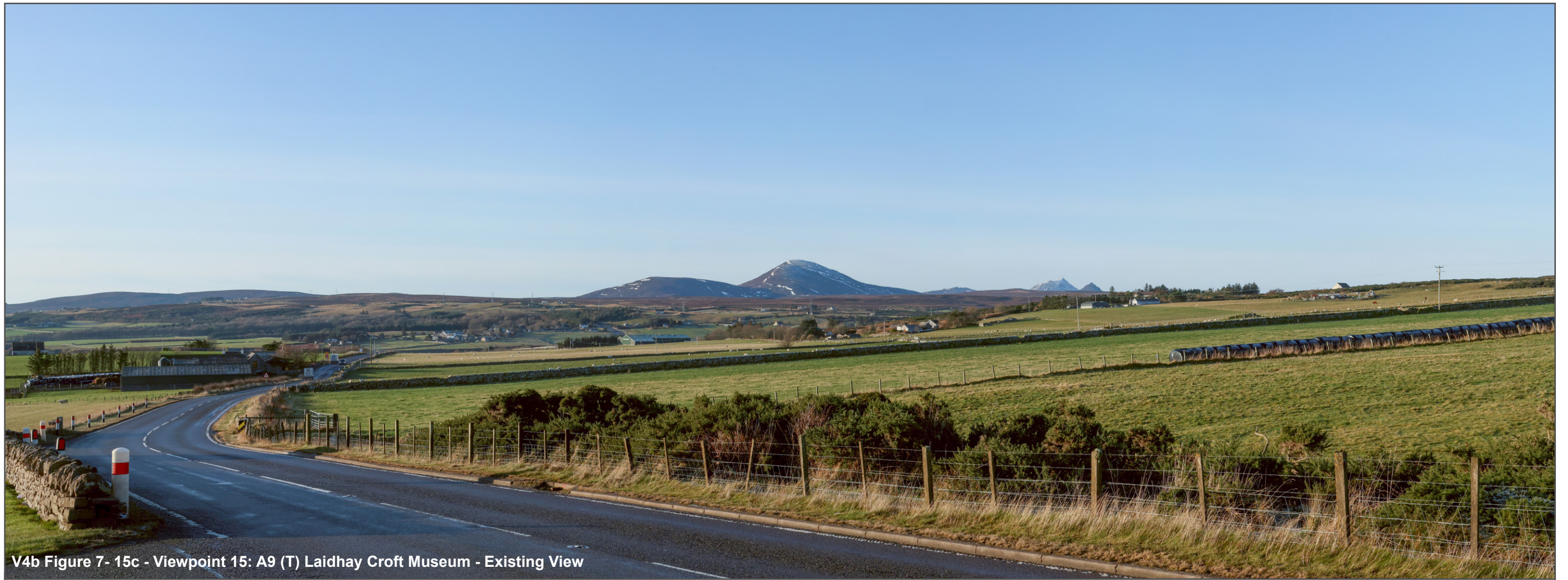
V4b Figure 7- 15c - Viewpoint 15: A9 (T) Laidhay Croft Museum - Existing View