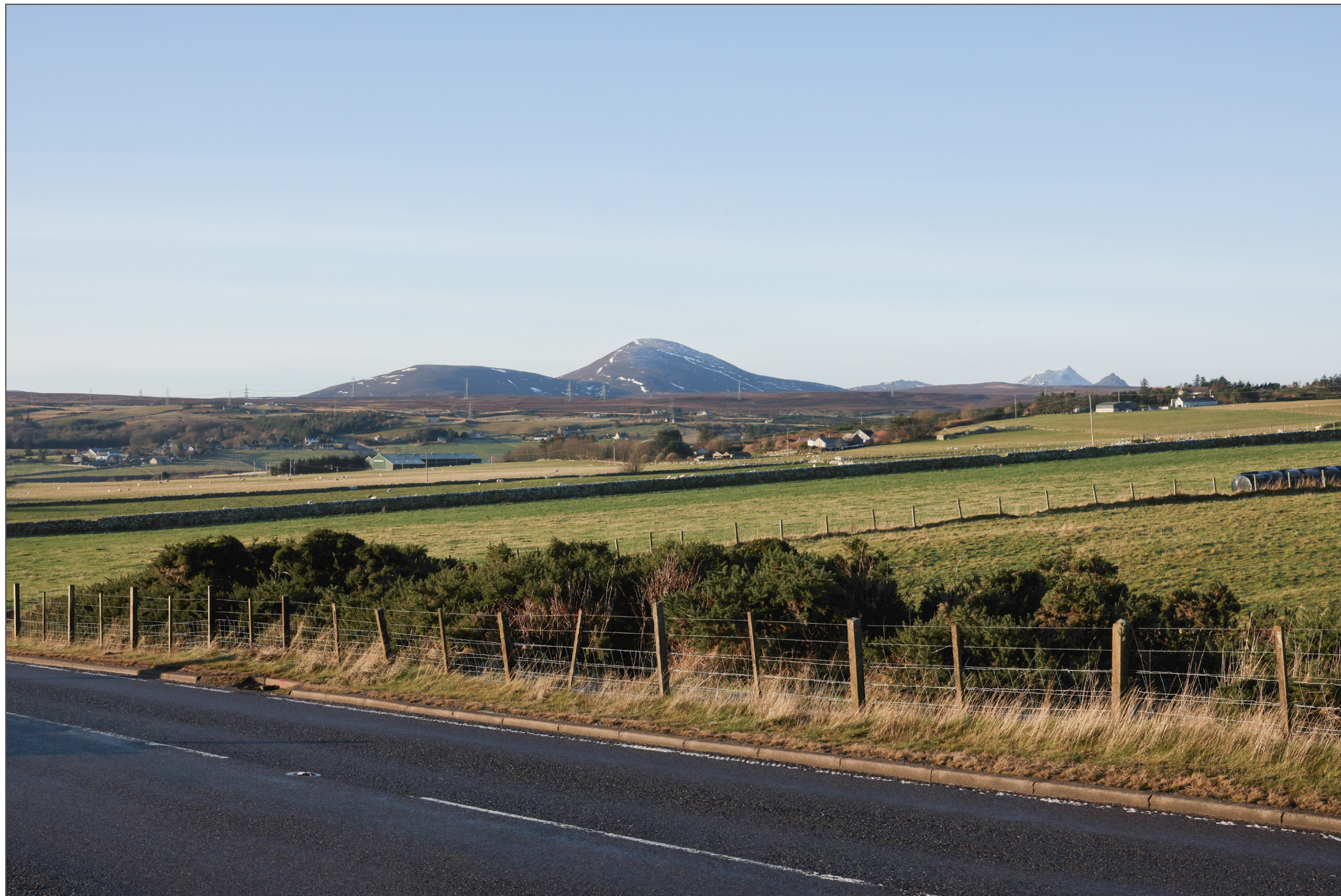
V4b Figure 7- 15b(i) -