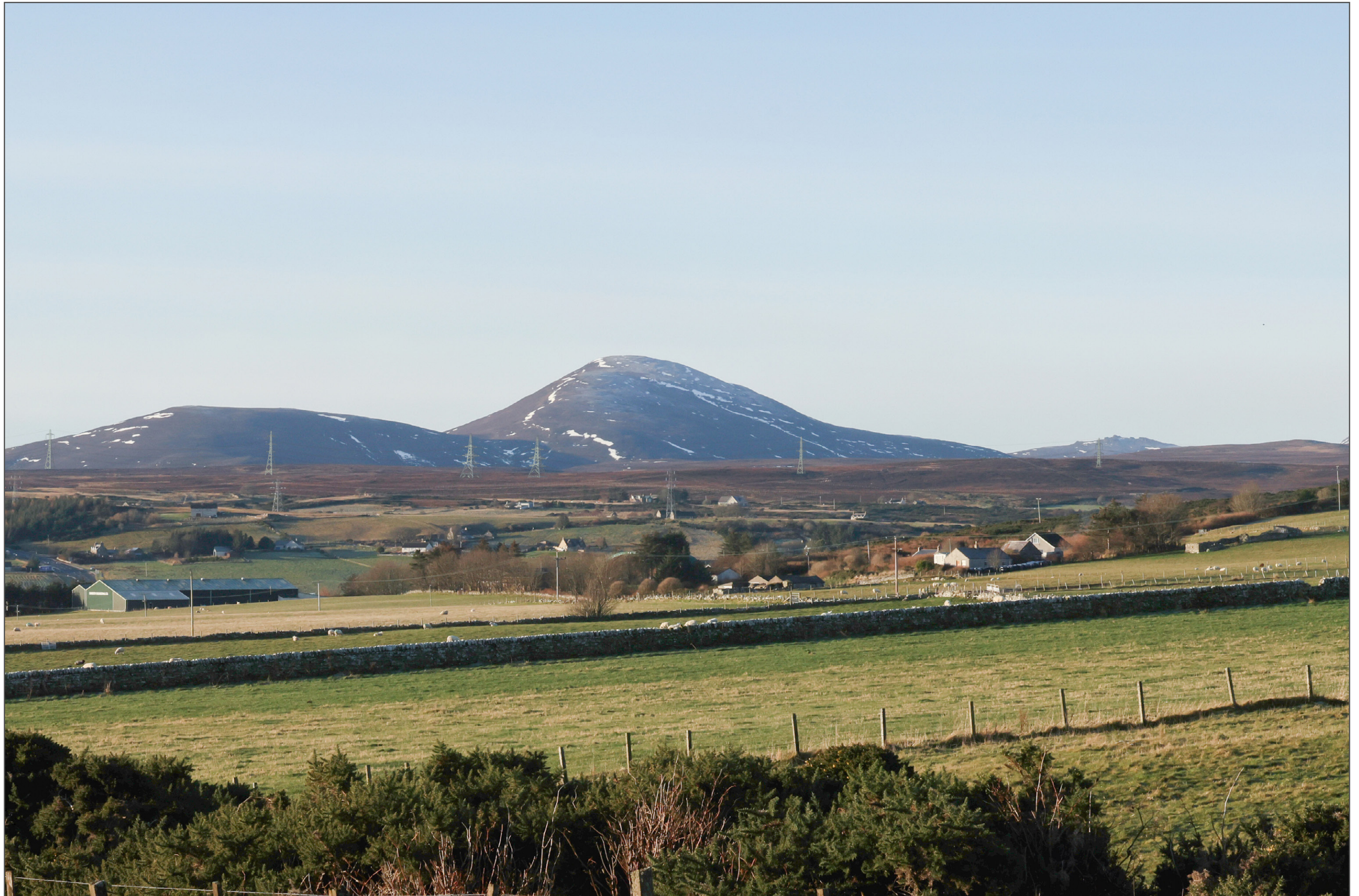
V4b Figure 7- 15b(ii) - Viewpoint 15: A9 (T) Laidhay Croft Museum

This image should be viewed at a comfortable arms length (approx. 500mm)