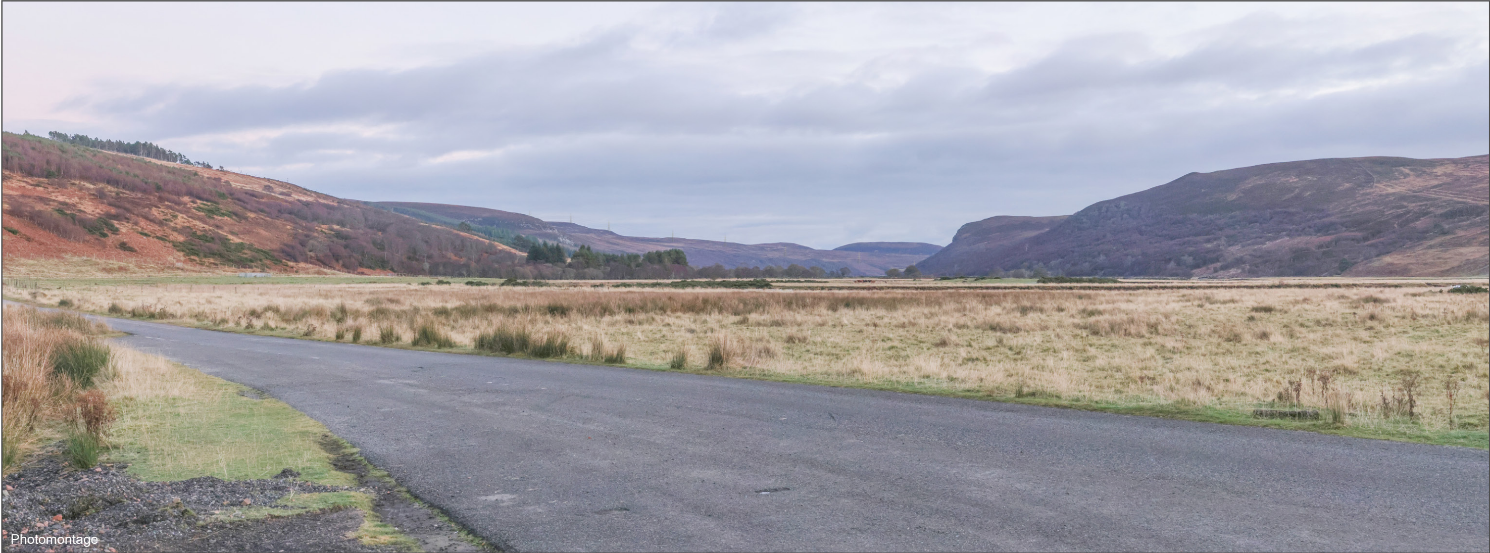
V4b Figure 7- 37b - Viewpoint 37: Balnacoil

Distance to the development: 4150m Camera: Canon EOS R5 Focal Length: 50mm vertical (27°) x 28mm horizontal (65.5°) Camera height: 1.5m Date: 27/11/2024 15:45