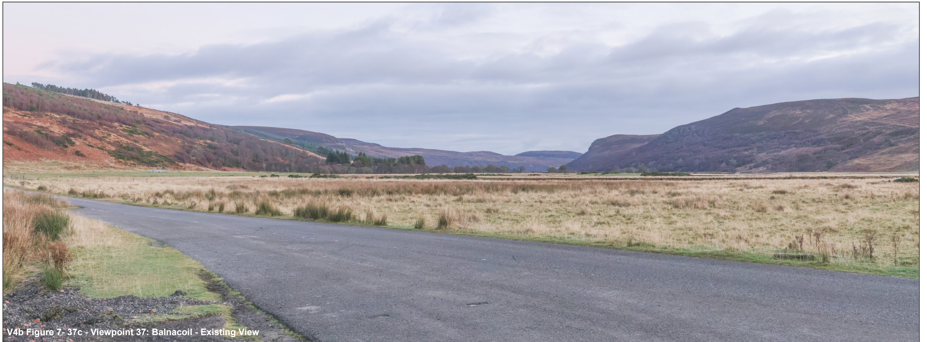
V4b Figure 7- 37c - Viewpoint 37: Balnacoll - Existing View