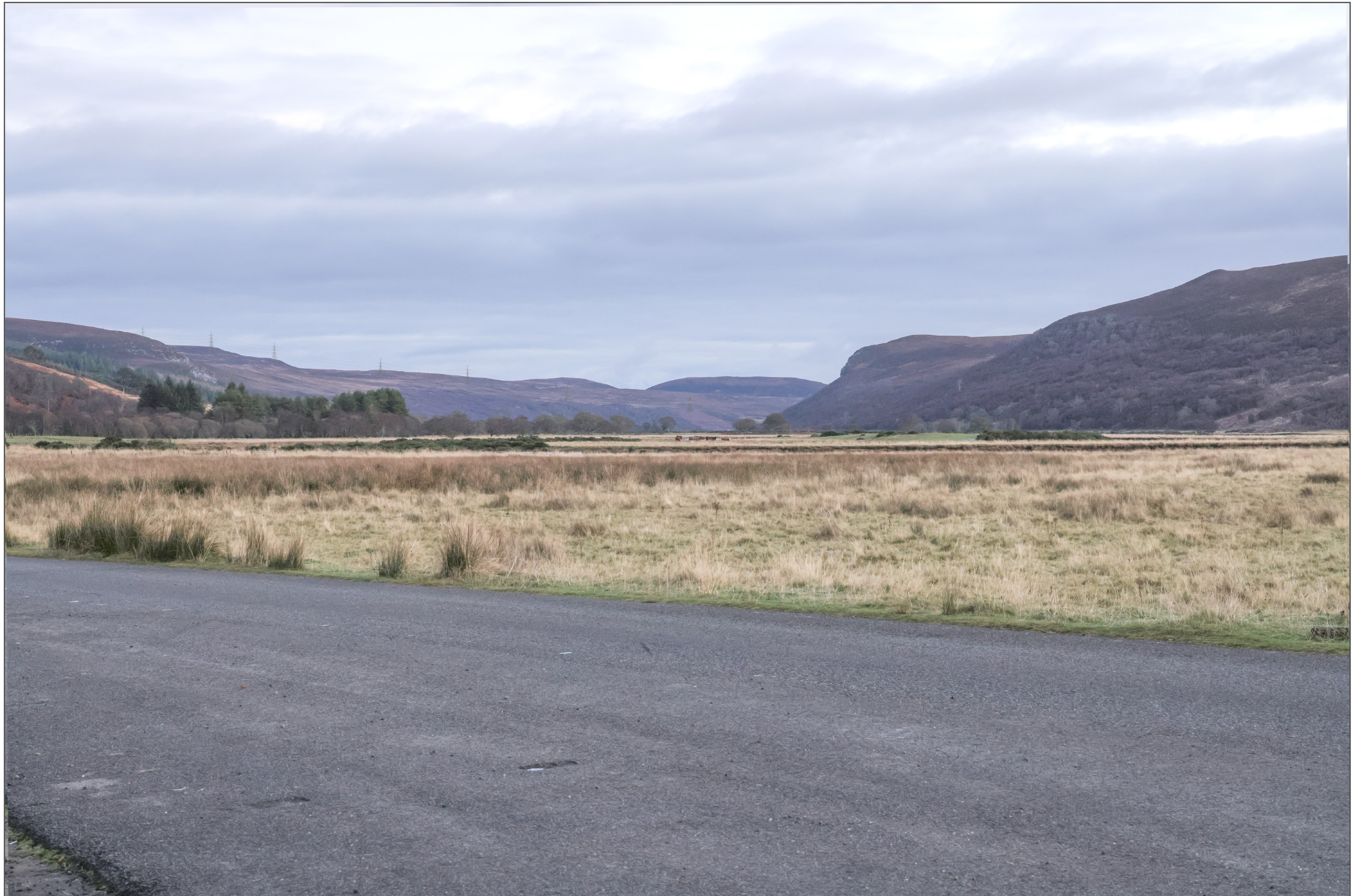
V4b Figure 7- 37b(i) - Viewpoint 37: Balnacoil