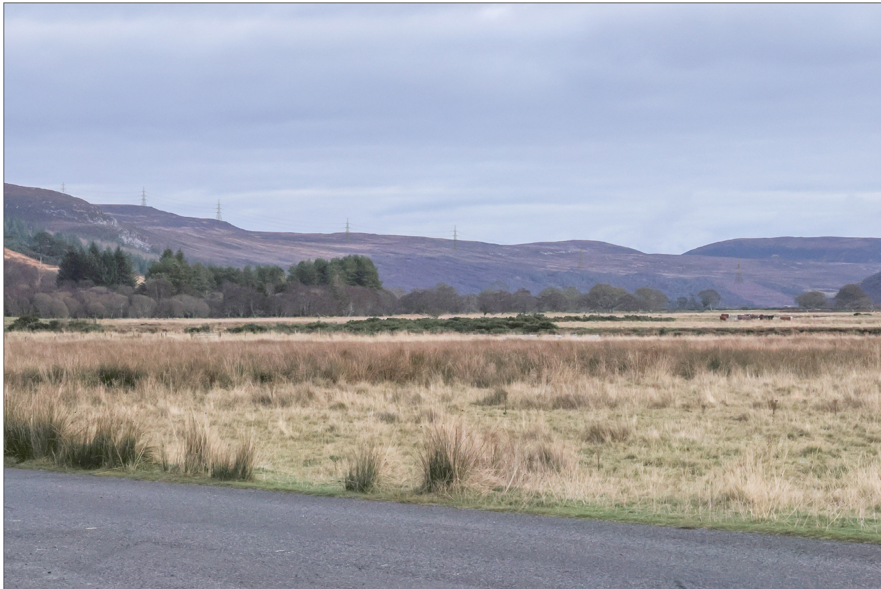
V4b Figure 7- 37b(ii) - Viewpoint 37: Balnacoll