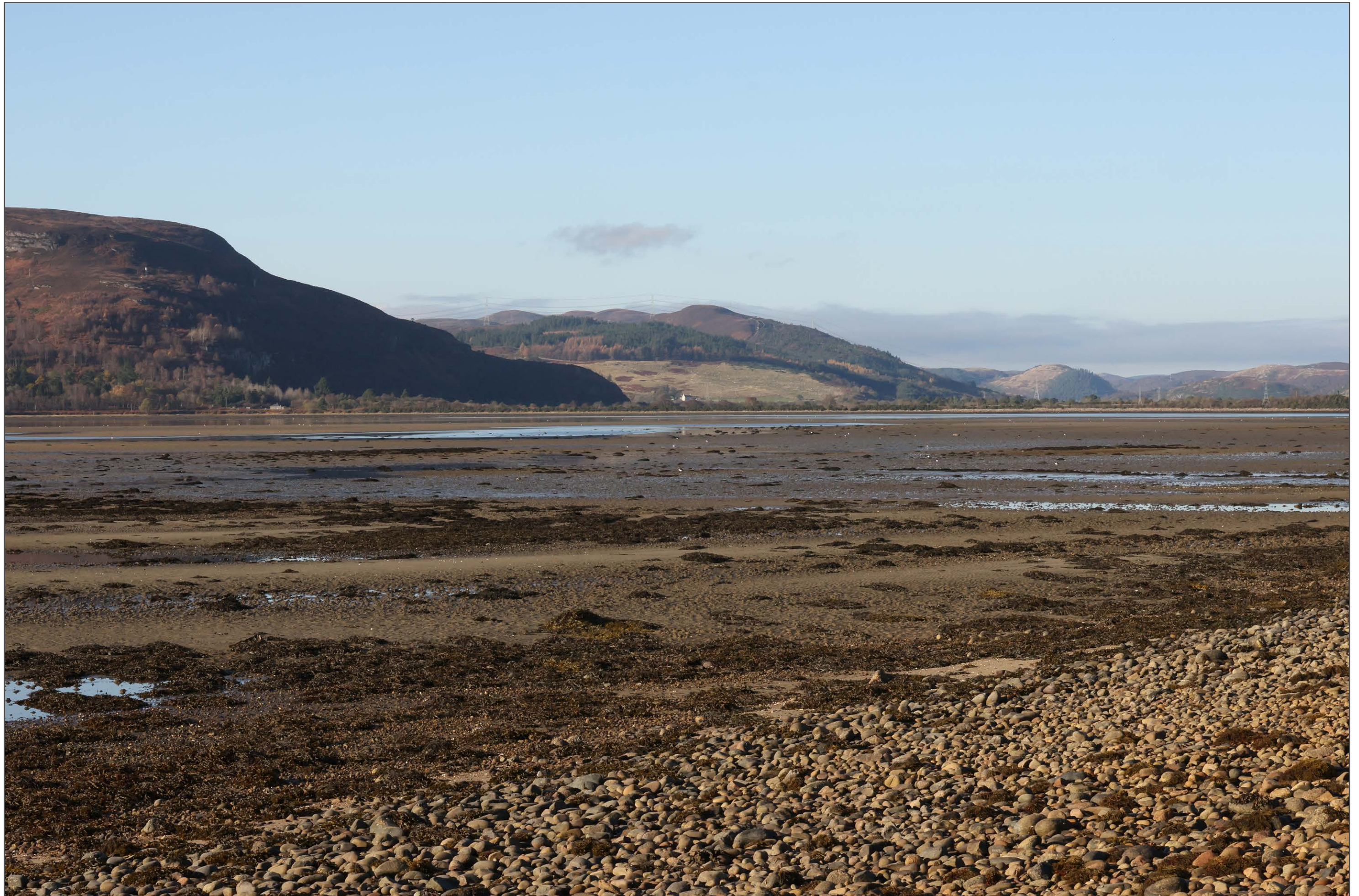
V4b Figure 7-44b(ii) Viewpoint 44: Loch Fleet

Distance to development: 6270m Camera: Canon EOS R5 Focal Length: 75mm Camera height: 1.5m Date: 08/11/2024 12:30