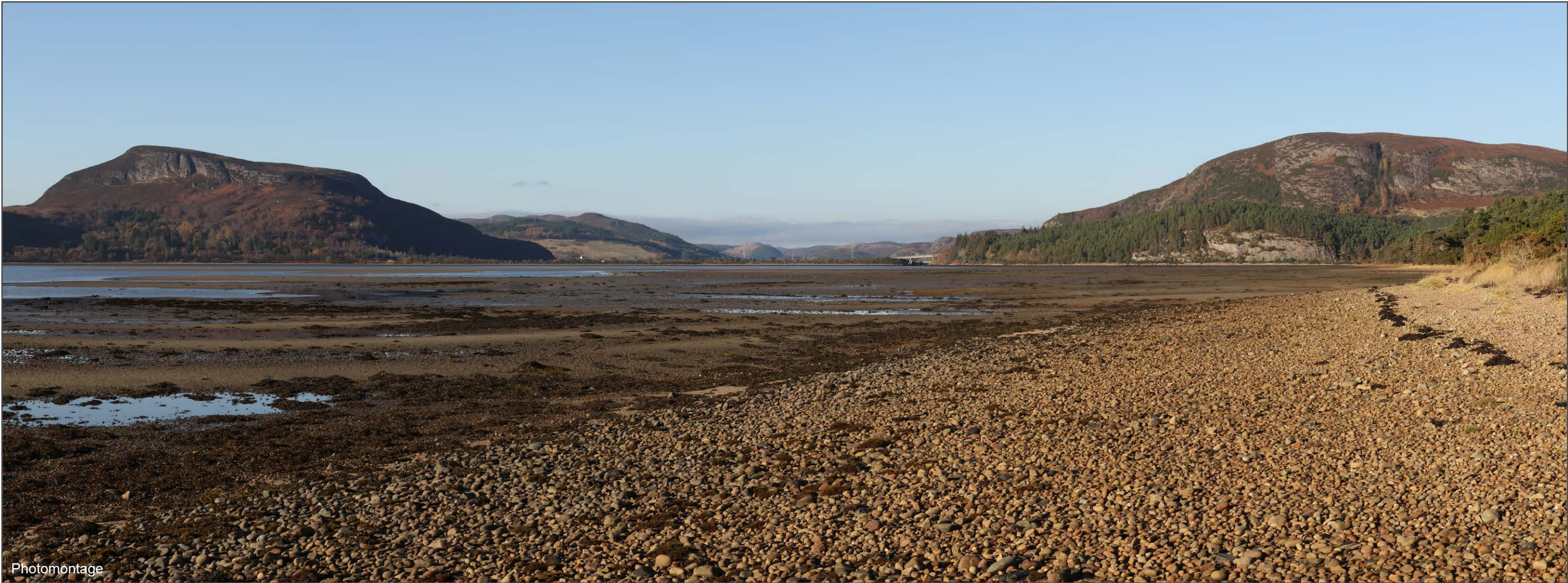
V4b Figure 7-44b Viewpoint 44: Loch Fleet

Distance to development: 6270m Camera: Canon EOS R5 Focal Length: 50mm vertical (27°) x 28mm horizontal (65.5°) Camera height: 1.5m Date: 08/11/2024 12:30