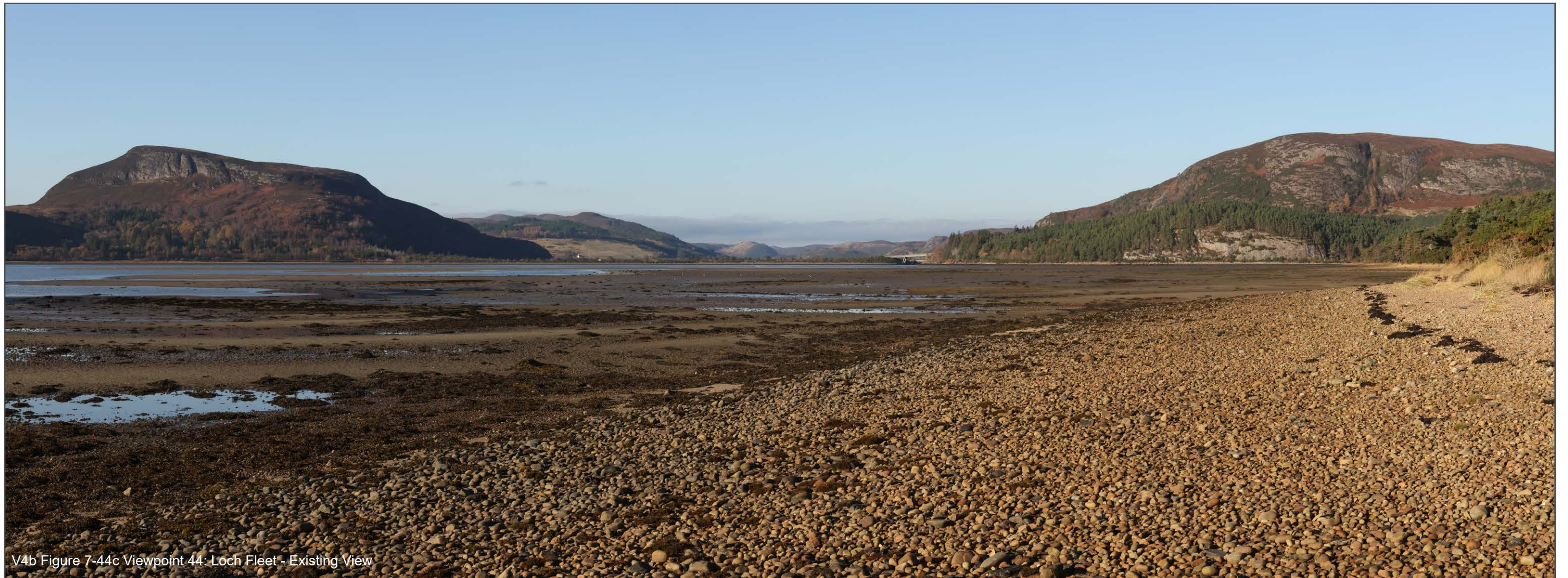
V4b Figure 7-44c Viewpoint 44: Loch Fleet - Existing View