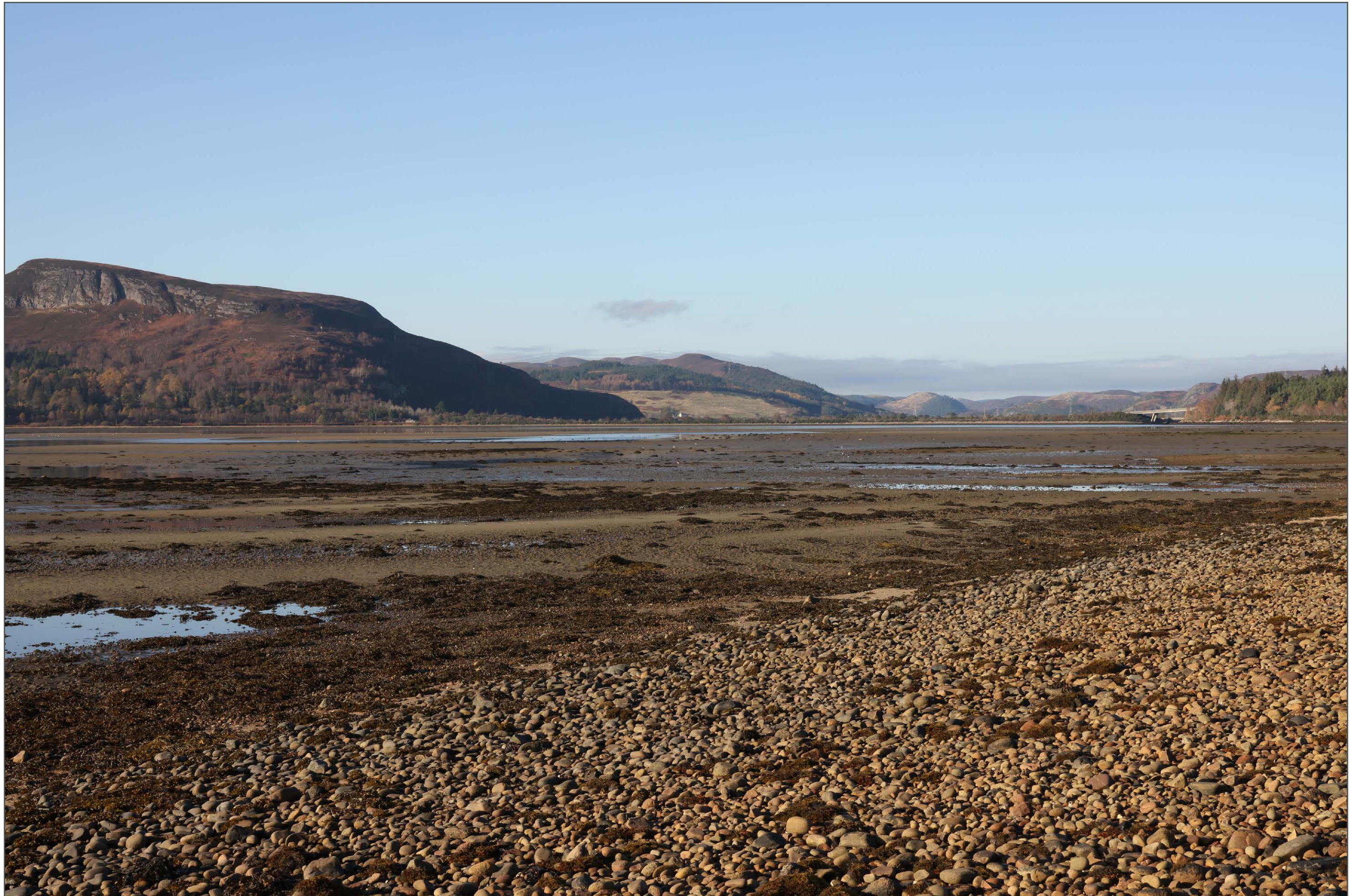
V4b Figure 7-44b(i) Viewpoint 44: Loch Fleet

Distance to development: 6270m Camera: Canon EOS R5 Focal Length: 50mm Camera height: 1.5m Date: 08/11/2024 12:30