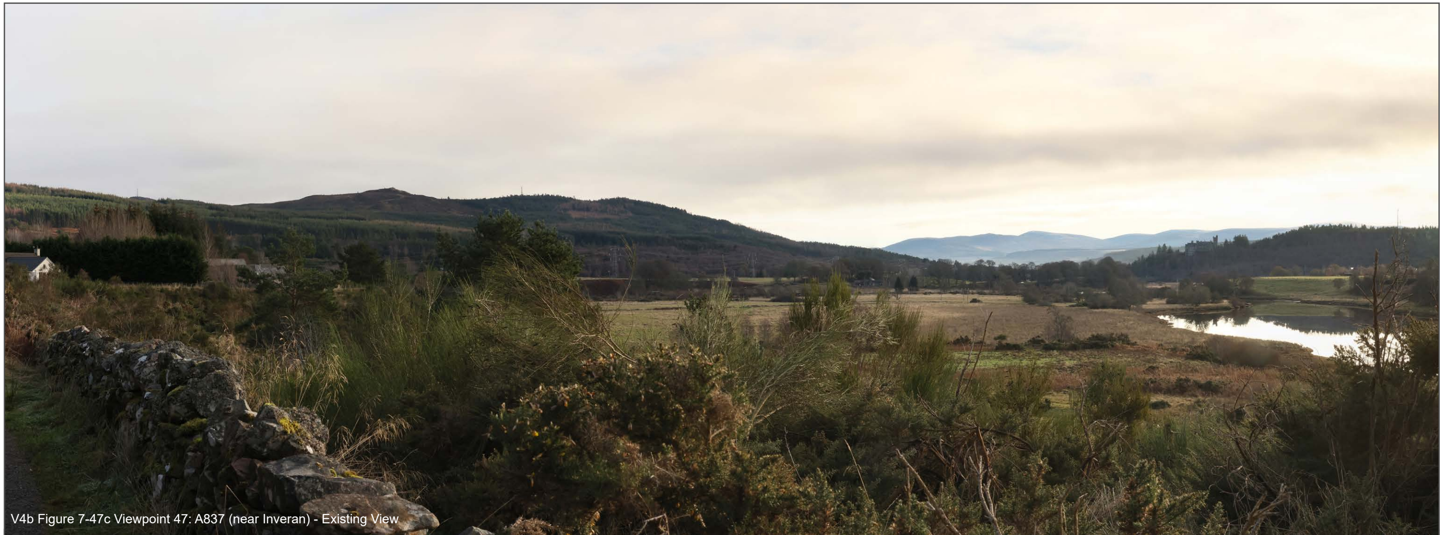
V4b Figure 7-47c Viewpoint 47: A837 (near Inveran) - Existing View