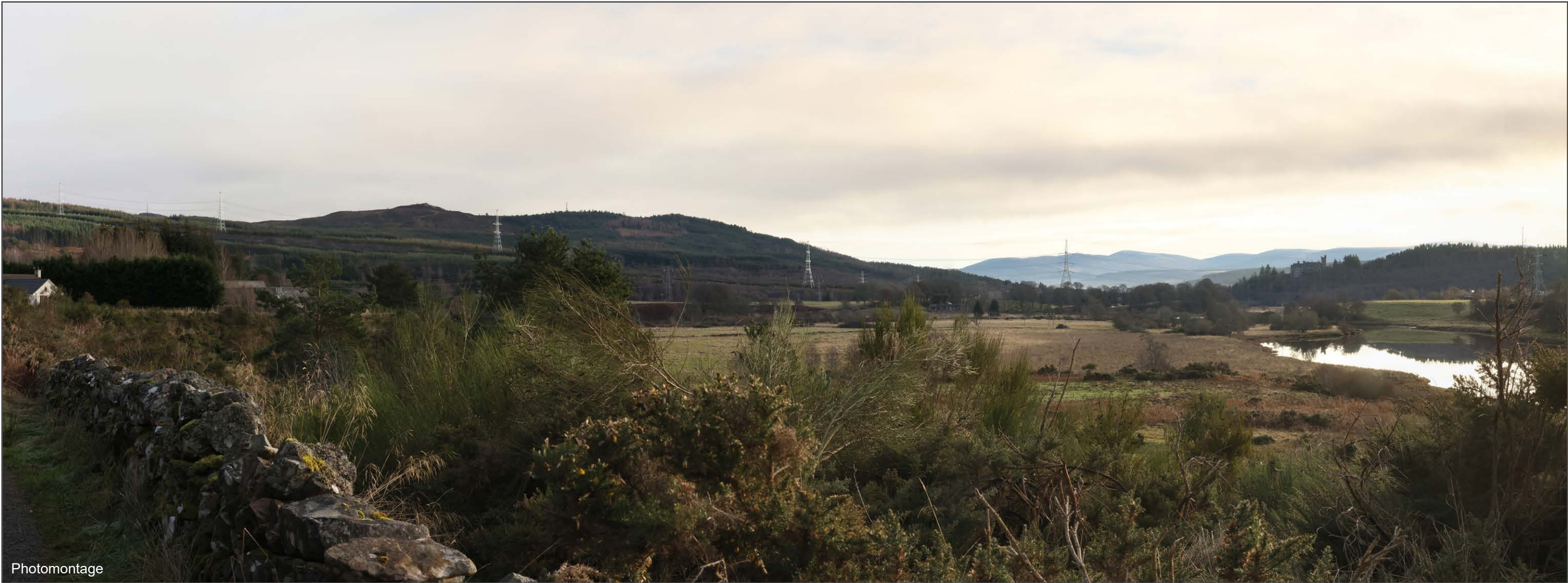
V4b Figure 7-47b Viewpoint 47: A837 (near Inveran) Distance to development: 1511m Camera: Canon EOS R5 Focal Length: 50mm vertical (27°) x 28mm horizontal (65.5°) Camera height: 1.5m Date: 10/12/2024 12:30

The images contained on this page and the following page are not representative of scale and distance from the actual viewpoint and show the development in its wider landscape context only.