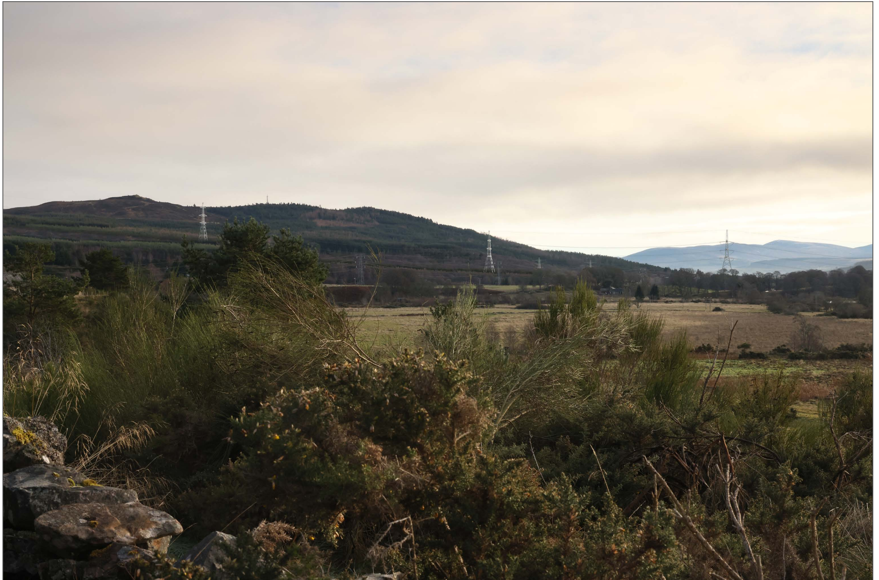
V4b Figure 7-47b(i) Viewpoint 47: A837 (near Inveran)

Distance to development: 1511m Camera: Canon EOS R5 Focal Length: 50mm Camera height: 1.5m Date: 10/12/2024 12:30