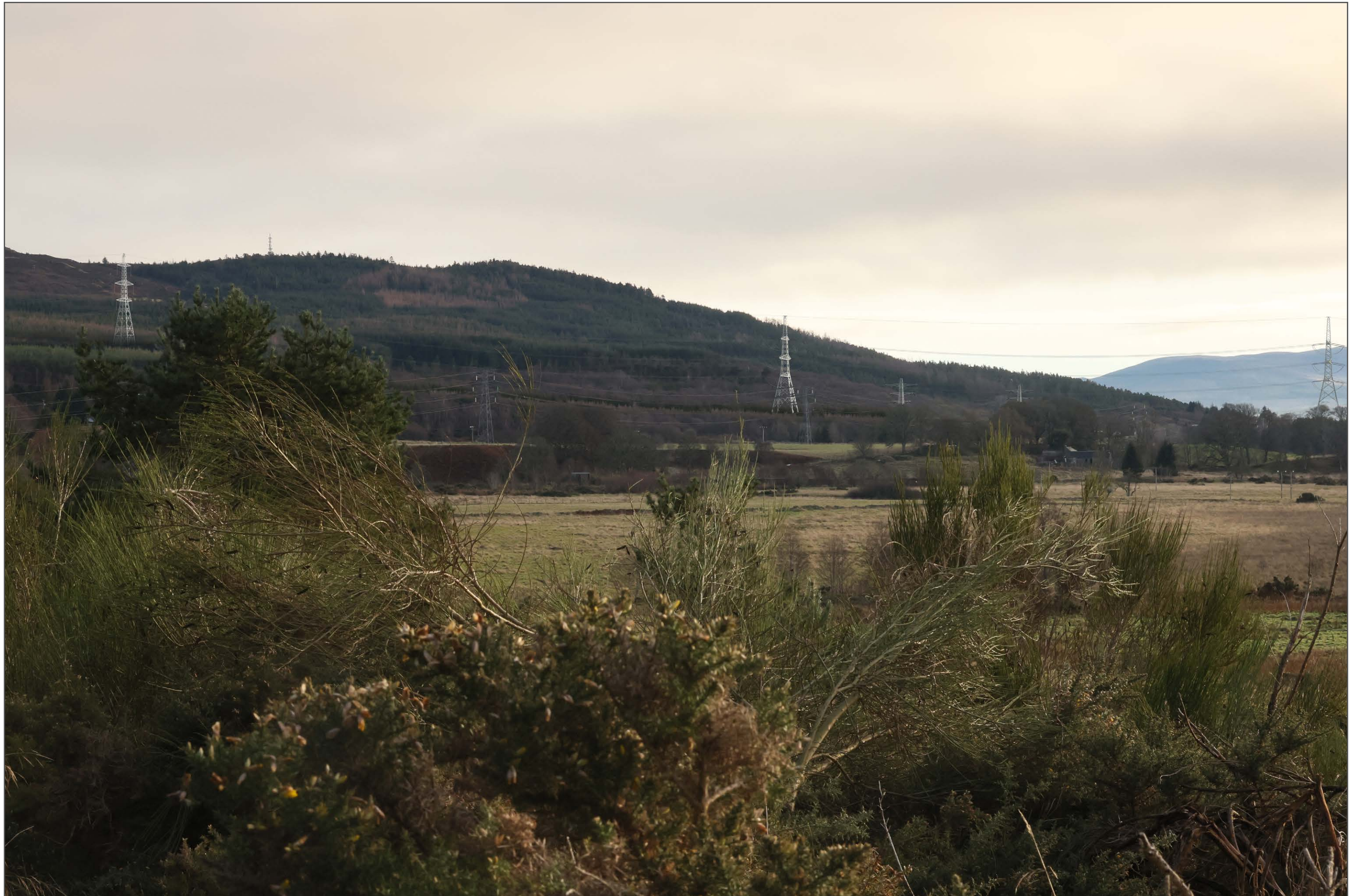
V4b Figure 7-47b(ii) Viewpoint 47: A837 (near Inveran)

Distance to development: 1511m Camera: Canon EOS R5 Focal Length: 75mm Camera height: 1.5m Date: 10/12/2024 12:30