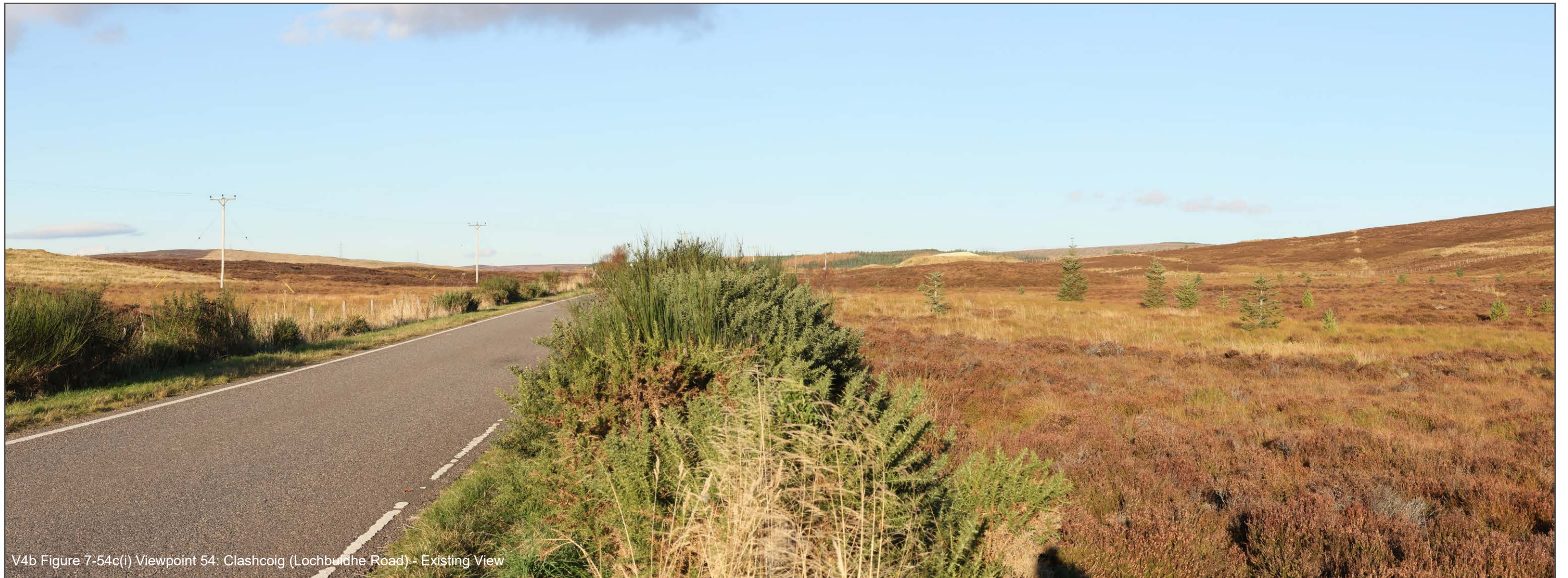
V4b Figure 7-54c(i) Viewpoint 54: Clashcoig (Lochbuidhe Road) - Existing View