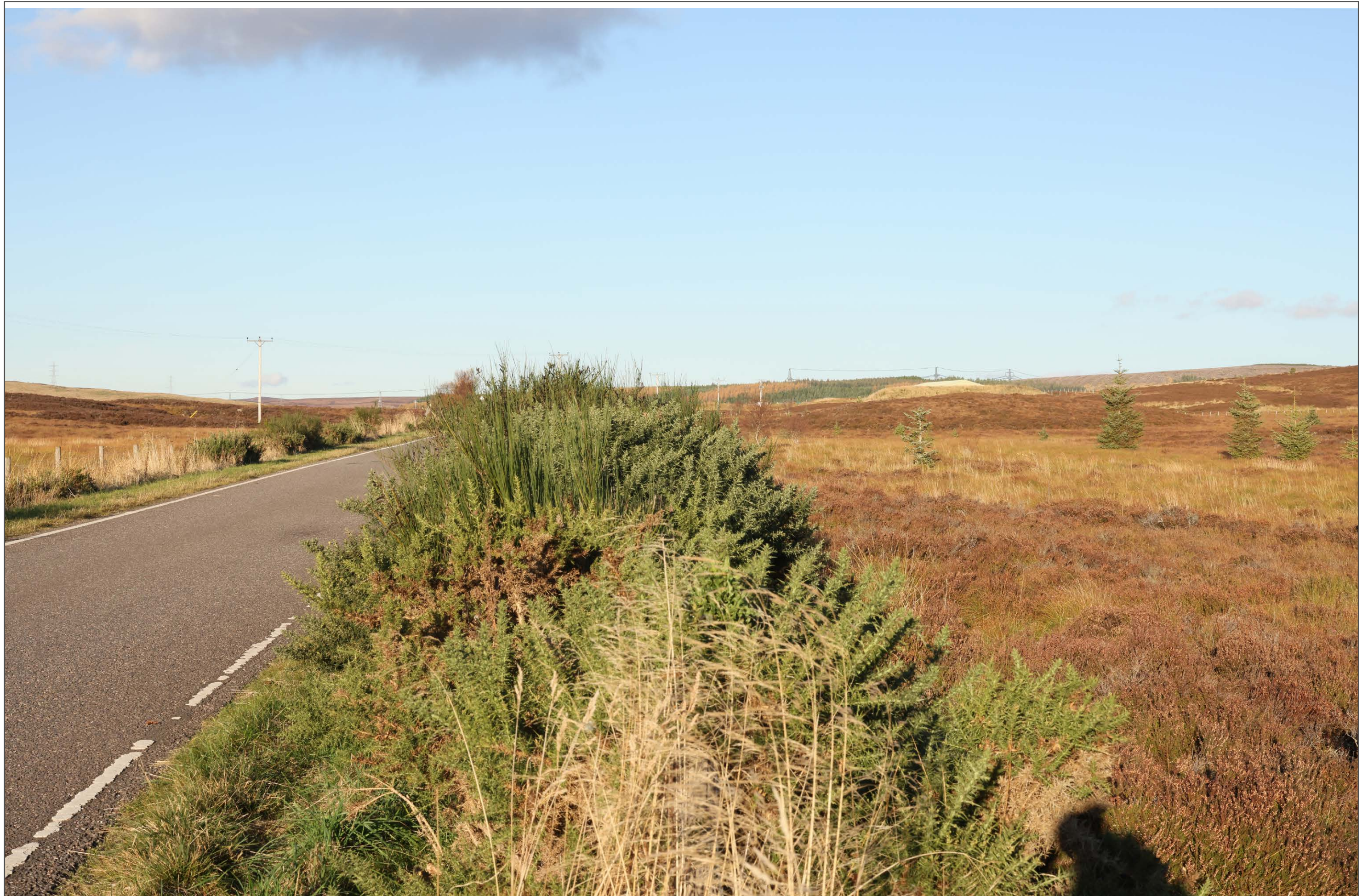
V4b Figure 7-54b(i) Viewpoint 54: Clashcoig (Lochbuidhe Road)

Distance to development: 3316m Camera: Canon EOS R5 Focal Length: 50mm Camera height: 1.5m Date: 07/11/2024 14:00