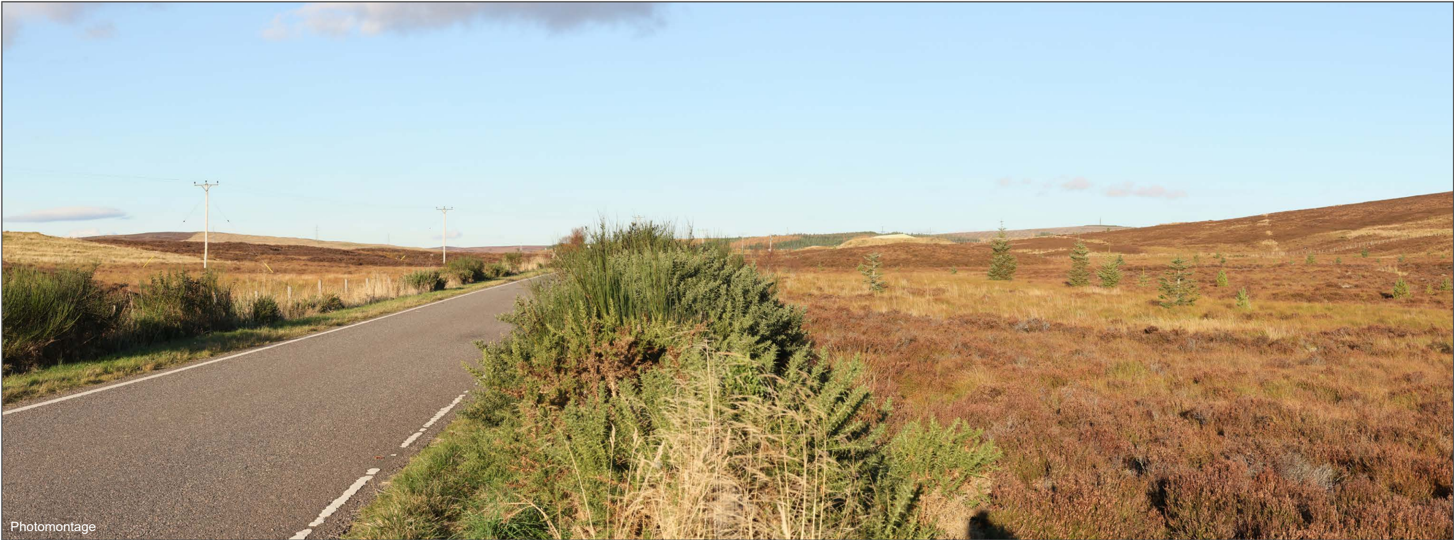
V4b Figure 7-54b(iii) Viewpoint 54: Clashcoig (Lochbuidhe Road)

Distance to development: 3316m Camera: Canon EOS R5 Focal Length: 50mm vertical (27°) x 28mm horizontal (65.5°) Camera height: 1.5m Date: 07/11/2024 14:00