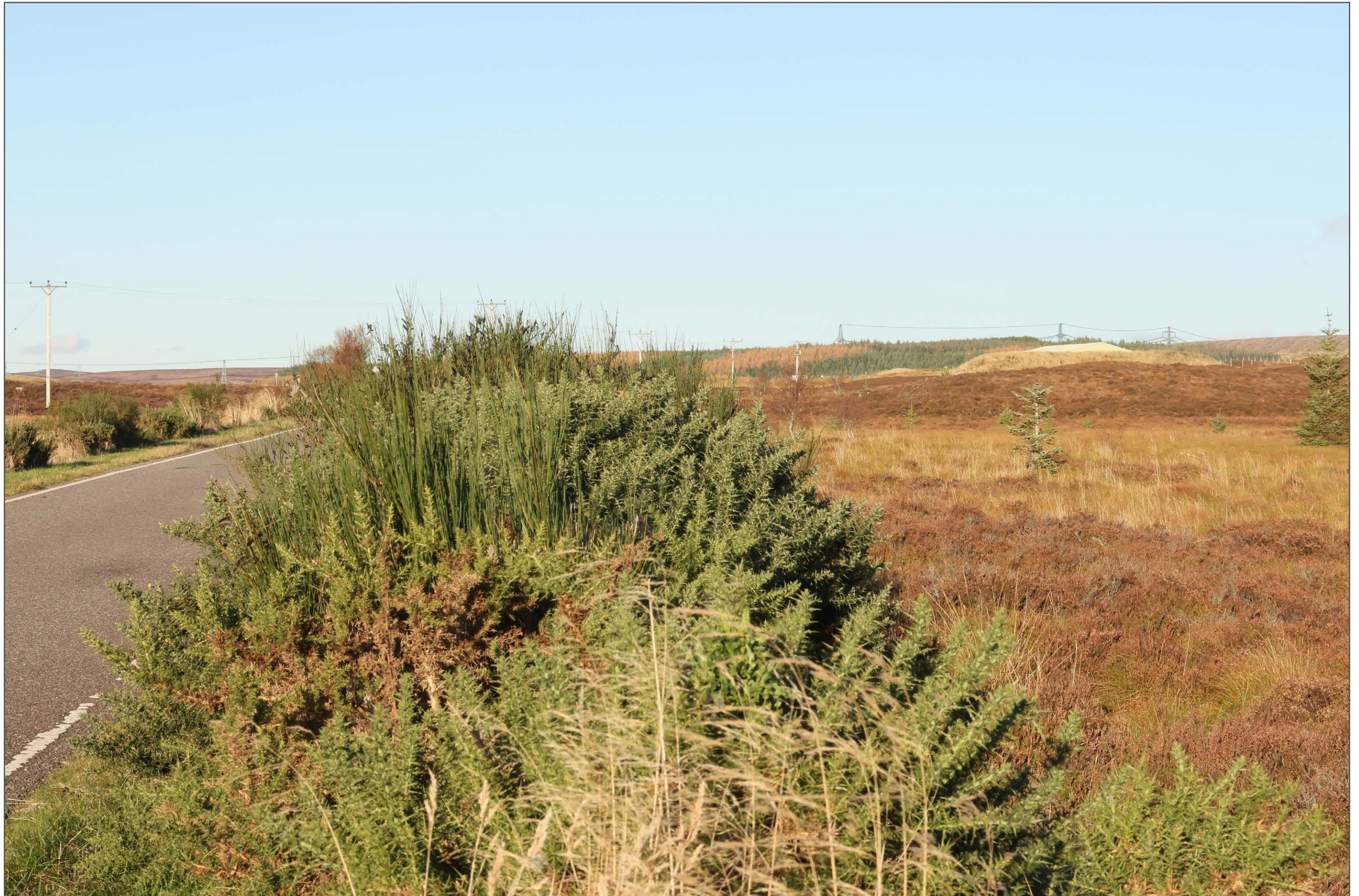
V4b Figure 7-54b(ii) Viewpoint 54: Clashcoig (Lochbuidhe Road)

Distance to development: 3316m Camera: Canon EOS R5 Focal Length: 75mm Camera height: 1.5m Date: 07/11/2024 14:00