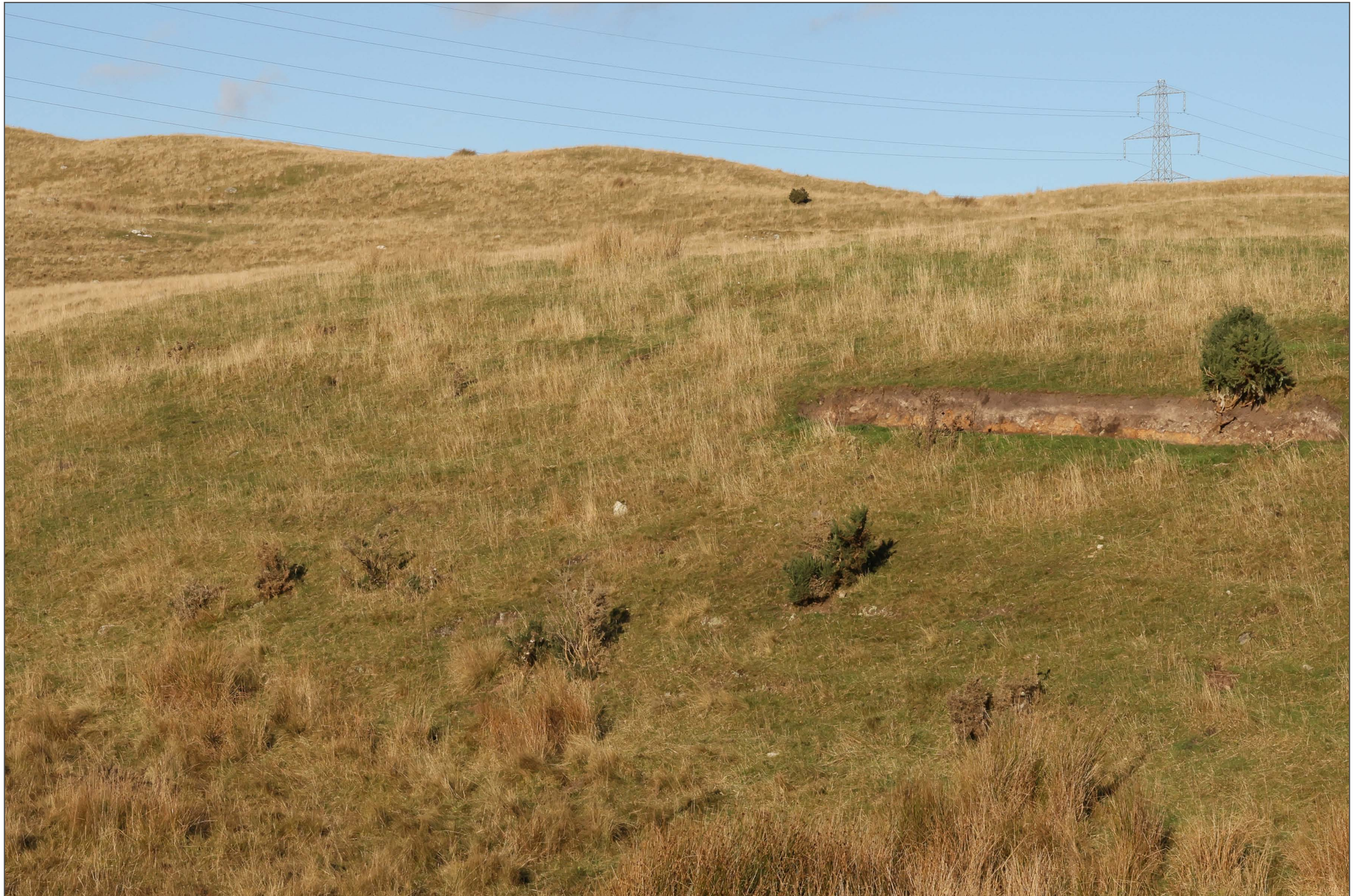
V4b Figure 7-55b(ii) Viewpoint 55: Airdens

Distance to development: 4085m Camera: Canon EOS R5 Focal Length: 75mm Camera height: 1.5m Date: 07/11/2024 12:45