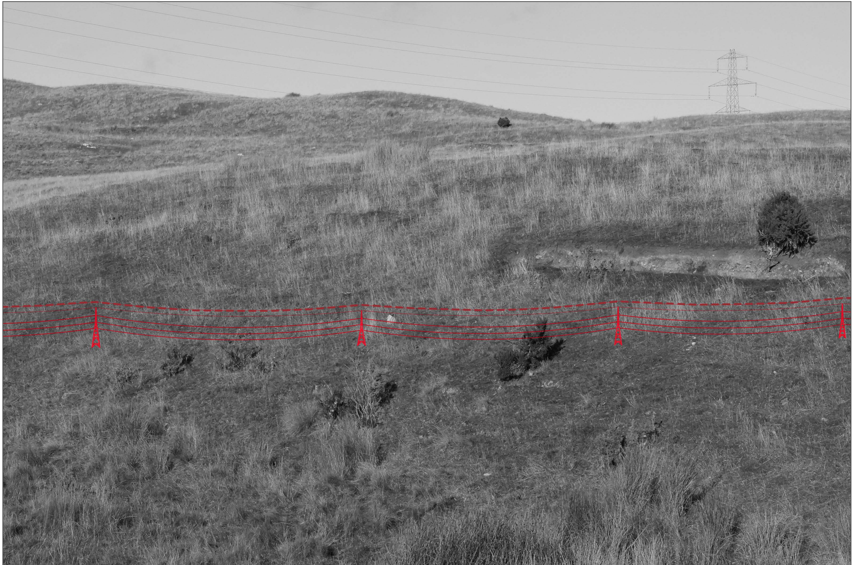
V4b Figure 7-55c(ii) Viewpoint 55: Airdens

Distance to development: 4085m Camera: Canon EOS R5 Focal Length: 75mm Camera height: 1.5m Date: 07/11/2024 12:45