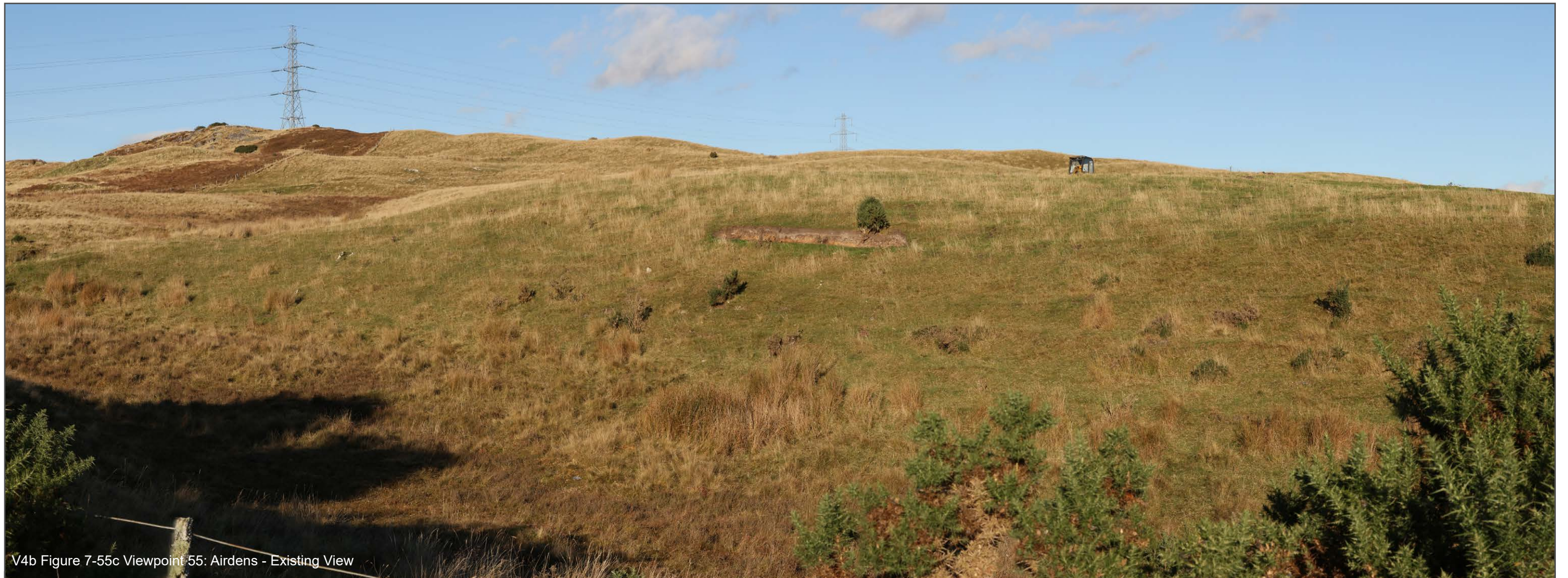
V4b Figure 7-55c Viewpoint 55: Airdens - Existing View