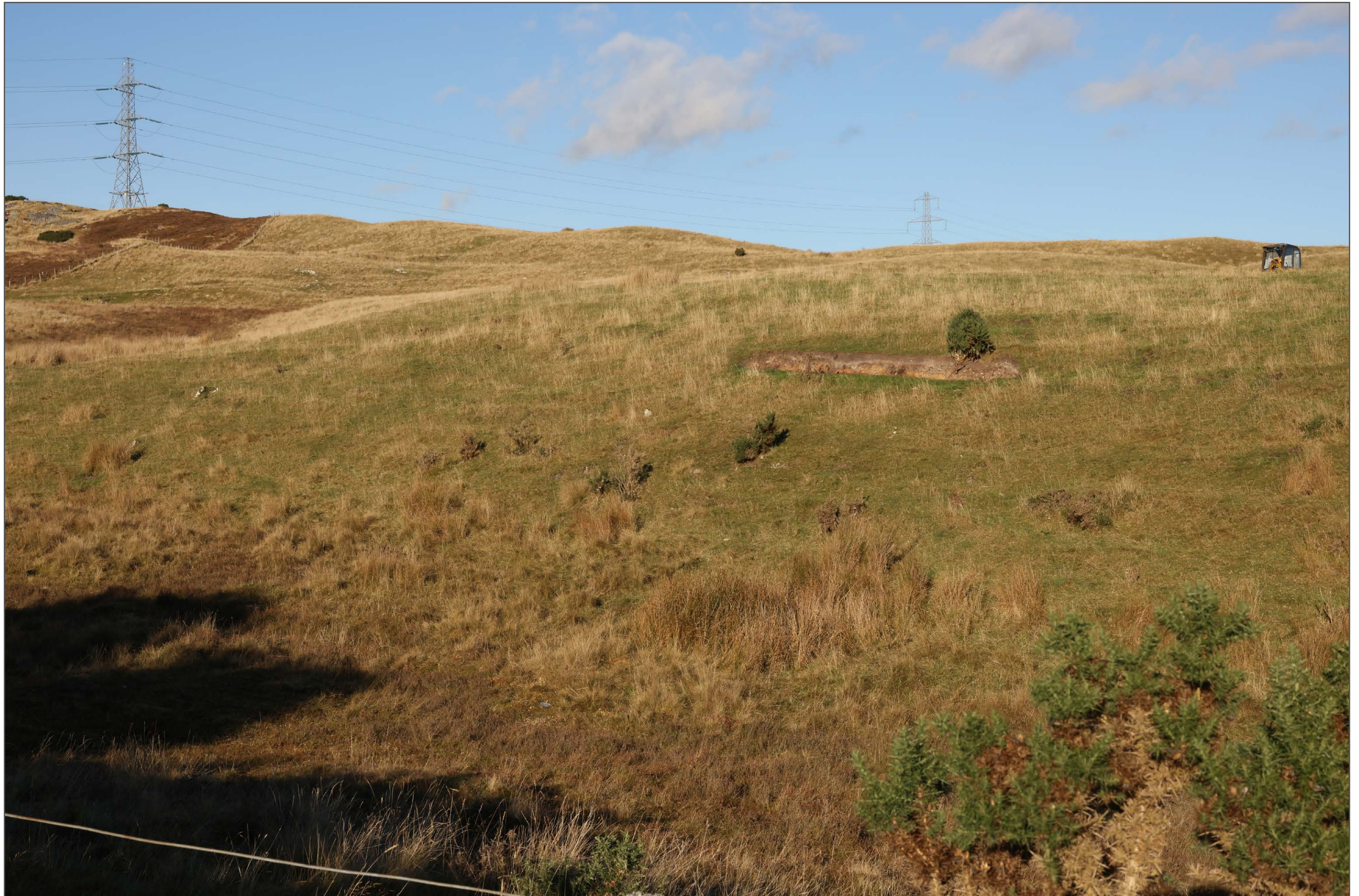
V4b Figure 7-55b(i) Viewpoint 55: Airdens

Distance to development: 4085m Camera: Canon EOS R5 Focal Length: 50mm Camera height: 1.5m Date: 07/11/2024 12:45