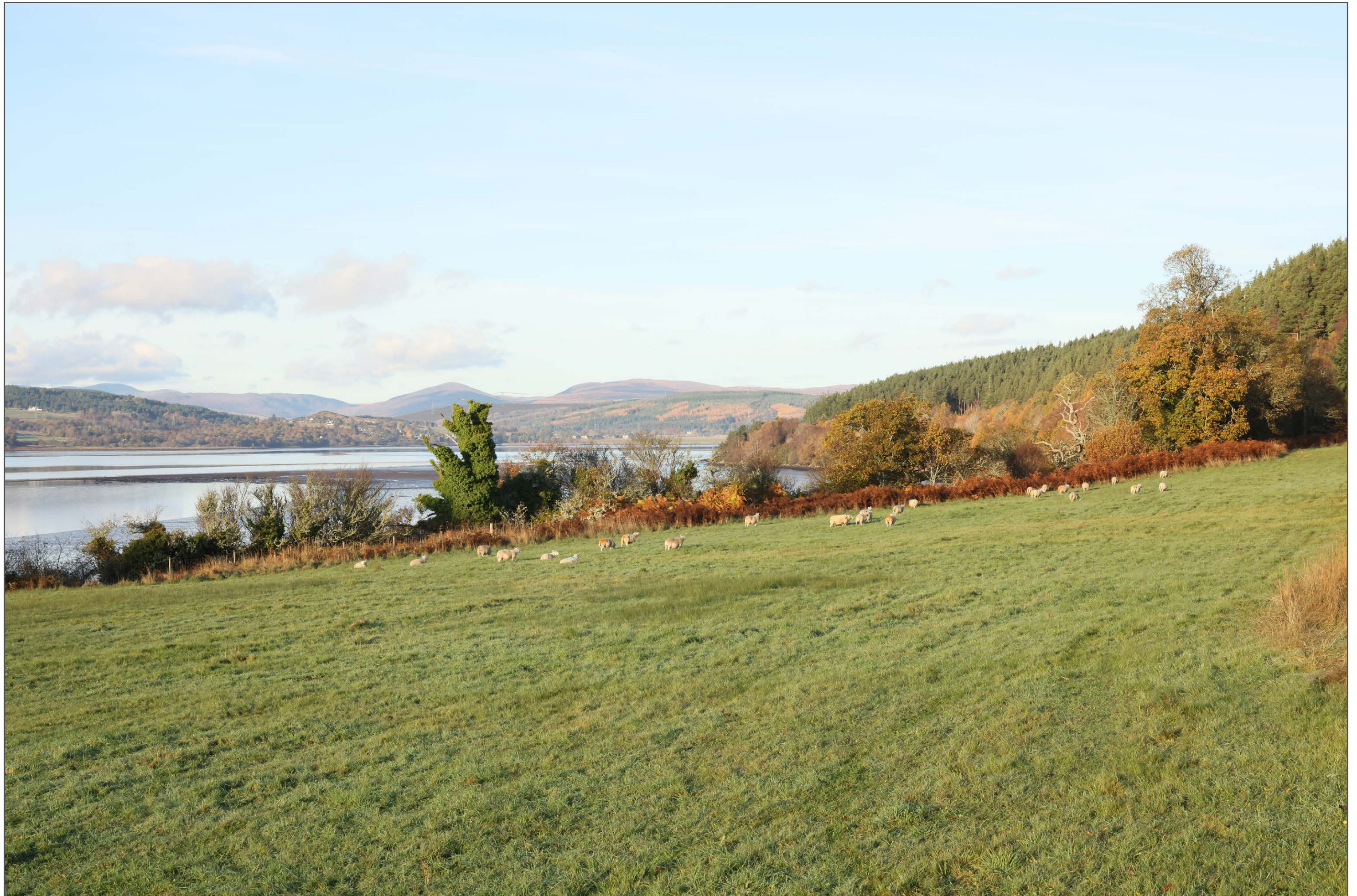
V4b Figure 7-58b(i) Viewpoint 58: A949 Little Creich

Distance to development: 8700m Camera: Canon EOS R5 Focal Length: 50mm Camera height: 1.5m Date: 07/11/2024 09:30