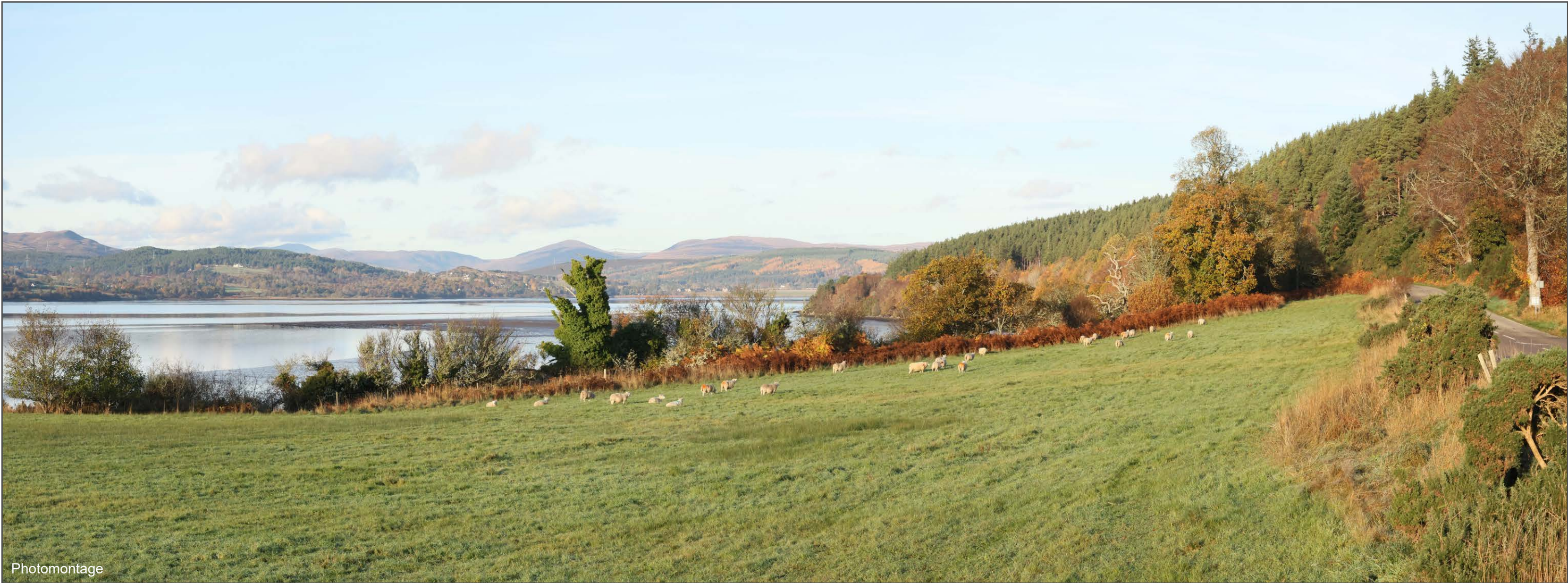
V4b Figure 7-58b Viewpoint 58: A949 Little Creich

Distance to development: 8700m Camera: Canon EOS R5 Focal Length: 50mm vertical (27°) x 28mm horizontal (65.5°) Camera height: 1.5m Date: 07/11/2024 09:30