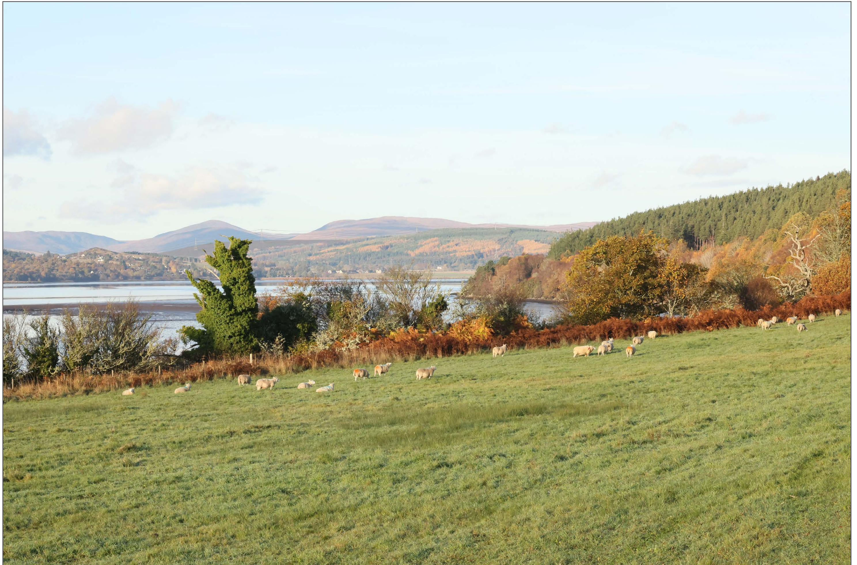
V4b Figure 7-58b(ii) Viewpoint 58: A949 Little Creich

Distance to development: 8700m Camera: Canon EOS R5 Focal Length: 75mm Camera height: 1.5m Date: 07/11/2024 09:30