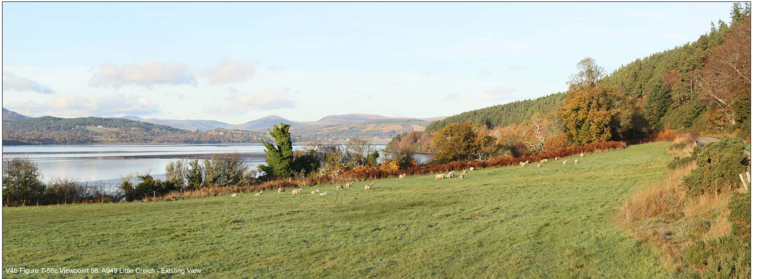
V4b Figure 7-58c Viewpoint 58: A949 Little Creich - Existing View