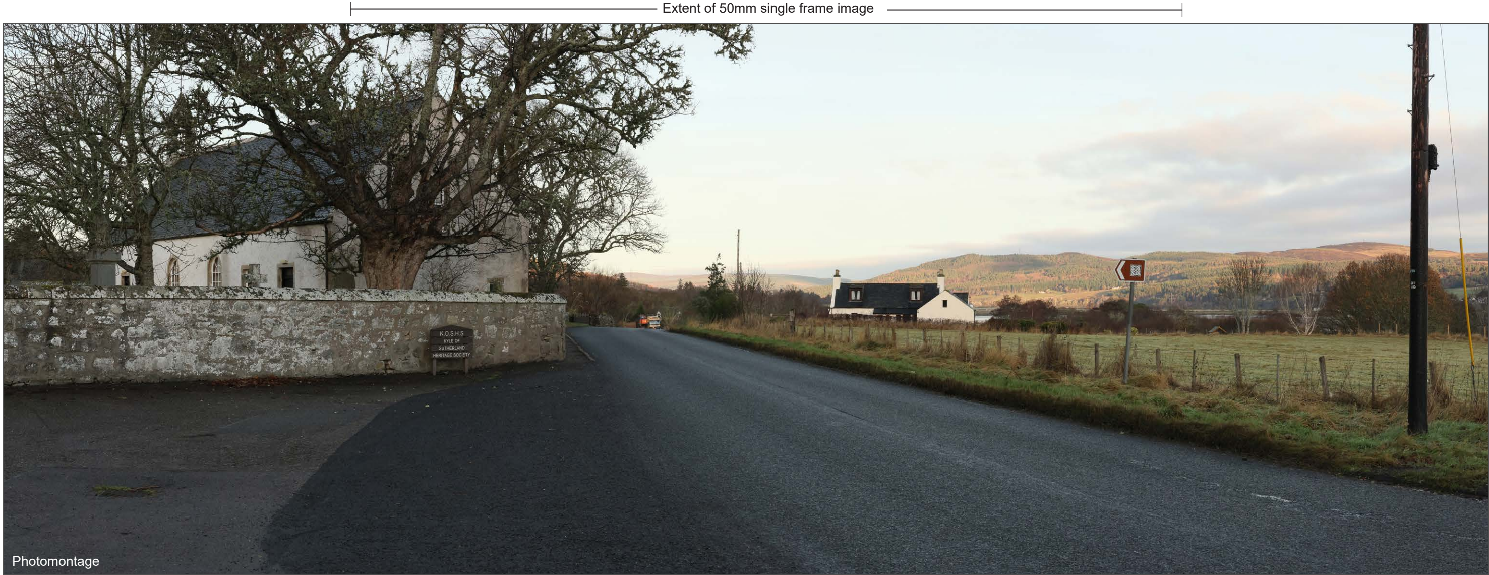
V4b Figure 7-59b Viewpoint 59: A836 Kincardine Distance to development: 7602m Camera: Canon EOS R5 Focal Length: 50mm vertical (27°) x 28mm horizontal (65.5°) Camera height: 1.5m Date: 09/12/2024 09:40

The images contained on this page and the following page are not representative of scale and distance from the actual viewpoint and show the development in its wider landscape context only.