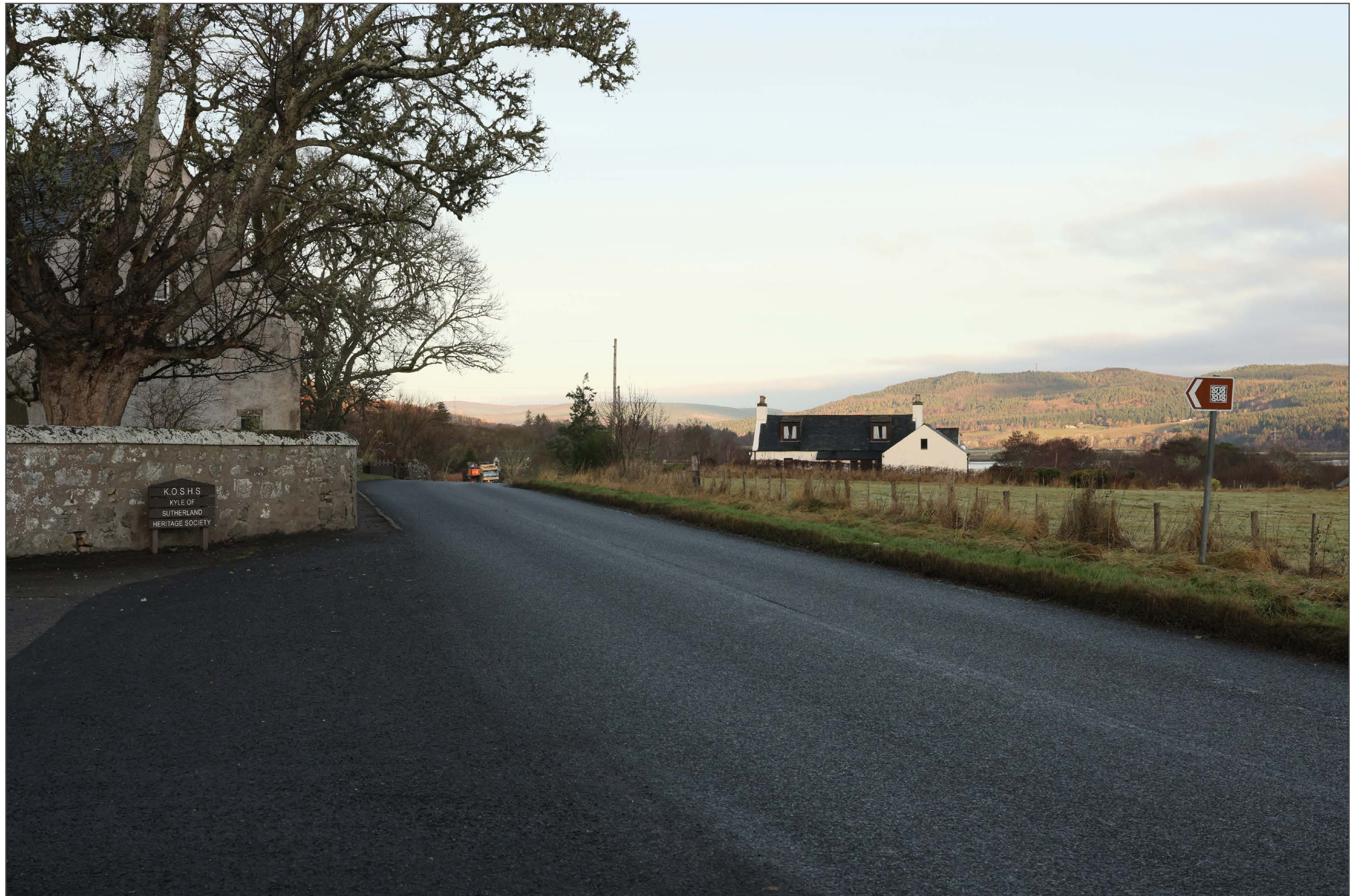
V4b Figure 7-59b(i) Viewpoint 59: A836 Kincardine

Distance to development: 7602m Camera: Canon EOS R5 Focal Length: 50mm Camera height: 1.5m Date: 09/12/2024 09:40