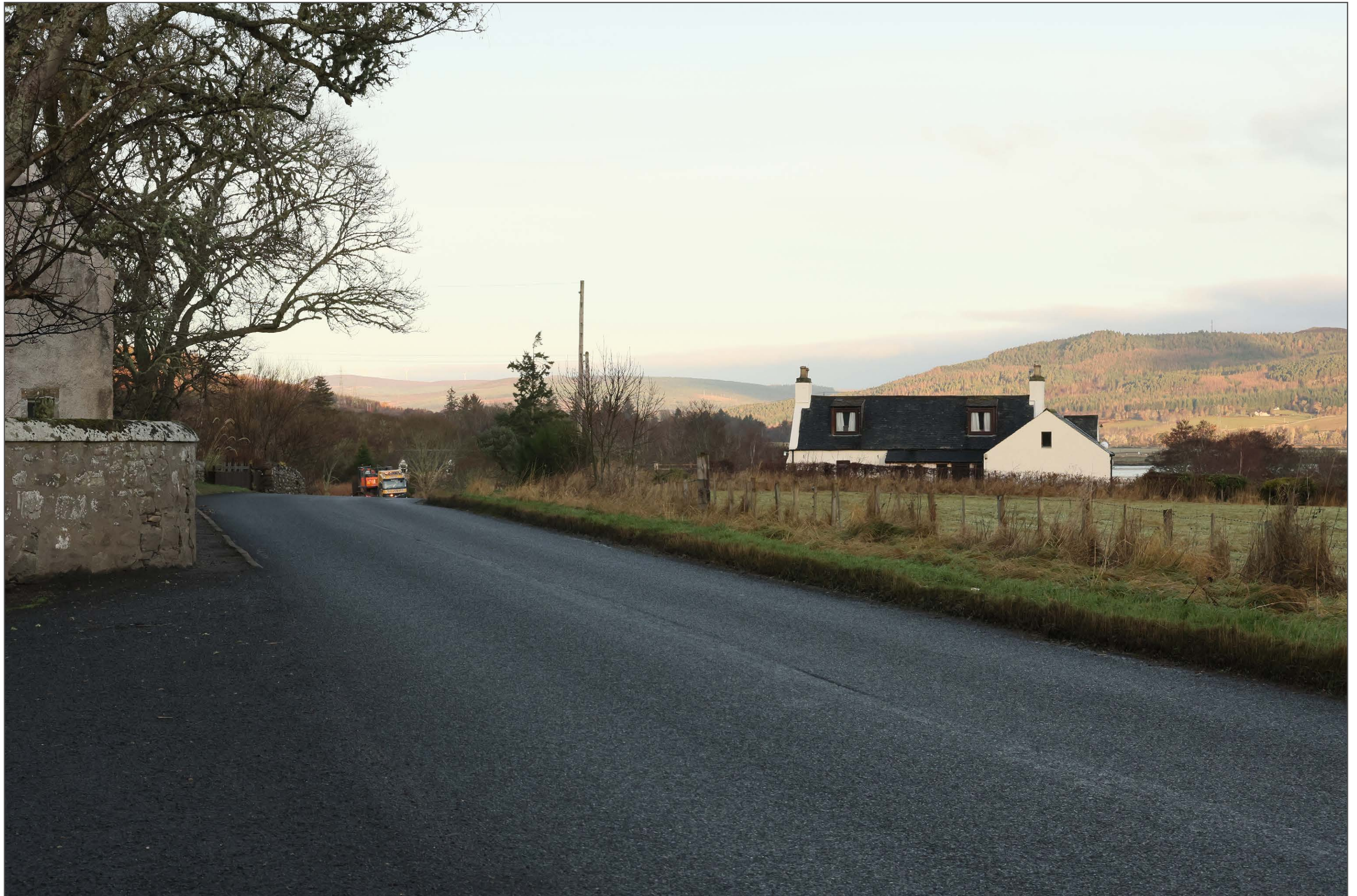
V4b Figure 7-59b(ii) Viewpoint 59: A836 Kincardine

Distance to development: 7602m Camera: Canon EOS R5 Focal Length: 75mm Camera height: 1.5m Date: 09/12/2024 09:40