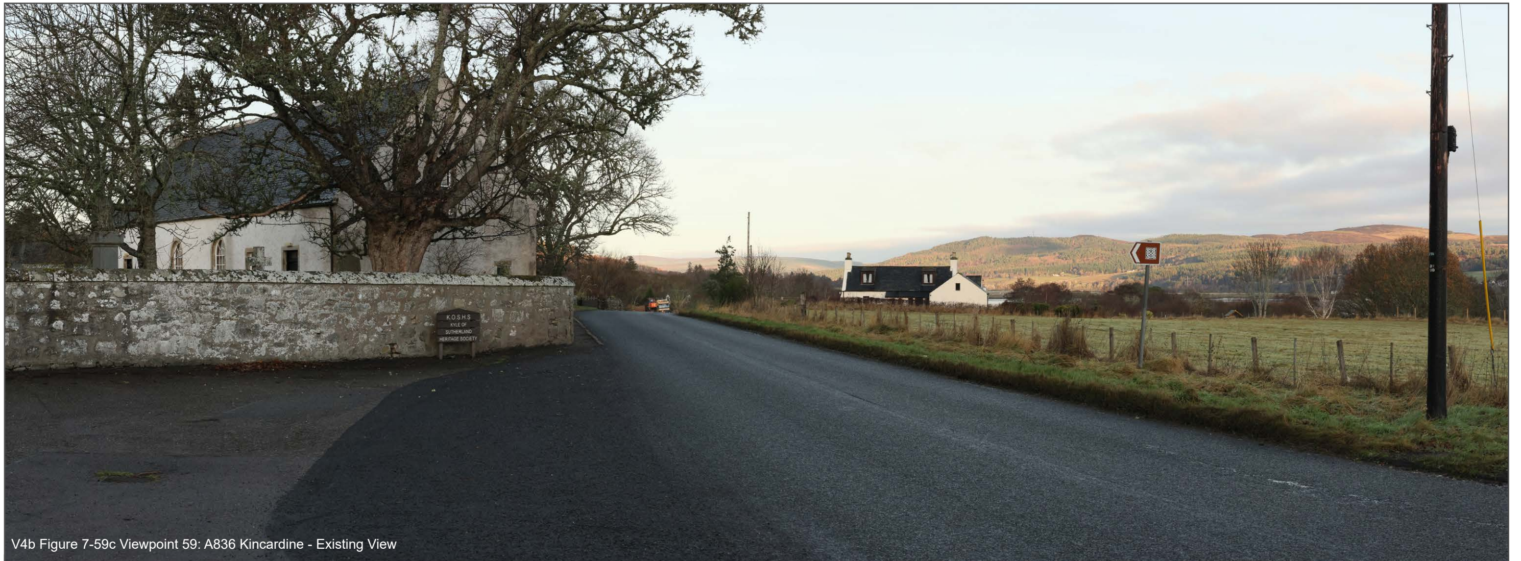
V4b Figure 7-59c Viewpoint 59: A836 Kincardine - Existing View