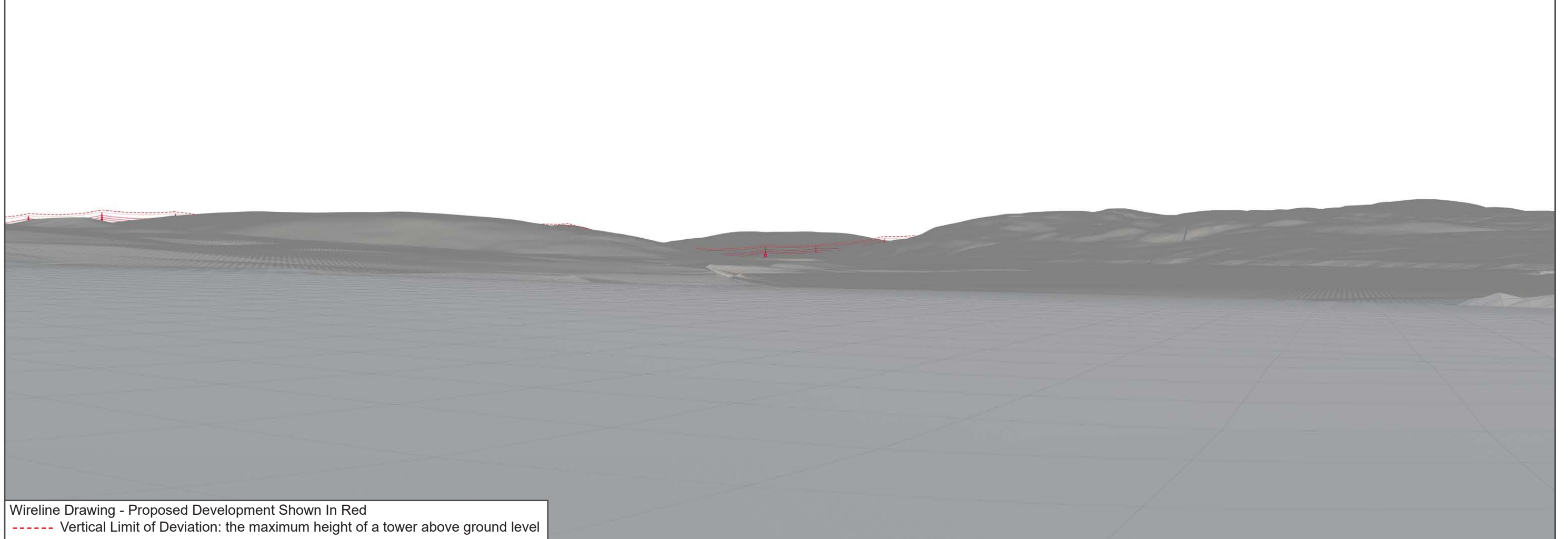
V4b Figure 7-59d Viewpoint 59: A836 Kincardine - Wireline Overlay

Wireline Drawing - Proposed Development Shown In Red ----- Vertical Limit of Deviation: the maximum height of a tower above ground level