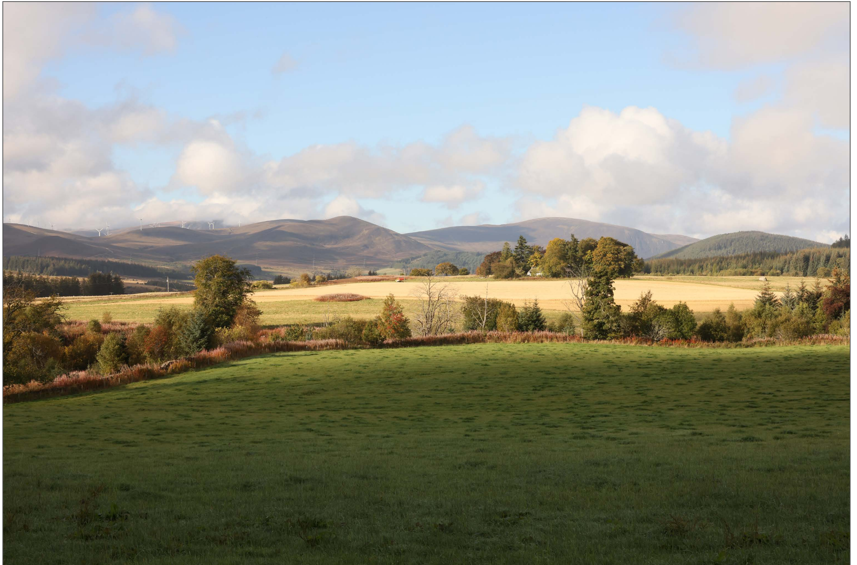
V4b Figure 7-62b(i) Viewpoint 62: Ardross (north)

Distance to development: 6248m Camera: Canon EOS R5 Focal Length: 50mm Camera height: 1.5m Date: 02/10/2024 10:40