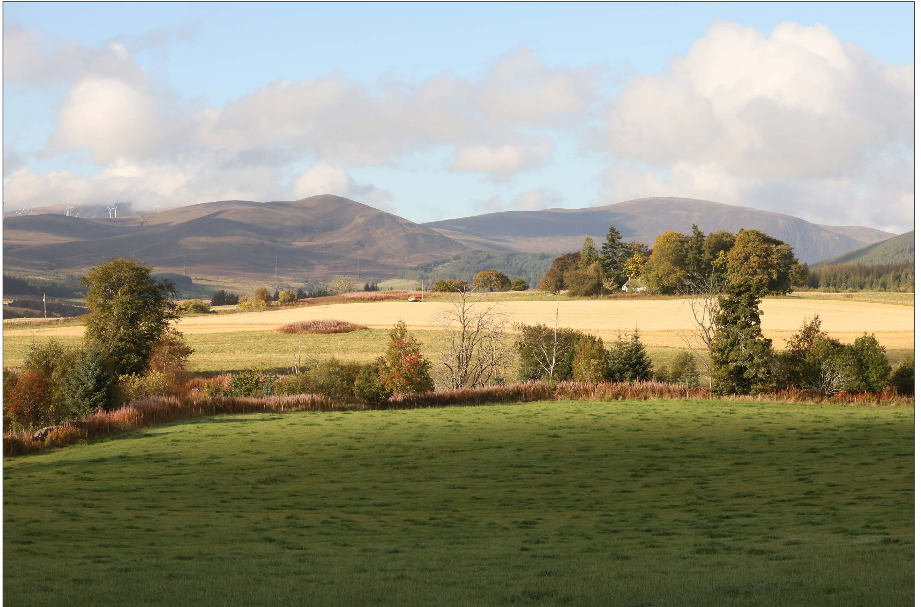
V4b Figure 7-62b(ii) Viewpoint 62: Ardross (north)

Distance to development: 6248m Camera: Canon EOS R5 Focal Length: 75mm Camera height: 1.5m Date: 02/10/2024 10:40