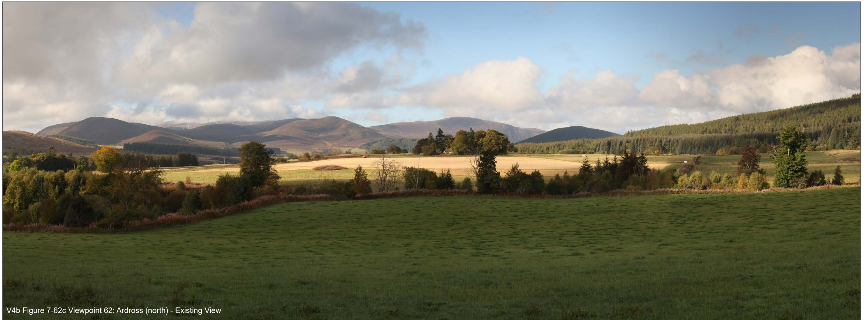
V4b Figure 7-62c Viewpoint 62: Ardross (north) - Existing View