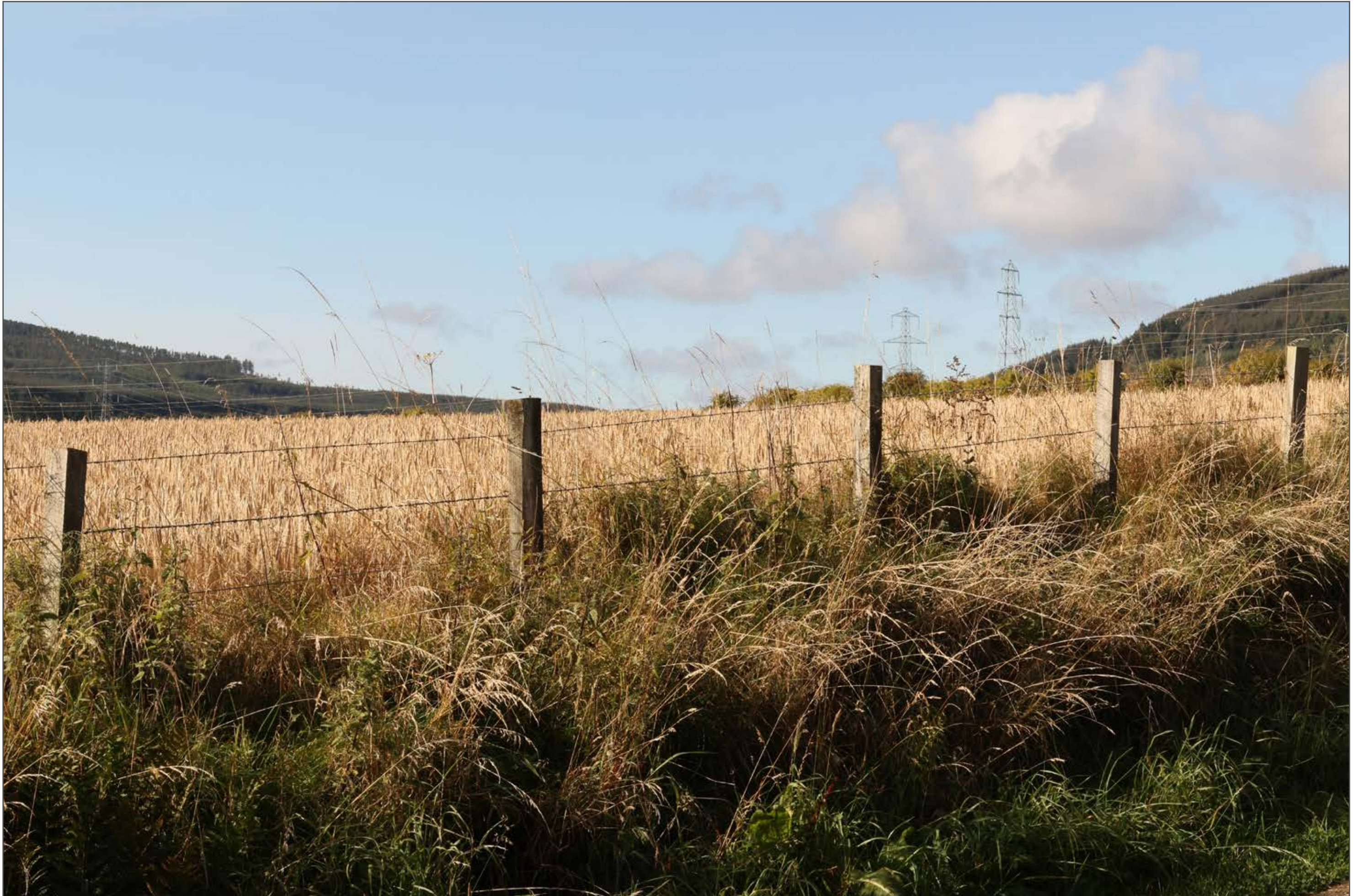
V4b Figure 7-69b(ii) Viewpoint 69: Evanton (west)

This image should be viewed at a comfortable arms length (approx. 500mm)