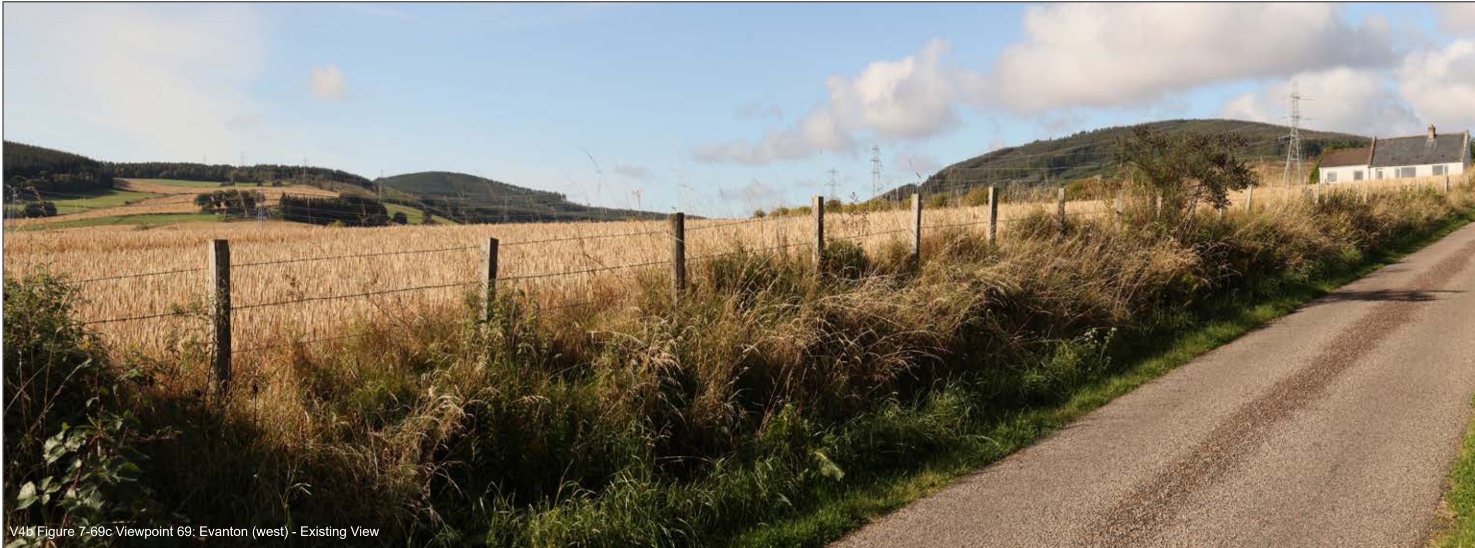
V4b Figure 7-69c Viewpoint 69: Evanton (west) - Existing View