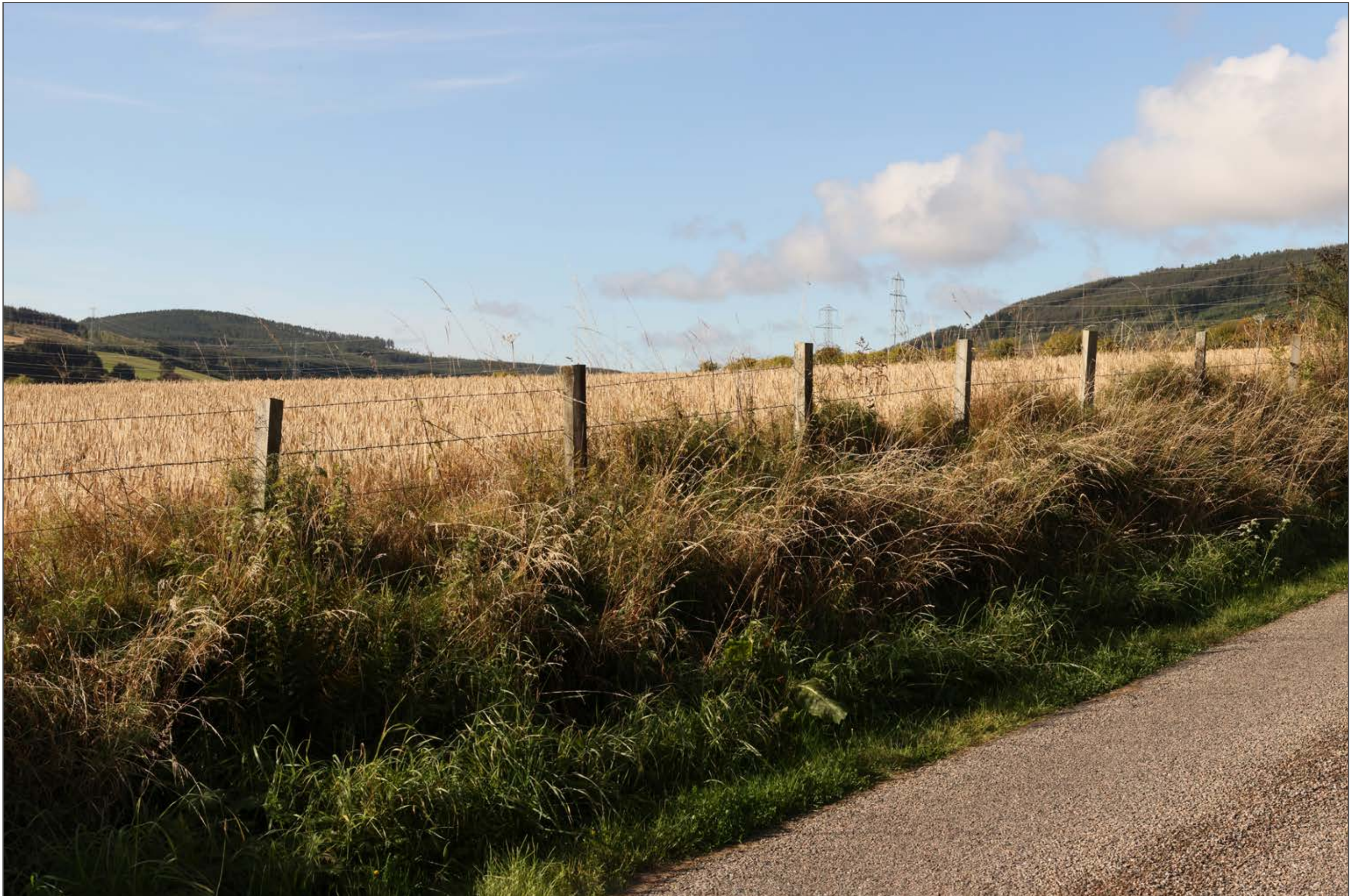
V4b Figure 7-69b(i) Viewpoint 69: Evanton (west)

This image should be viewed at a comfortable arms length (approx. 500mm)