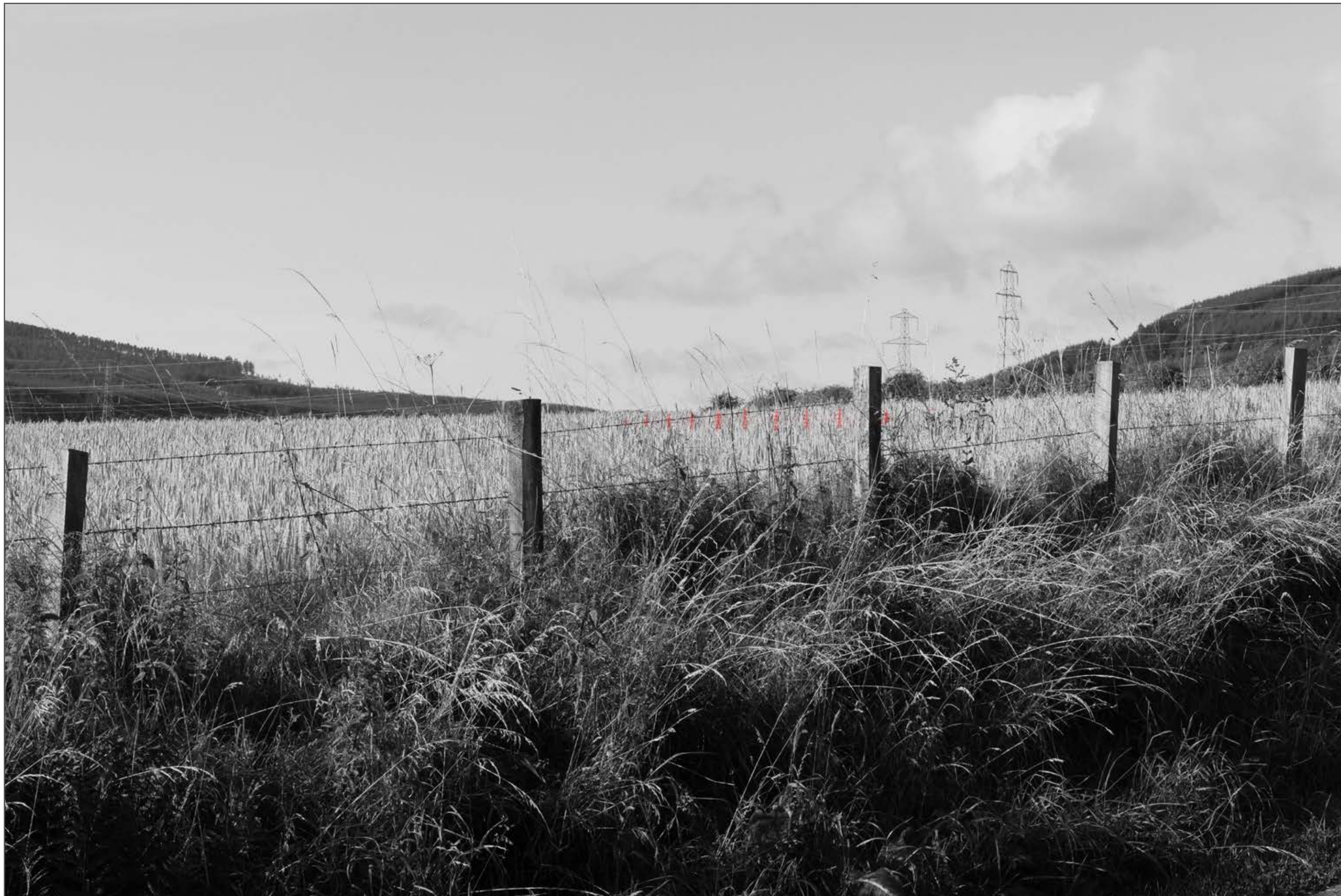
V4b Figure 7-69b(iii)