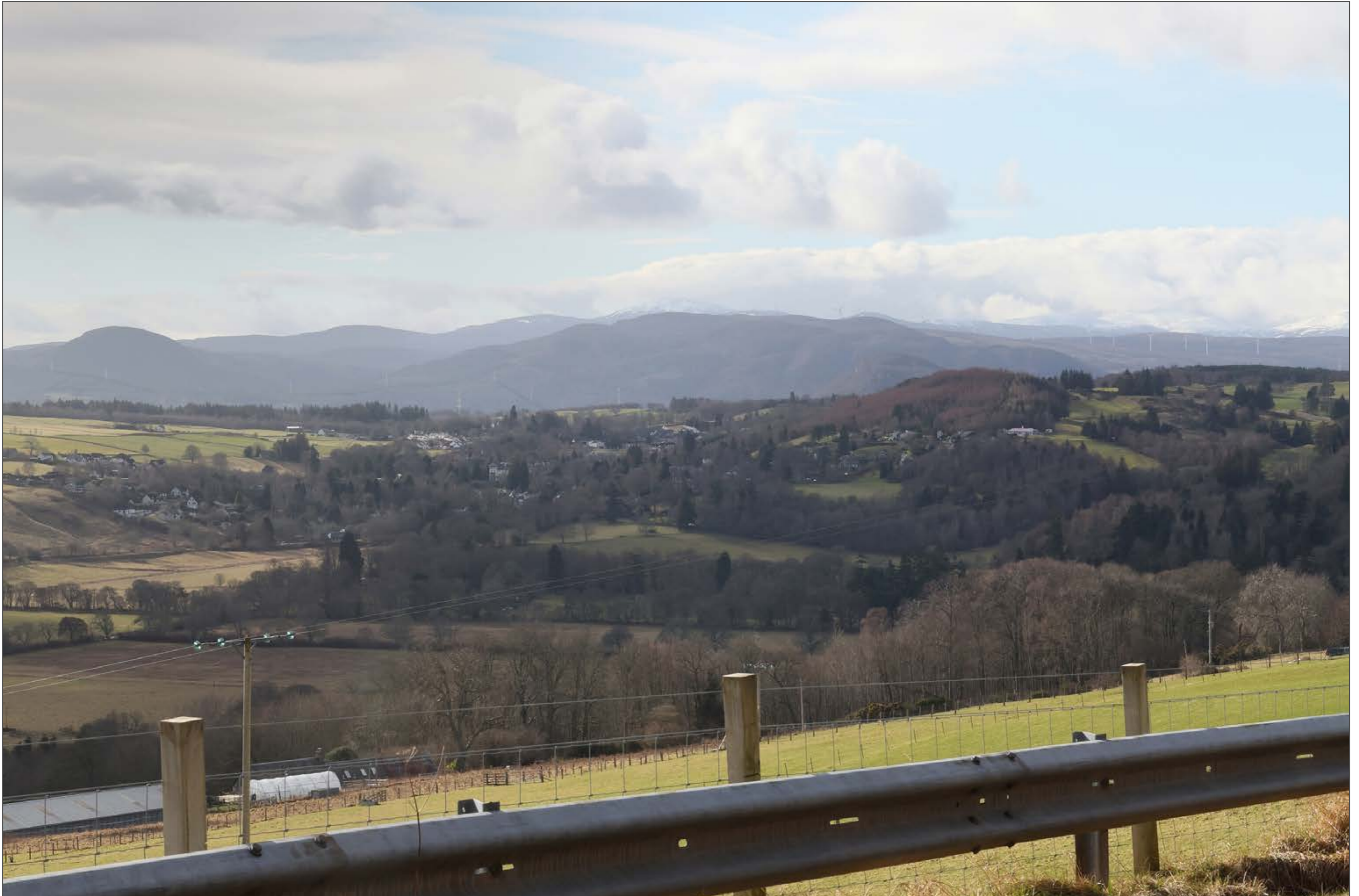
V4b Figure 7-74b(ii)