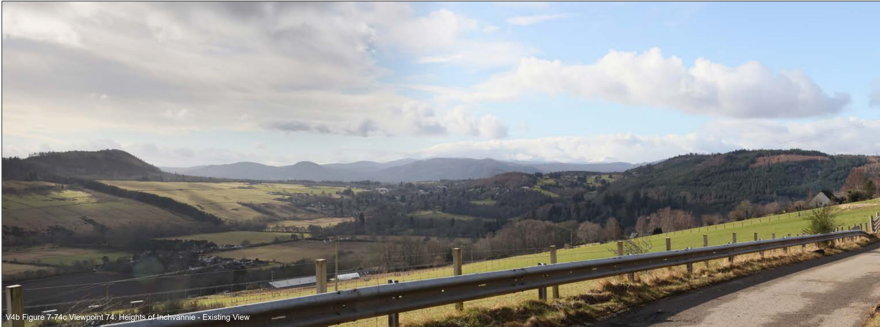
V4b Figure 7-74c Viewpoint 74: Heights of Inchvannie - Existing View