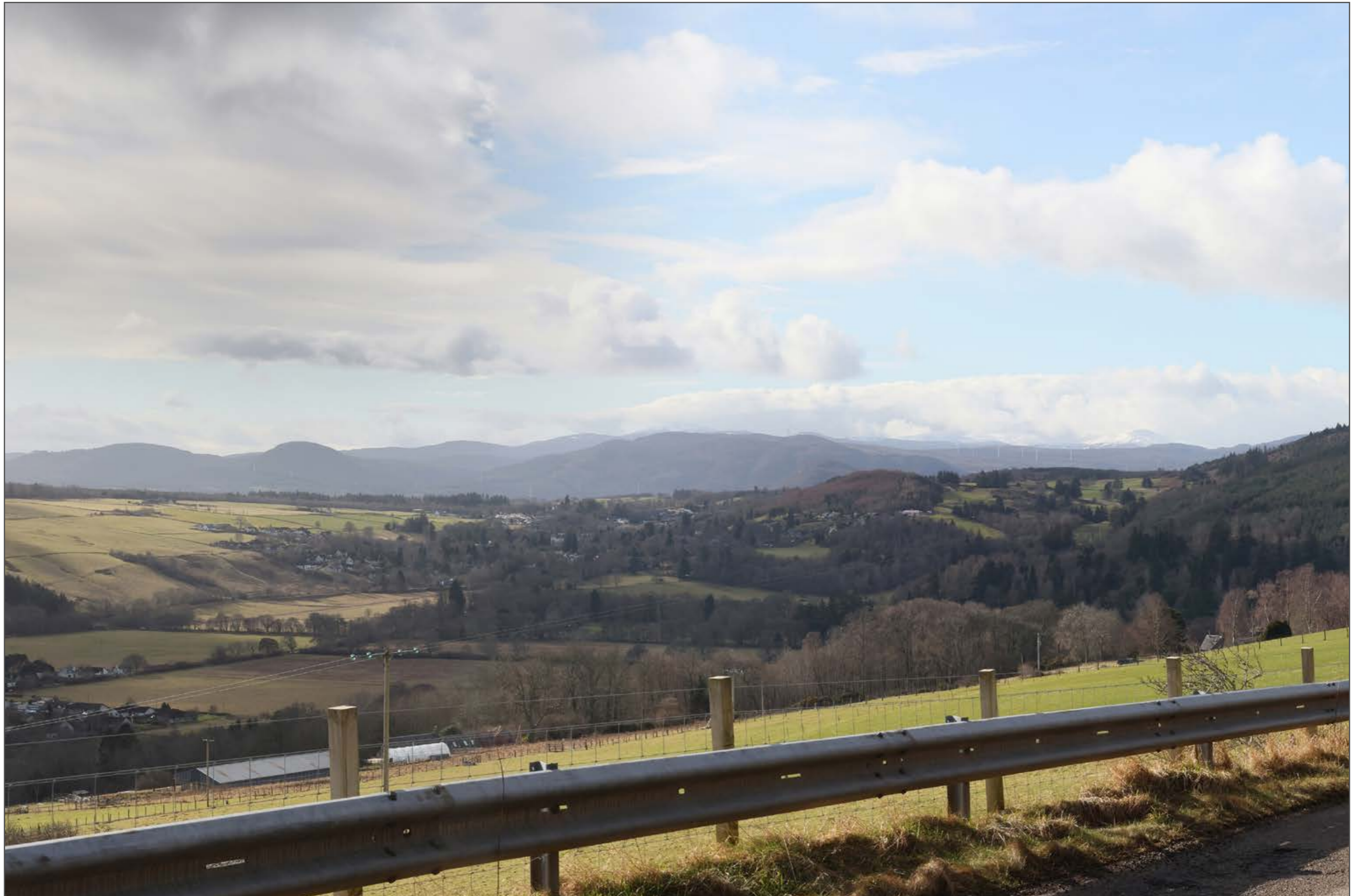
V4b Figure 7-74b(i)