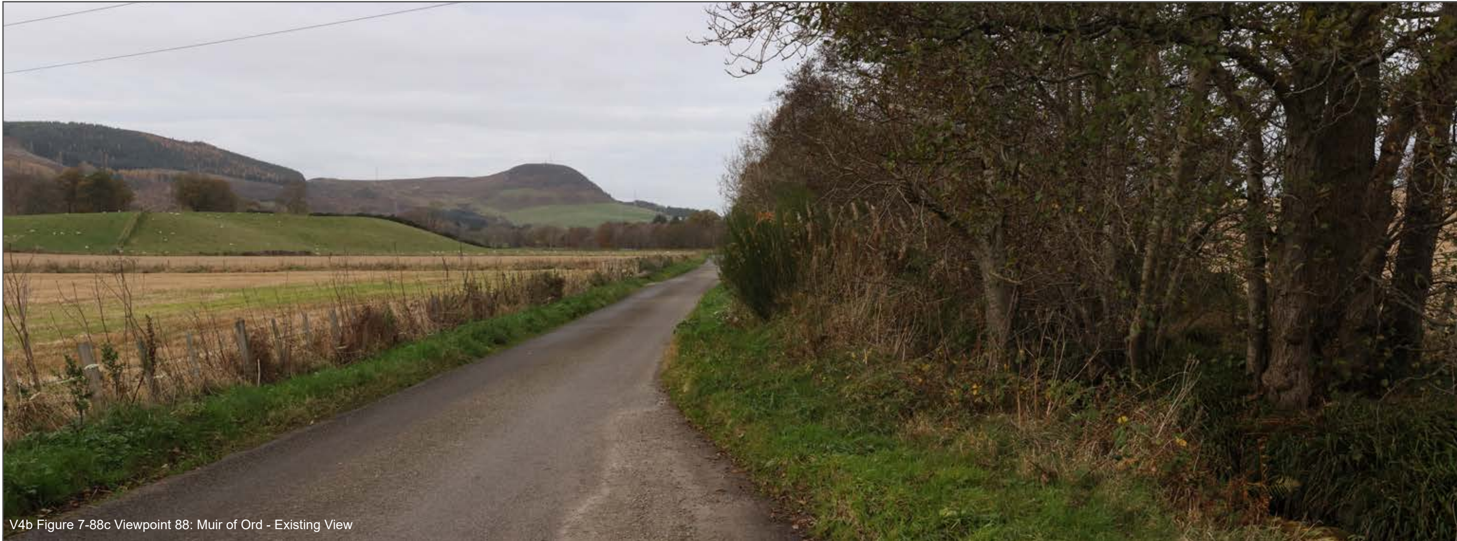
V4b Figure 7-88c Viewpoint 88: Muir of Ord - Existing View