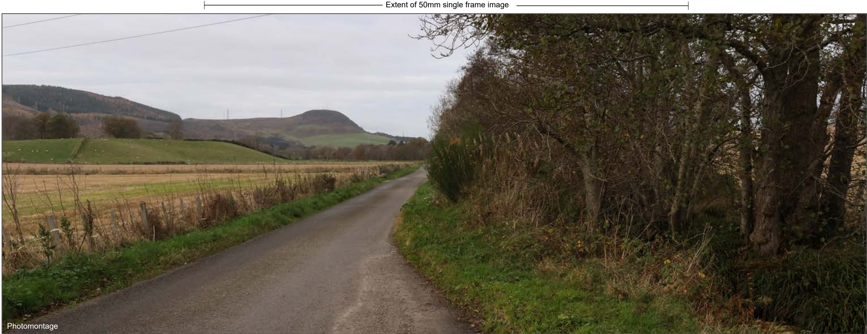
V4b Figure 7-88b Viewpoint 88: Muir of Ord View Direction: 265°

Distance to nearest development: 3766m Camera: Canon EOS R5 Focal Length: 50mm vertical (27°) x 28mm horizontal (65.5°) Camera height: 1.5m Date: 11/11/2024 10:45