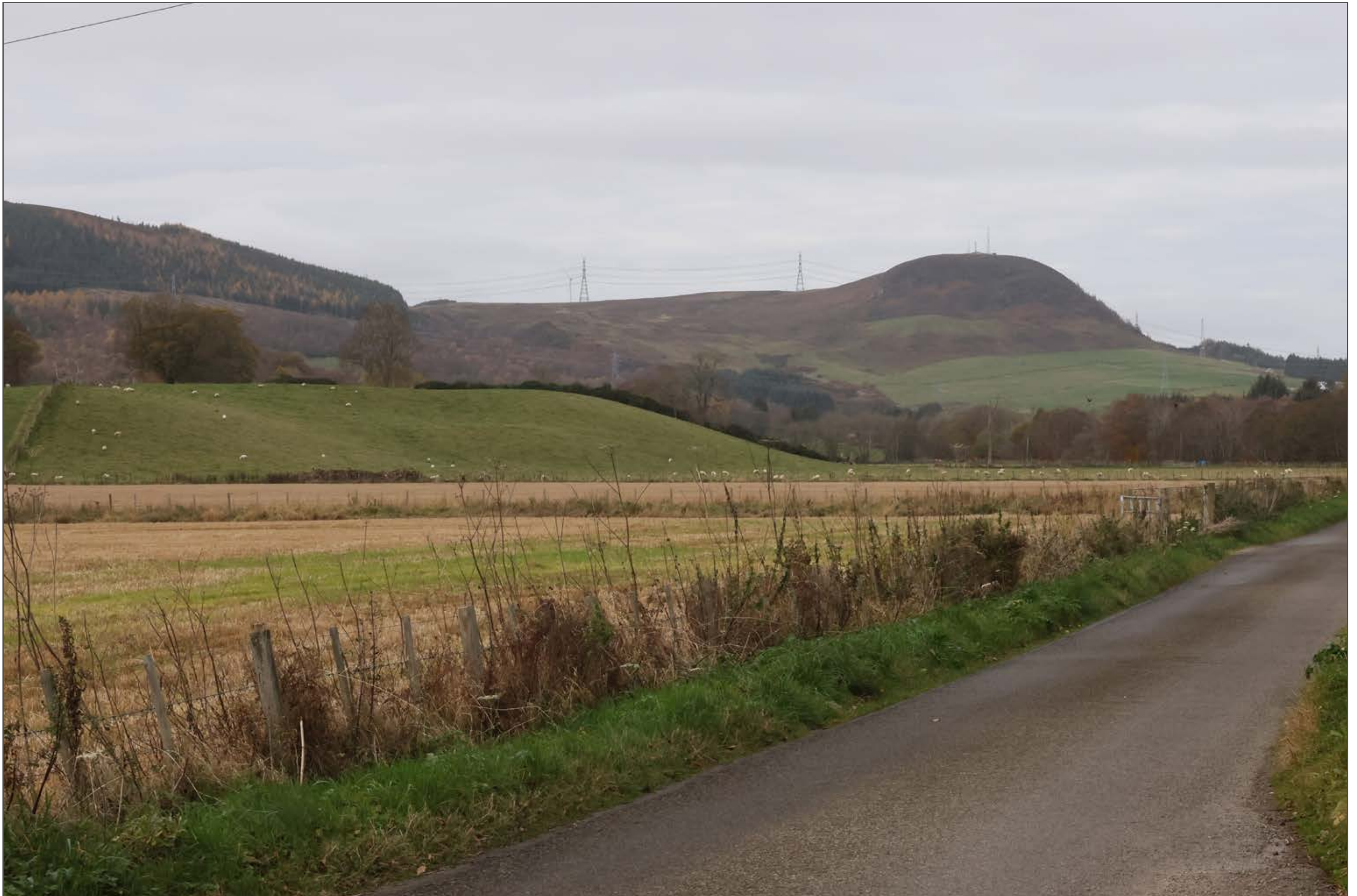
V4b Figure 7-88b(ii) Viewpoint 88: Muir of Ord

This image should be viewed at a comfortable arms length (approx. 500mm)