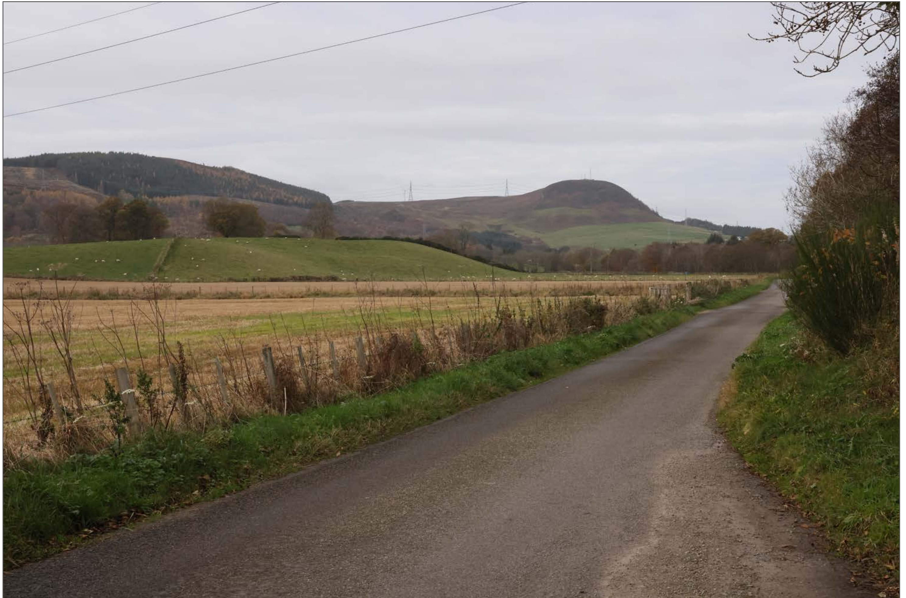
V4b Figure 7-88b(i) Viewpoint 88: Muir of Ord

This image should be viewed at a comfortable arms length (approx. 500mm)