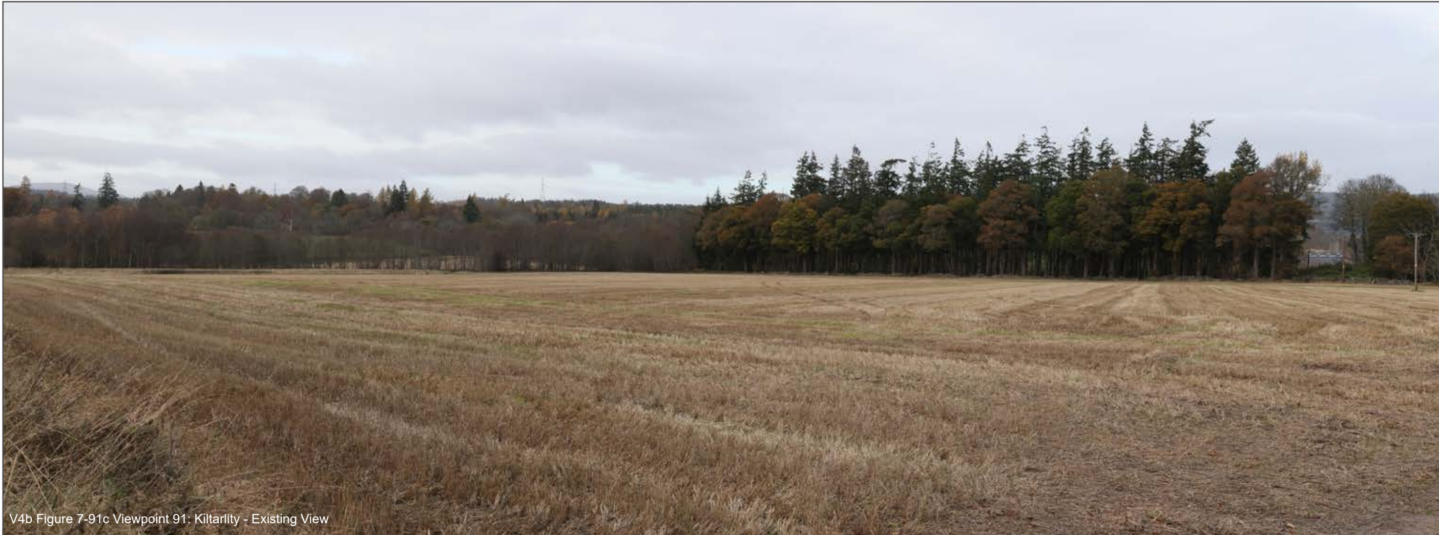
V4b Figure 7-91c Viewpoint 91: Kiltarlity - Existing View