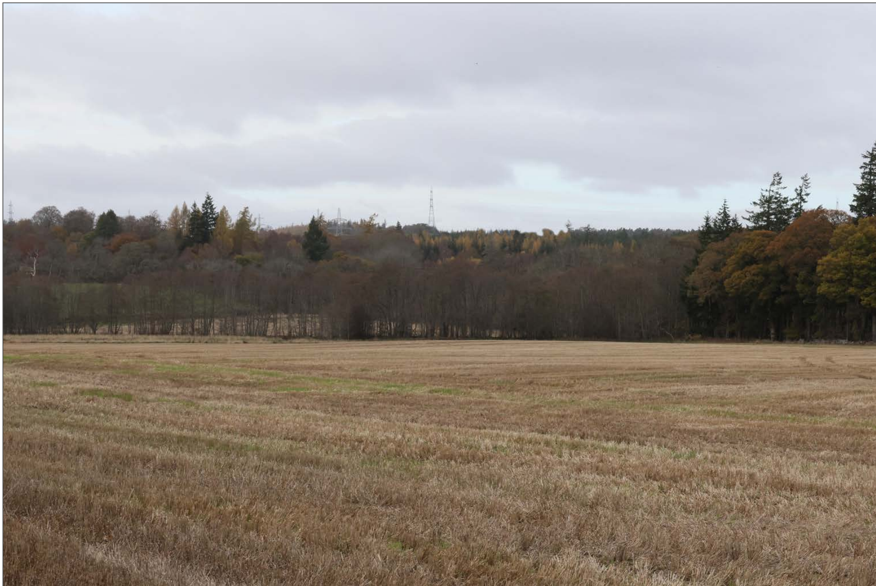
V4b Figure 7-91b(ii) Viewpoint 91: Kiltarlity

Distance to nearest development: 2764m Camera: Canon EOS R5 Focal Length: 75mm Camera height: 1.5m Date: 11/11/2024 13:15