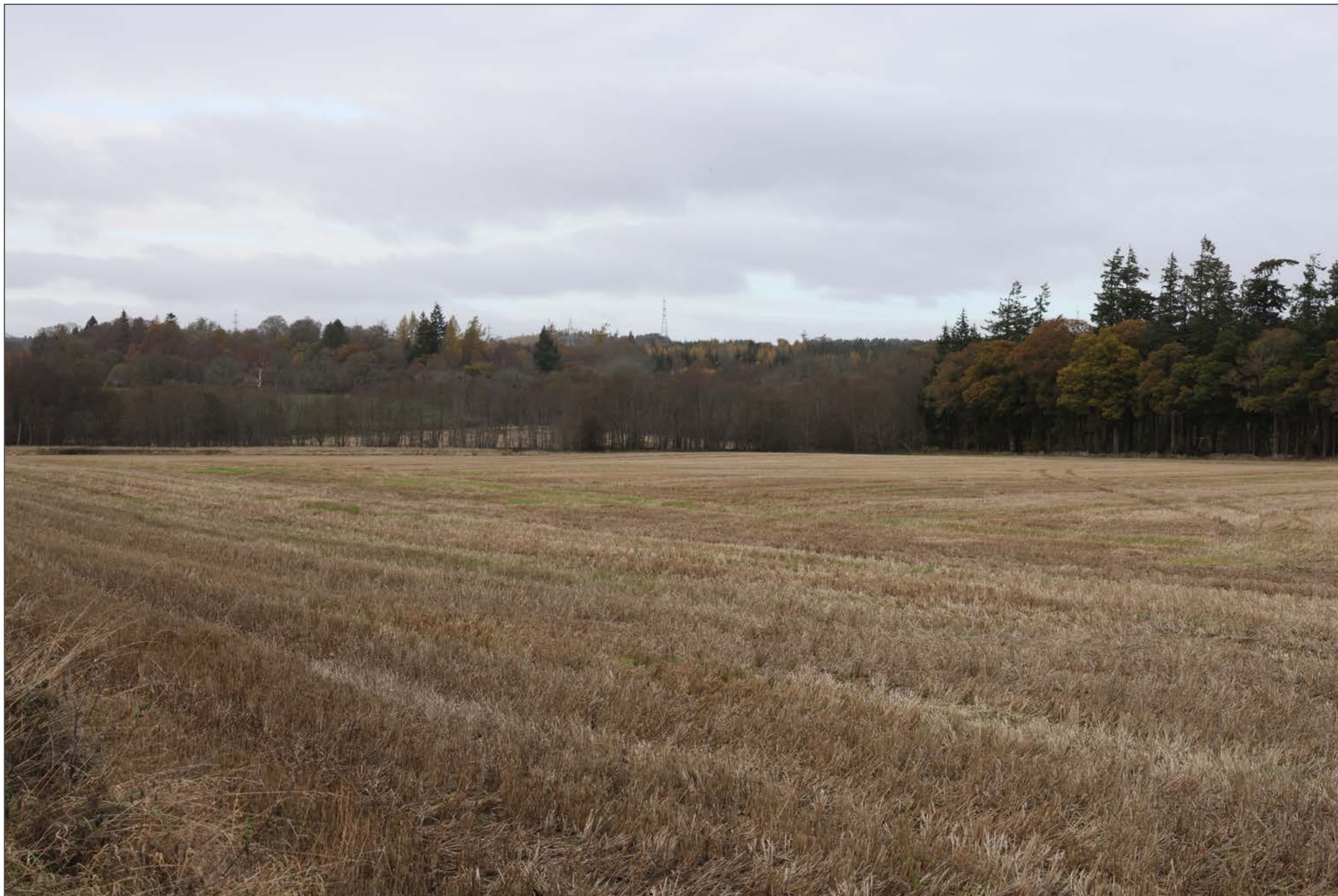
V4b Figure 7-91b(i) Viewpoint 91: Kiltarlity

This image should be viewed at a comfortable arms length (approx. 500mm)