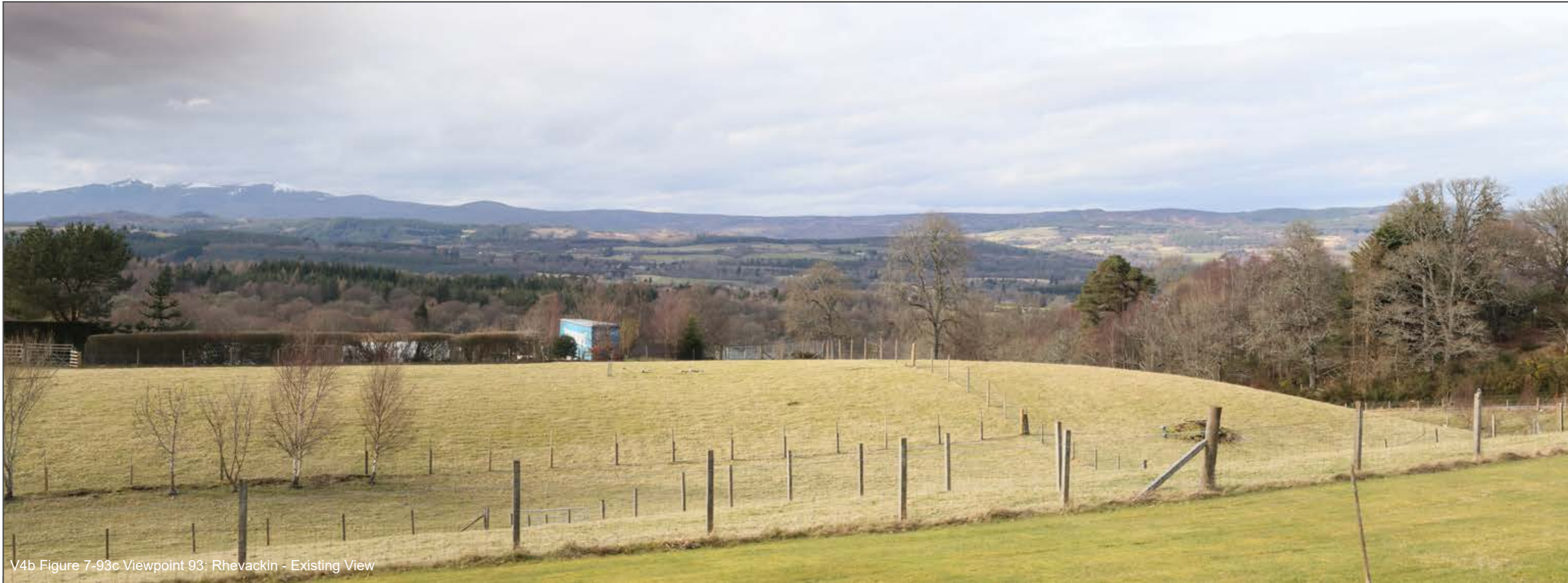
V4b Figure 7-93c Viewpoint 93: Rhevackin - Existing View