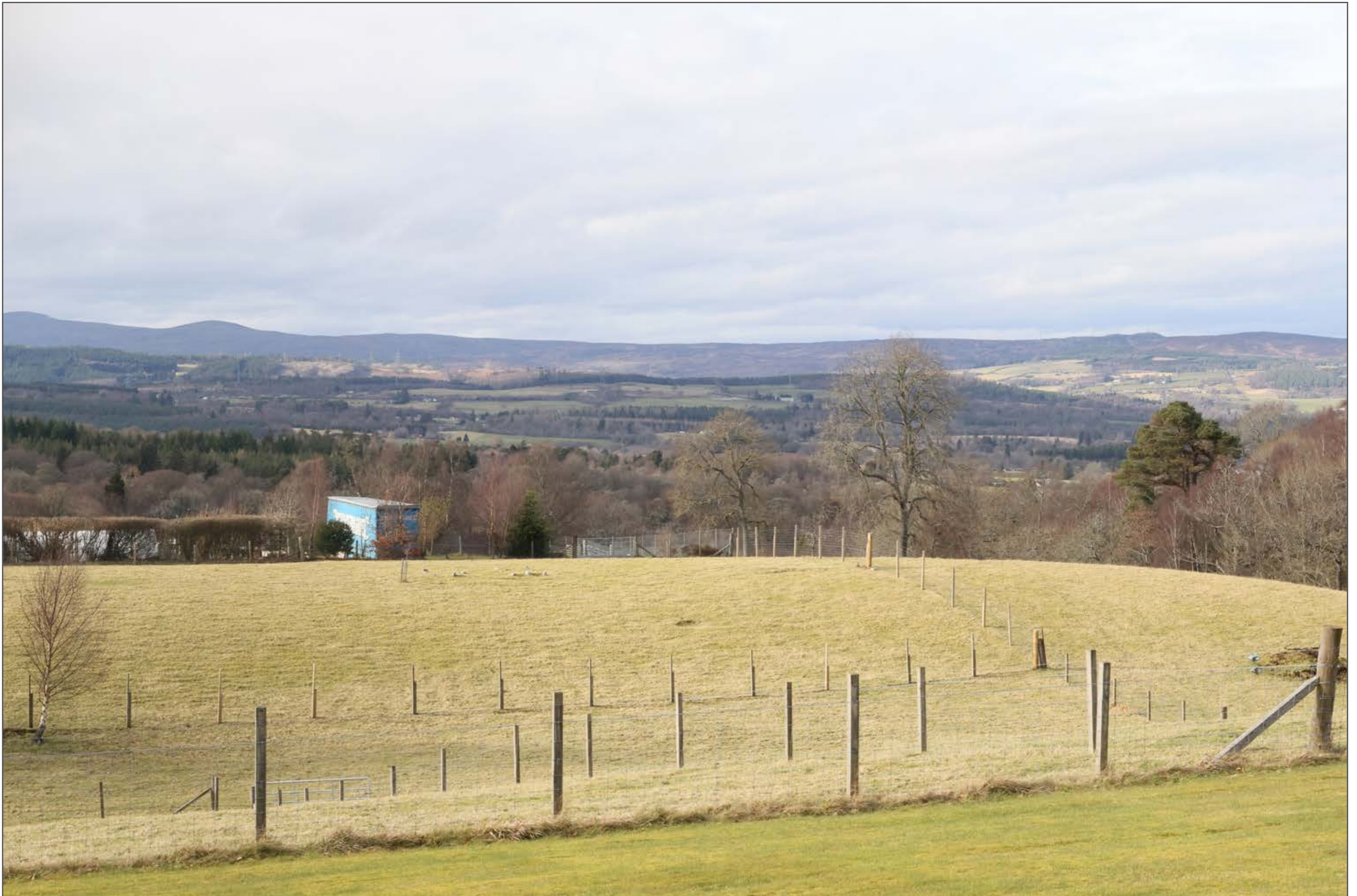
V4b Figure 7-93b(i) Viewpoint 93: Rhevackin

This image should be viewed at a comfortable arms length (approx. 500mm)