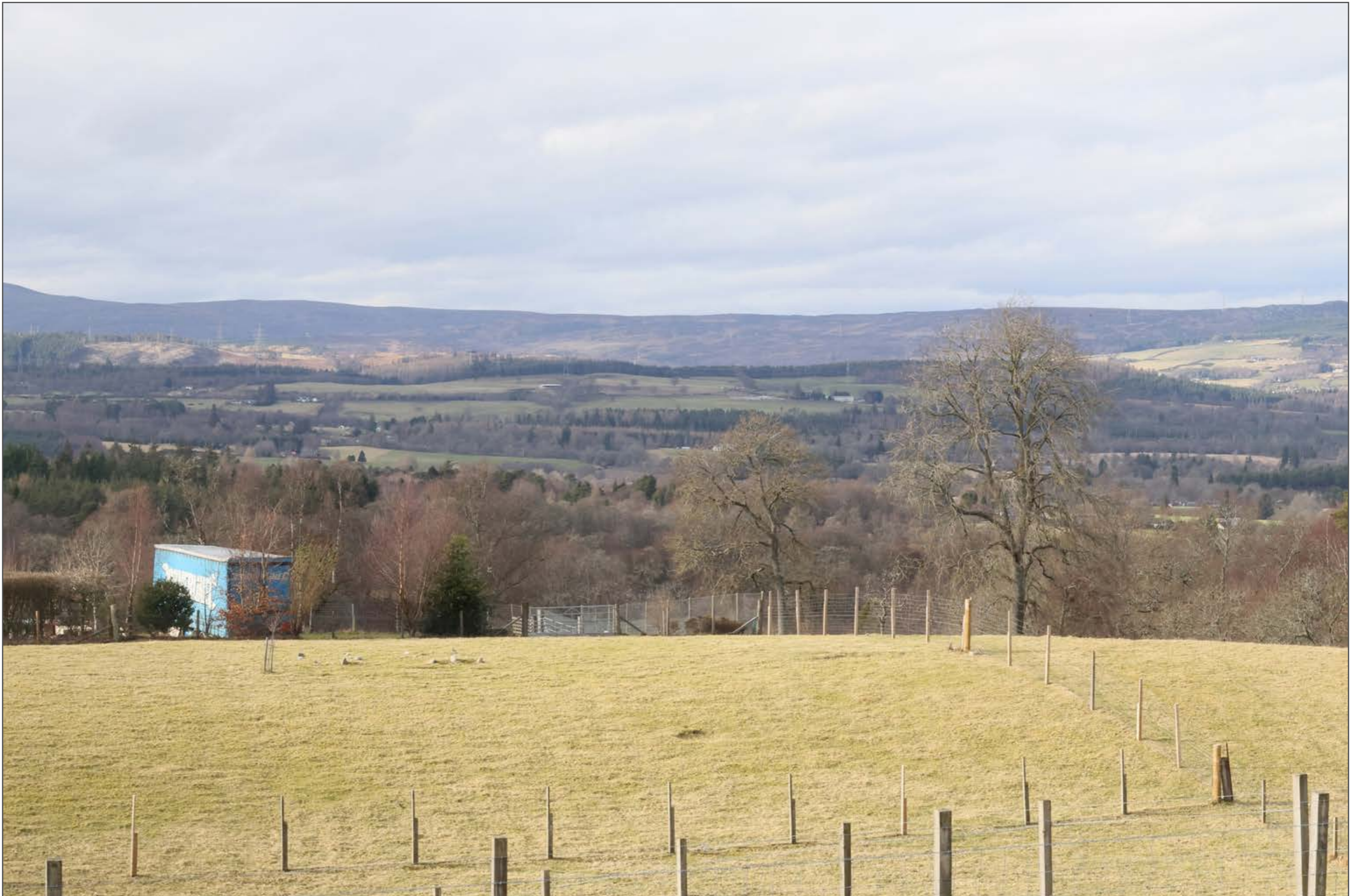
V4b Figure 7-93b(ii) Viewpoint 93: Rhevackin

This image should be viewed at a comfortable arms length (approx. 500mm)