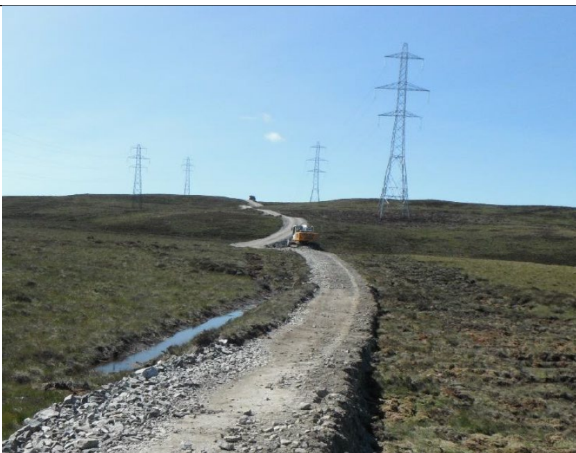
Photo 6: Example of ongoing narrowing works to access track using stored turves.