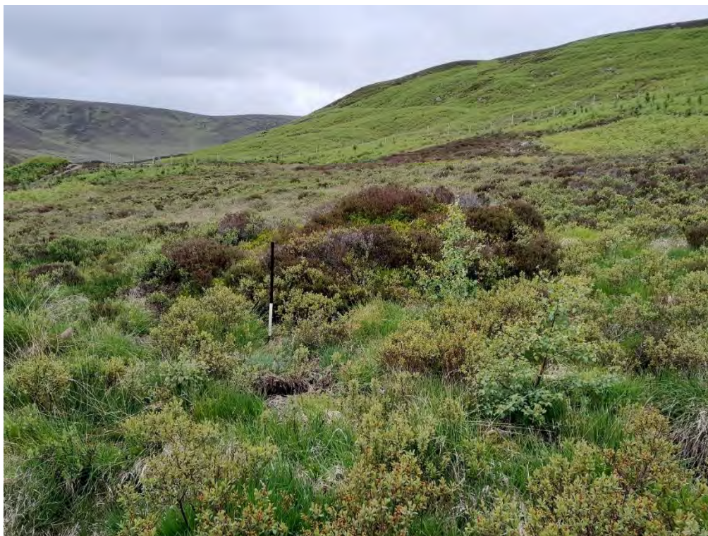
Plate 311: Clearance cairn (Asset 119.5; MHG10048), facing northwest