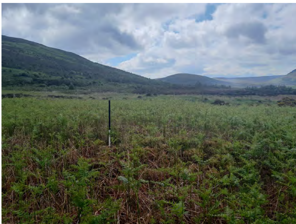
Plate 280: Building footings (Asset 212) and associated enclosure (Asset 213), facing southwest