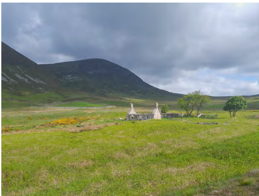
Plate 282: Farmstead (Asset 211), with main building (Asset 211.1) in centre, enclosure (Asset 211.2) to right, possible building footings (Asset 211.10) visible as mound under bracken below and left of enclosure, and out buildings (Assets 211.3 and 211.4) in background, facing northwest