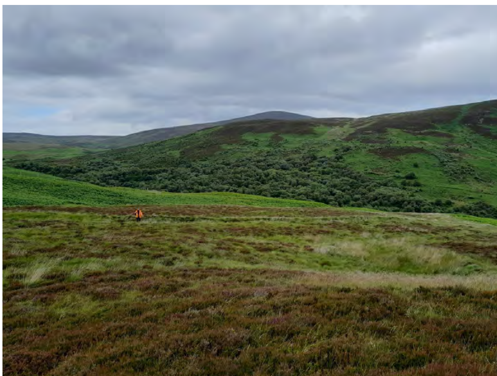
Plate 298: Dyke (Asset 800), facing east