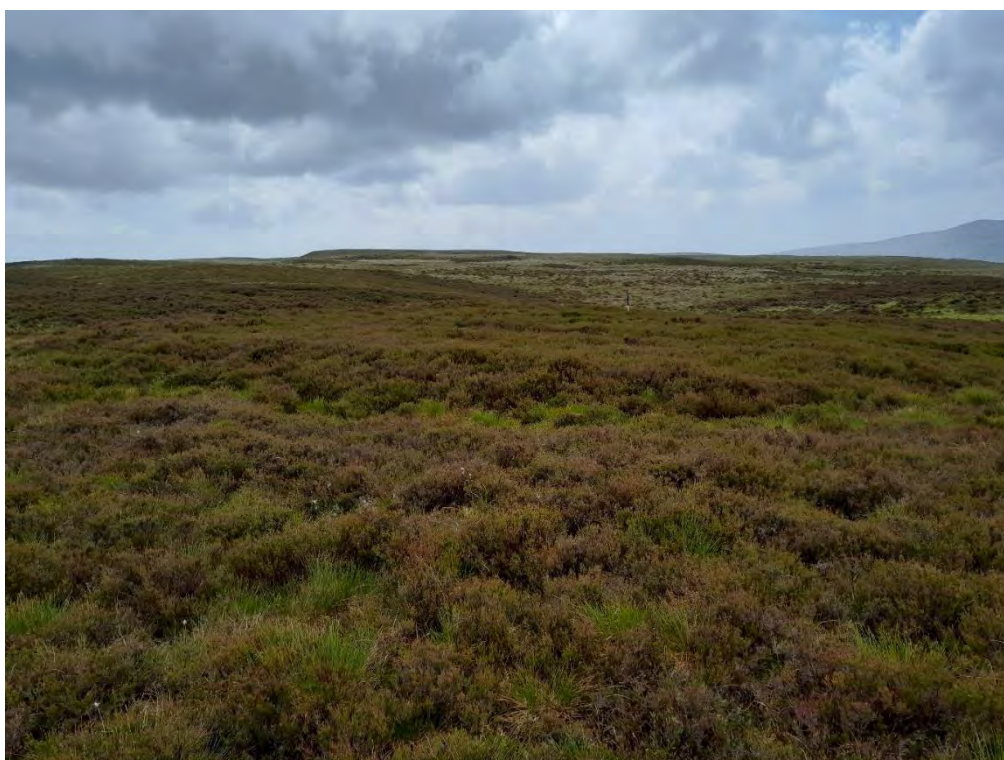
Plate 336: Enclosure (Asset 479), facing south