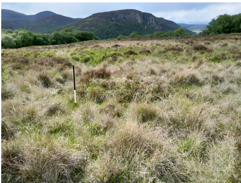
Plate 348: Clearance cairn (Asset 490.4), facing west