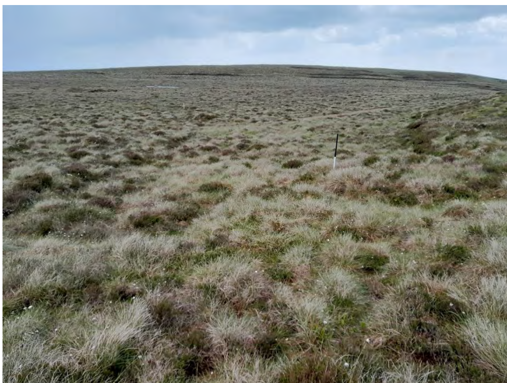
Plate 326: Peat cutting (Asset 480.1), facing southeast