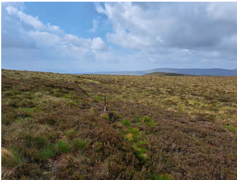
Plate 325: Peat cutting (Asset 478), facing south-southwest