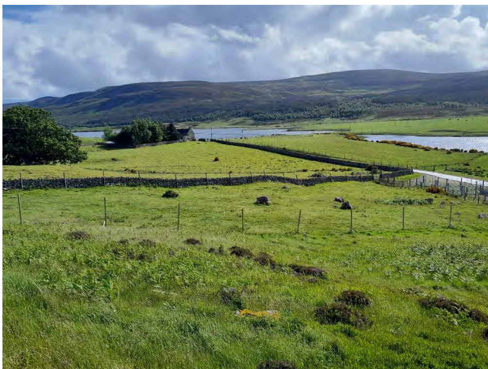
Plate 364: Enclosure (Asset 503) and clearance cairns (Assets 483.1 and 483.2) in the right corner of the enclosure, facing southwest