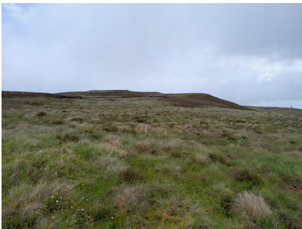
Plate 330: Peat cutting (Asset 480.5), facing northeast