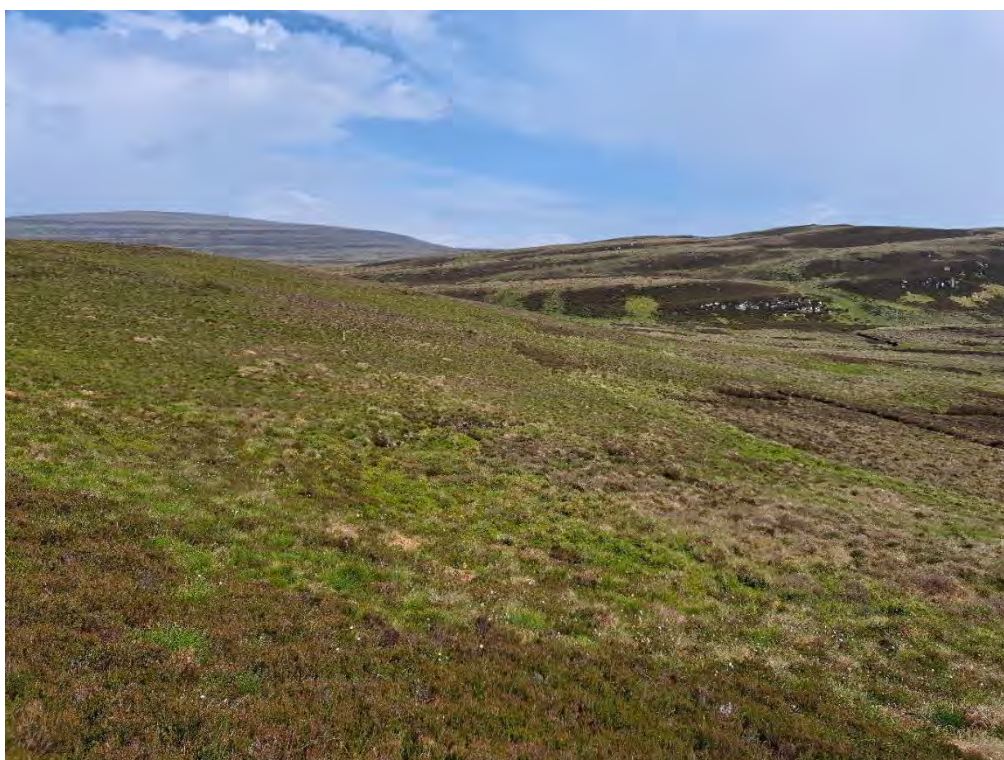
Plate 332: Peat cutting (Asset 481.2), facing northeast