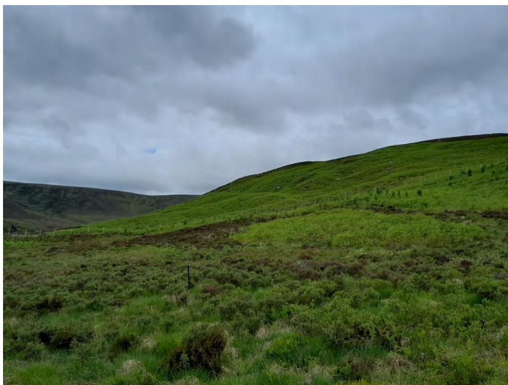
Plate 312: Lynchet (Asset 119.9; MHG10048), facing northwest