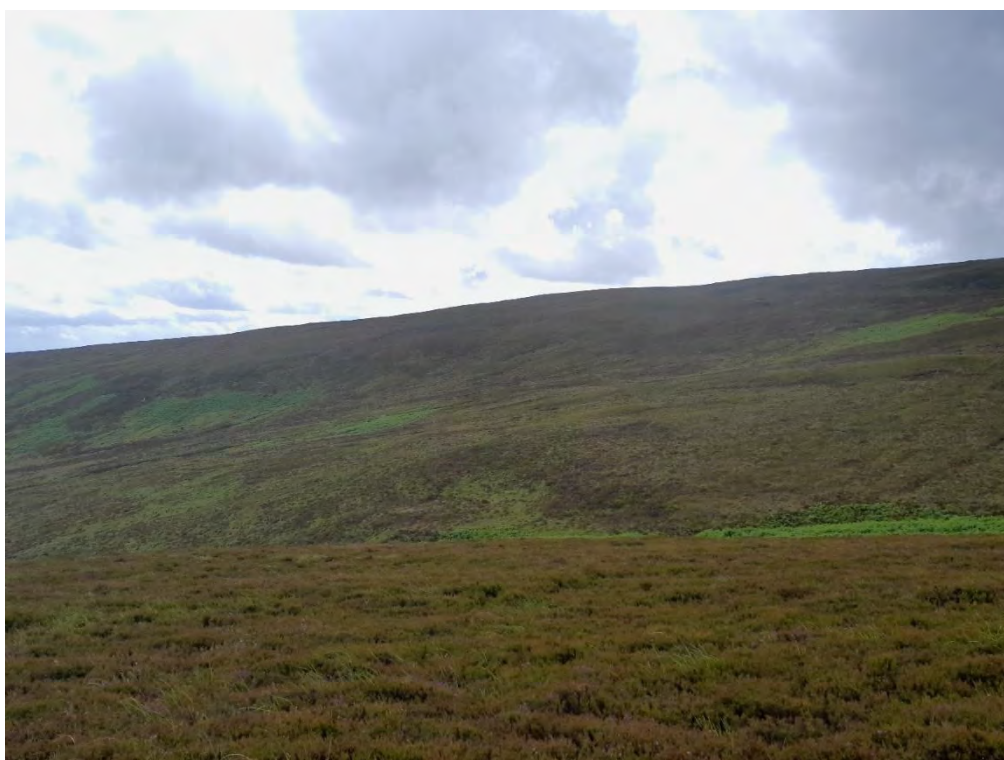
Plate 318: Peat cutting area (Assets 504.5), facing southwest