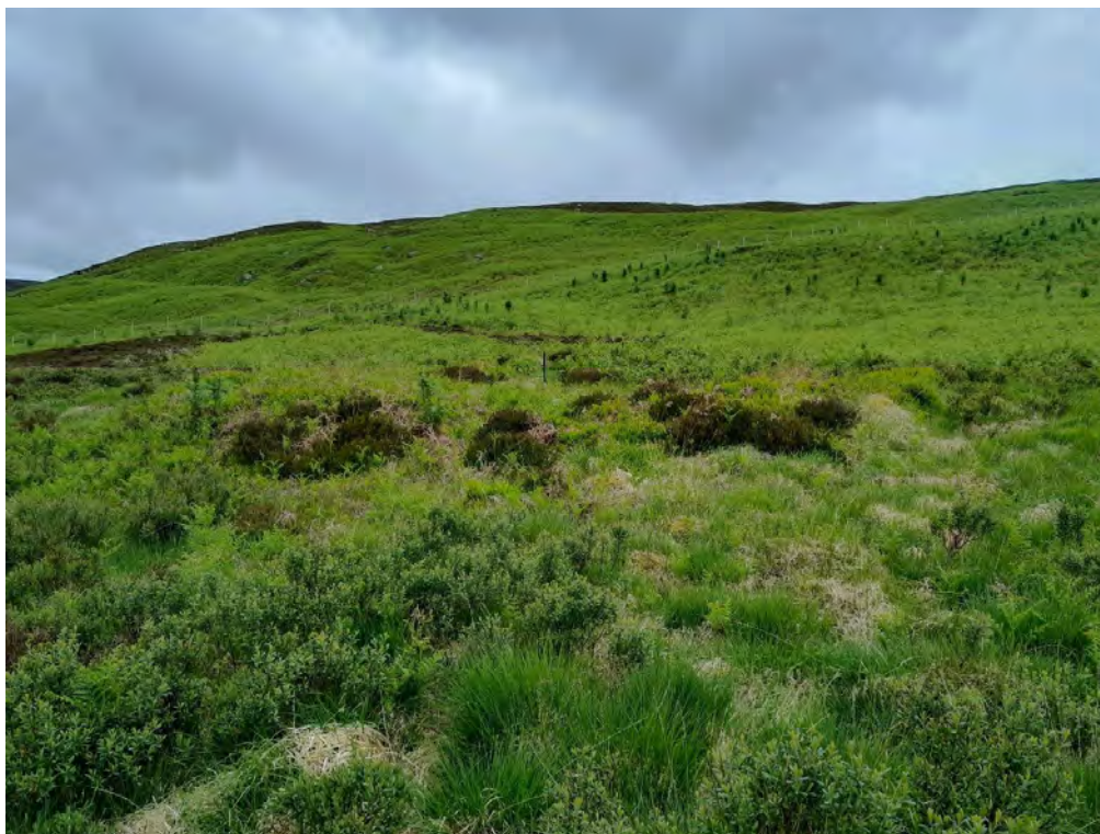
Plate 309: Hut circle (Asset 119.6; MHG10048), facing northwest