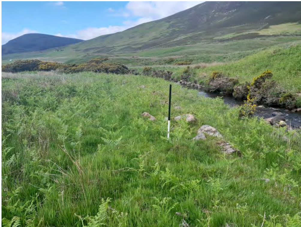
Plate 286: Dyke (Asset 211.7). facing southwest