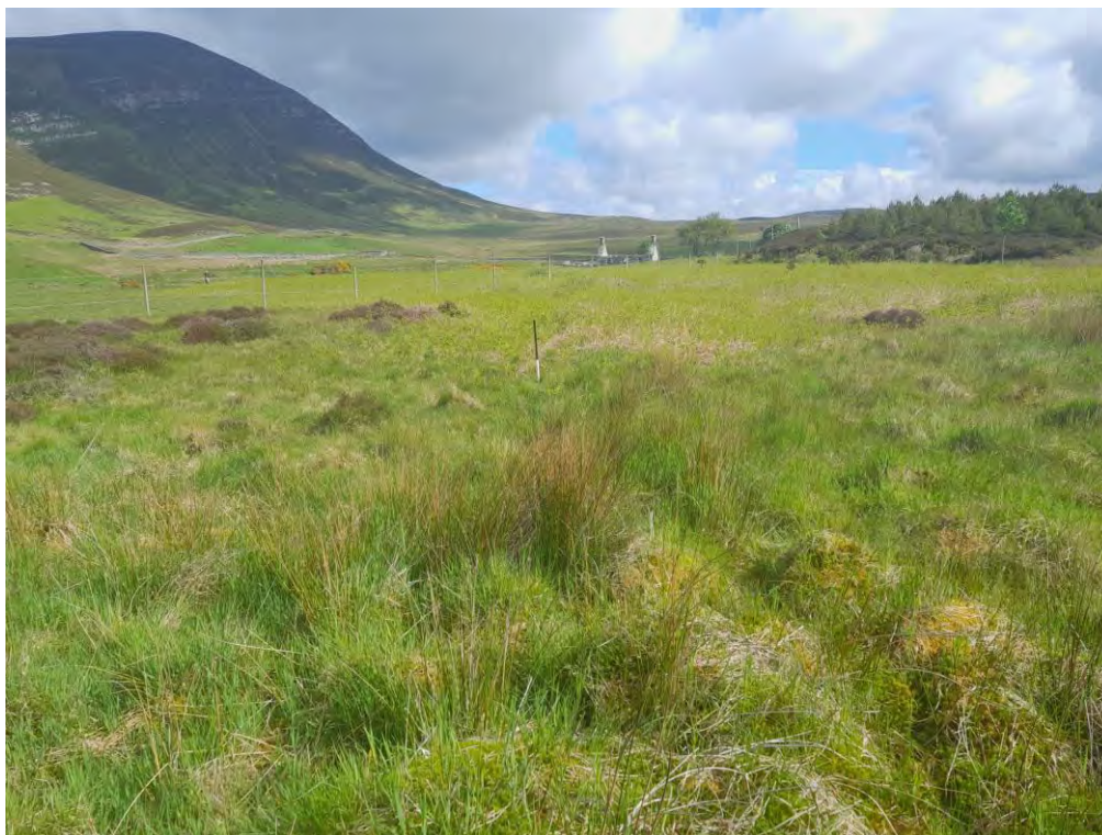
Plate 287: Dyke (Asset 425), facing north