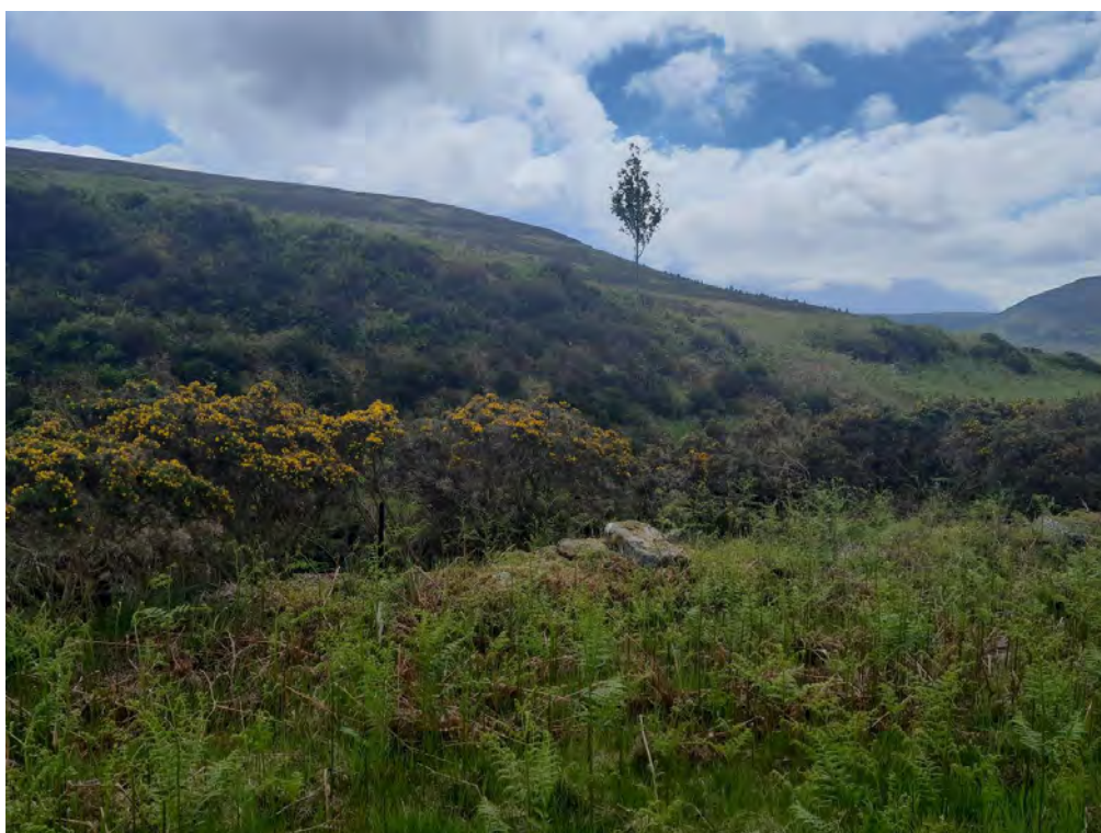
Plate 276: Dyke (Asset 428.6), facing south