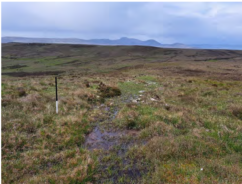
Plate 333: Track (Asset 482), facing west-southwest