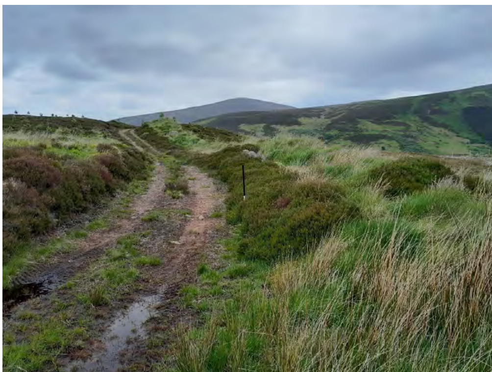
Plate 300: Dyke (Asset 448), facing northeast