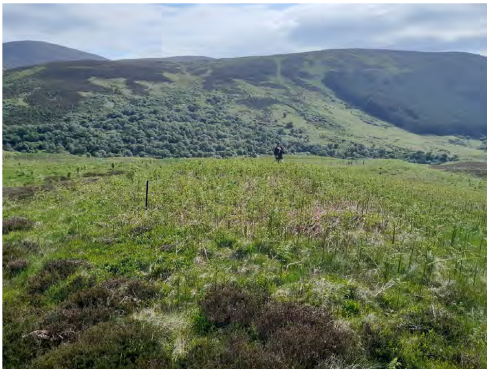
Plate 295: Building (Asset 443.1), facing northeast