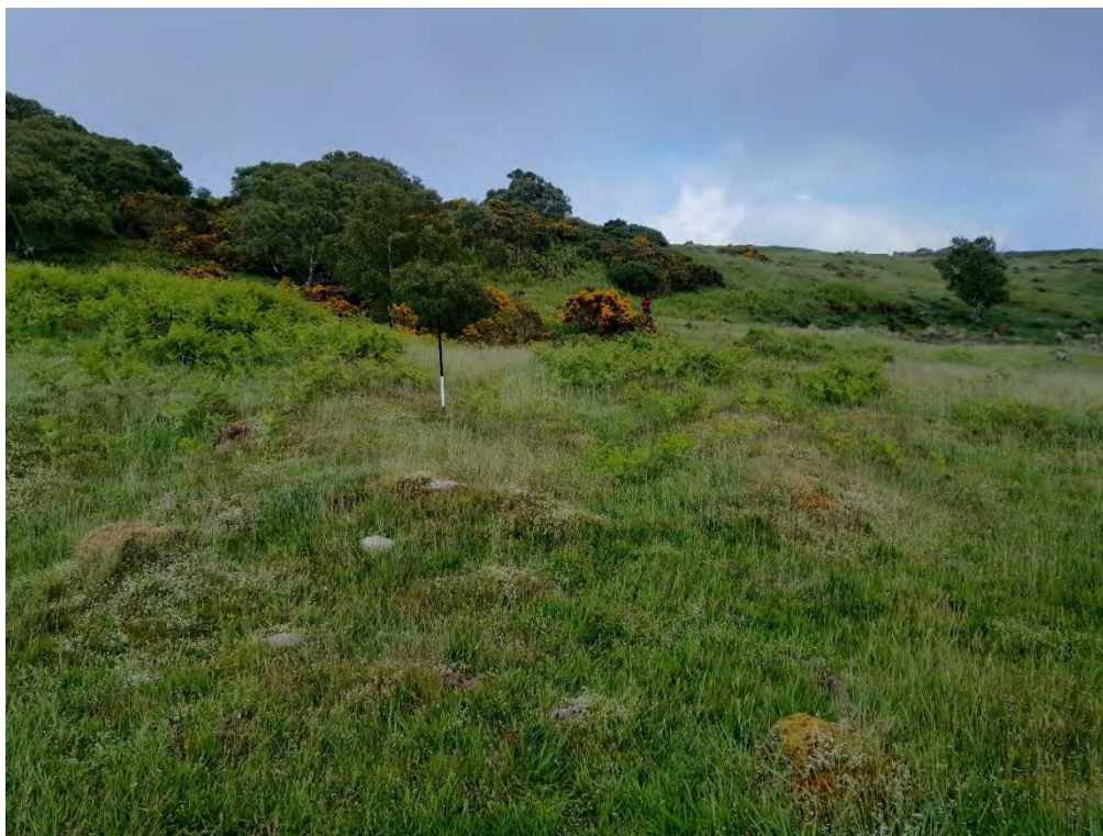
Plate 361: Building footings (Asset 500), facing west