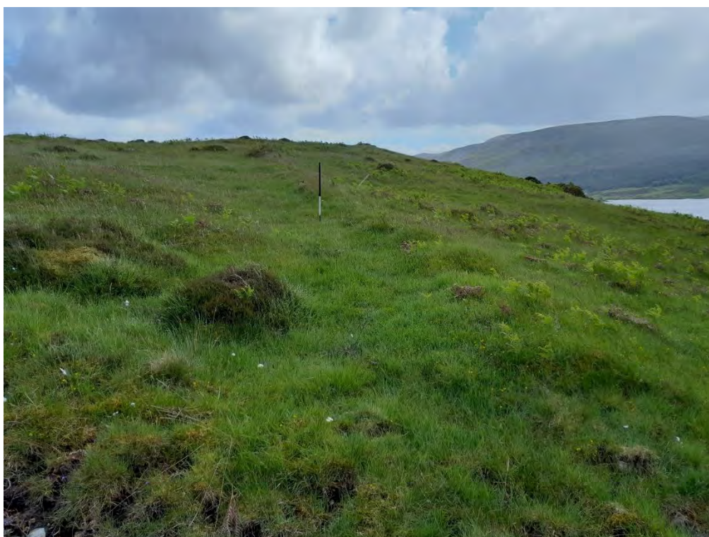
Plate 360: Dyke (Asset 498), facing south