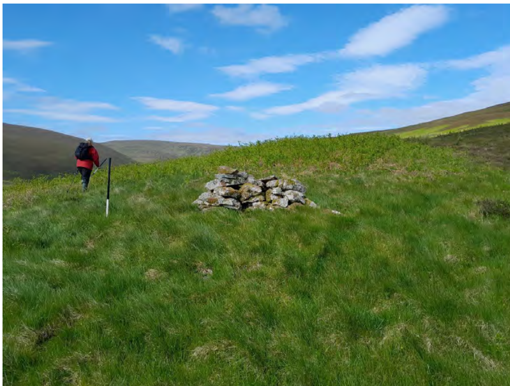
Plate 299: Navigation or marker cairn (Asset 444), facing west