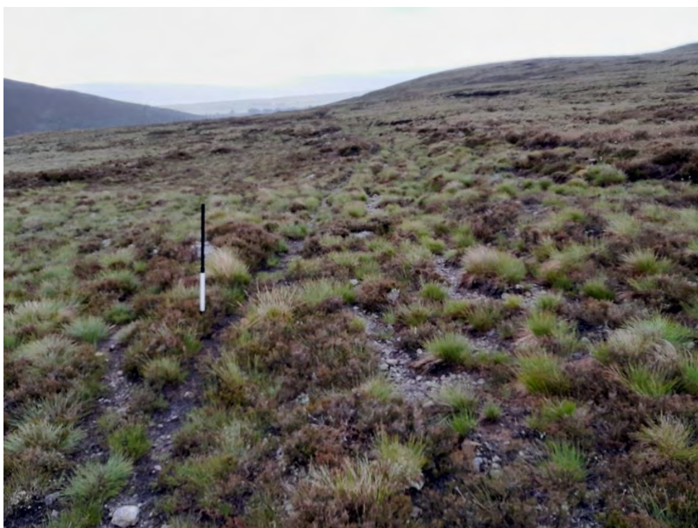
Plate 324: Track (Asset 475), facing southeast