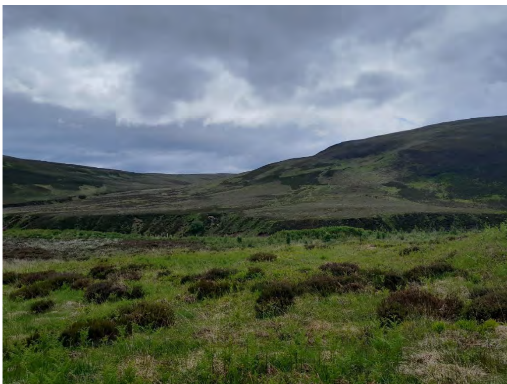
Plate 310: Hut circle (Asset 119.11; MHG10048), facing northwest