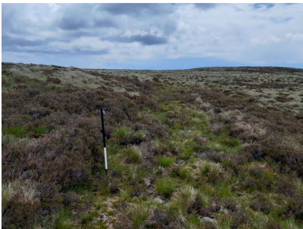
Plate 322: Track (Asset 505), facing southeast