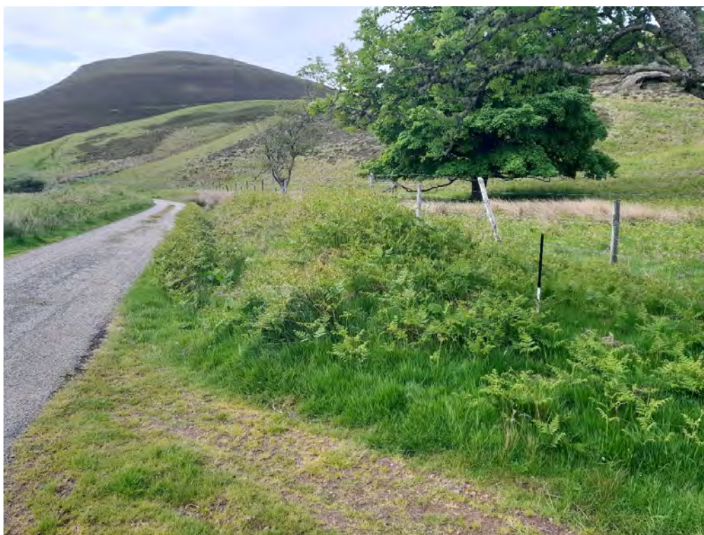
Plate 293: Dyke (Asset 441), facing southwest