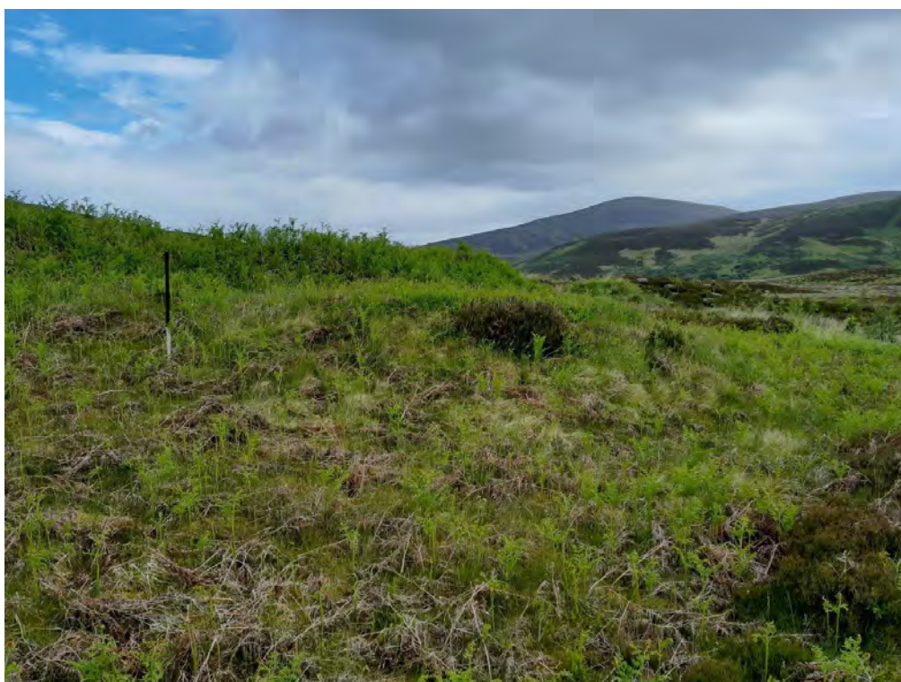
Plate 308: Clearance cairn (Asset 119.1; MHG10027), facing northeast