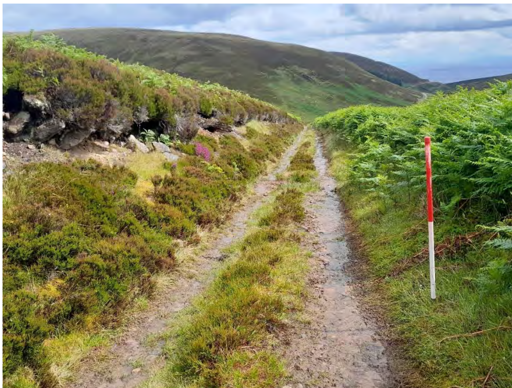
Plate 317: Track (Asset 823), facing southeast