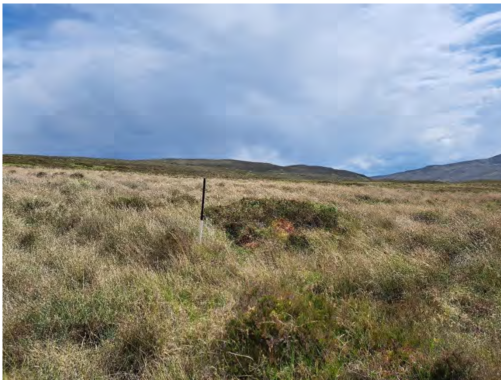
Plate 347: Clearance cairn (Asset 490.3), facing south