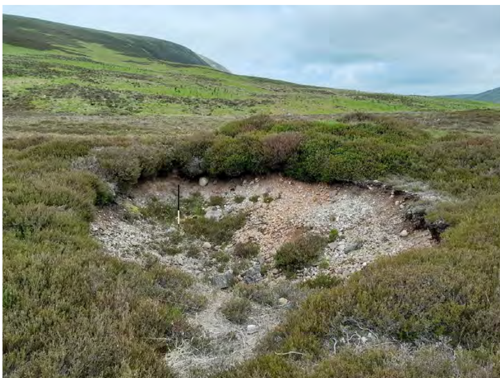
Plate 304: Borrow pit (Asset 451), facing north