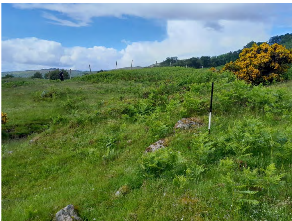
Plate 362: Corn-drying kiln (Asset 502), facing north