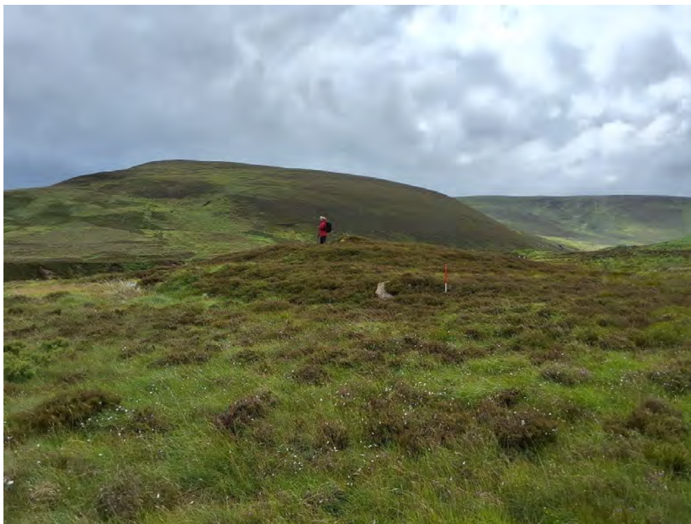
Plate 305: Mound (Asset 801), facing southwest