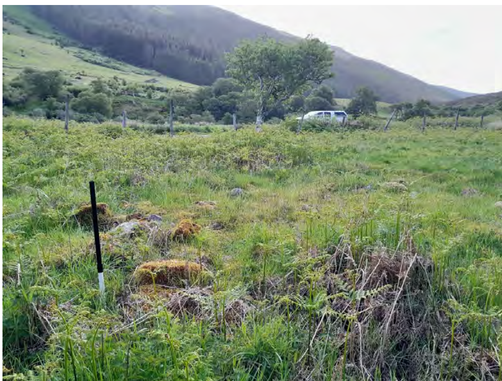
Plate 294: Structure (Asset 442), facing southeast