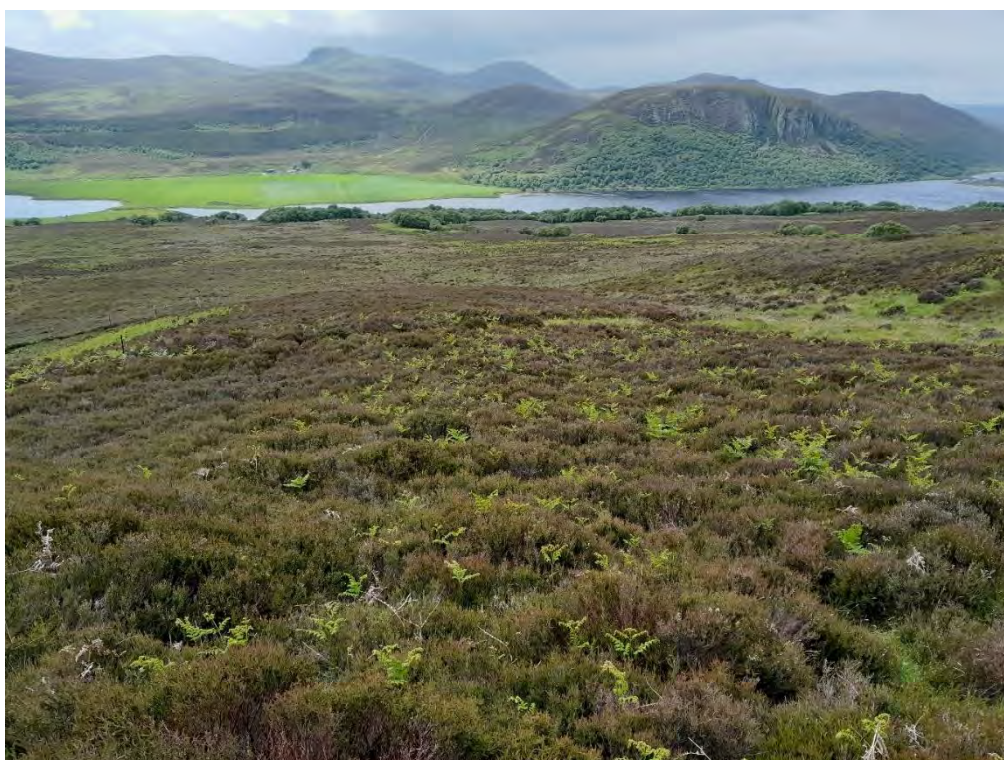
Plate 340: Dyke (Asset 486; MHG25168), facing west