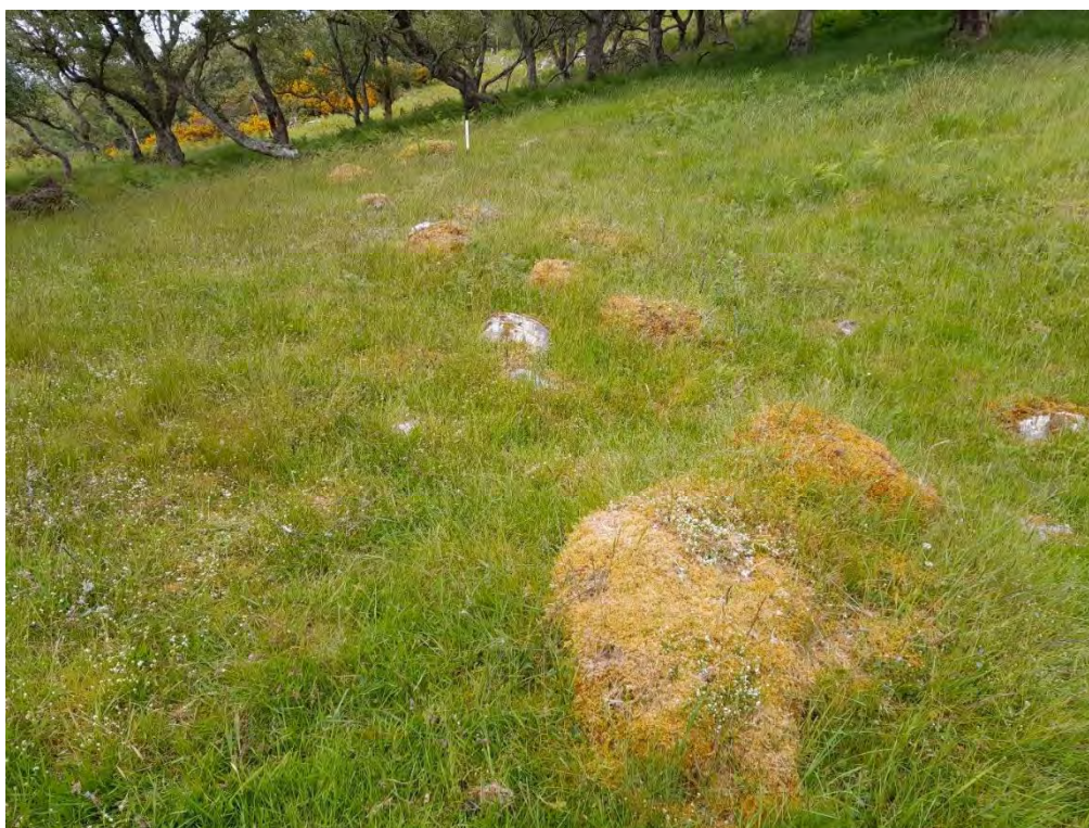
Plate 355: Dyke (Asset 494), facing north