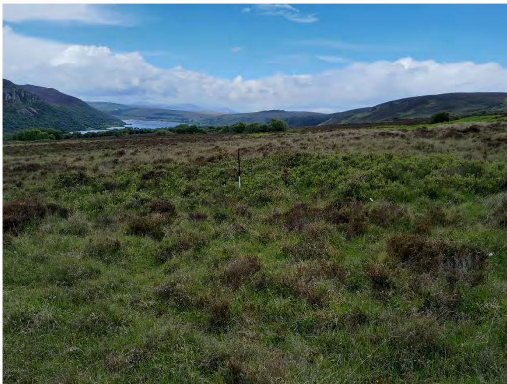
Plate 343: Hut circle (Asset 489), facing northwest