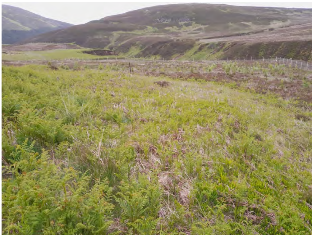
Plate 307: Hut circle (Asset 119.2; MHG10027), facing southeast