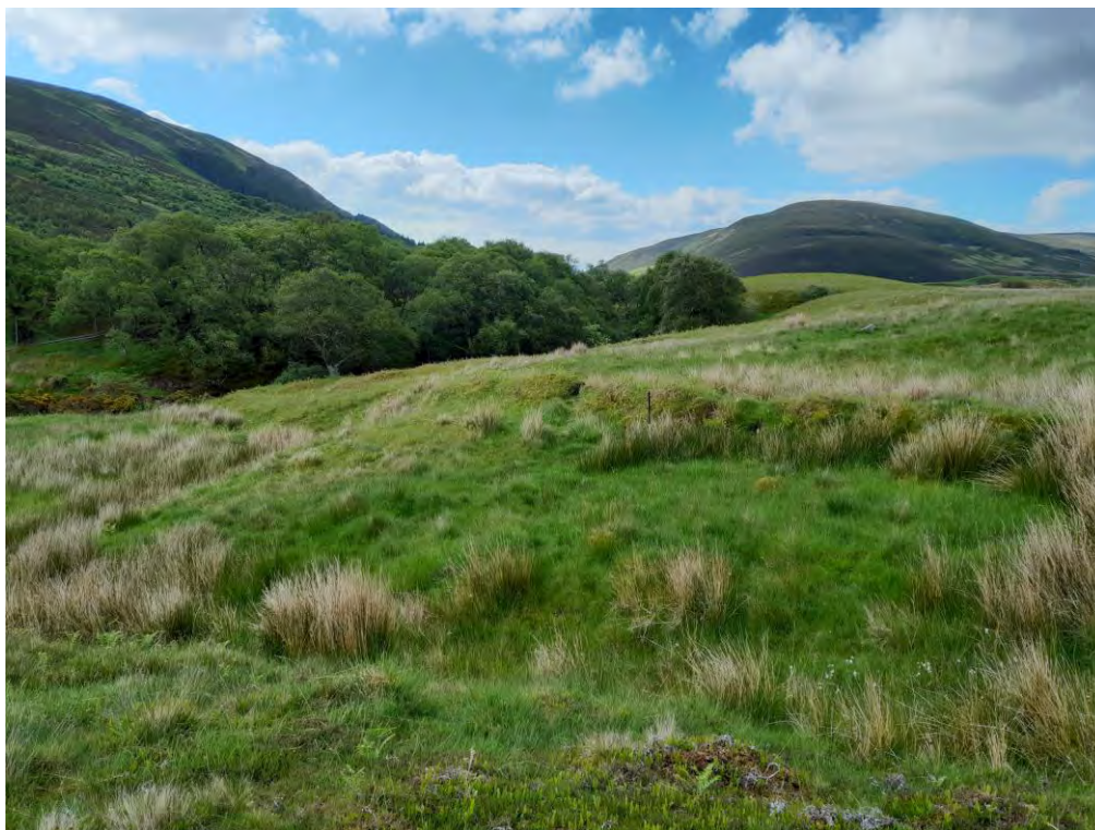
Plate 291: Dyke (Asset 424), facing south