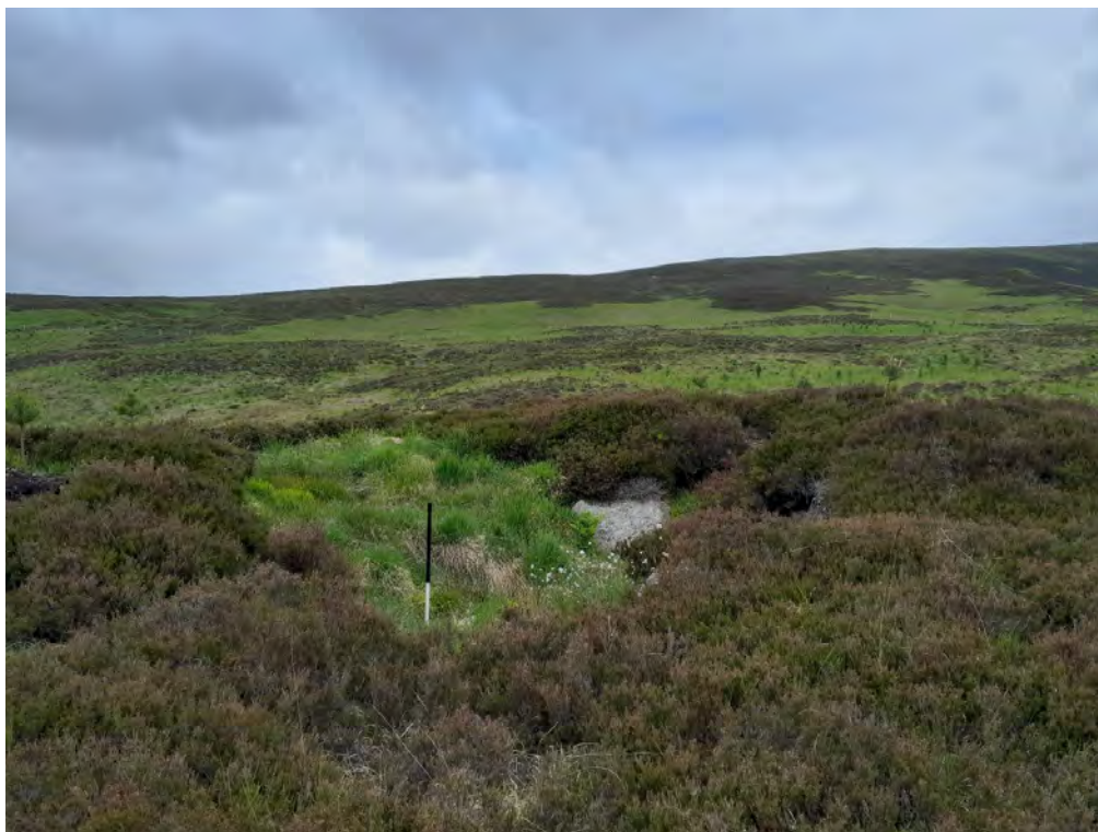
Plate 303: Borrow pit (Asset 449), facing northwest