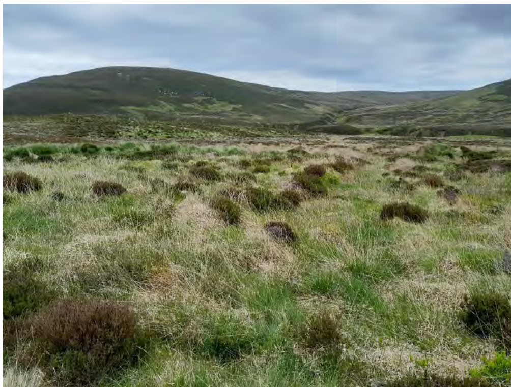
Plate 301: Dyke (Asset 447), facing south#