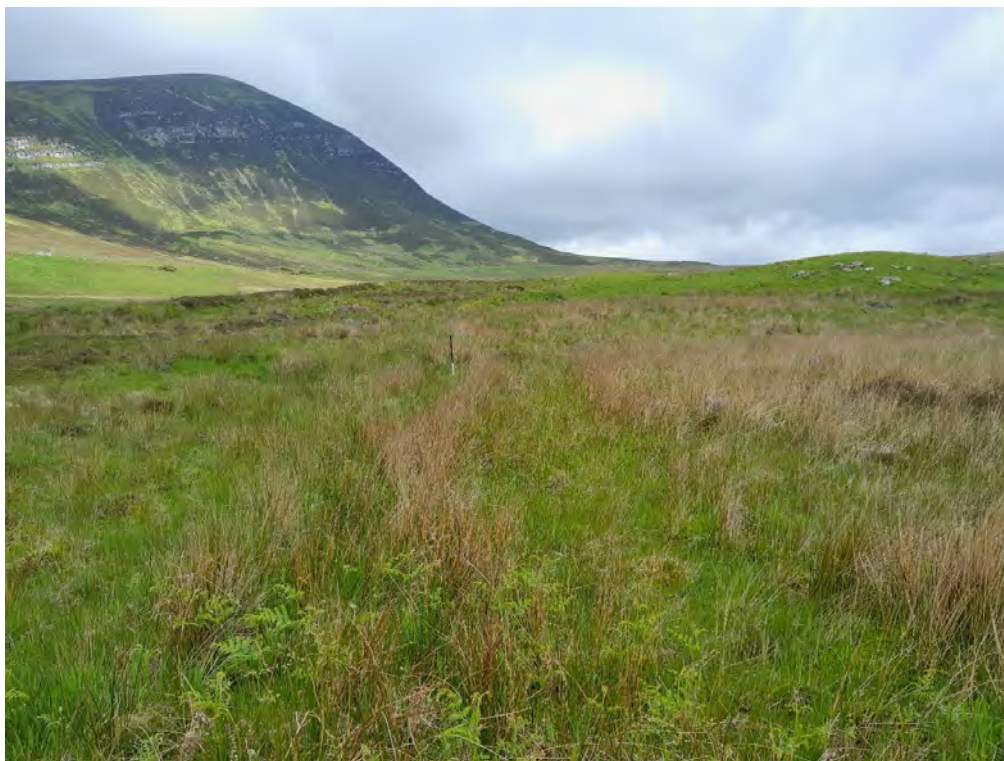
Plate 281: Dyke (Asset 961), facing north