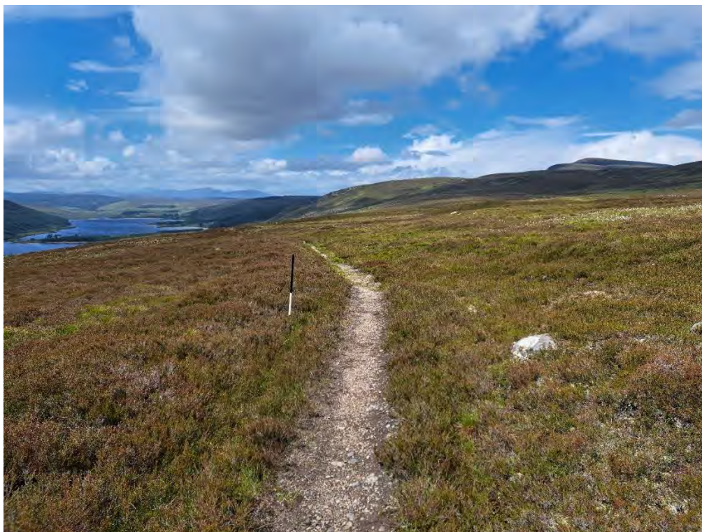
Plate 337: Track (Asset 485; MHG30283), facing northwest