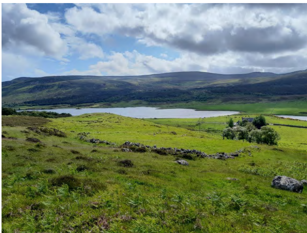
Plate 356: Enclosure (Asset 495), facing southwest