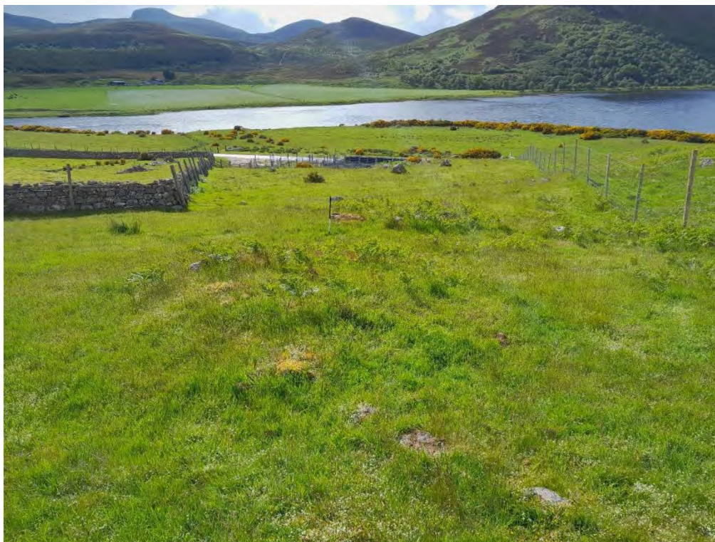
Plate 363: Mounds (Assets 501.1; front, and 501.2; back), facing southwest