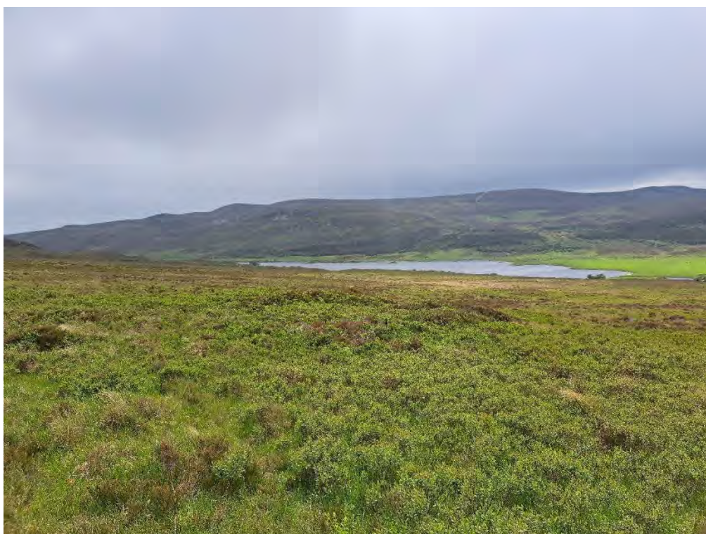
Plate 342: Hut circle (Asset 488), facing southwest