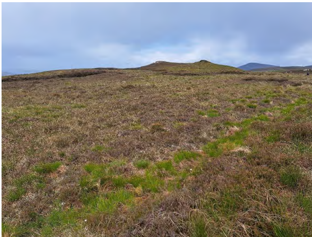
Plate 329: Peat cutting (Asset 480.4), facing northwest