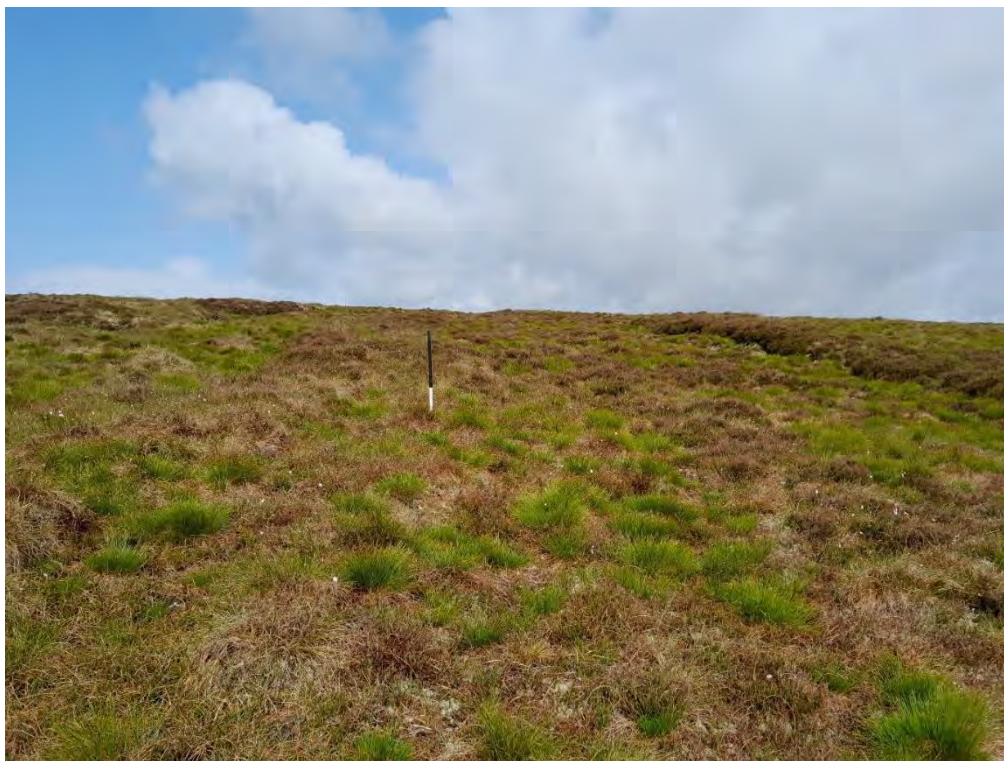
Plate 323: Peat cutting (Asset 477), facing west