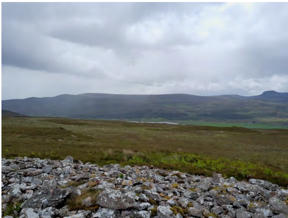
Plate 335: View from Killin broch (Asset 121) to Carrol broch (Asset 63; SM1846; centre right), facing southwest