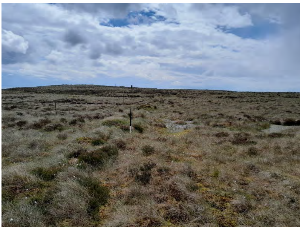
Plate 320: Dyke (Asset 506) delineating the Loth (left) and Clyne (right) parishes, facing southeast