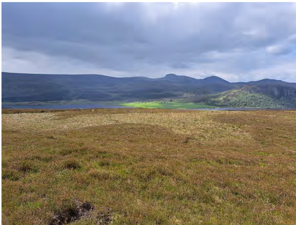
Plate 339: Peat cutting (Asset 491), facing west