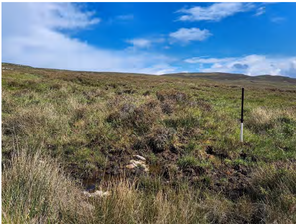
Plate 351: Clearance cairn (Asset 490.7), facing south