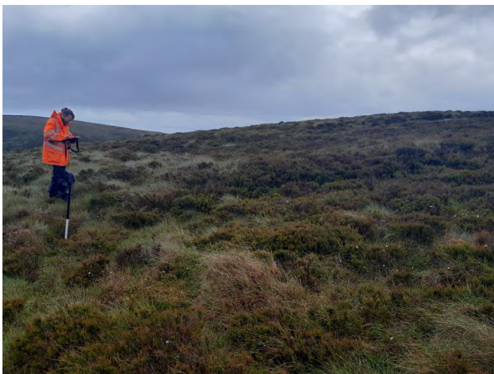
Plate 316: Peat cutting (Asset 822), facing southeast