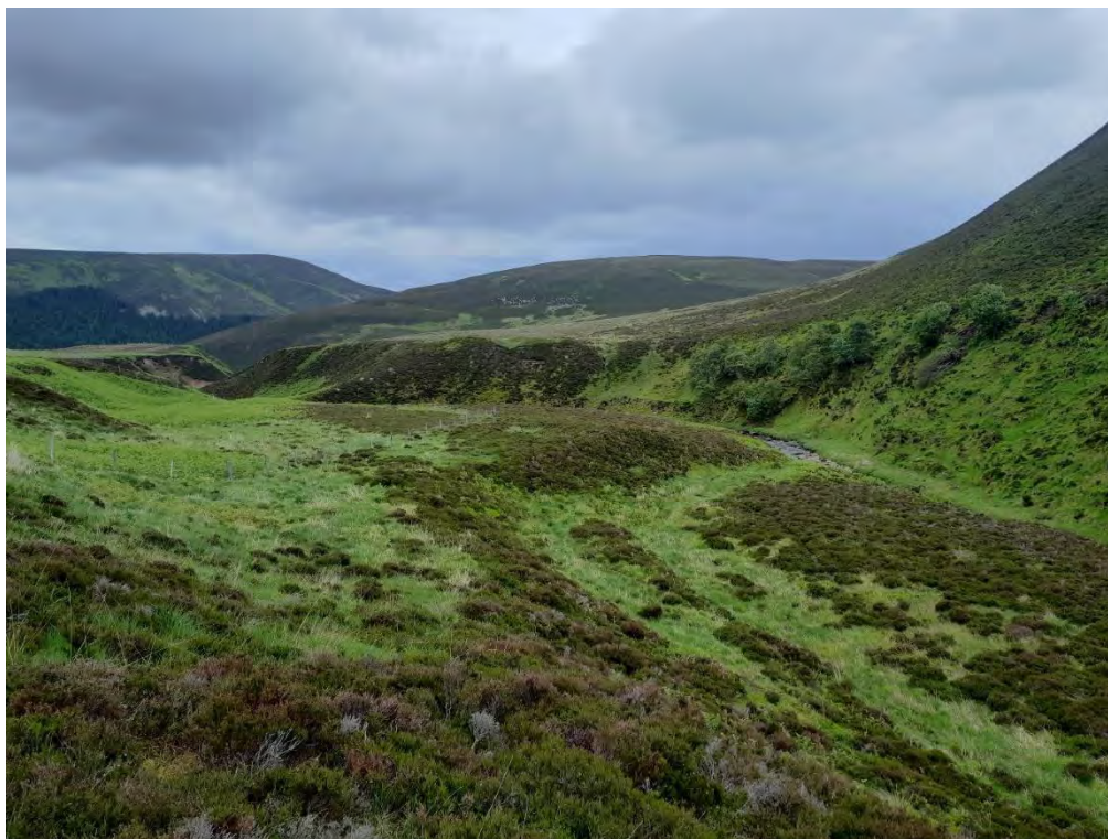
Plate 313: Hut circle (Asset 118; MHG10049) atop terrace (centre left), facing southeast