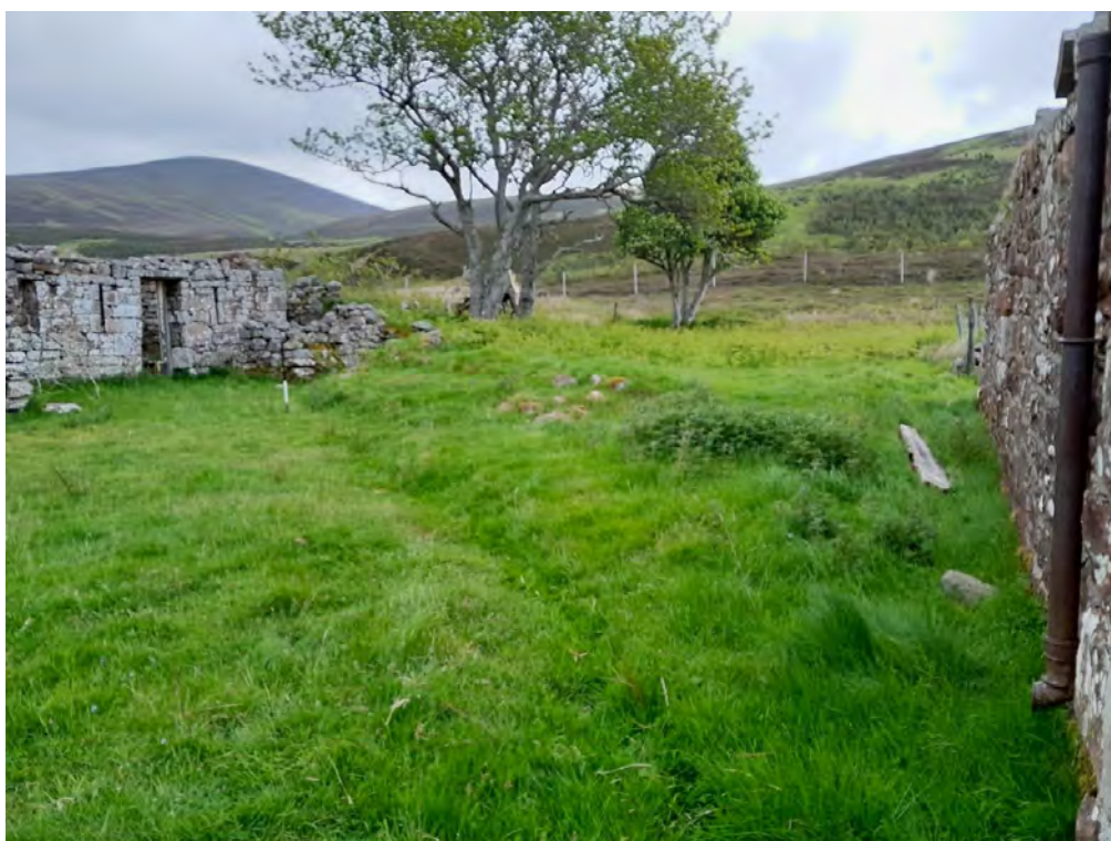
Plate 288: Clearance/rubble (Asset 211.9), facing northeast