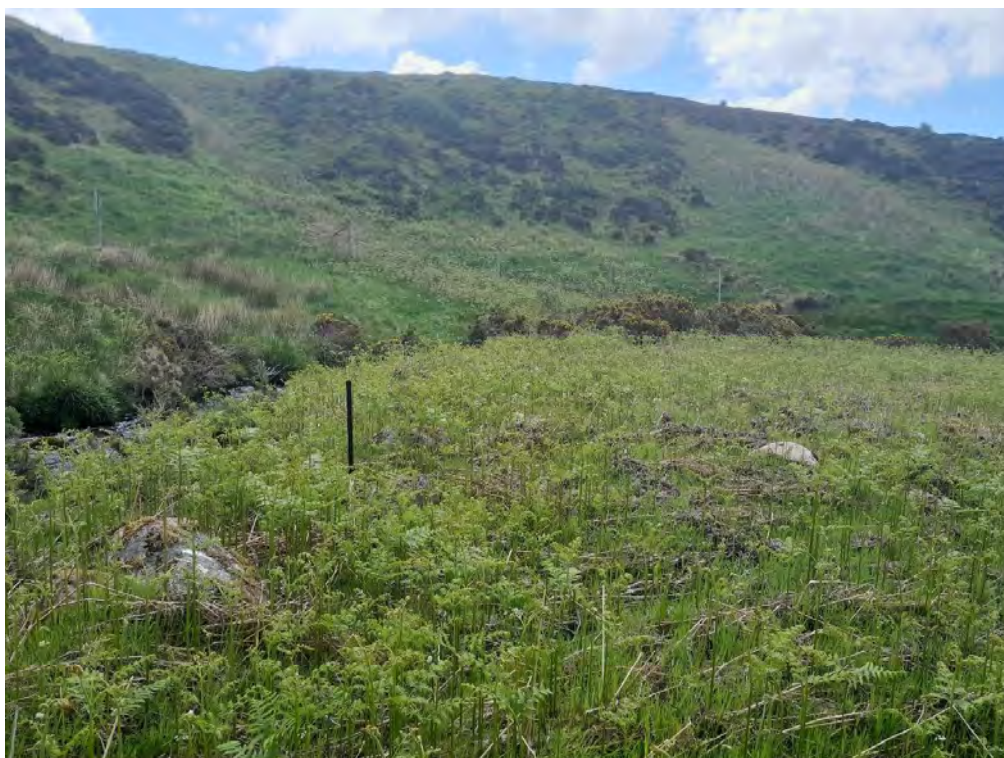
Plate 278: Dyke (Asset 427), facing east