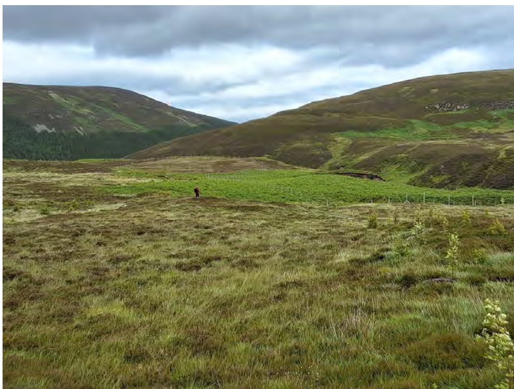
Plate 306: Hut circle (Asset 802), facing east