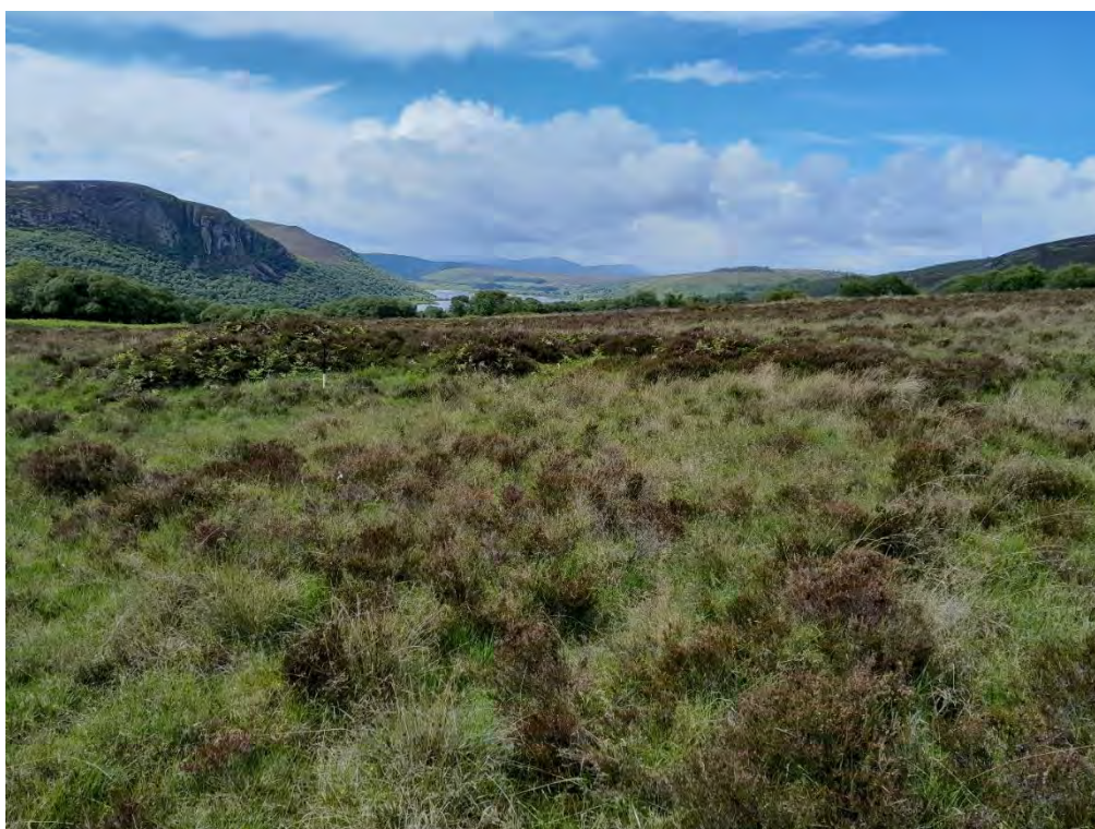
Plate 344: Possible burnt mound (Asset 490.1), facing northwest