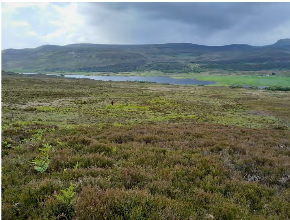
Plate 341: Hut circle (Asset 487), facing southwest