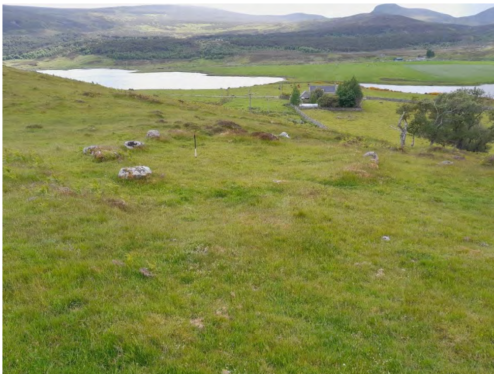
Plate 357: Enclosure (Asset 496), facing southwest