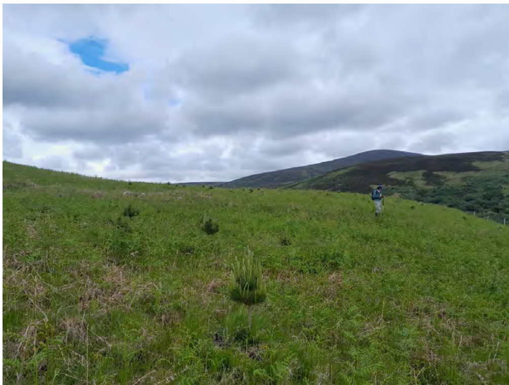
Plate 297: Dyke (Asset 453), facing northeast