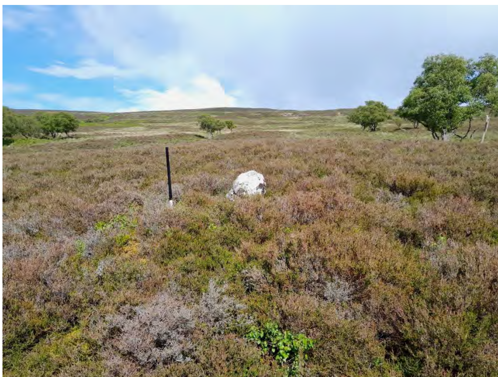
Plate 352: Clearance cairn (Asset 490.10), facing east