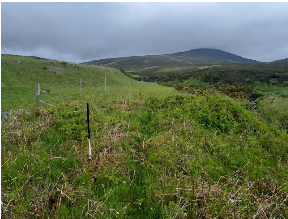
Plate 275: Clearance or kiln-construction material (Asset 428.5), facing northeast