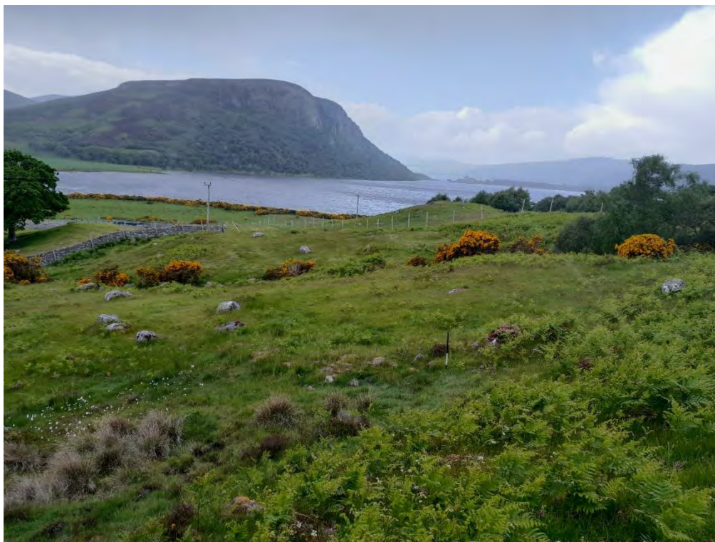
Plate 359: Enclosure (Asset 499), facing northeast