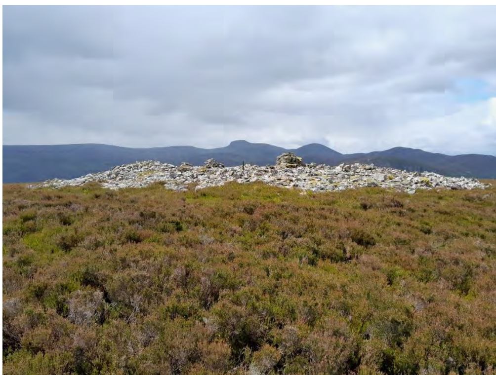
Plate 334: Killin broch (Asset 121), facing southwest