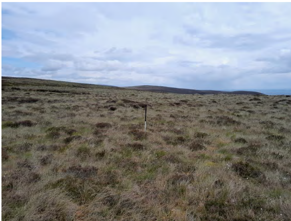
Plate 319: Peat cutting (Asset 504.2), facing northeast