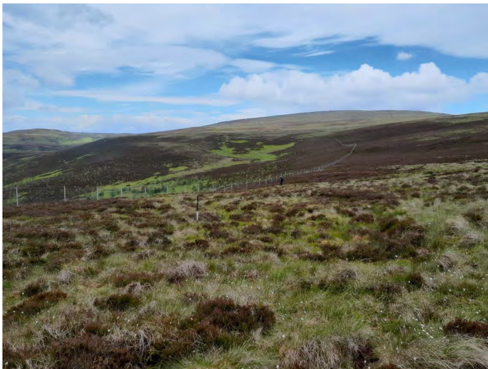
Plate 321: Peat cutting (Asset 504.1), facing north-northwest