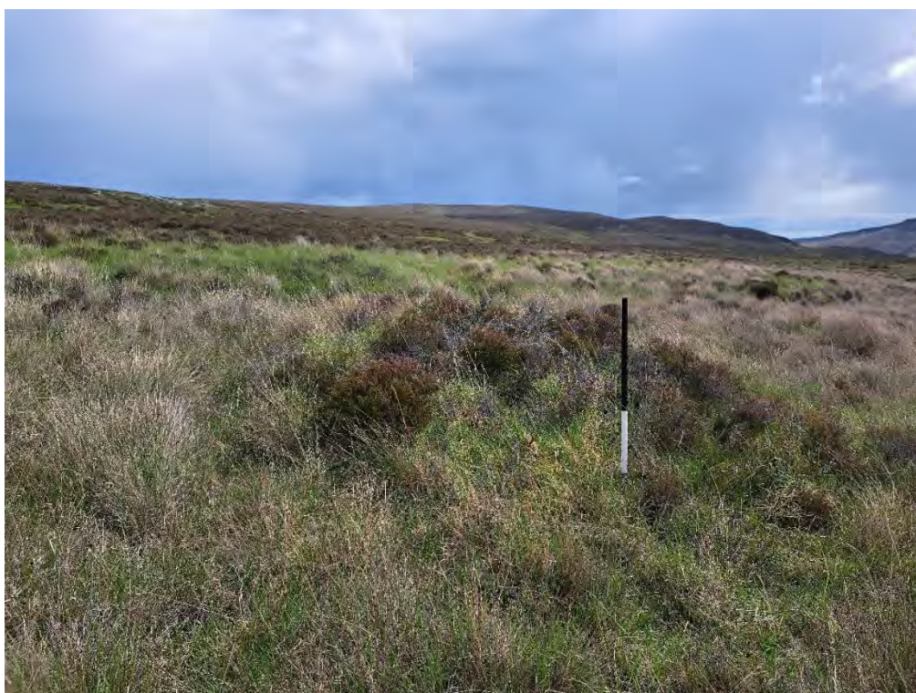
Plate 346: Clearance cairn (Asset 490.2), facing southeast