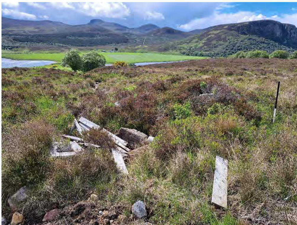
Plate 353: Modern cistern (Asset 492.1; left) and associated mound (Asset 492.2; right), facing west