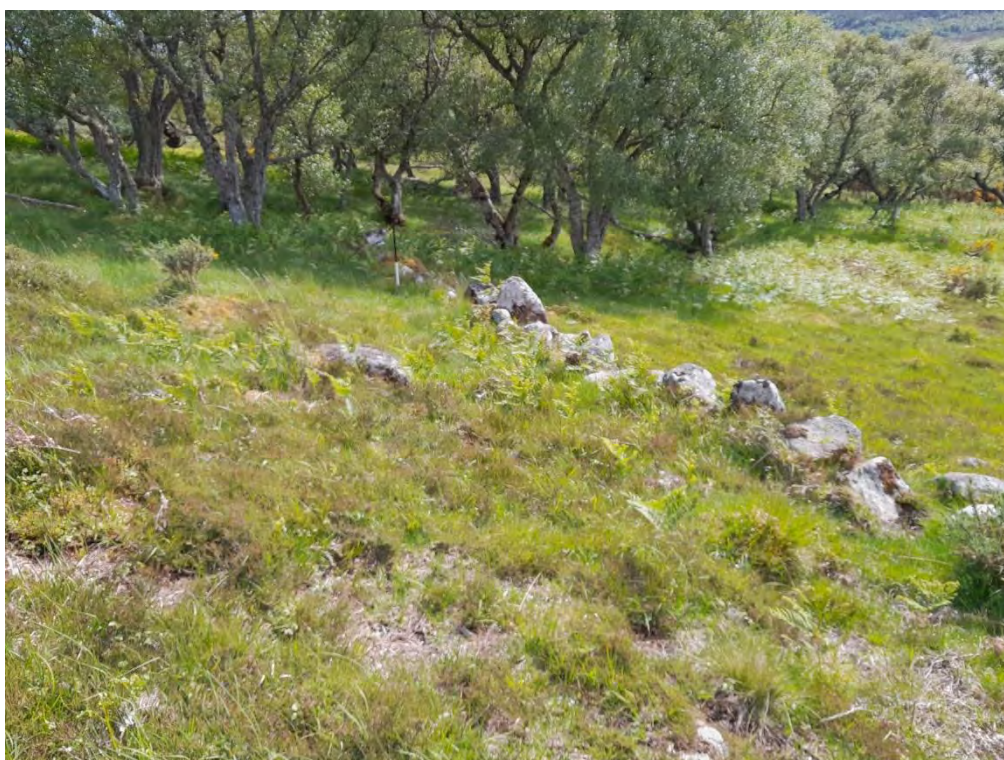
Plate 354: Dyke (Asset 493), facing southwest