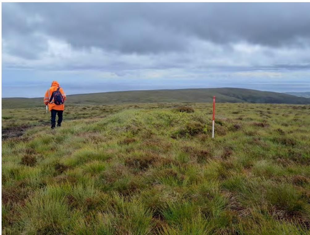
Plate 315: Track (Asset 959; left) and possible navigation mound (Asset 821; right), facing southeast