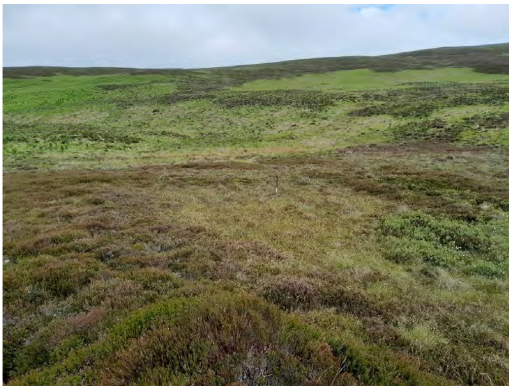
Plate 302: Enclosure (Asset 450), facing northwest