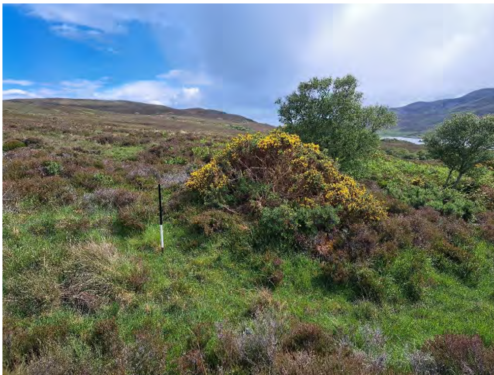
Plate 345: Possible burnt mound (Asset 490.8), facing southeast