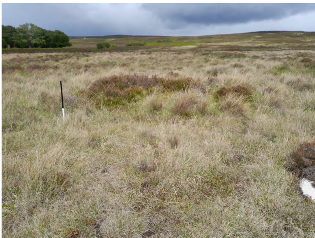
Plate 350: Clearance cairn (Asset 490.6), facing northeast