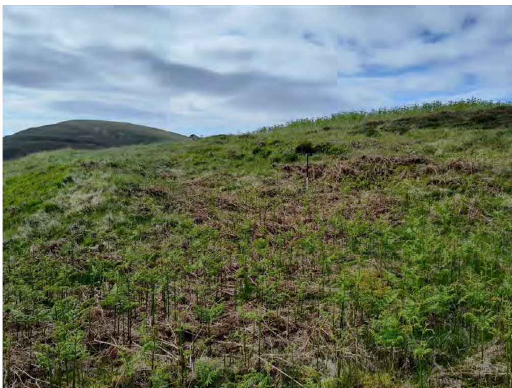
Plate 296: Possible corn-drying kiln (Asset 443.2), facing south