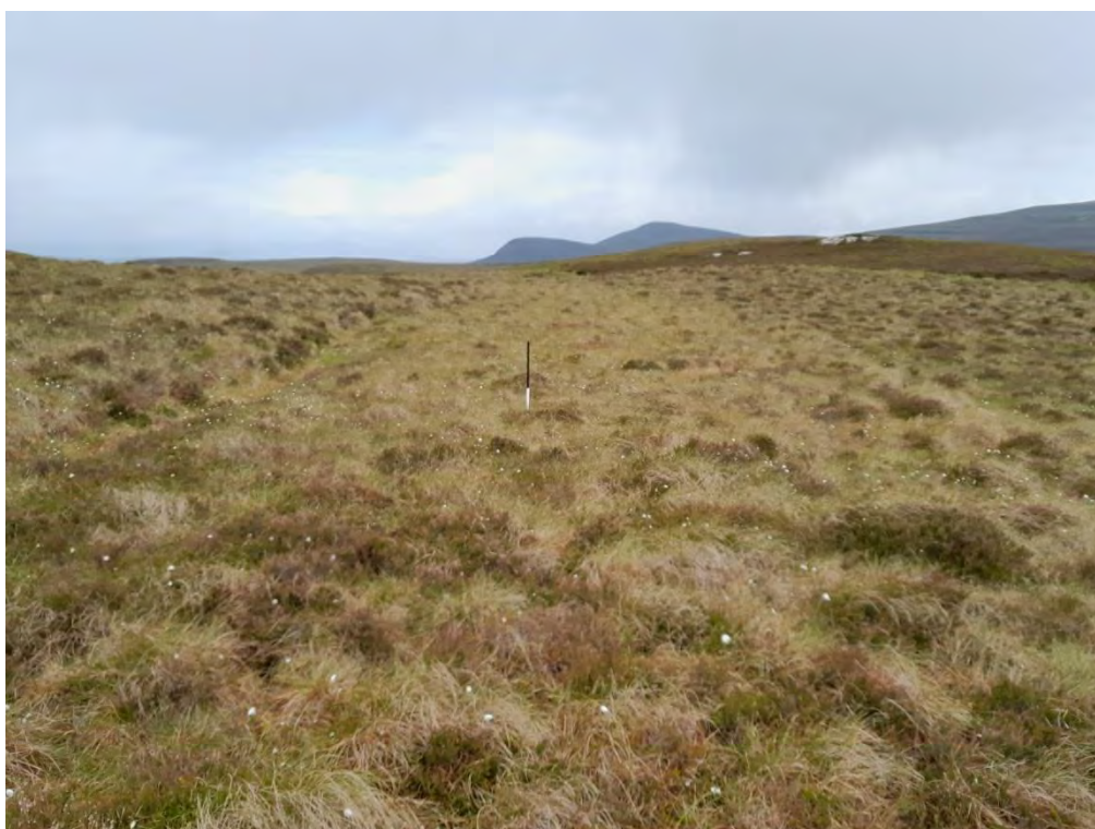
Plate 328: Peat cutting (Asset 480.3), facing northwest