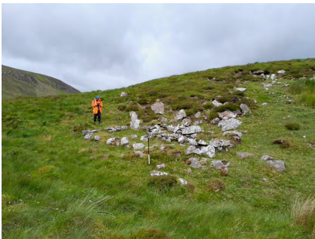
Plate 314: Structure (Asset 820), facing northwest