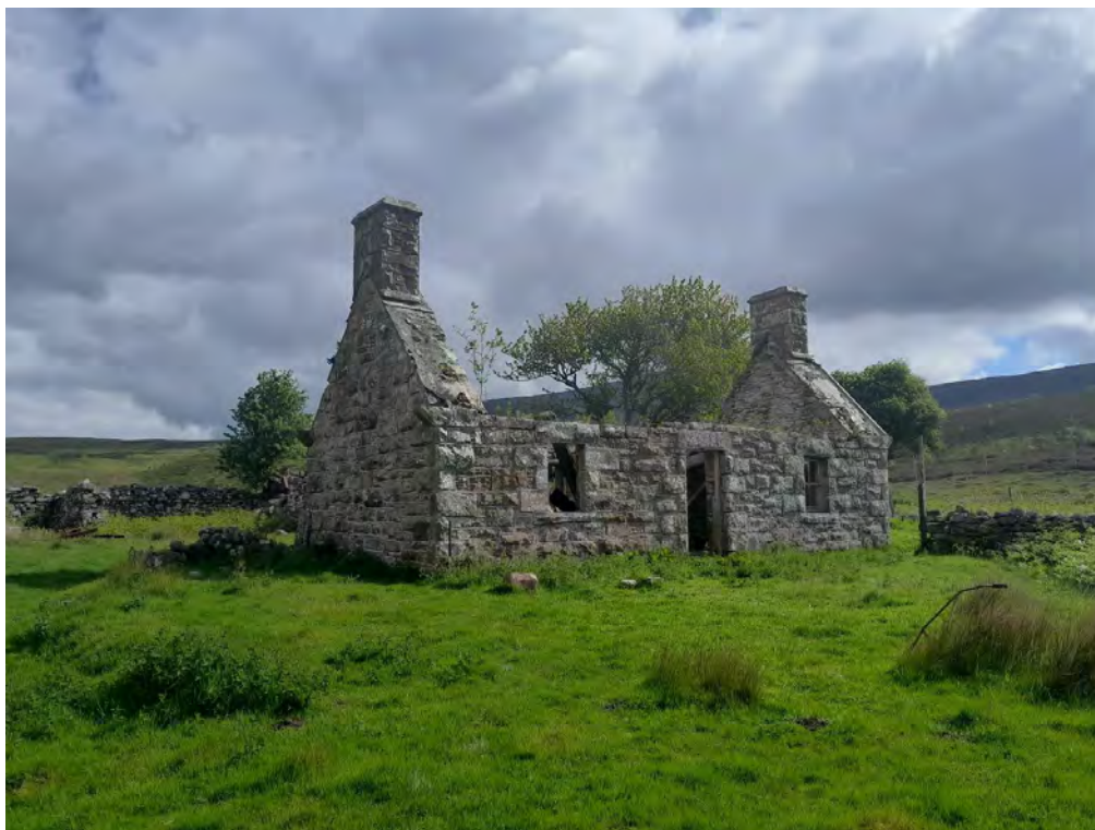
Plate 283: Building (Asset 211.1), facing northeast