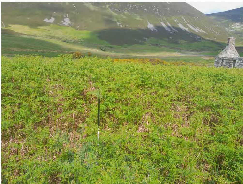
Plate 289: Possible structure (Asset 211.10) below bracken, facing west