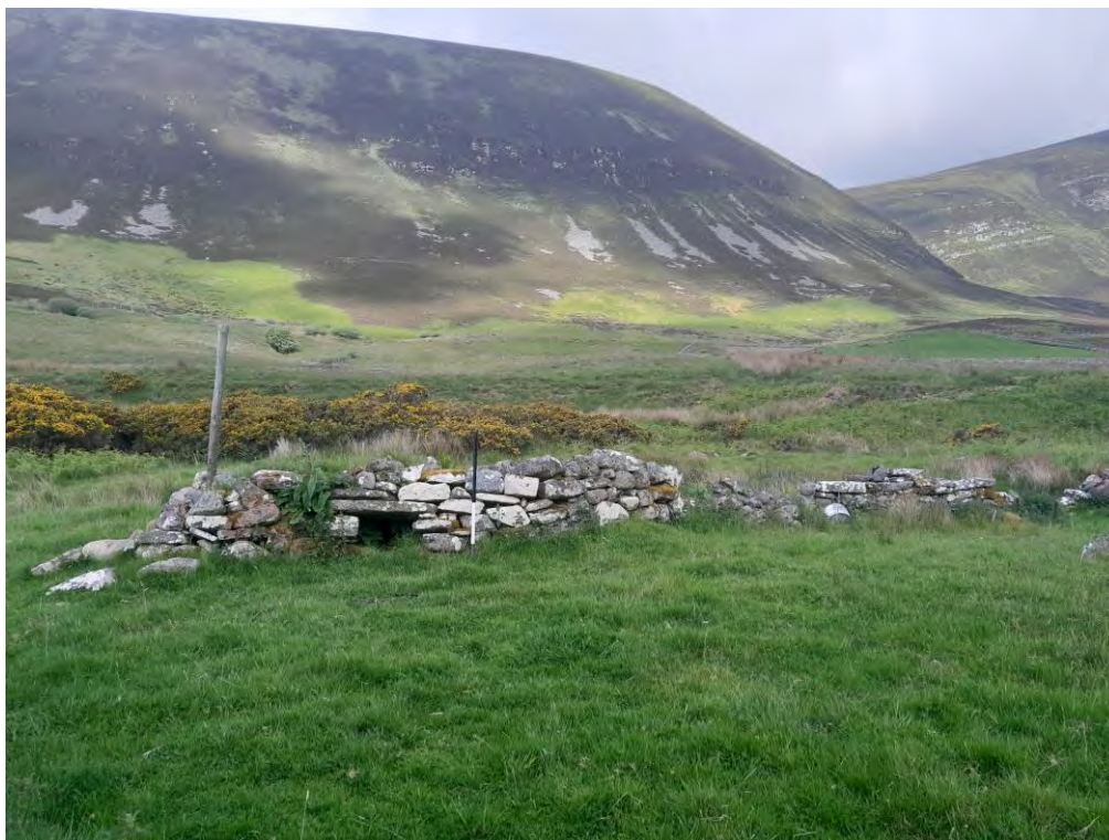
Plate 285: Dyke (Asset 211.6 (right)) and possible elements of a corn-drying kiln (Asset 211.5 (left)) incorporated into this at the south end, facing northwest