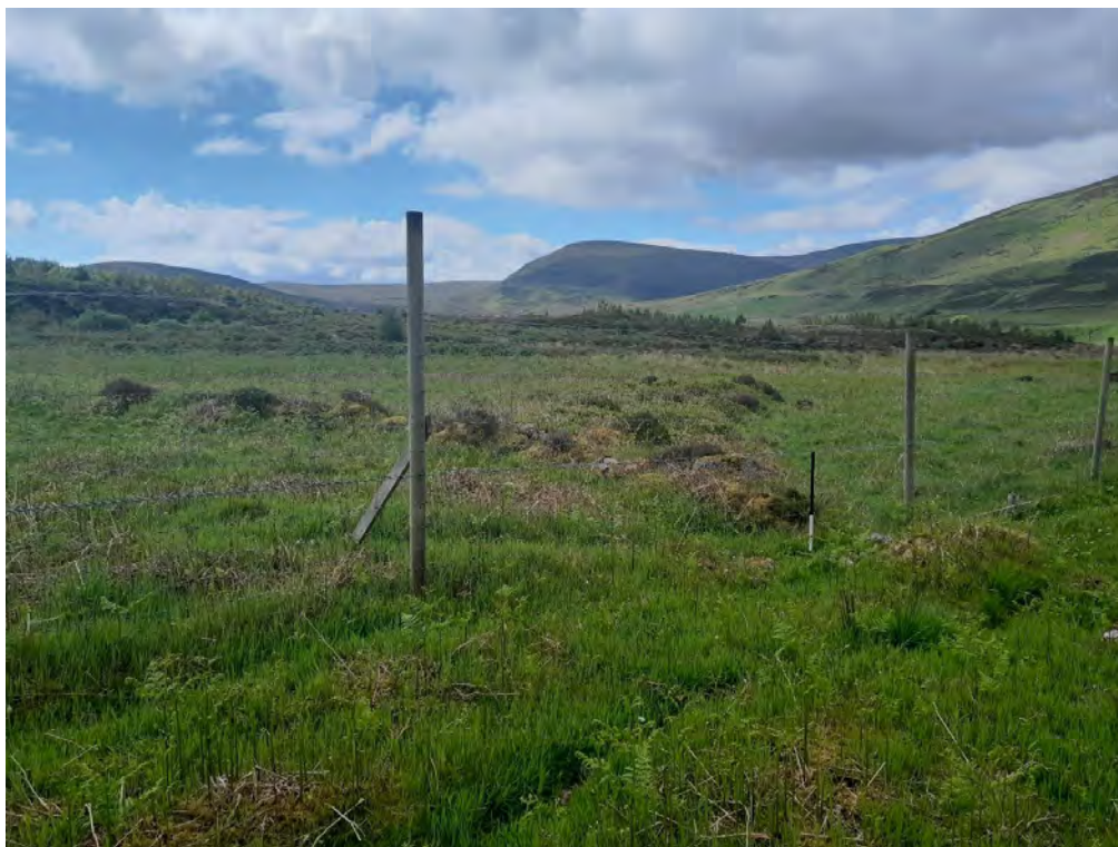
Plate 279: Dyke (Asset 426), facing southwest