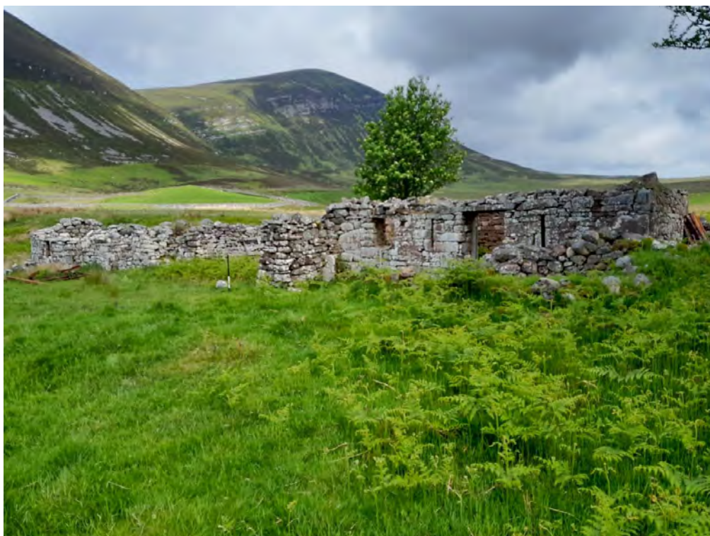
Plate 284: Outbuildings (Assets 211.3 (left) and 211.4 (right)), facing northwest