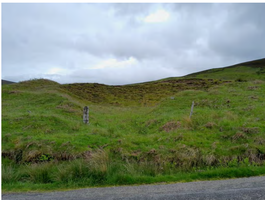
Plate 292: Borrow pit (Asset 456.1) and surrounding bund (Asset 456.2), facing southwest