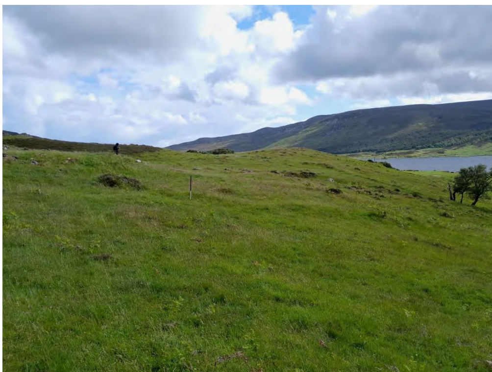
Plate 358: Enclosure (Asset 497), facing south