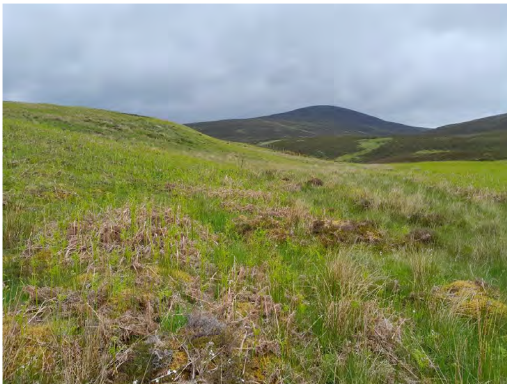
Plate 277: Dyke (Asset 430), facing northeast