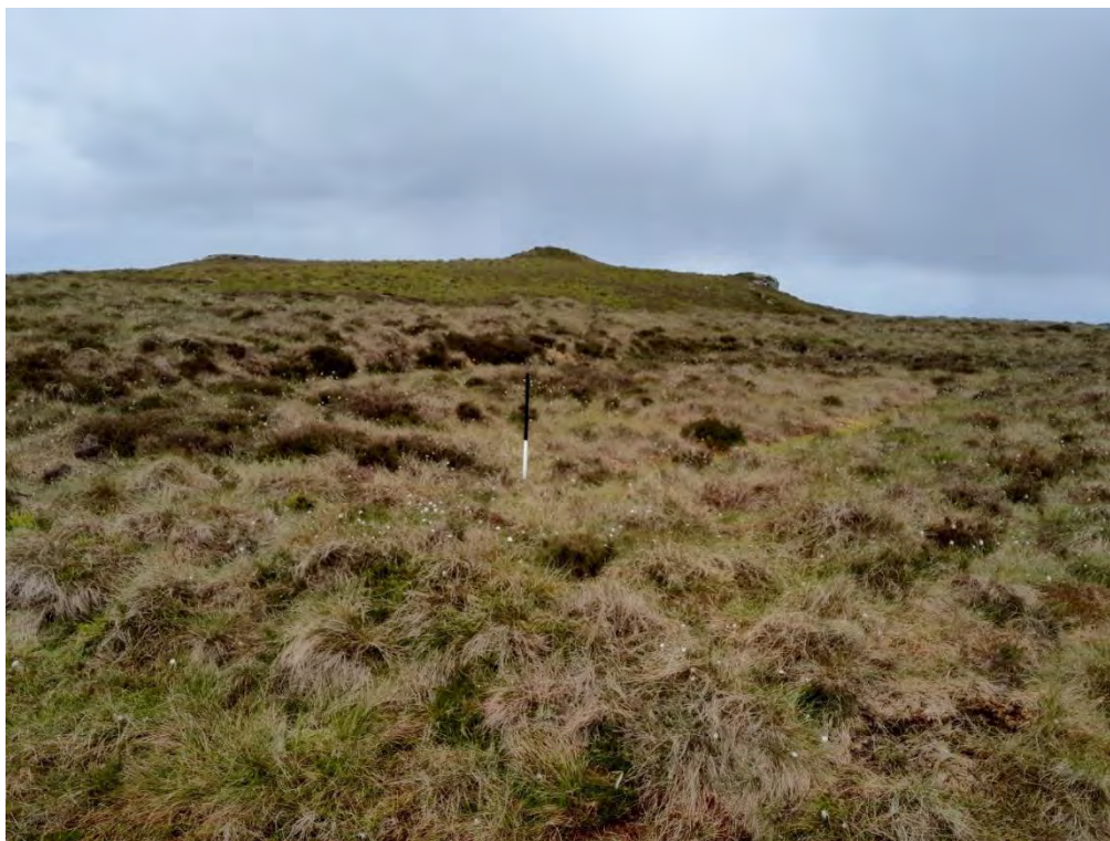
Plate 327: Peat cutting (Asset 480.2), facing northwest