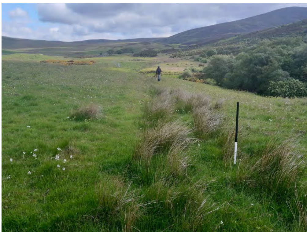
Plate 290: Track (Asset 423) to farmstead (Asset 211; MHG54757), facing northeast