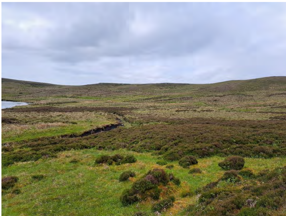
Plate 331: Peat cutting (Asset 481.1) around An Dubh-lochan, facing southwest