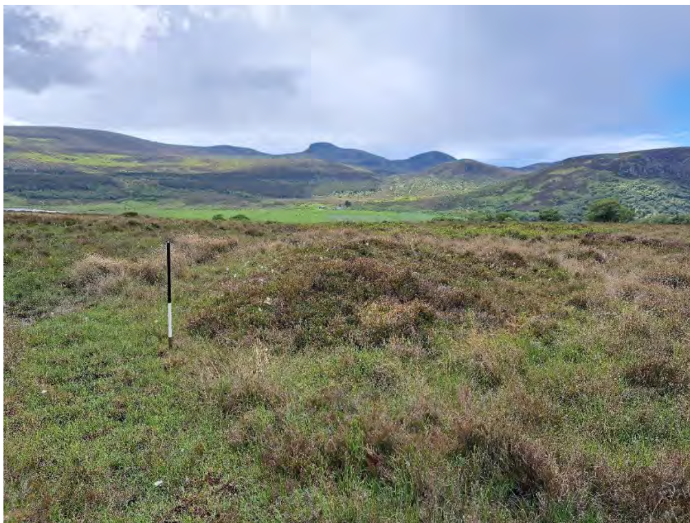
Plate 349: Clearance cairn (Asset 490.5), facing southwest