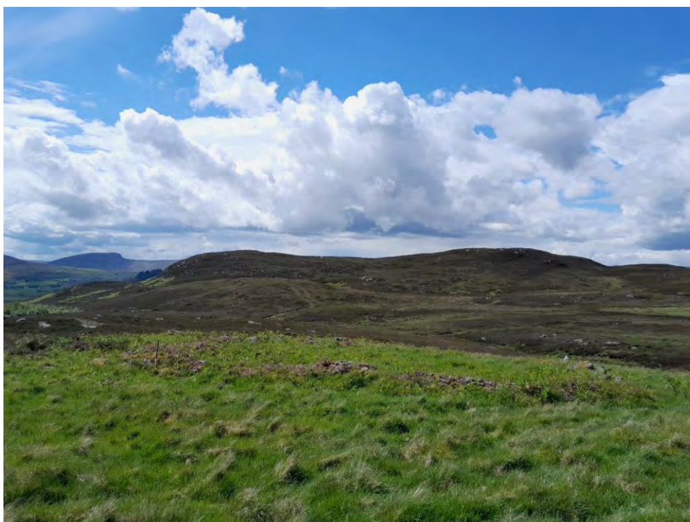
Plate 450: Enclosure (Asset 387.13), facing southwest