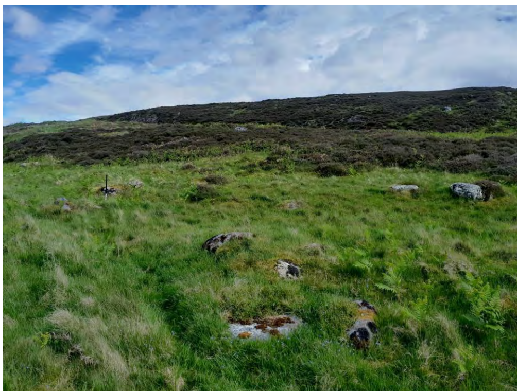
Plate 446: Enclosure (Asset 387.9), facing northwest