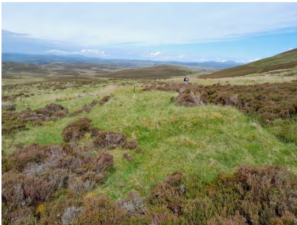
Plate 407: Building footings (Asset 391.5), facing west