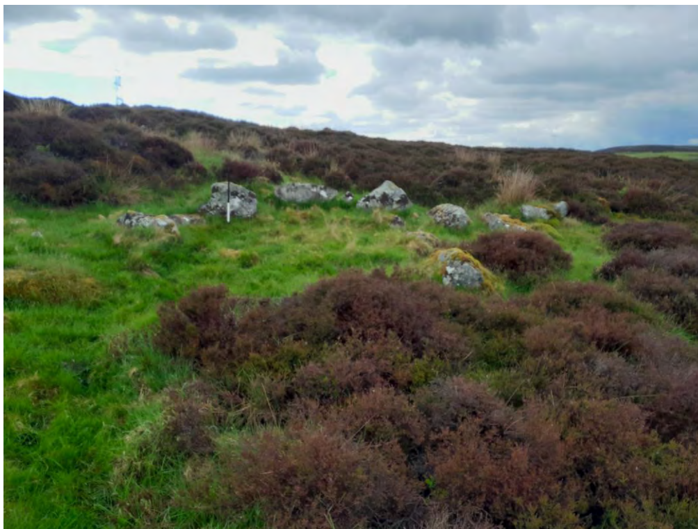
Plate 455: Enclosure (Asset 421), facing west