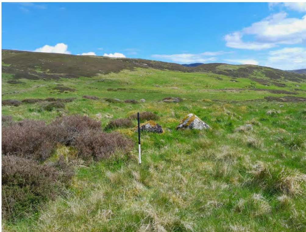
Plate 457: Dyke (Asset 388.8), facing northeast