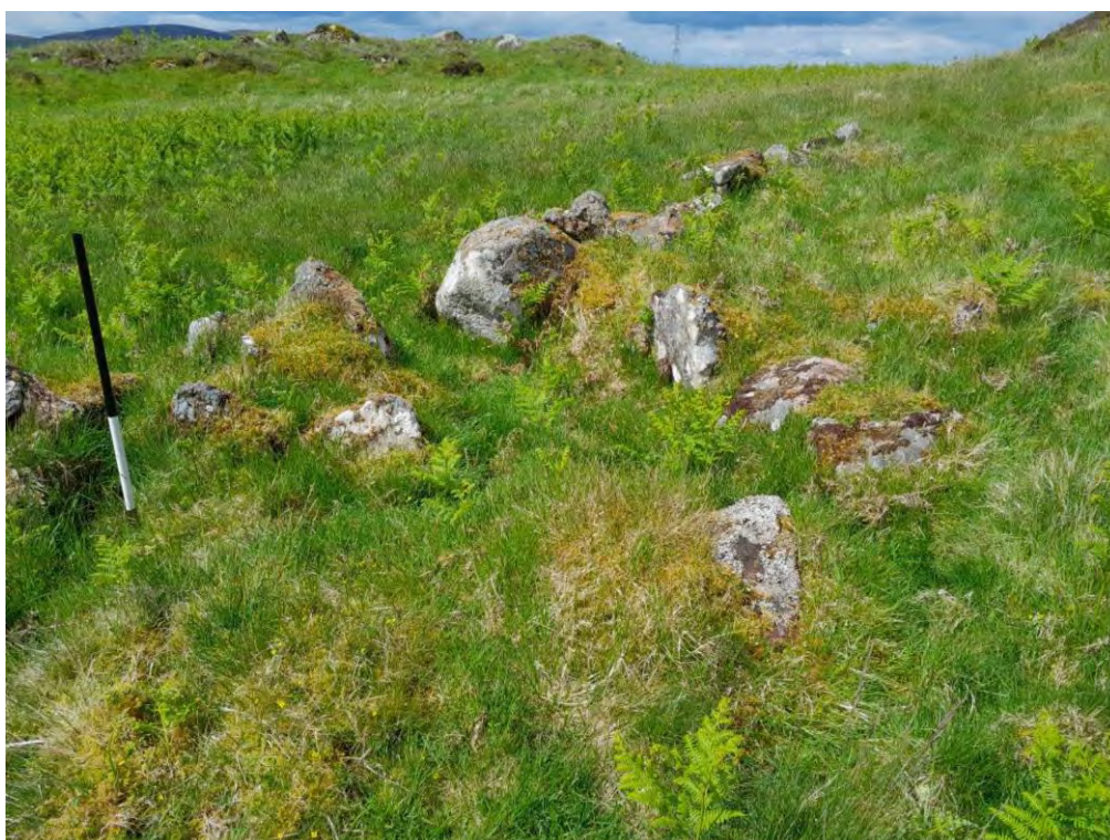
Plate 438: Entrance (Asset 387.11) over head dyke (Asset 387.1), facing east