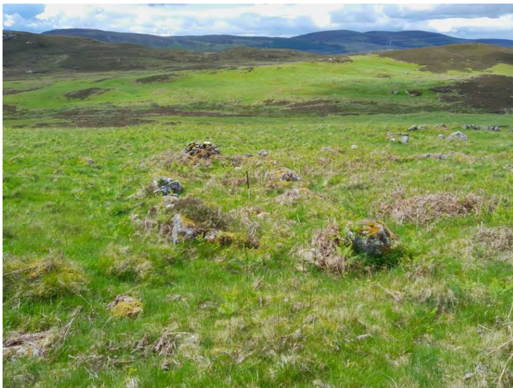
Plate 443: Building footings (Asset 387.16), facing south