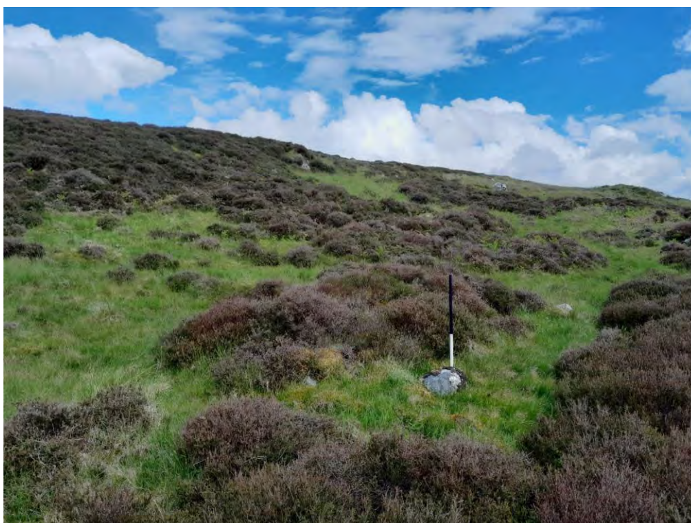
Plate 434: Clearance cairn (Asset 385.5; MHG11115), facing north