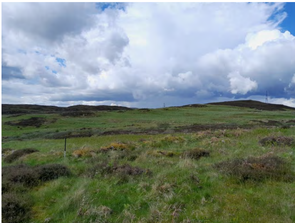
Plate 453: Enclosure (Asset 183.1), facing west