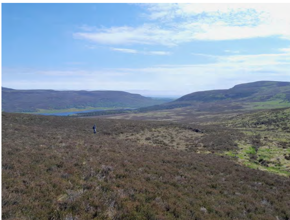
Plate 374: Peat cutting (Asset 381), facing northeast