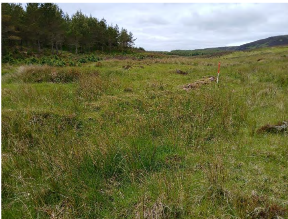
Plate 393: Dyke (Asset 602), facing northwest