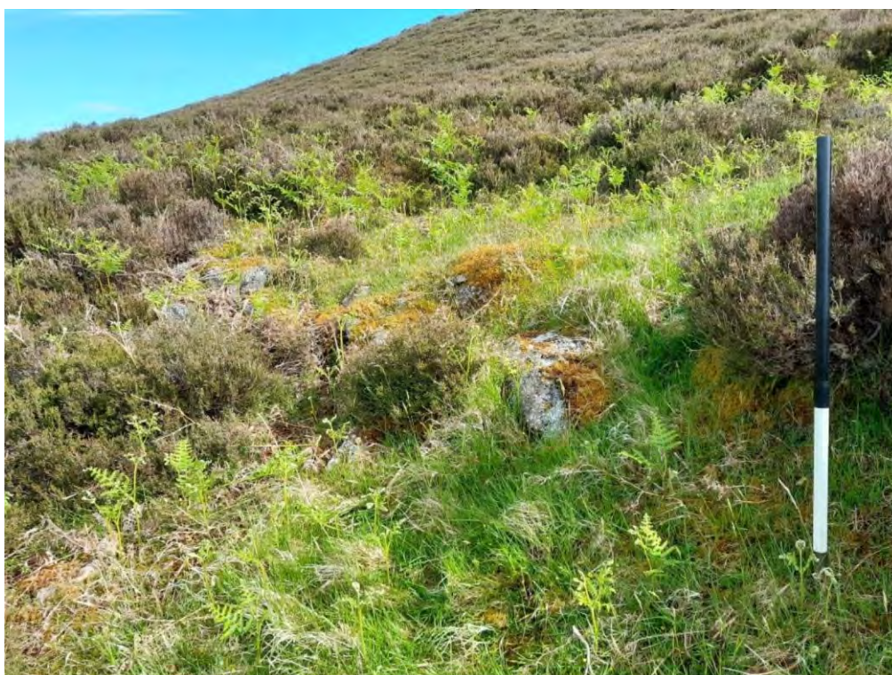
Plate 406: Enclosure (Asset 391.3), facing northwest