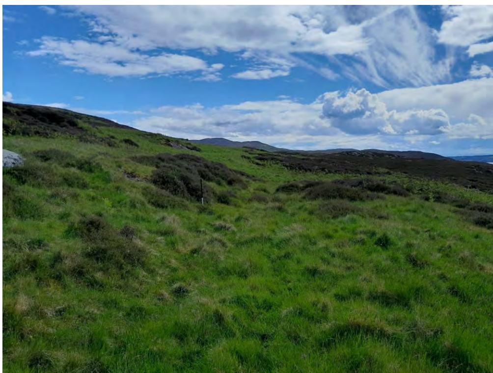
Plate 452: Track (Asset 387.14), facing southeast