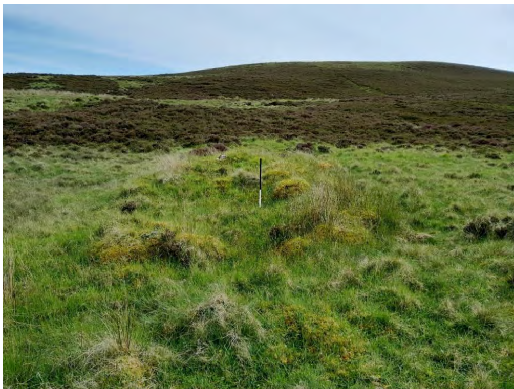
Plate 411: Corn-drying kiln (Asset 391.6), facing east