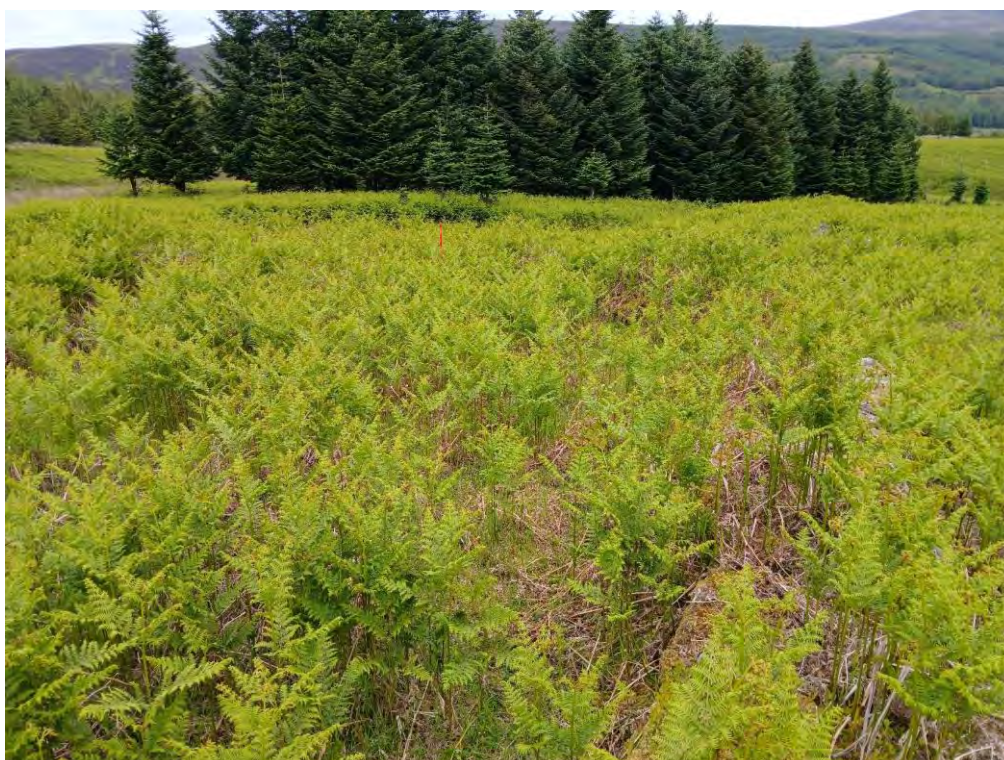
Plate 400: Possible structure or enclosure (Asset 138.1; MHG10395), facing north