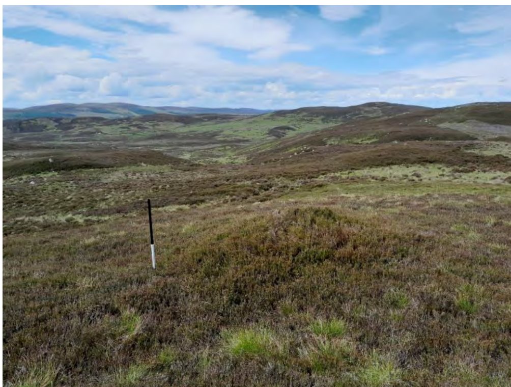
Plate 420: Clearance cairn (Asset 393.2), facing northwest