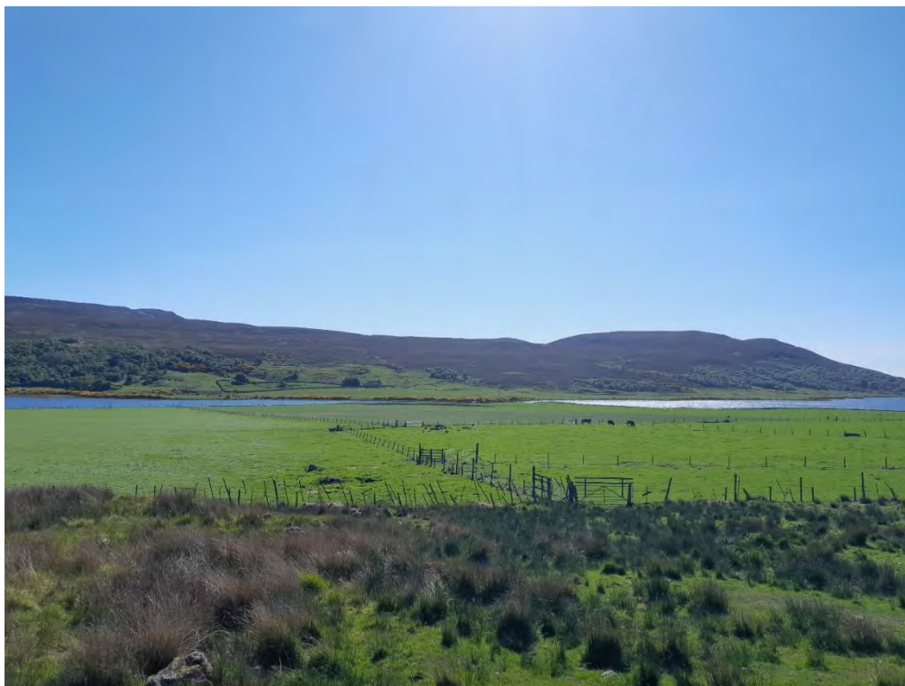
Plate 365: Clearance cairn (Asset 375; centre right), facing east