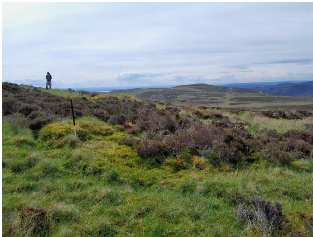
Plate 409: Possible building footings (Asset 391.8), facing southeast