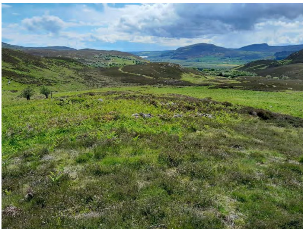
Plate 444: Building footings (Asset 387.15), facing southeast