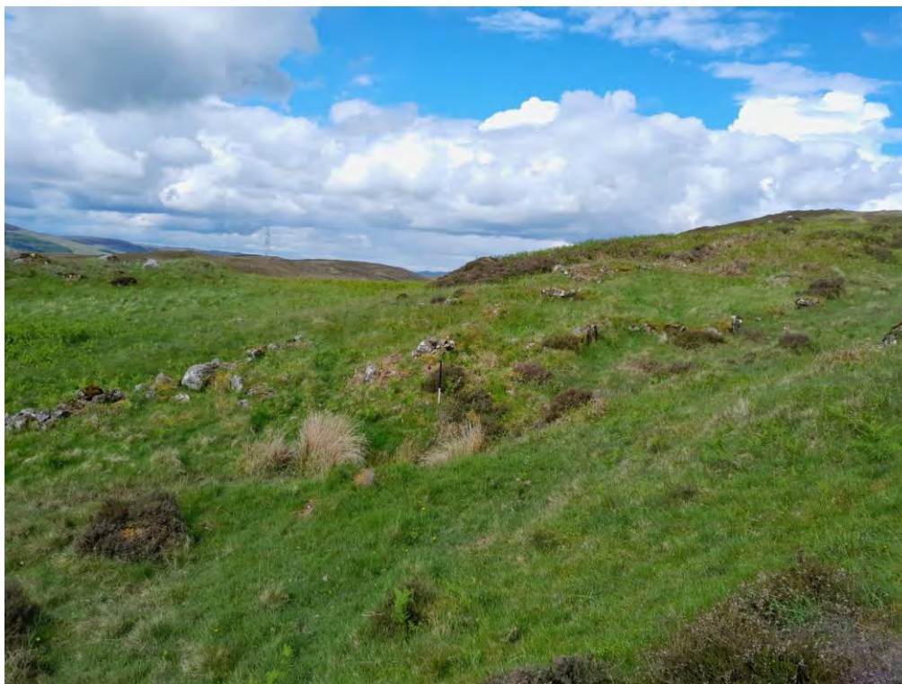
Plate 439: Building footings (Asset 387.3), facing northwest