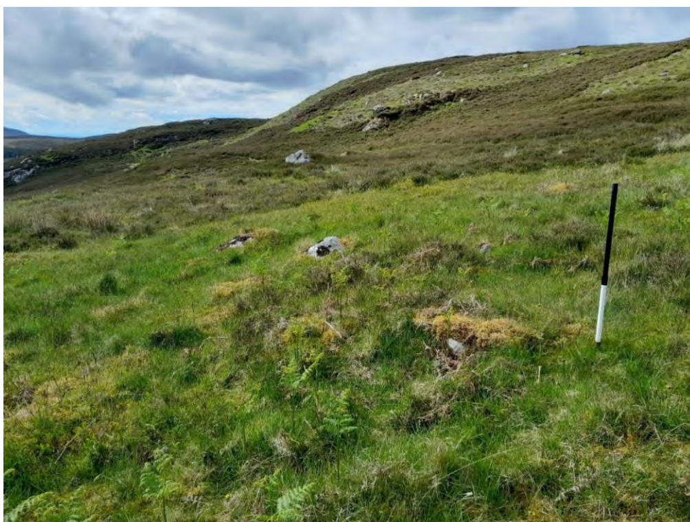
Plate 428: Clearance cairn (Asset 383.2), facing south