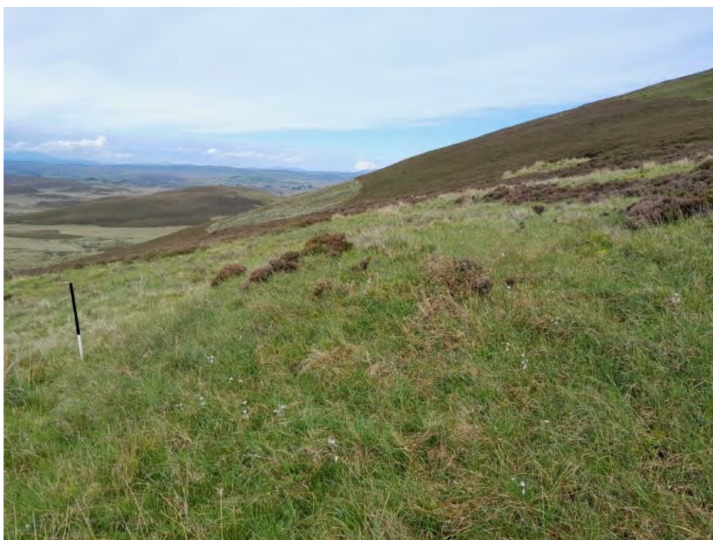
Plate 412: Platform (Asset 391.7), facing northwest