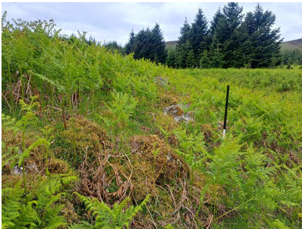
Plate 401: Dyke (Asset 138.2; MHG20395), facing northwest