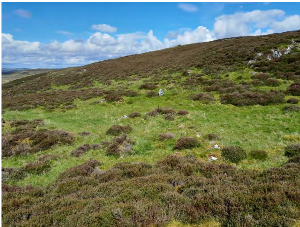
Plate 435: Building (Asset 386), facing northwest