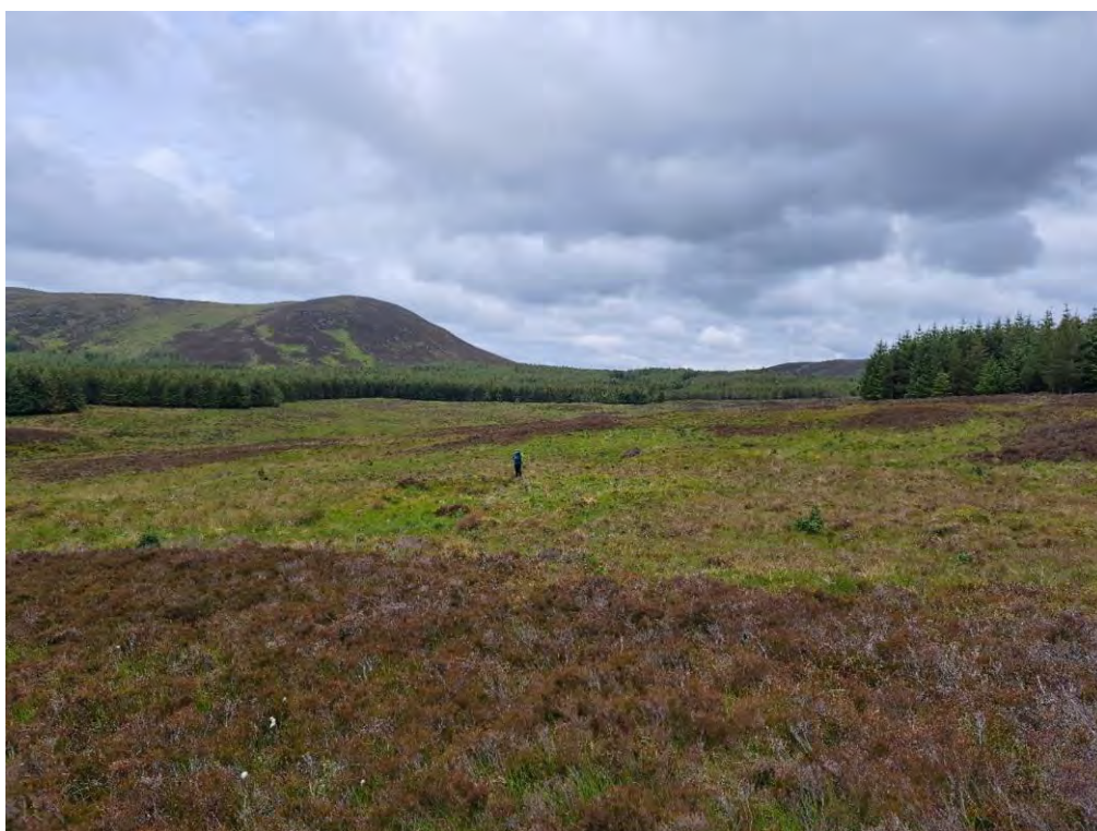
Plate 382: Hut circle (Asset 115.1; MHG10597), facing northwest