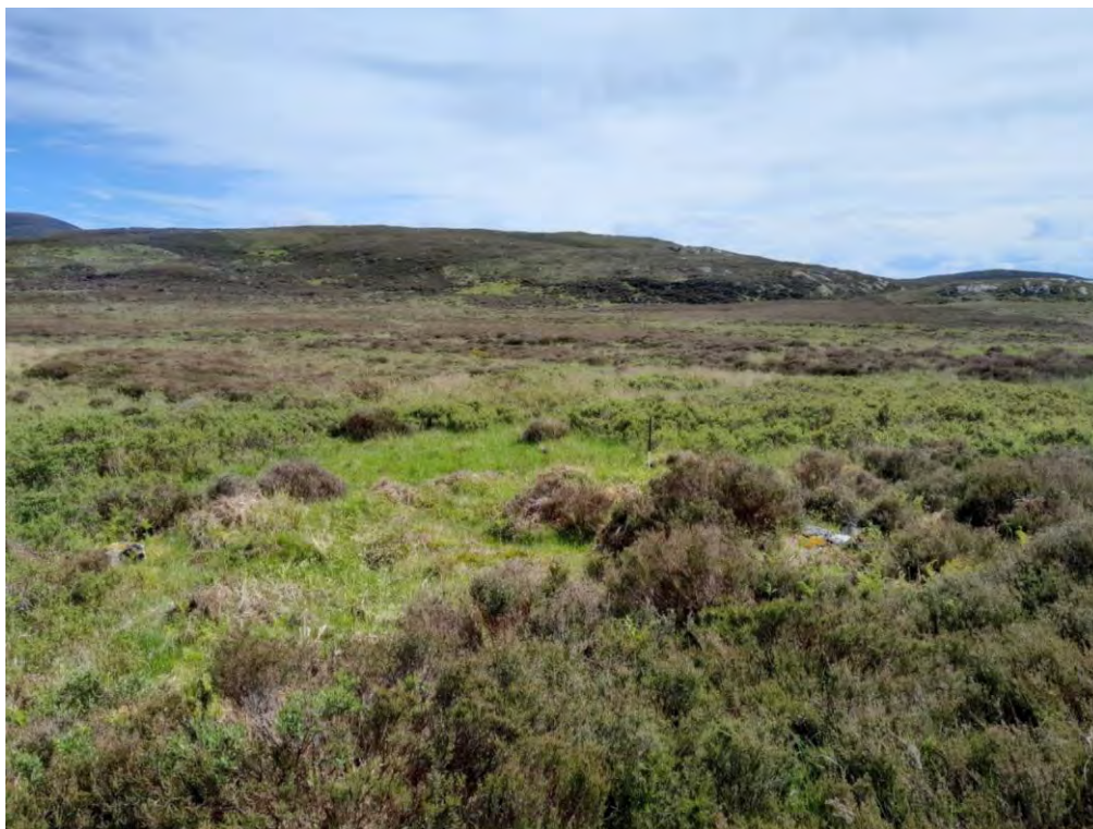
Plate 423: Possible building footings (Asset 396), facing southeast