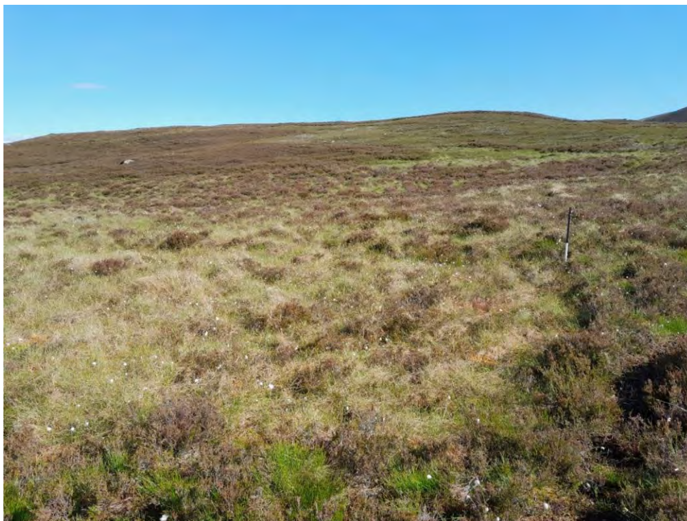
Plate 417: Peat cutting (Asset 390.1), facing north