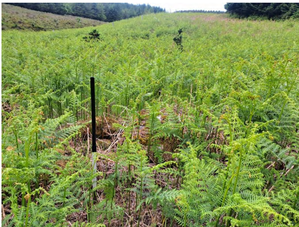
Plate 399: Dyke (Asset 604), facing southwest