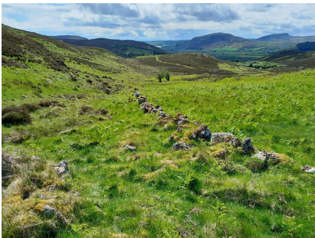
Plate 436: Dyke (Asset 387.1), facing southeast