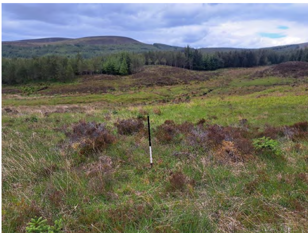
Plate 390: Clearance cairn (Asset 115.10), facing southwest