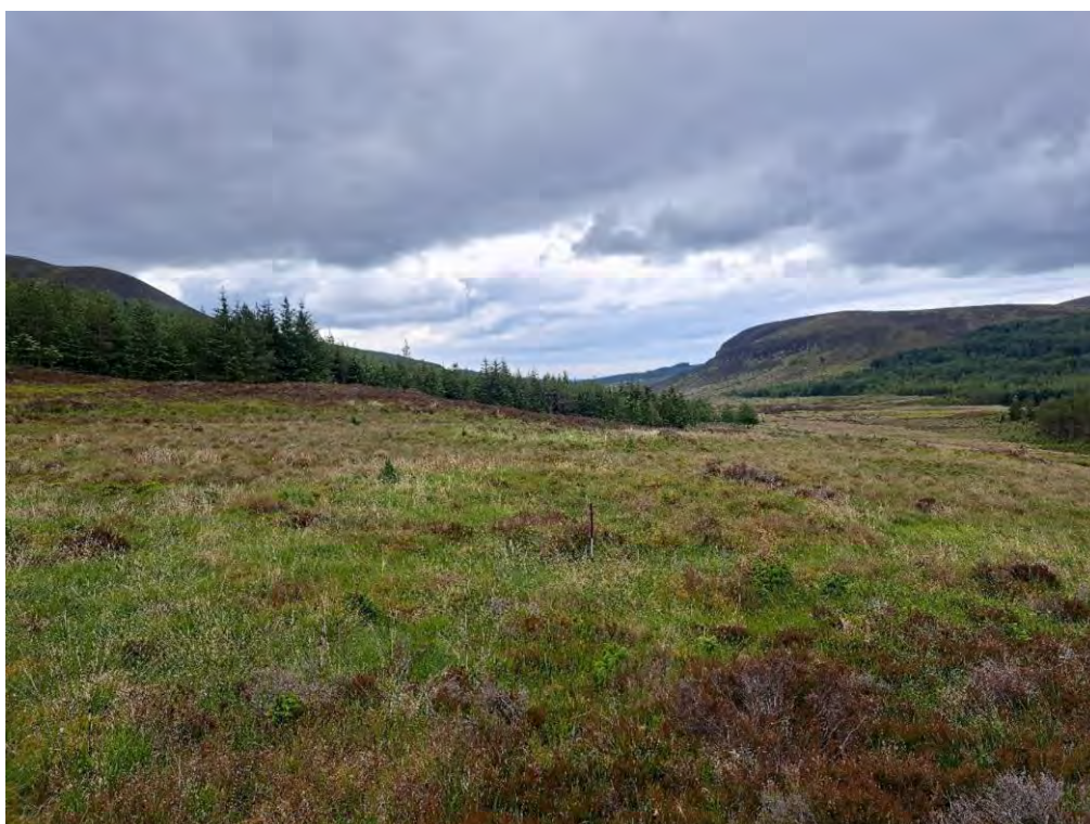
Plate 386: Hut circle (Asset 115.5), facing southeast