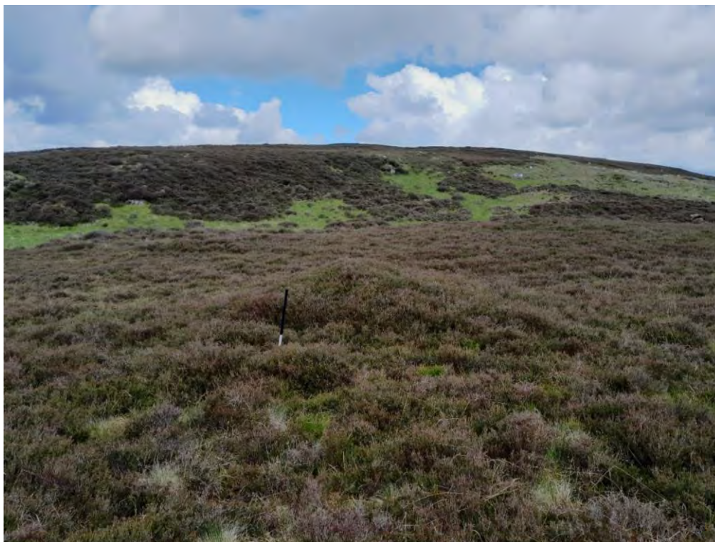
Plate 431: Clearance cairn (Asset 385.2; MHG11115), facing northwest