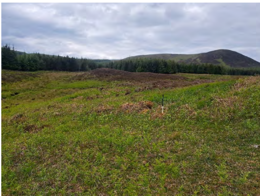
Plate 394: Dyke (Asset 603), facing northwest