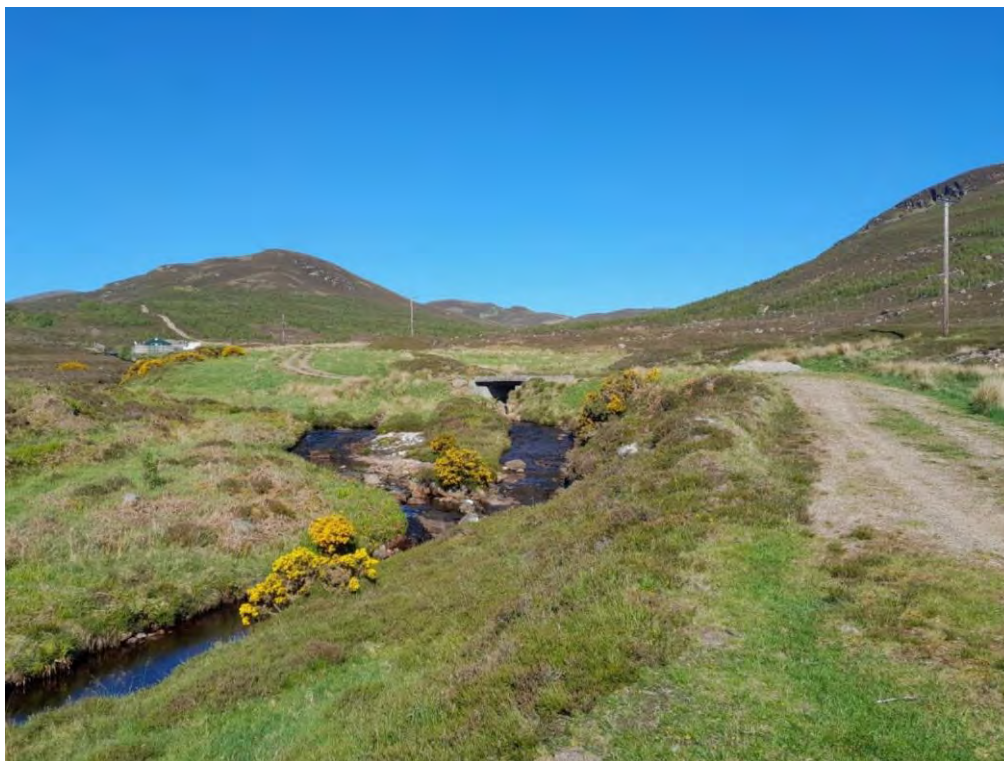
Plate 369: Bridge (Asset 380), facing northwest