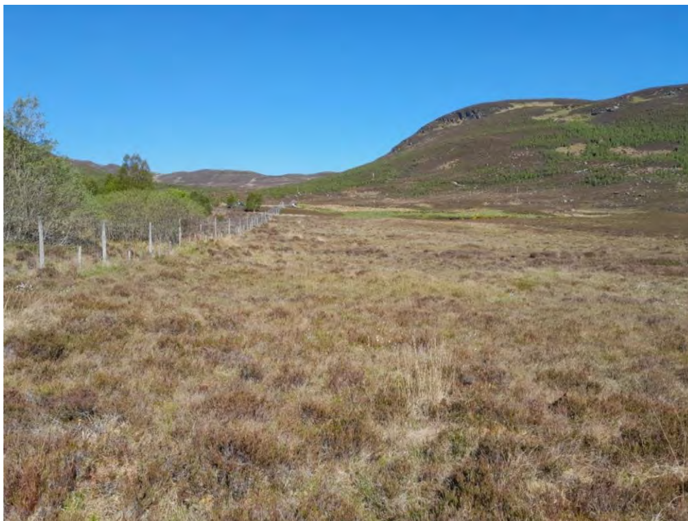
Plate 371: Peat cutting (Asset 378.2), facing northwest