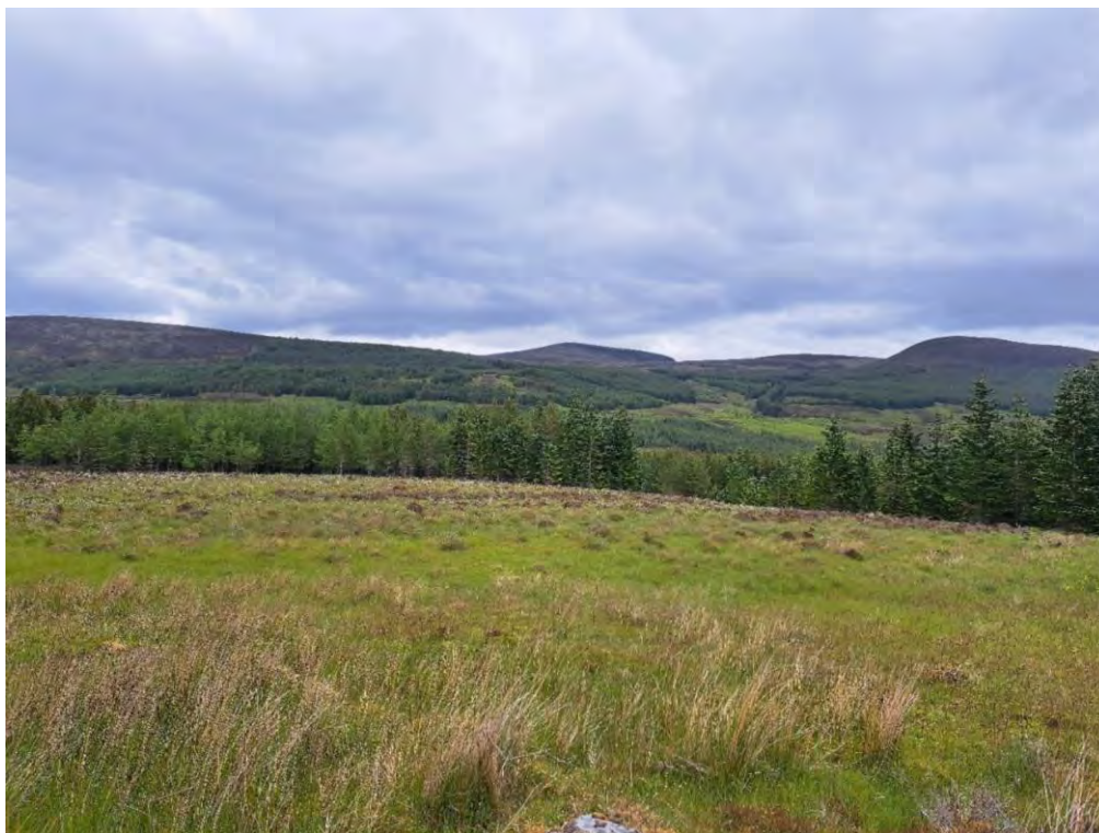
Plate 397: Lazy beds (Asset 139.4), facing northeast