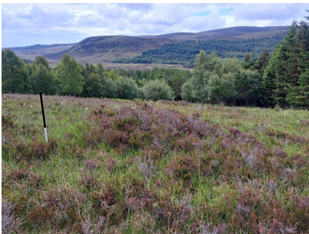
Plate 380: Clearance cairn (Asset 600.7), facing southwest