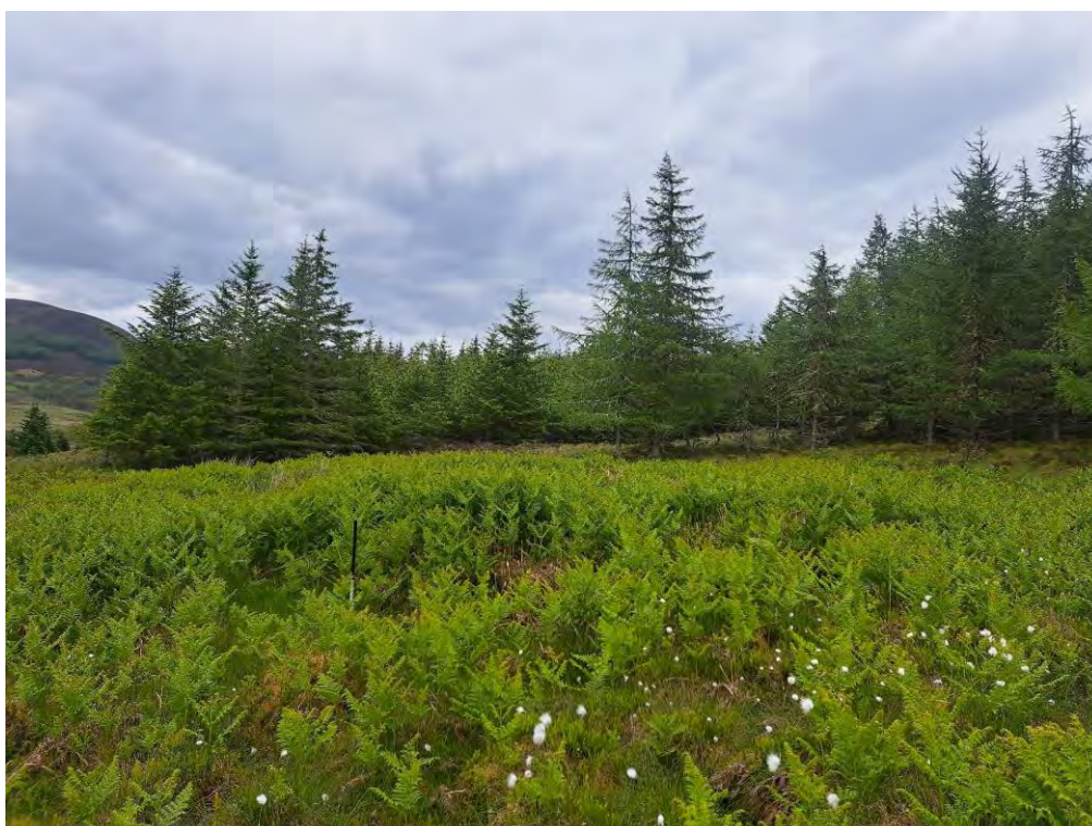
Plate 402: Enclosure (Asset 138.3; MHG10395), facing southeast