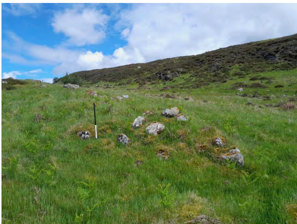
Plate 448: Clearance cairn (Asset 387.7), facing north