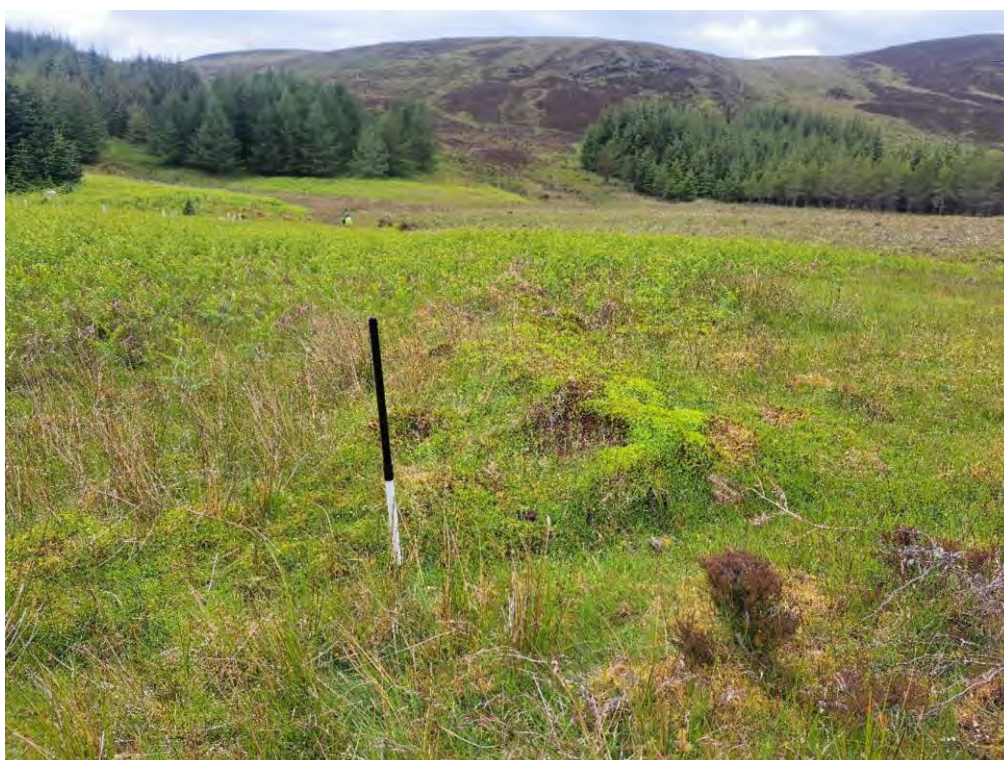
Plate 398: Dyke (Asset 139.3), facing west