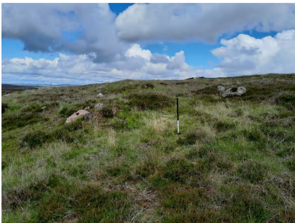
Plate 432: Clearance cairn (Asset 385.3; MHG11115), facing northwest