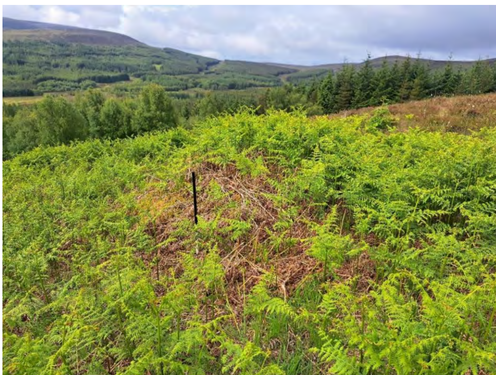
Plate 376: Clearance cairn (Asset 600.2), facing northwest