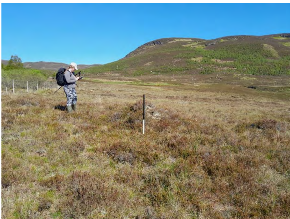
Plate 372: Probable degraded peat stack (Asset 378.1), facing northwest