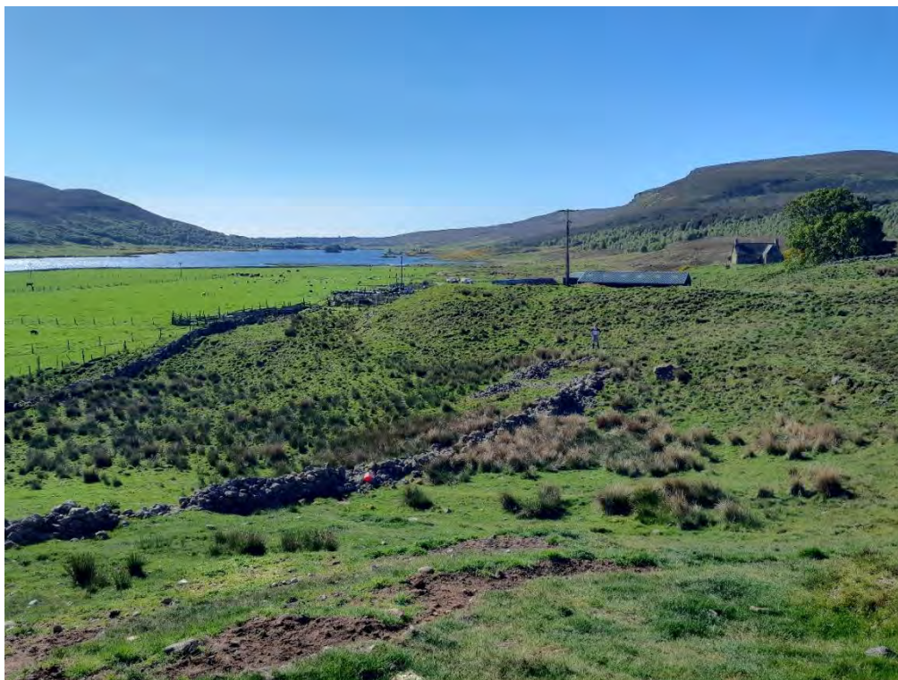
Plate 367: Dykes (Assets 374.2; right and Asset 374.4; left) and pen (Asset 374.3; centre, coming off to the left of dyke Asset 374.2), facing southeast