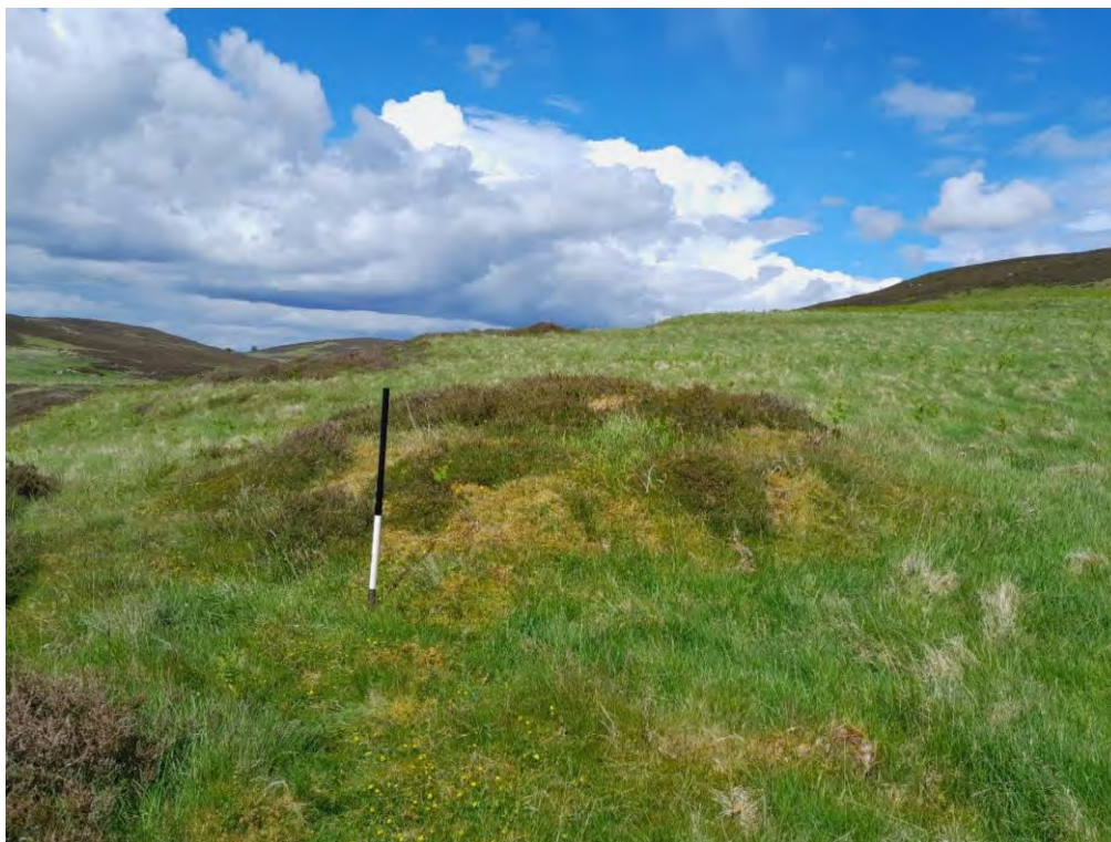
Plate 451: Clearance cairn (Asset 387.12), facing northwest