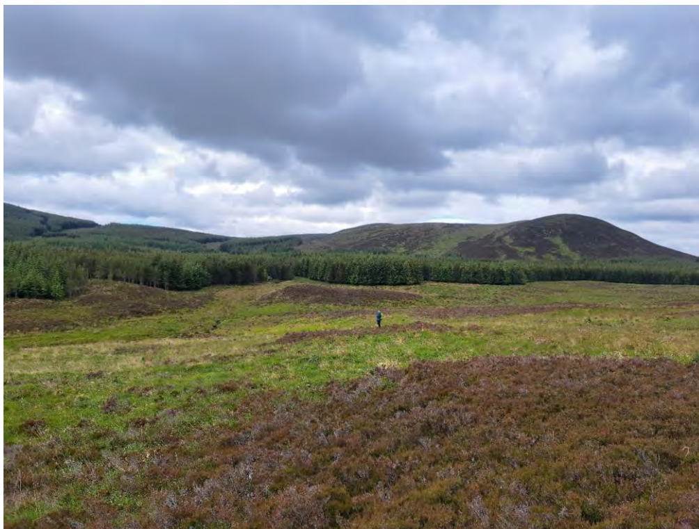
Plate 383: Hut circle (Asset 115.2; MHG10597), facing southwest