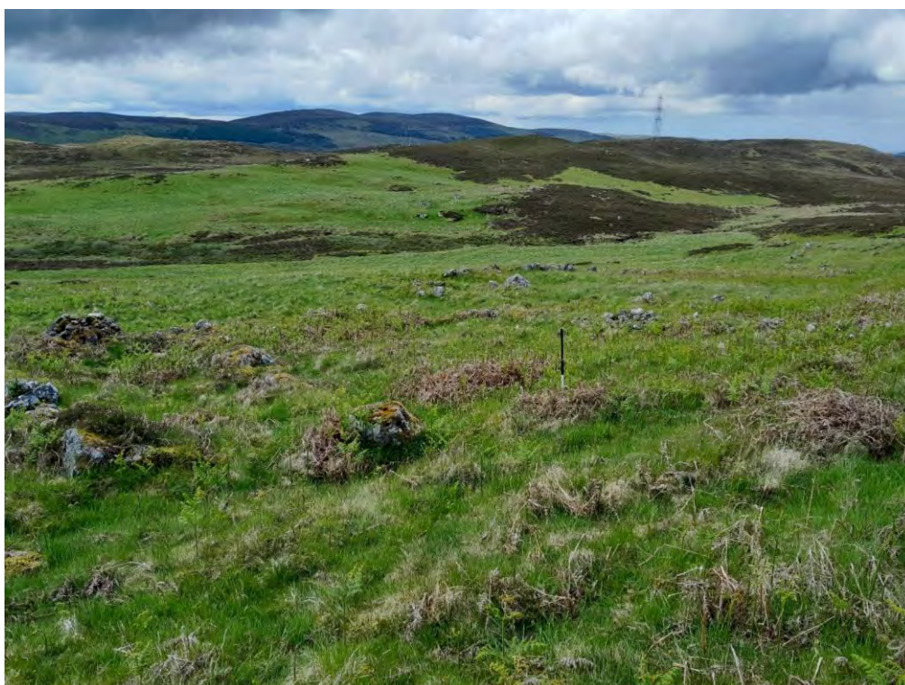
Plate 442: Enclosure (Asset 387.17), facing west