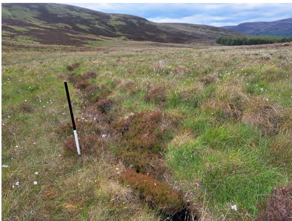
Plate 404: Drain, or peat grip, (Asset 605.6), facing northwest