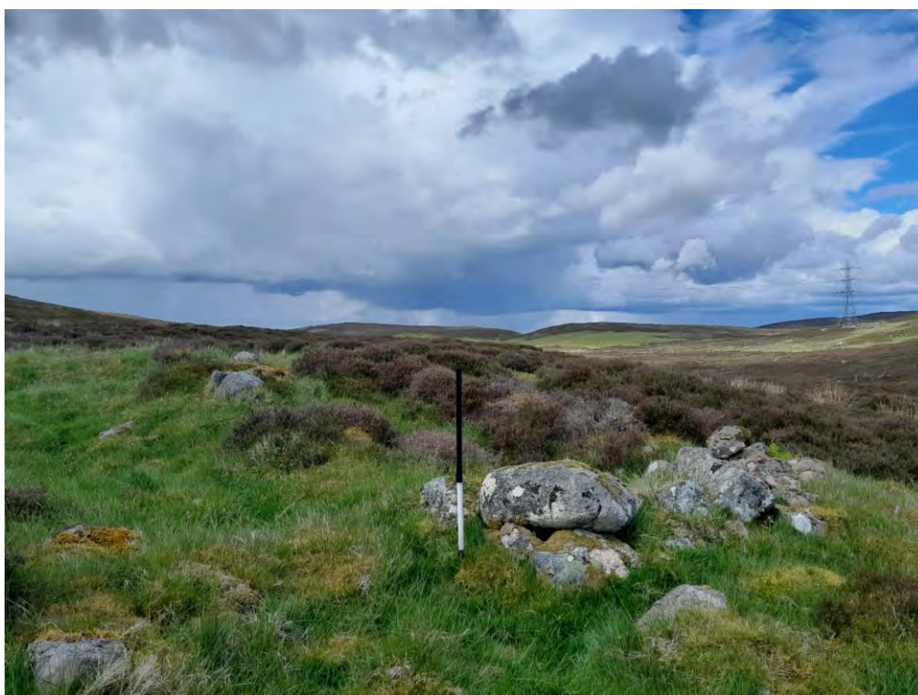
Plate 454: Building footings (Asset 388.6), facing northwest