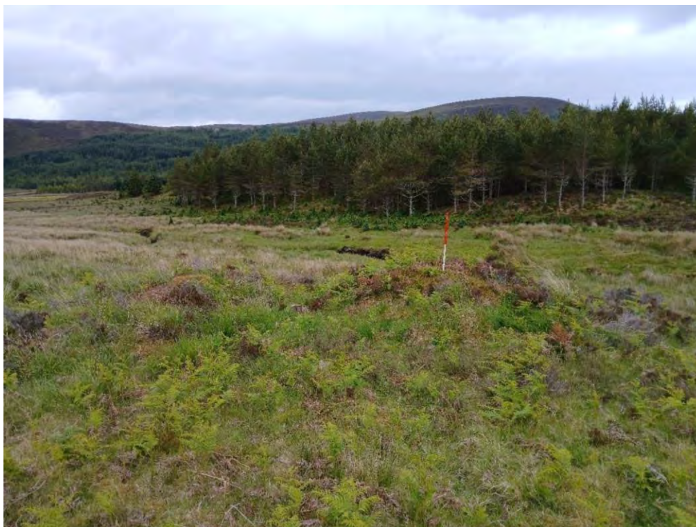
Plate 387: Clearance cairn (Asset 115.7), facing southeast