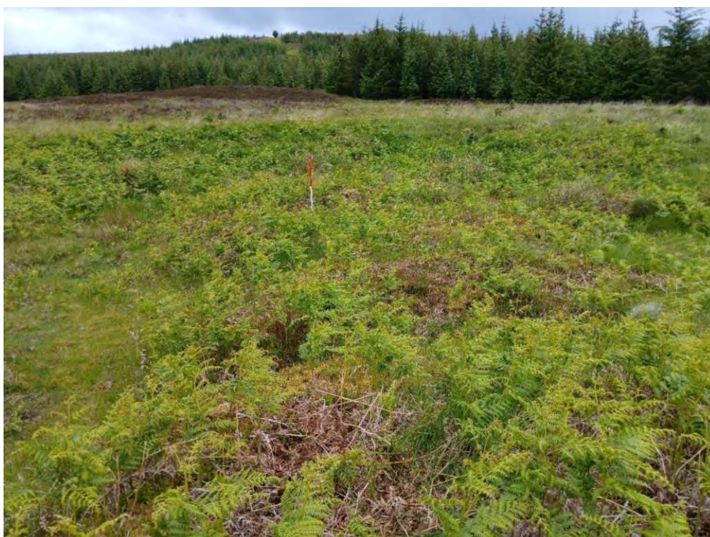
Plate 392: Structure (Asset 601), facing north-northeast