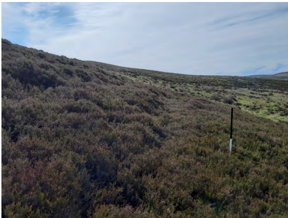
Plate 413: Track (Asset 391.2), facing southeast