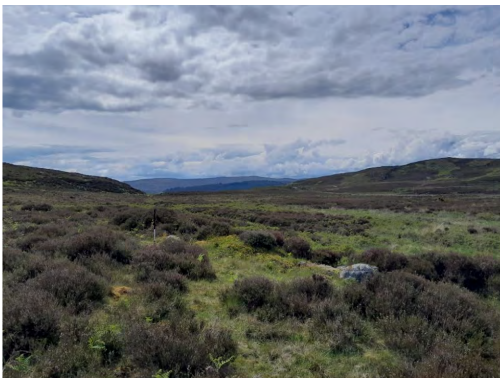
Plate 422: Dyke (Asset 395.2), facing southwest