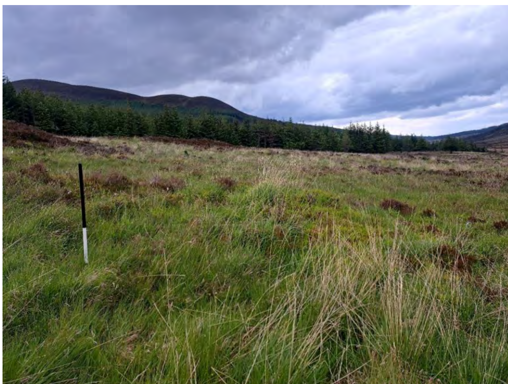
Plate 388: Clearance cairn (Asset 115.8), facing southeast