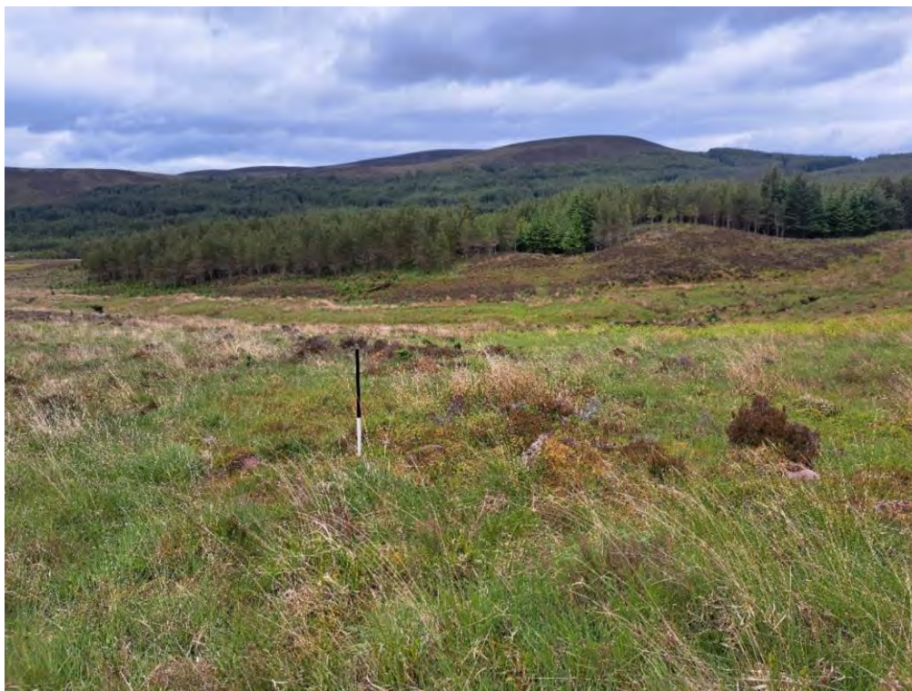
Plate 389: Clearance cairn (Asset 115.9), facing south