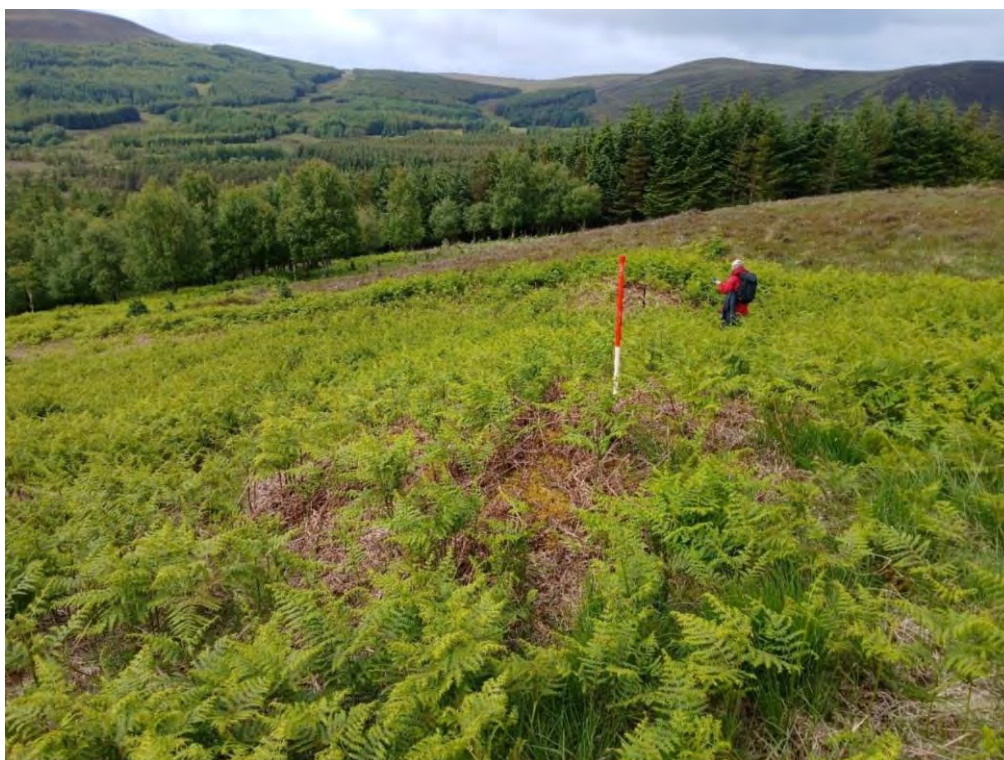
Plate 375: Clearance cairn (Asset 600.1), facing southwest