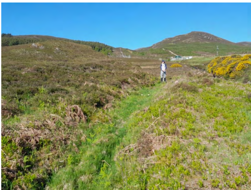
Plate 370: Ditch (Asset 377), facing west