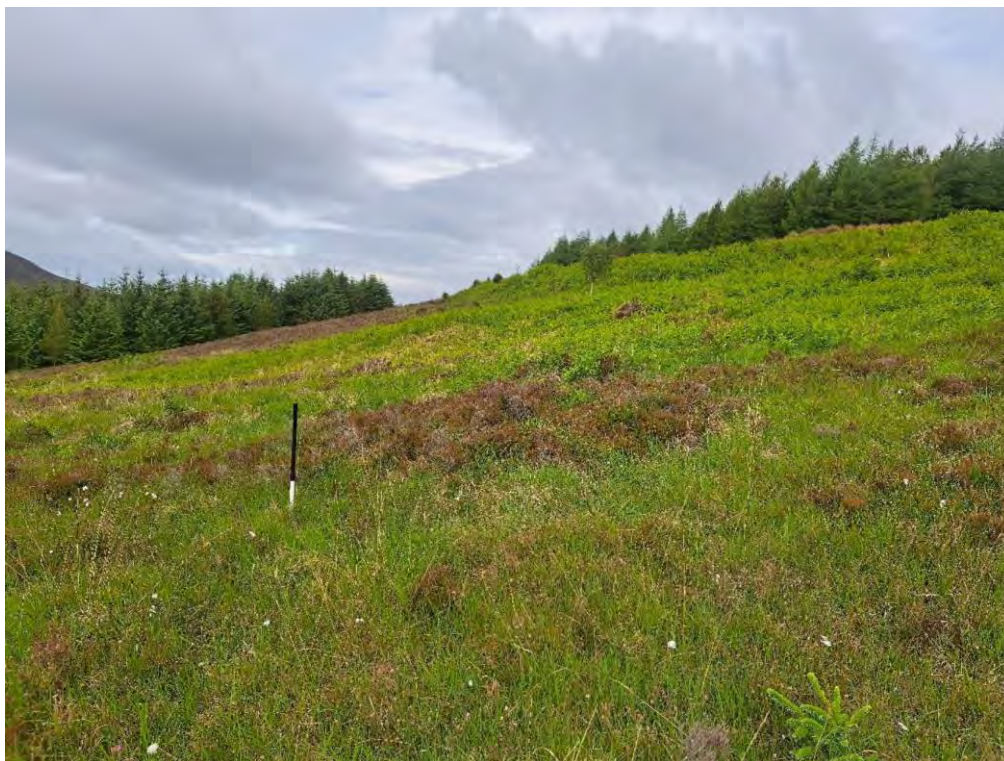
Plate 379: Clearance cairn (Asset 600.6), facing north