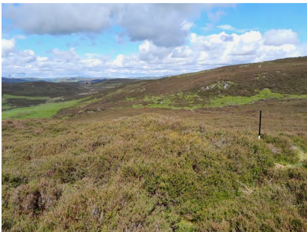
Plate 430: Clearance cairn (Asset 385.1; MHG11115), facing northwest