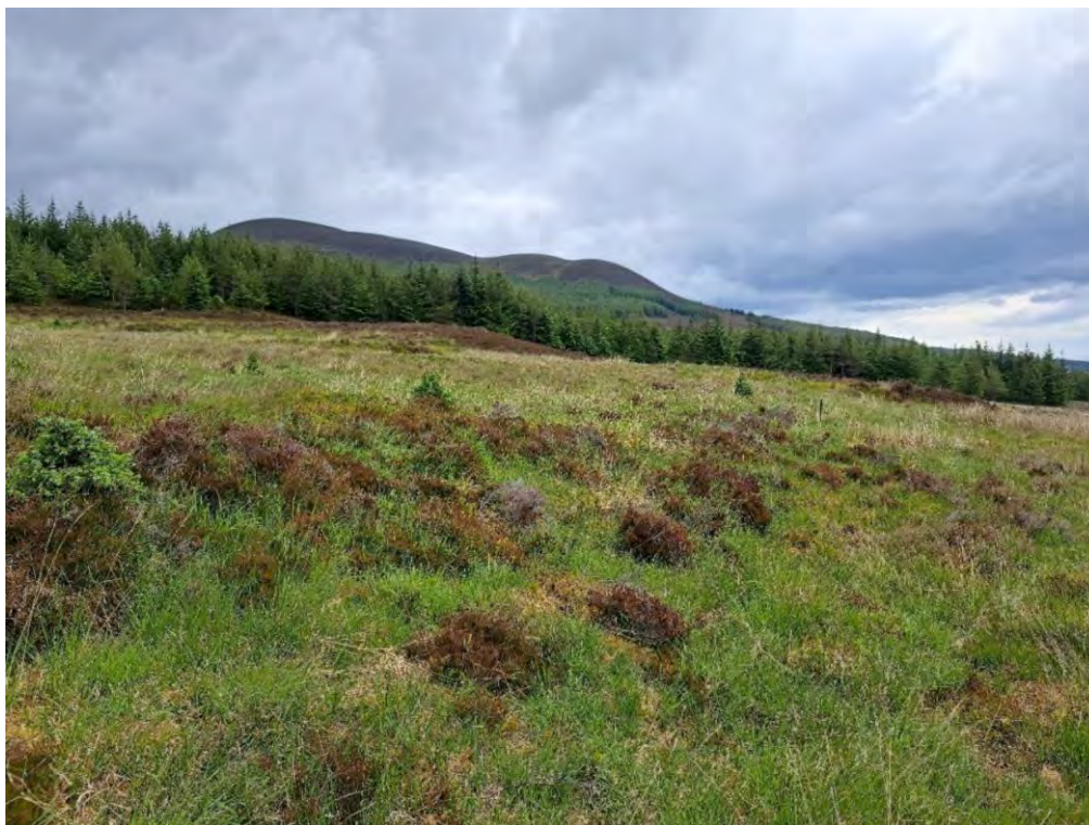
Plate 391: Lynchet (Asset 115.6), facing southeast