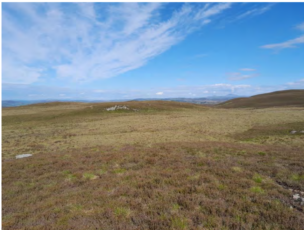
Plate 415: Peat cutting (Asset 390.3), facing west-northwest