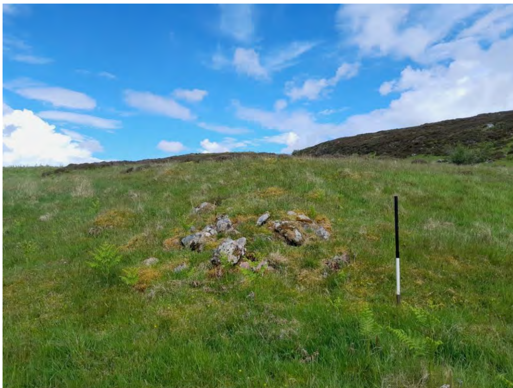
Plate 449: Clearance cairn (Asset 387.8), facing northwest