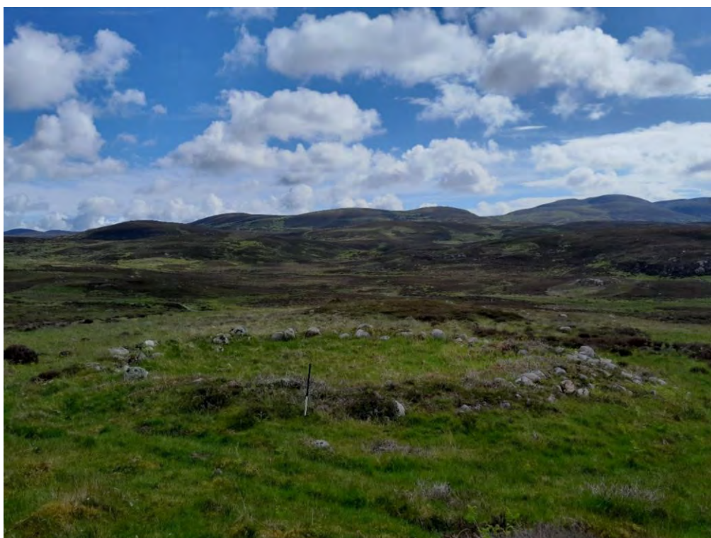
Plate 426: Hut circle (Asset 110; MHG10648), facing northeast