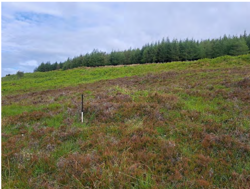
Plate 377: Clearance cairn (Asset 600.3), facing north