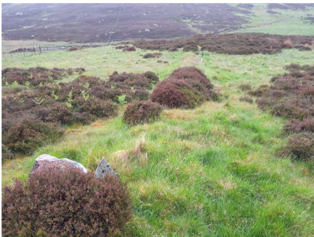
Plate 458: Dyke (Asset 419), with another dyke (Asset 418.3) extending off to right mid-frame, facing northeast