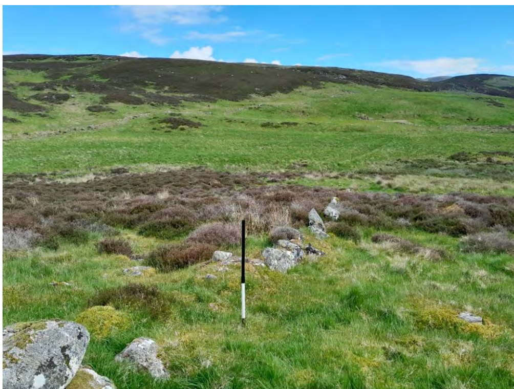
Plate 456: Dyke (Asset 388.7), facing north