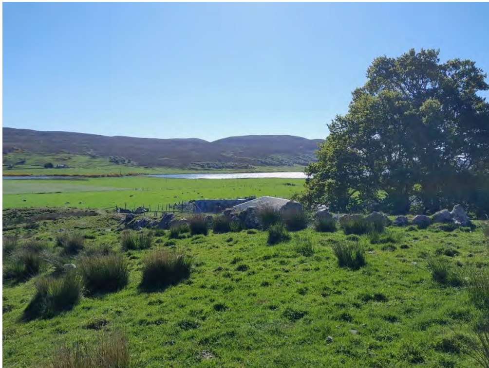
Plate 368: Dyke (Asset 374.1), facing southeast