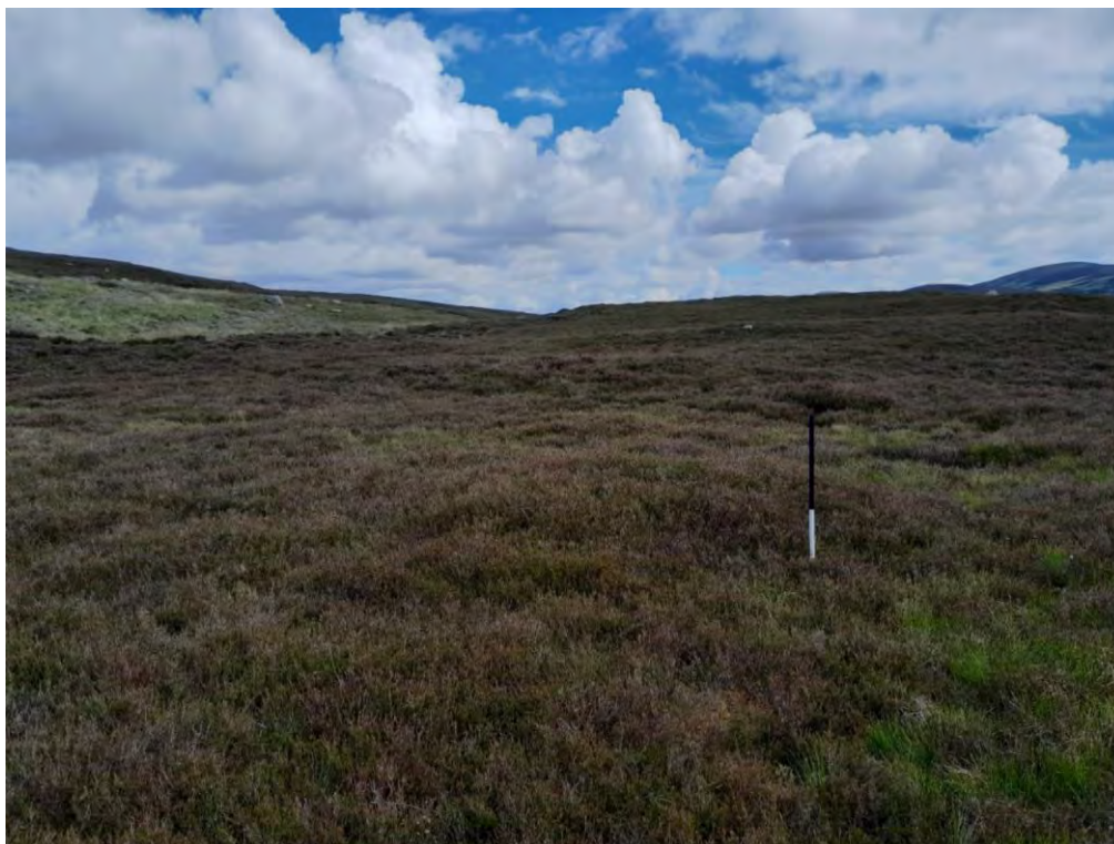
Plate 433: Clearance cairn (Asset 385.4; MHG11115), facing north