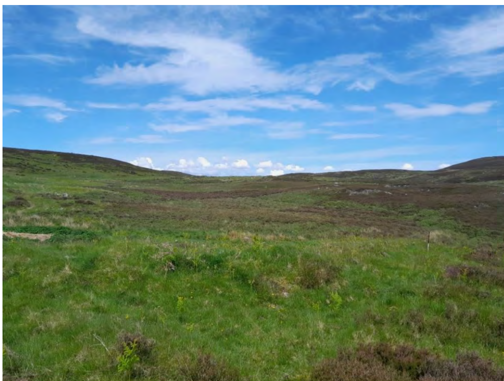
Plate 424: Dyke (Asset 397; MHG11267), facing northeast