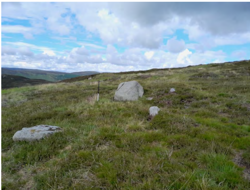
Plate 429: Clearance cairn (Asset 384; MHG11115), facing west