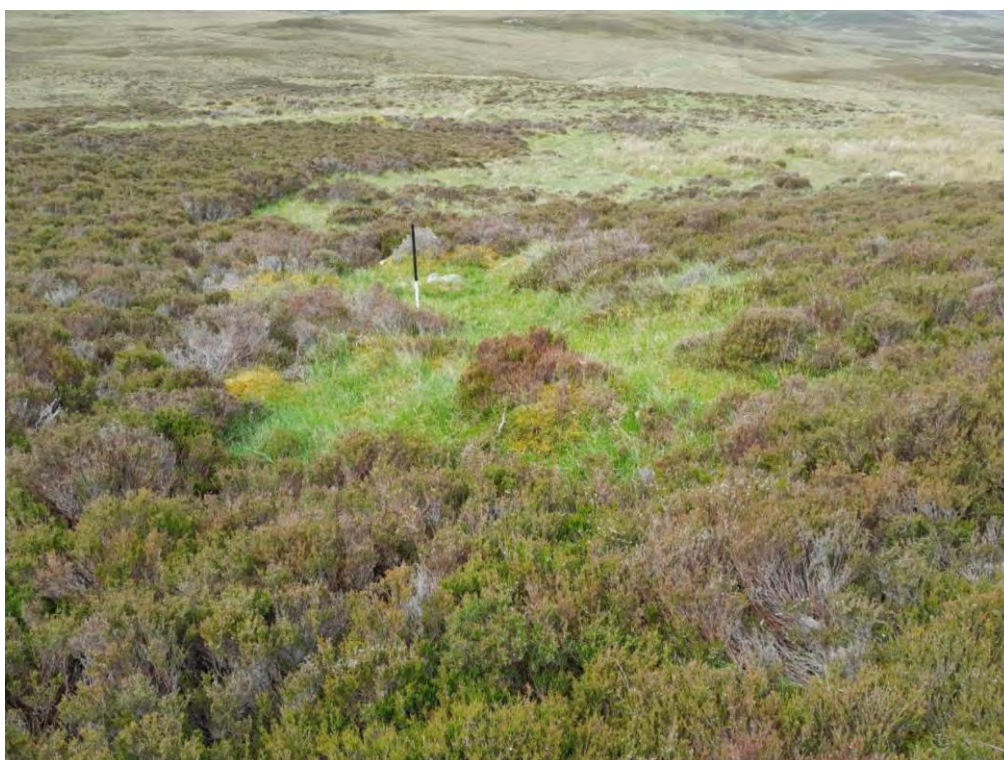
Plate 408: Building footings (Asset 391.9), facing west