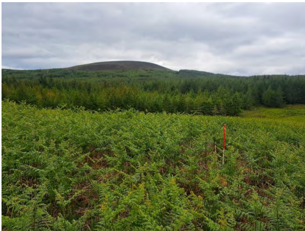
Plate 395: Building (Asset 139.1; MHG10395), facing south