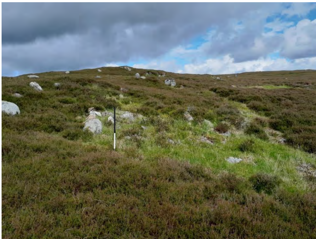
Plate 427: Clearance cairn (Asset 383.1), facing north