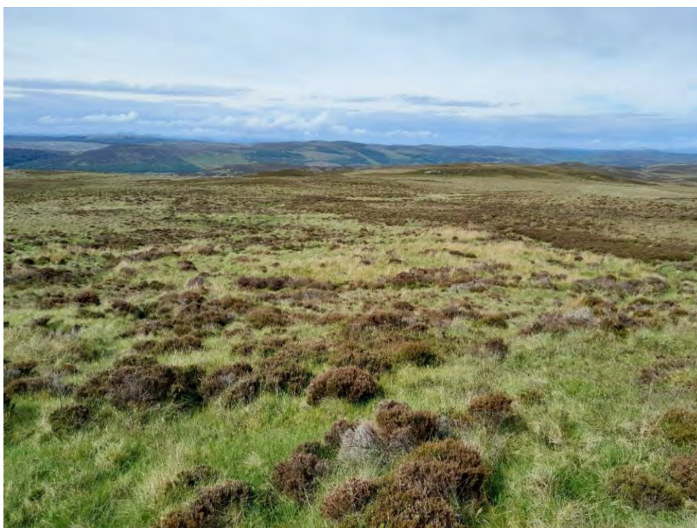
Plate 414: Enclosure (Asset 391.1), facing west