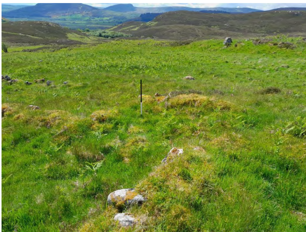
Plate 440: Pen (Asset 387.4) or other ancillary structure to building (Asset 387.3), facing south