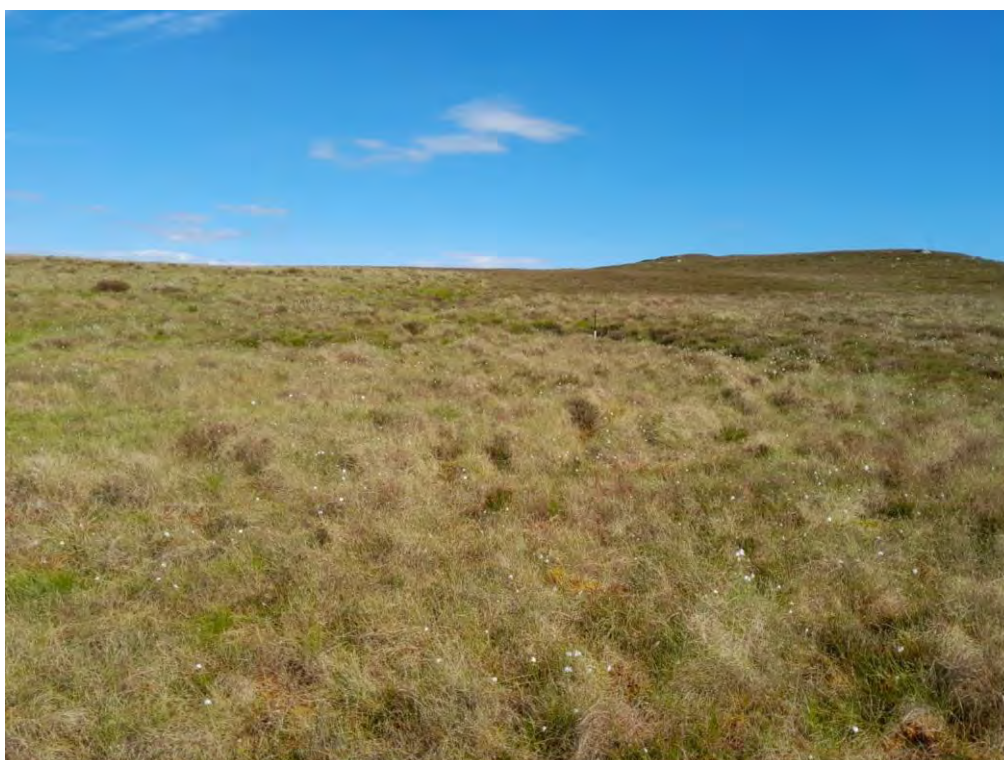
Plate 416: Peat cutting (Asset 390.2), facing north