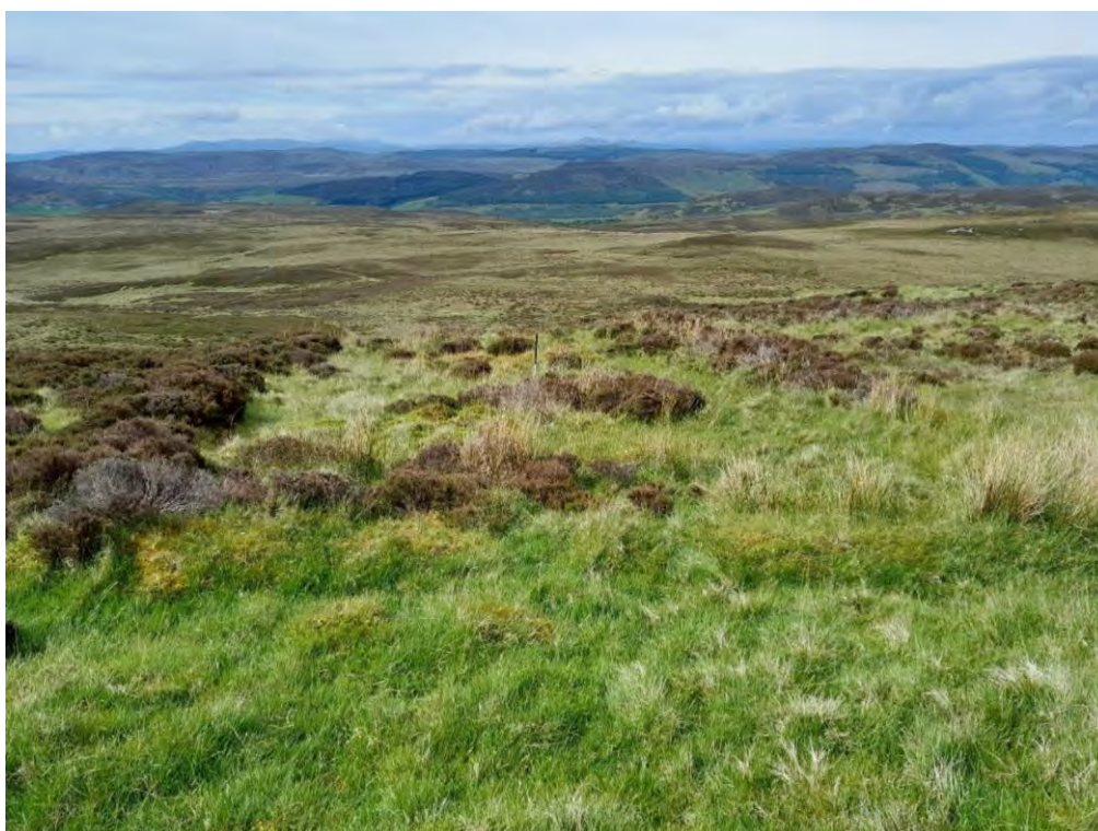
Plate 410: Structure (Asset 391.4), facing southwest