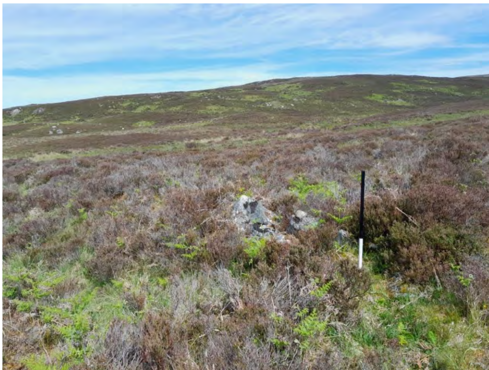
Plate 421: Dyke (Asset 395.1), facing northeast