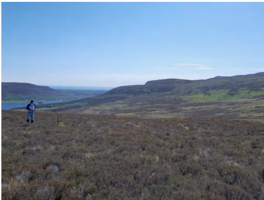
Plate 373: Possible peat banks (Assets 379.1 and 379.2), facing southwest