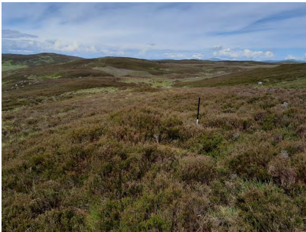
Plate 419: Clearance cairn (Asset 393.1), facing northwest