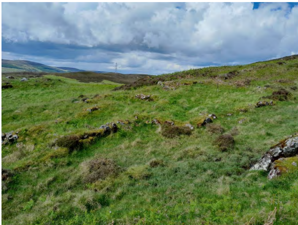
Plate 437: Enclosure (Asset 387.5), facing east