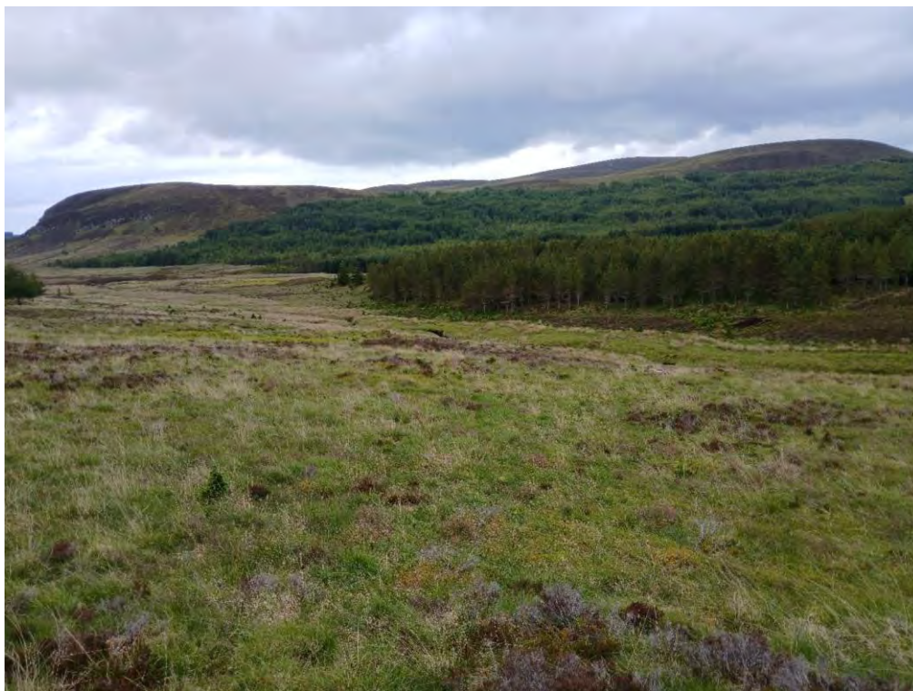
Plate 385: Hut circle (Asset 115.4), facing southeast