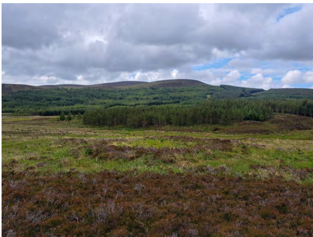
Plate 384: Hut circle (Asset 115.3; MHG10597), facing southwest