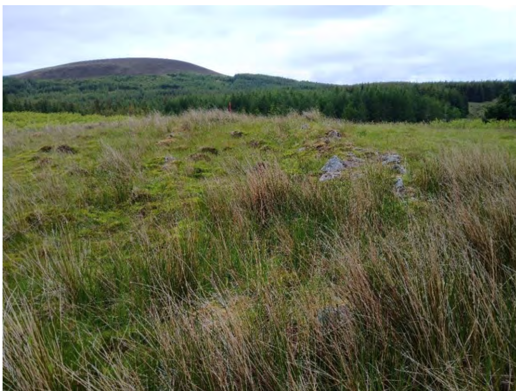
Plate 396: Building (Asset 139.2; MHG10395), facing south