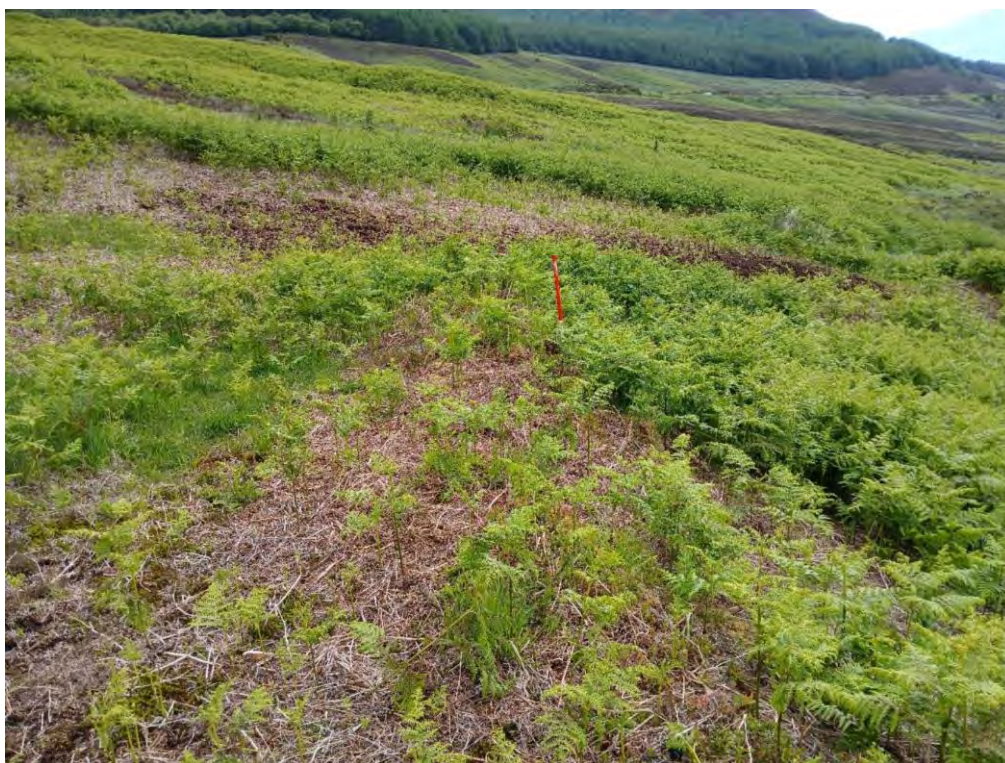
Plate 381: Possible lynchet (Asset 600.5), facing east