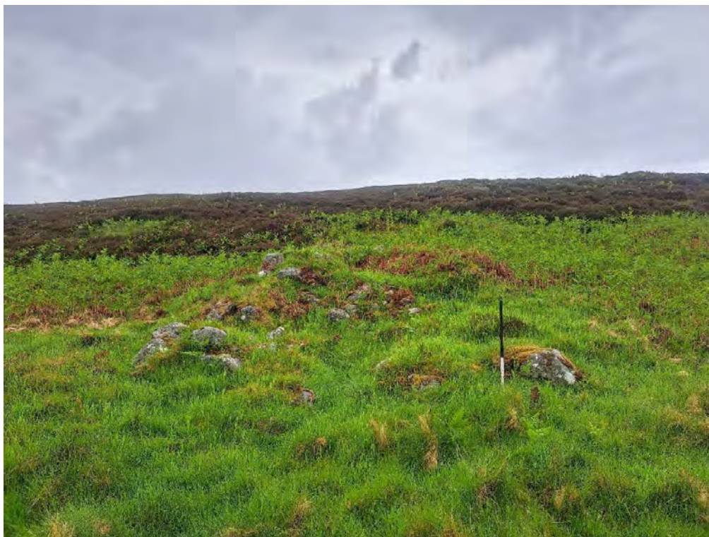
Plate 441: Corn-drying kiln (Asset 418.5), facing northeast