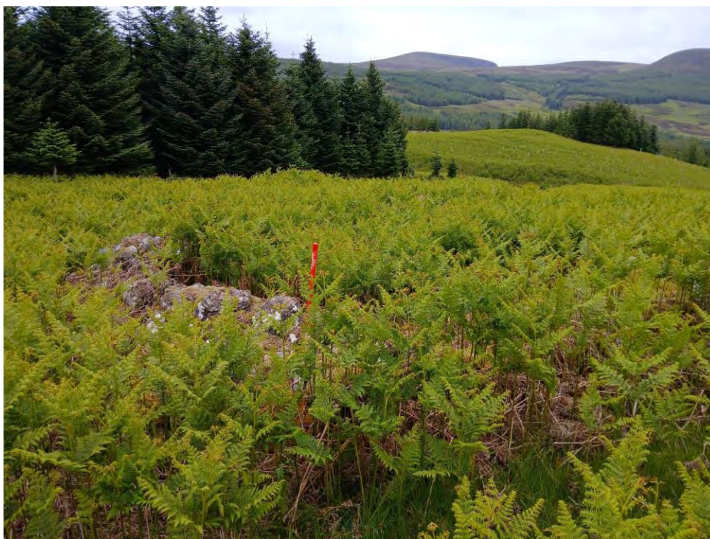
Plate 403: Structure or enclosure (Asset 138.4; MHG10395), facing northeast