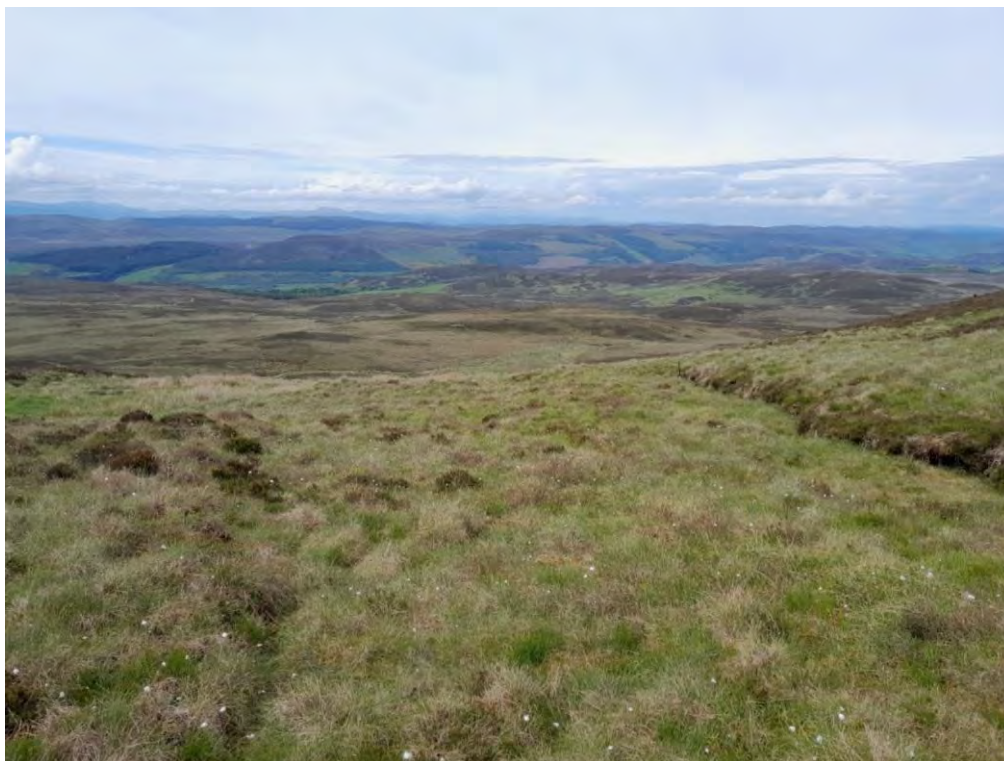
Plate 405: Peat cutting (Asset 392), facing southeast