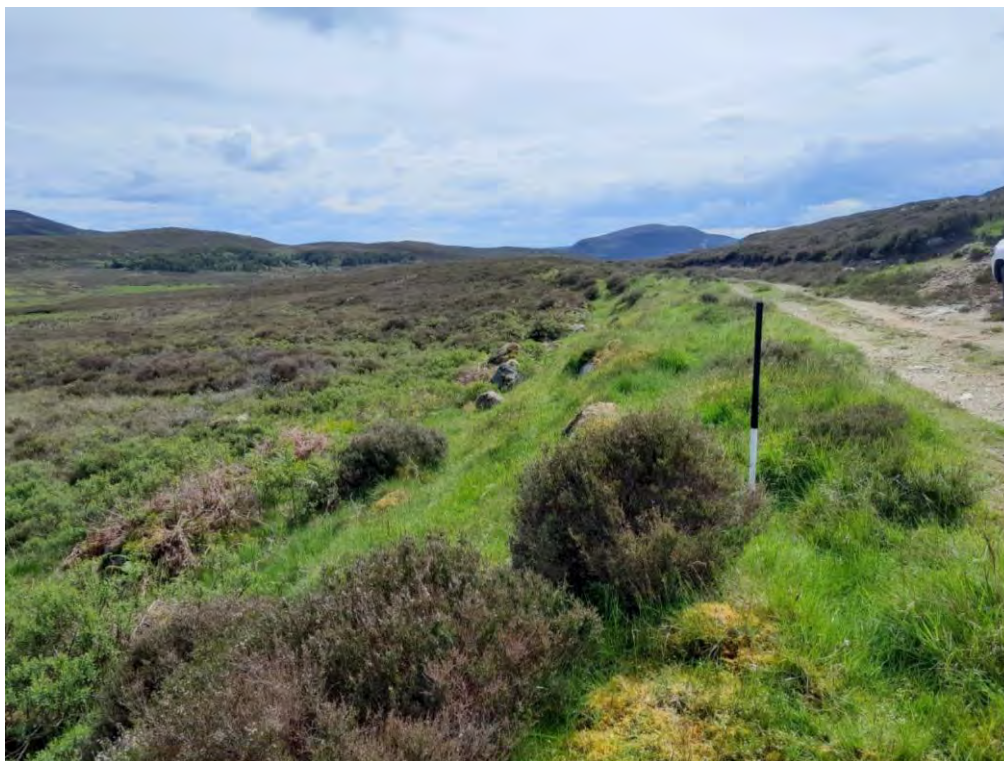
Plate 425: Dyke (Asset 398; MHG11267), facing south