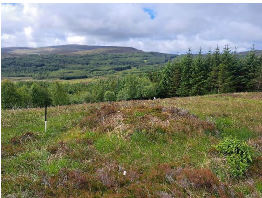
Plate 378: Clearance cairn (Asset 600.4), facing west