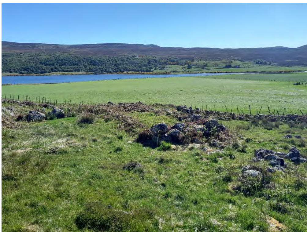
Plate 366: Pen (Asset 376), facing east