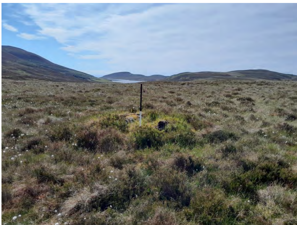
Plate 418: Cairn (Asset 799), possibly for navigation, facing southeast