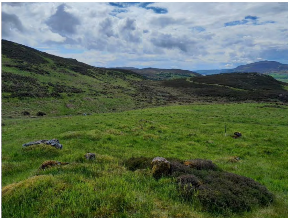
Plate 447: Enclosure (Asset 387.2), facing southeast