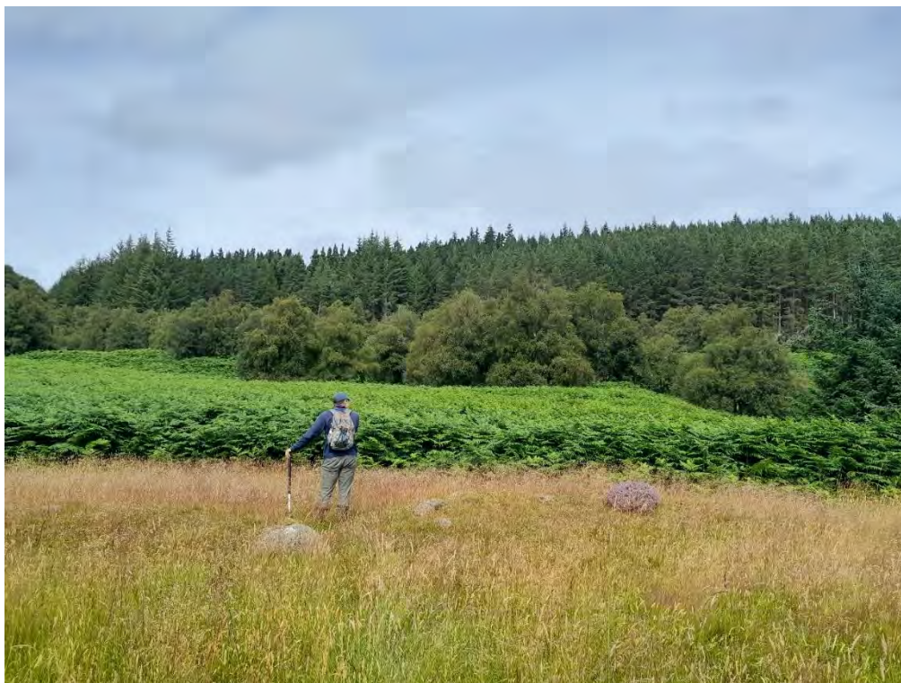
Plate 547: Dyke (Asset 865.2; MHG8393) with area of rig and furrow (Asset 865.4; MHG8393) beyond below dense bracken beyond, facing north-northeast