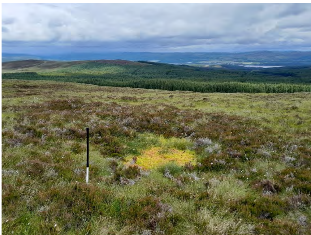
Plate 542: Hut circle (Asset 952), facing northeast