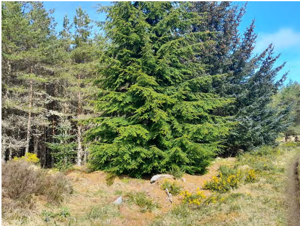
Plate 534: Dyke (Asset 366), adjacent to forestry track, facing north