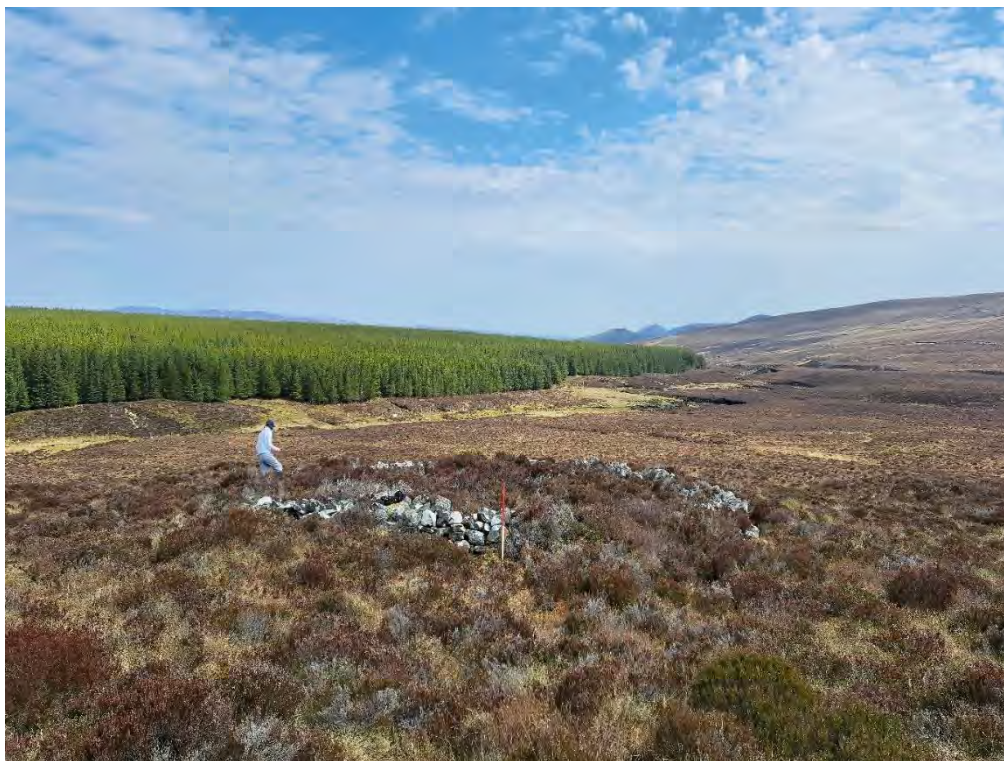
Plate 545: Circular enclosure (Asset 331), likely a sheepfold, facing southeast