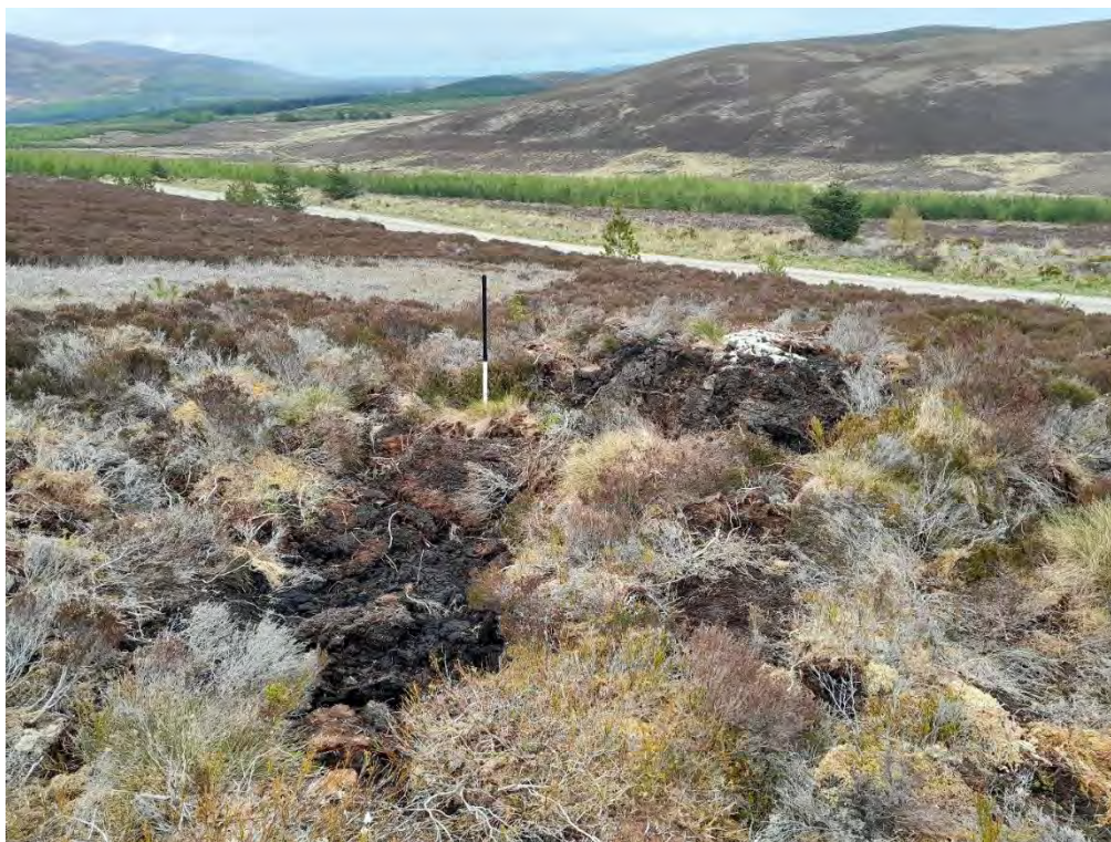
Plate 591: Deer salt-lick (Asset 339.3), facing north