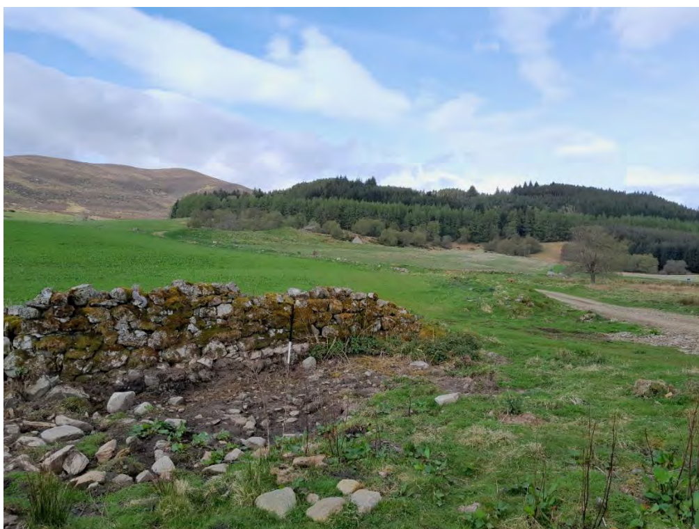
Plate 550: Enclosure (Asset 345), facing northeast