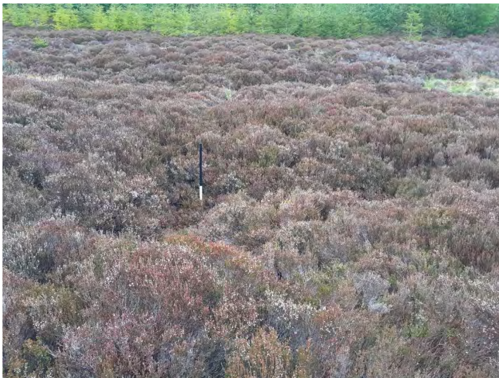
Plate 597: Shooting butt (Asset 337.2), facing north