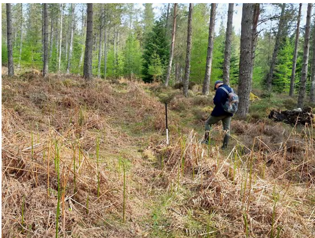
Plate 540: Track (Asset 1021), facing northeast