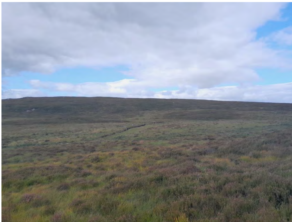
Plate 525: Shooting butts (Assets 367.1-367.3), facing north