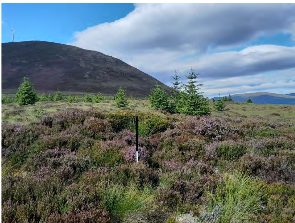
Plate 594: Shooting butt (Asset 338.4), facing northwest