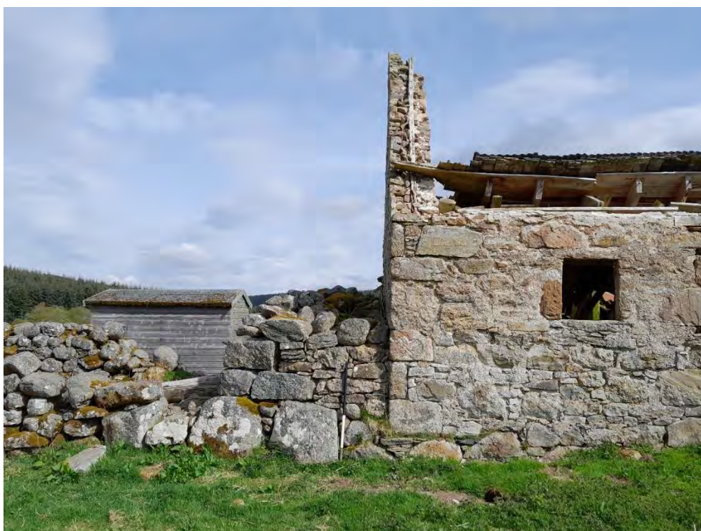
Plate 554: Buildings abutting (Assets 351.1; right and 351.2; left), facing north-northwest