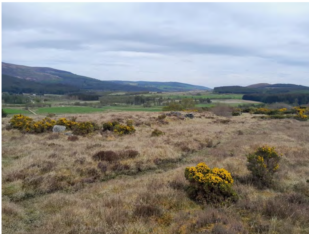
Plate 579: Building footings (Asset 166; MHG20470), facing east