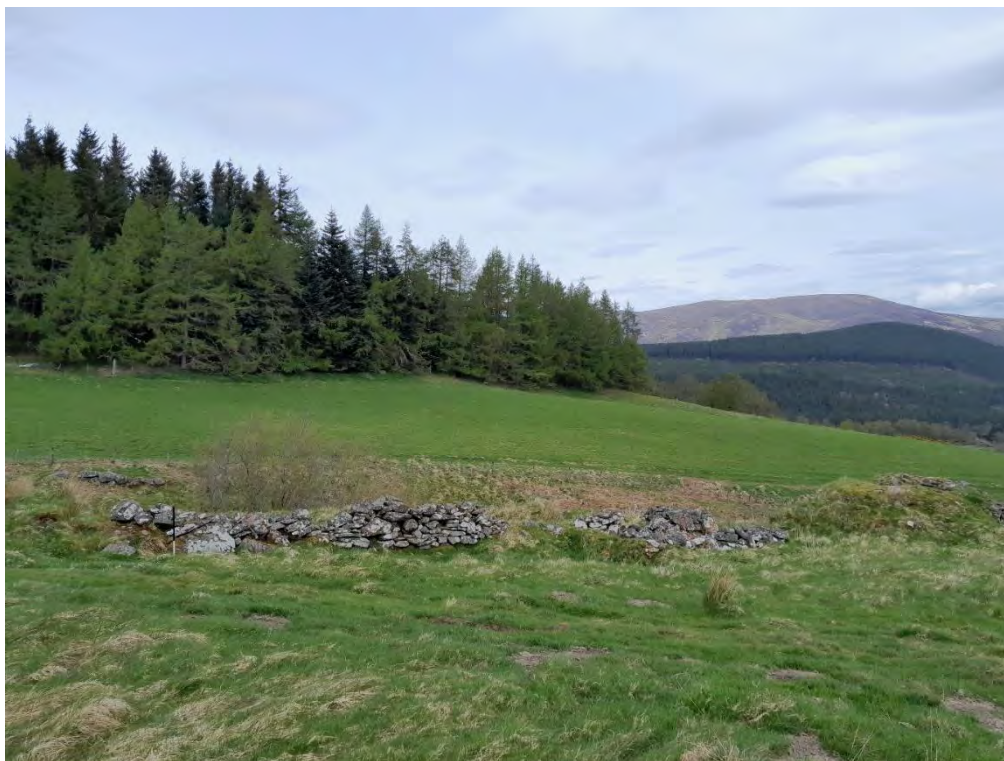
Plate 575: Enclosure (Asset 167.2; left) and pen (Asset 167.3; right), facing north