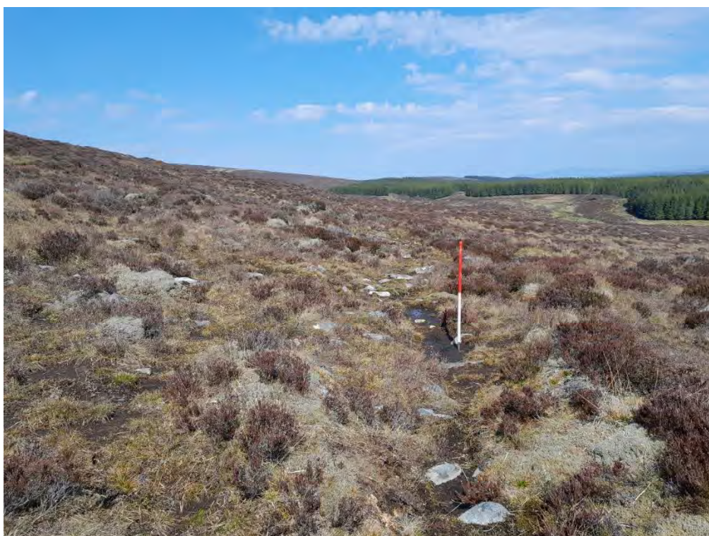
Plate 544: Track (Asset 330), facing northeast