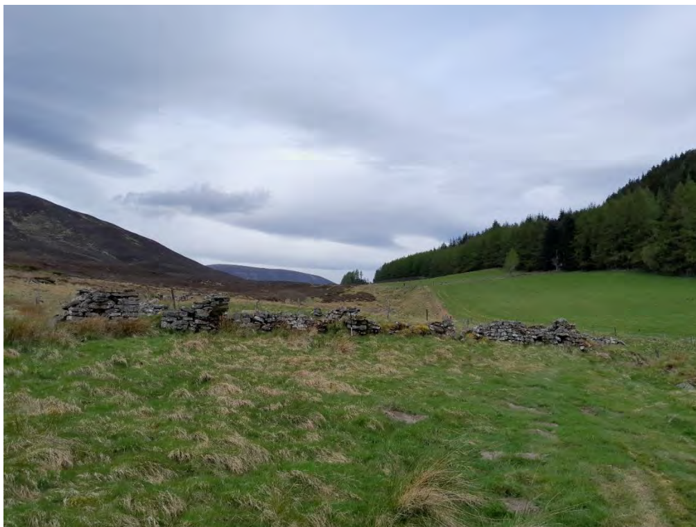
Plate 573: Building (Asset 167.1), facing west