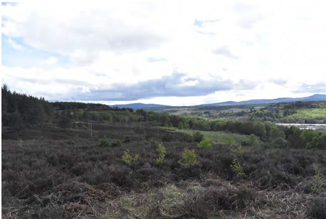
Plate 535: View over Scheduled area south extent for Asset 9 (SM5497) within portion of survey corridor, but the Scheduled assets themselves do not extend into the corridor, facing south