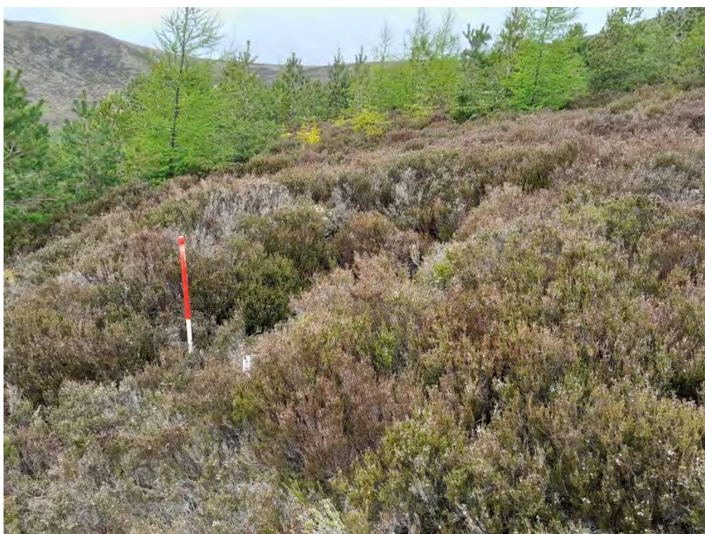
Plate 592: Shooting butt (Asset 338.1), facing northwest