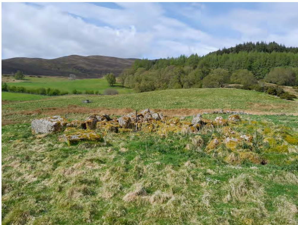
Plate 563: Building footings (Asset 350), facing southwest