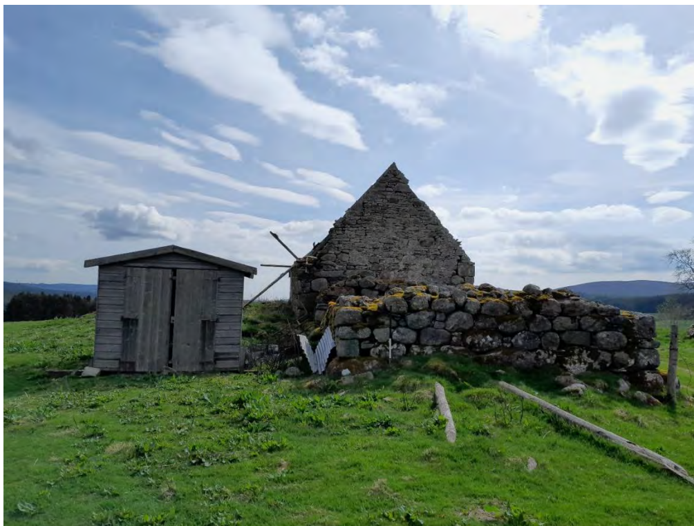
Plate 555: Shed (Asset 354) and the west ends of buildings Assets 351.2 (front) and 351.2 (back), facing east