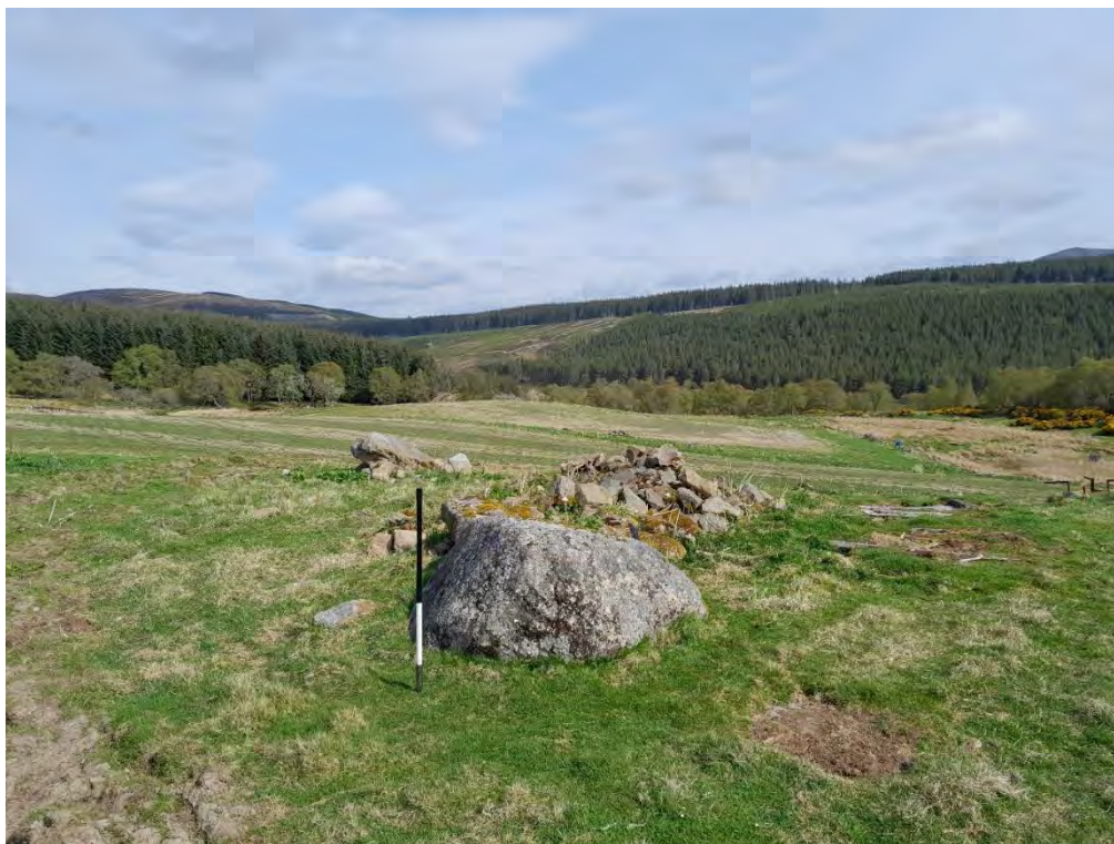
Plate 559: Clearance cairn (Asset 348.2), facing north