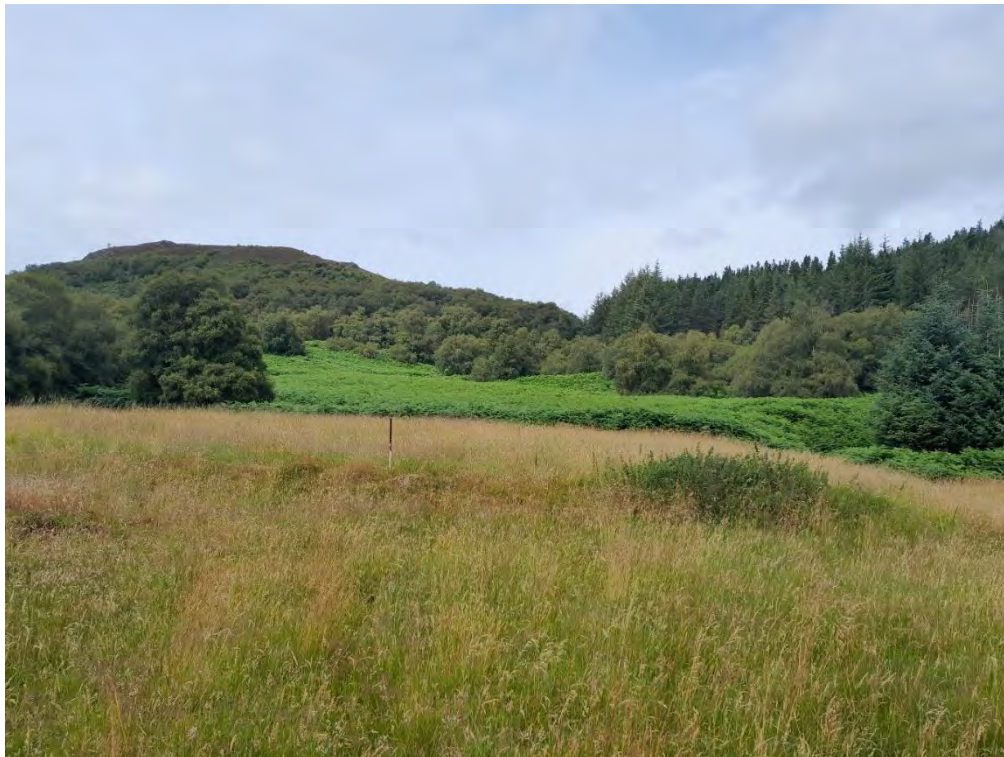
Plate 548: Dyke (Asset 865.1), facing north-northwest