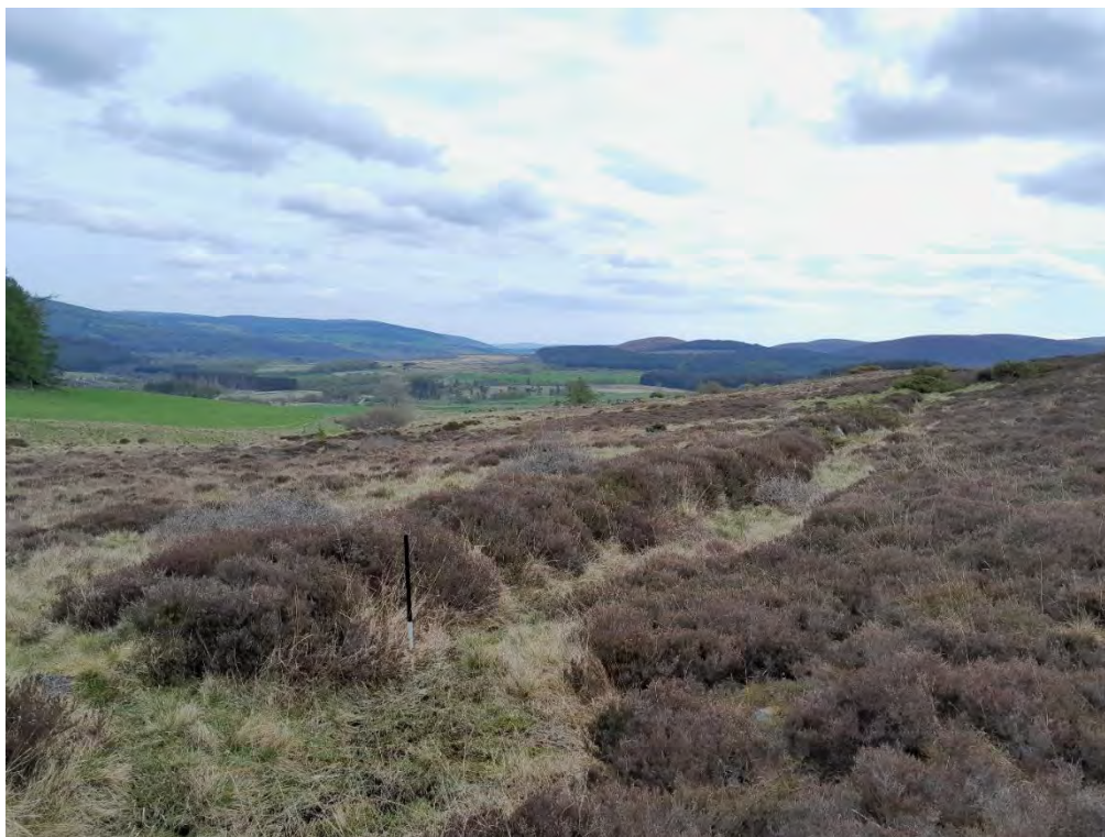
Plate 567: Dyke (Asset 360), facing east