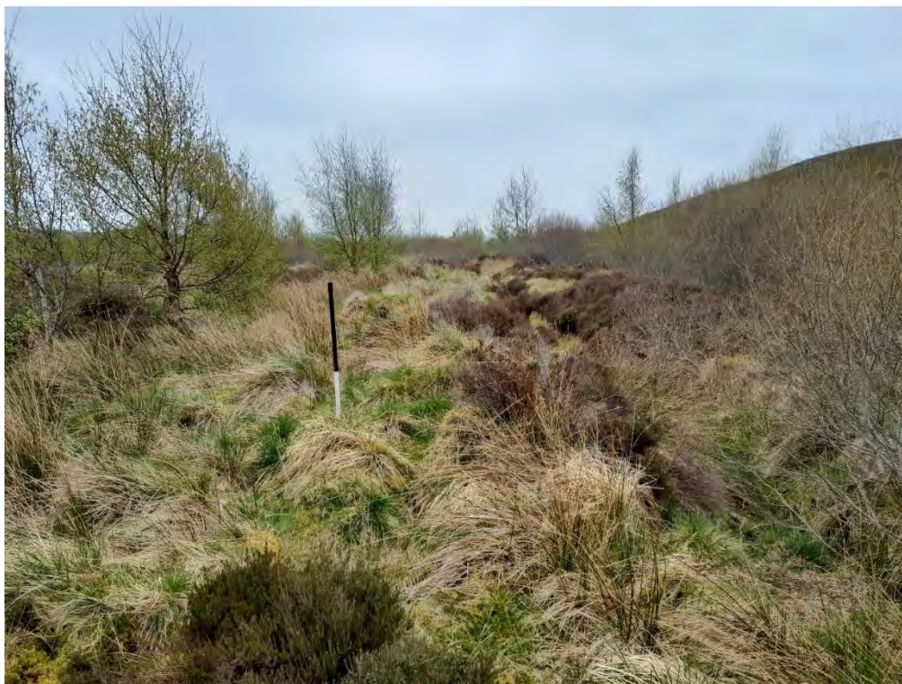
Plate 587: Dyke (Asset 344), facing south