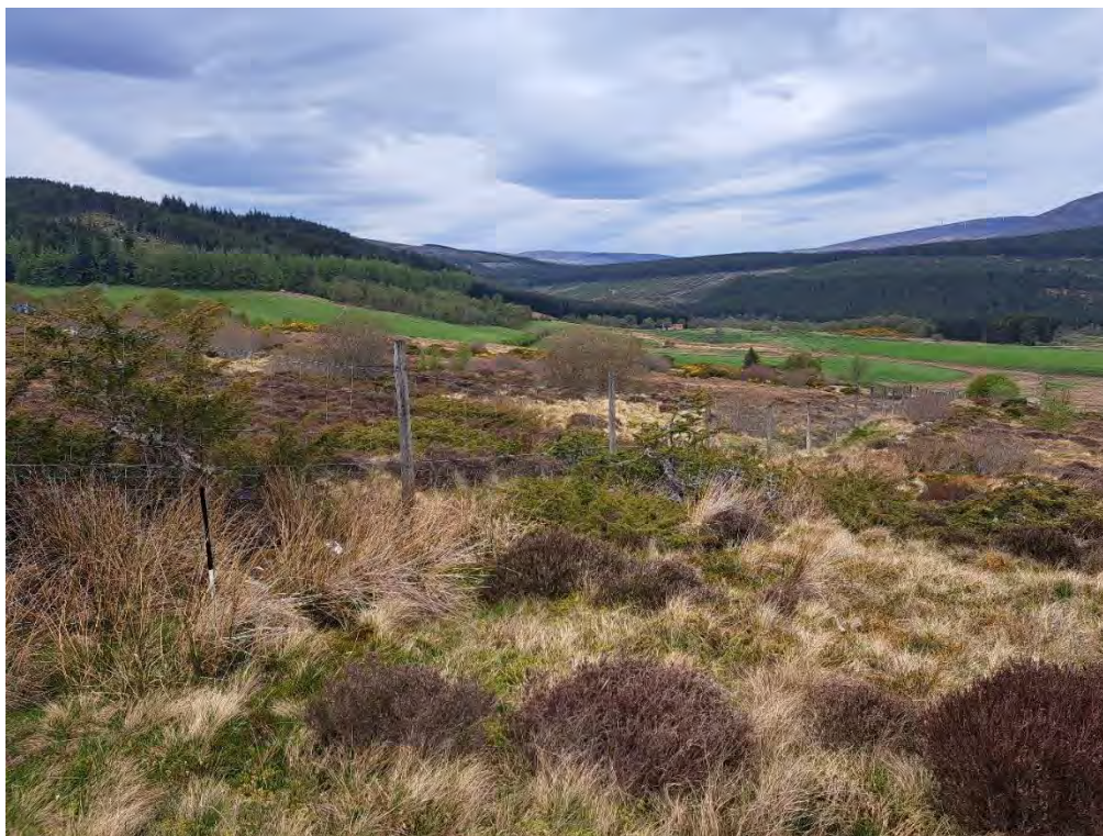
Plate 581: Dyke (Asset 363), facing north