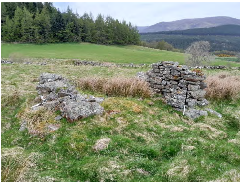
Plate 574: Building (Asset 167.5), facing north