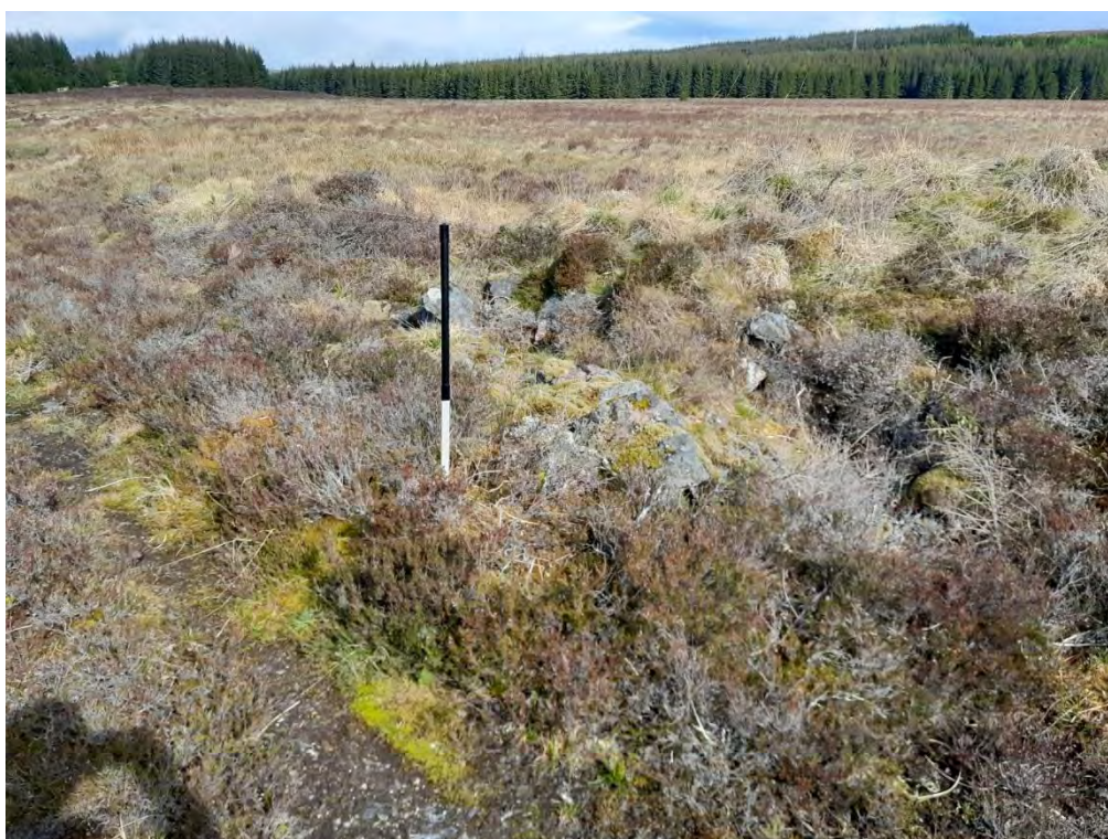
Plate 532: Clearance cairn (Asset 575), facing north