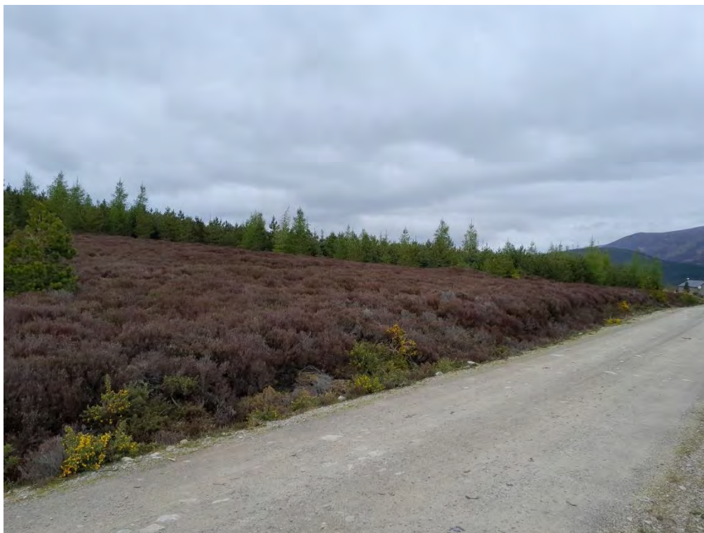
Plate 589: Hut circle (Asset 179.4; MHG28205) and clearance cairns beyond forestry, facing north