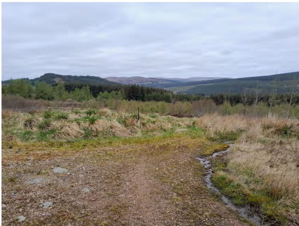
Plate 583: Gravel bund (Asset 341.1), facing north