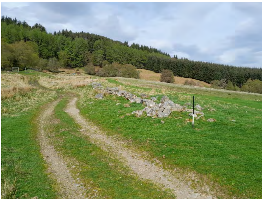
Plate 557: Dyke (Asset 355), facing northwest