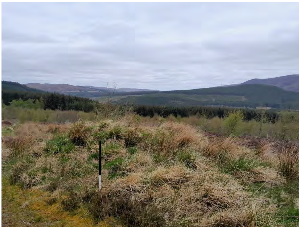
Plate 585: Soil bund (Asset 341.1), facing northeast