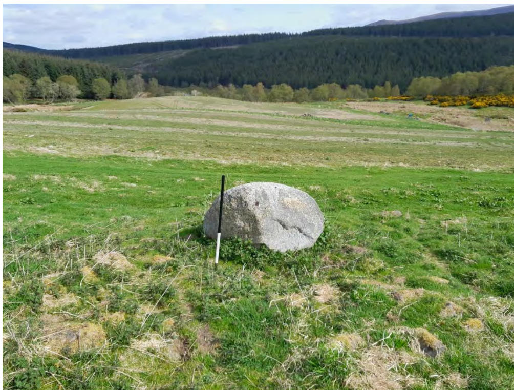
Plate 561: Clearance cairn (Asset 384.4), facing north