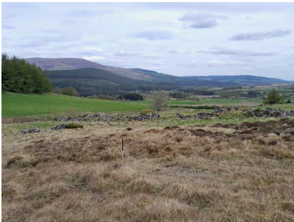
Plate 577: Enclosure (Asset 167.7), facing north-northeast