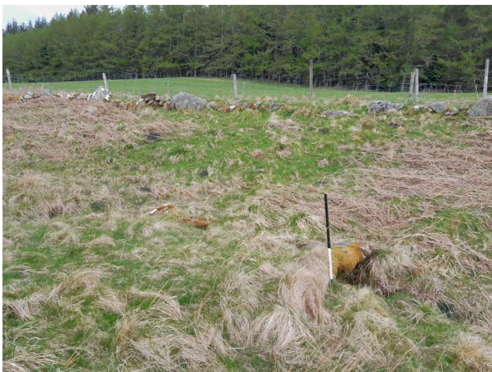
Plate 570: Bridge (Asset 358), facing north-northwest