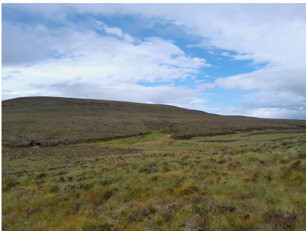
Plate 546: Drainage ditches, or peat grips (Assets 951.3-951.5; left to right), facing northwest