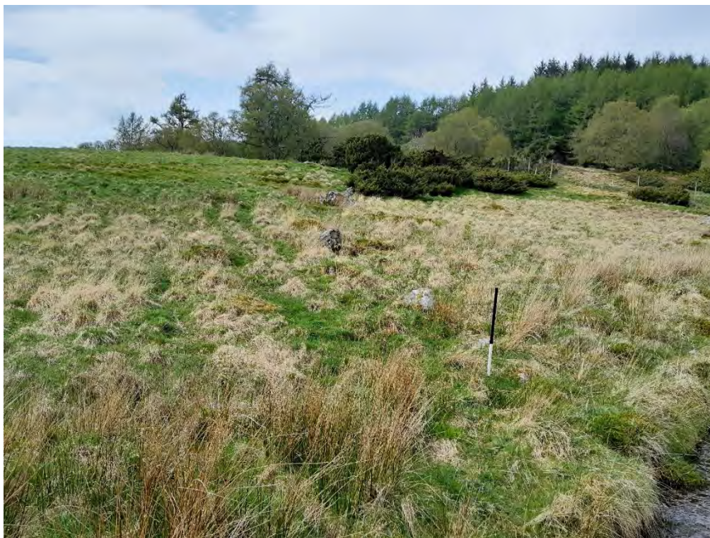
Plate 565: Dyke (Asset 356), facing southwest