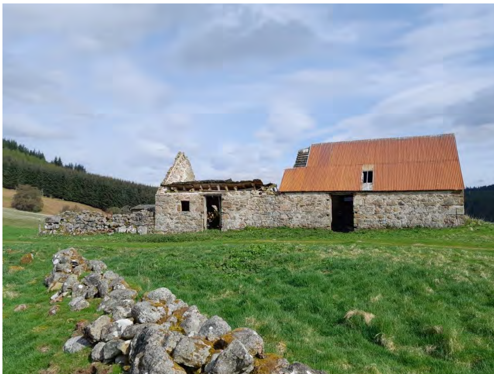
Plate 553: Buildings (Assets 351.1; right and 351.2; left), facing north-northwest