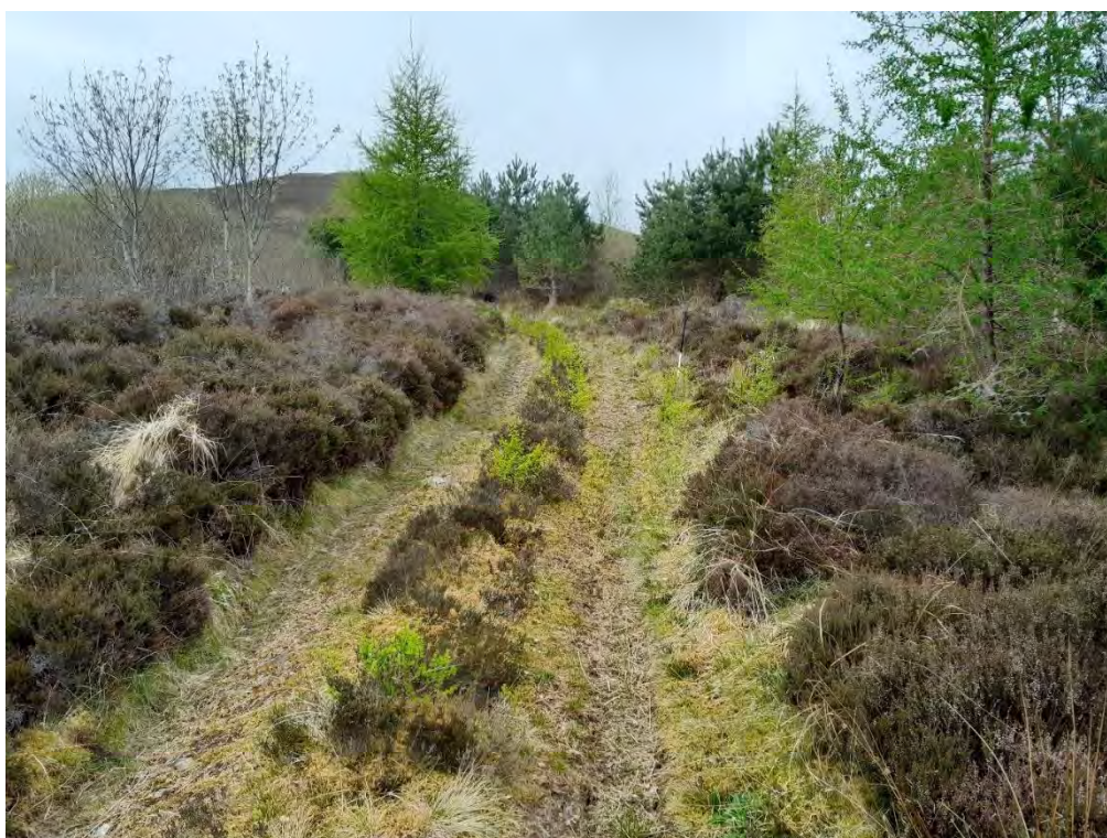
Plate 582: Track (Asset 340), facing south