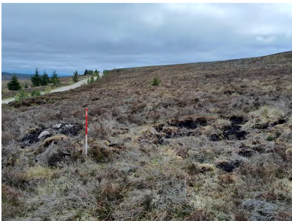
Plate 590: Deer salt-lick (Asset 339.2), facing east