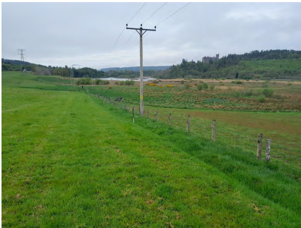
Plate 537: Dyke (Asset 580), facing south