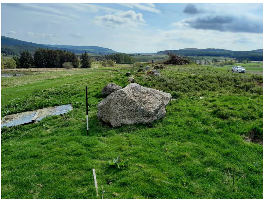
Plate 562: Clearance cairn (Asset 353), facing east