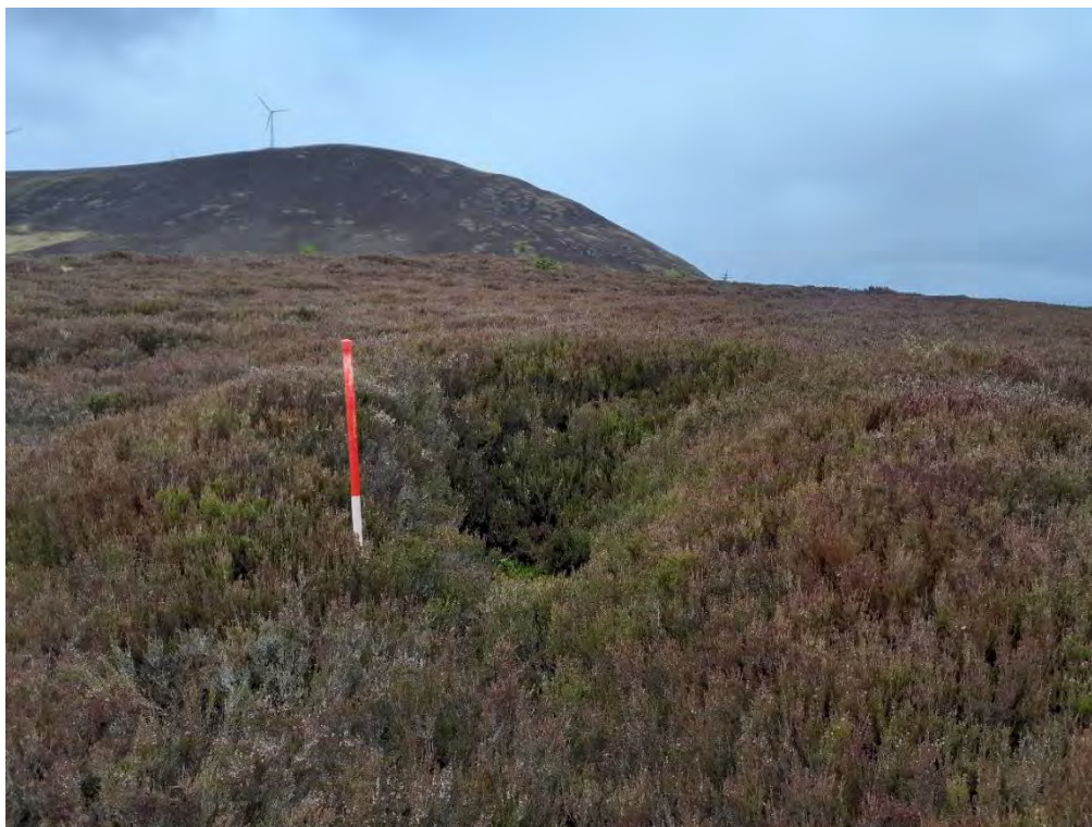
Plate 595: Shooting butt (Asset 338.2), facing northwest