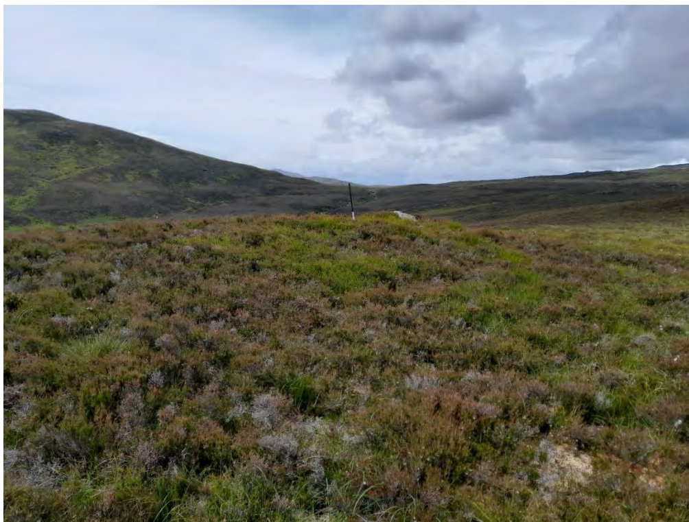
Plate 543: Hut circle (Asset 953), facing west-southwest