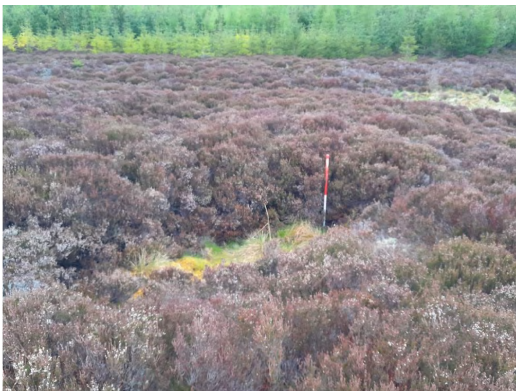
Plate 596: Shooting butt (Asset 337.1), facing north