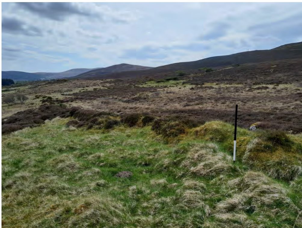
Plate 569: Dyke (Asset 359), facing south