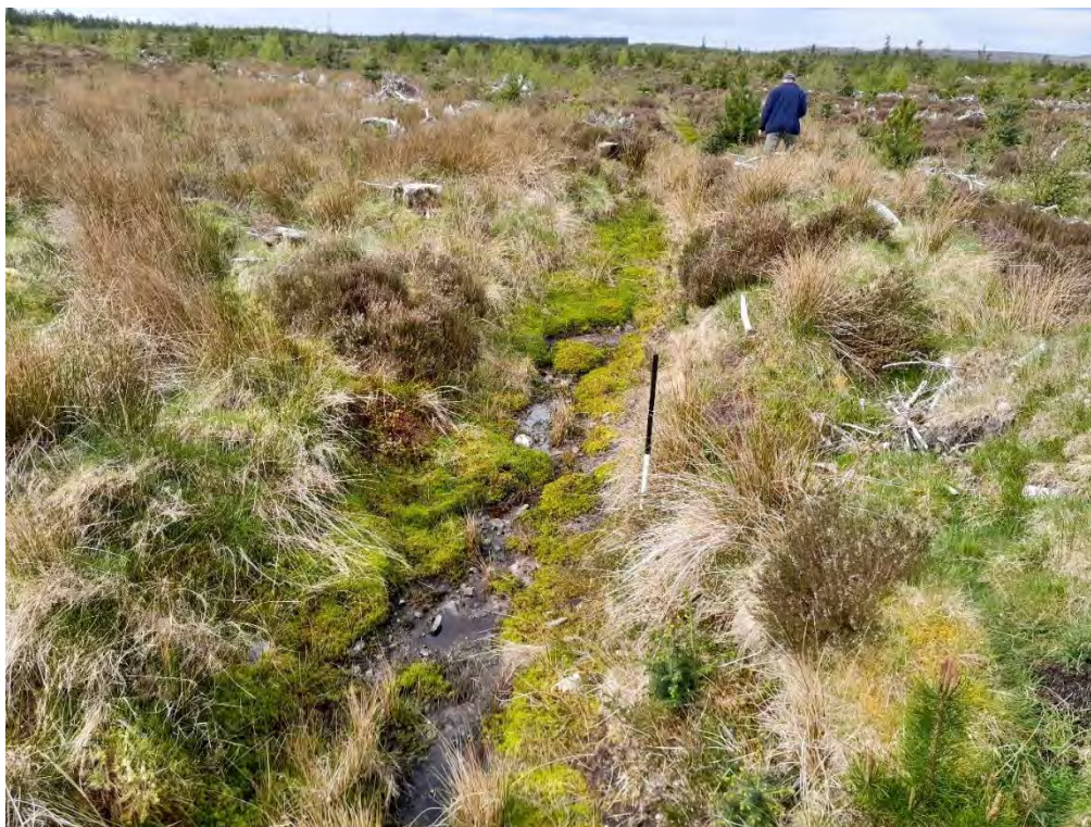
Plate 539: Drainage ditch (Asset 573), facing west