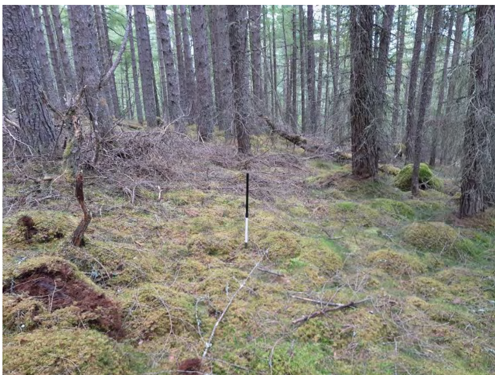
Plate 538: Possible hut circle or cairn (Asset787; MHG62766), facing southeast