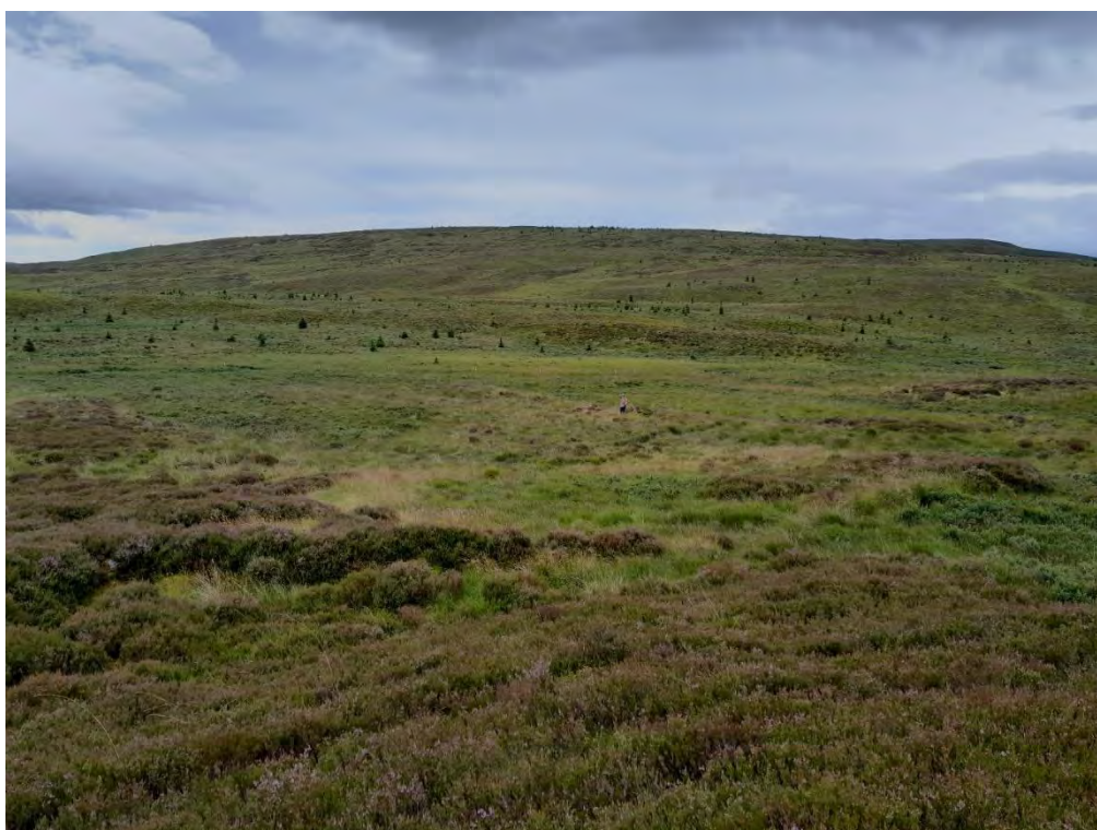
Plate 530: Enclosure (Asset 847; MHG10053), facing south-southeast