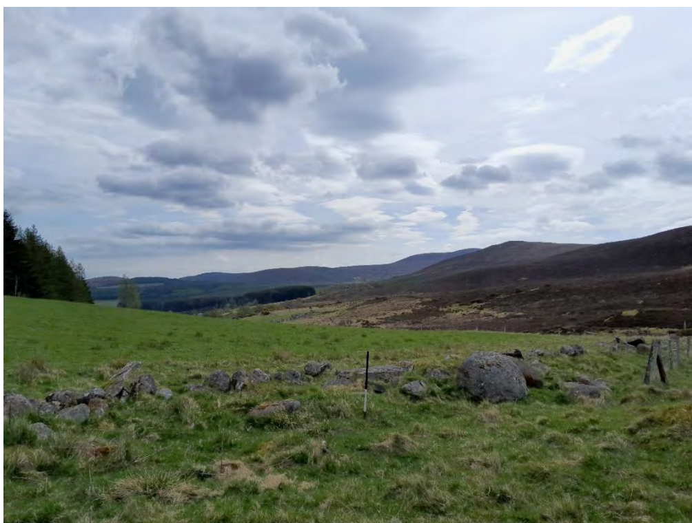
Plate 568: Dyke (Asset 357), facing southeast