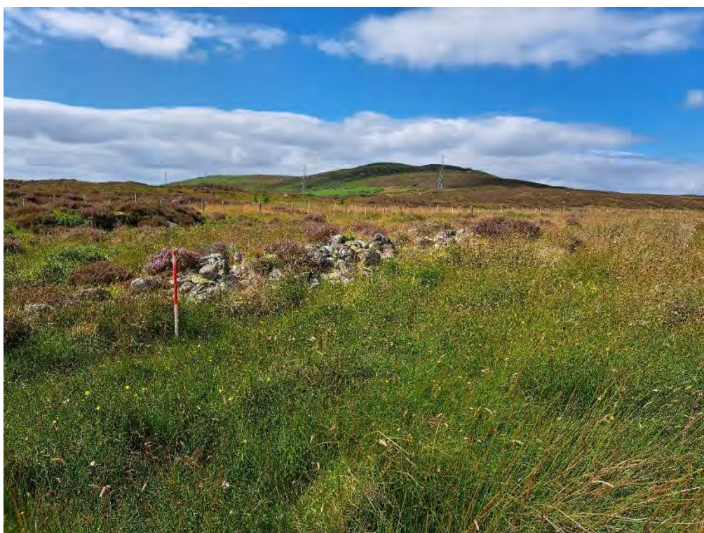
Plate 526: Dyke (Asset 858), facing northwest