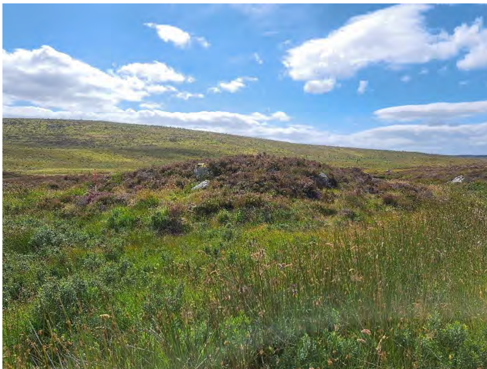
Plate 529: Possible cairn (Asset 861), facing southwest