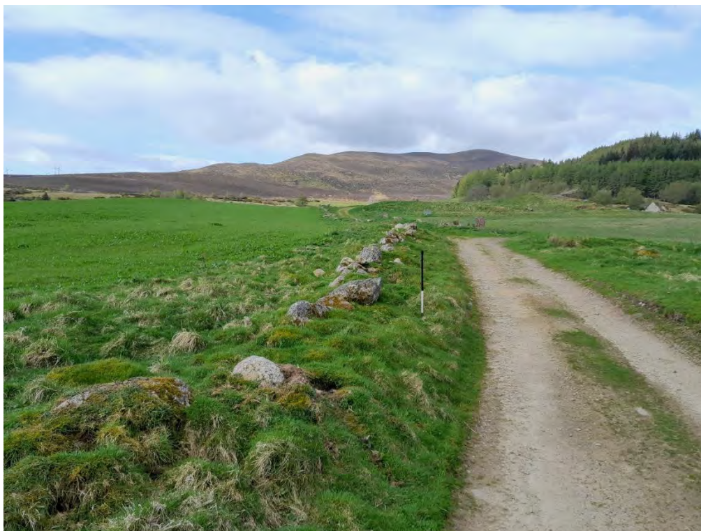
Plate 551: Enclosure (Asset 346), facing southwest