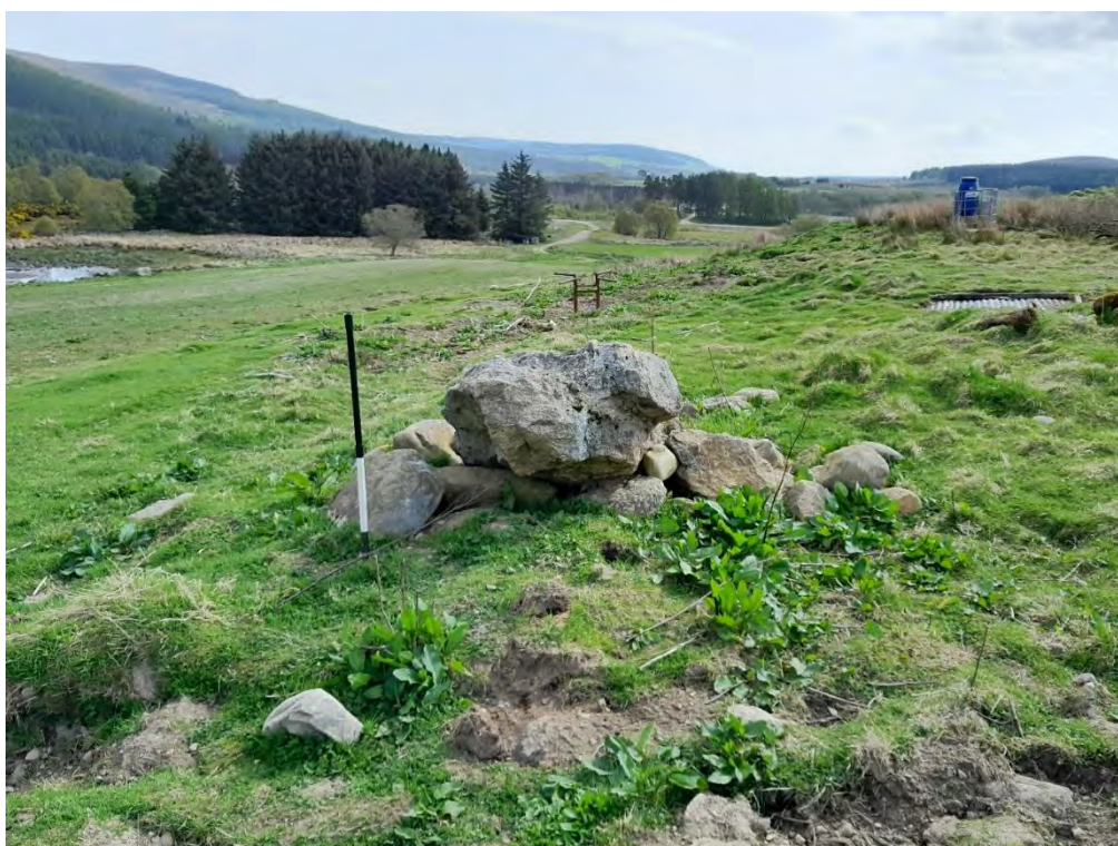
Plate 560: Clearance cairn (Asset 348.3), facing east