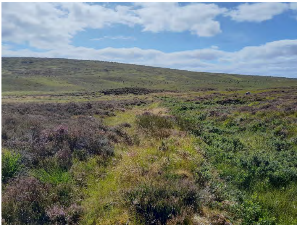
Plate 527: Dyke (Asset 859), facing south