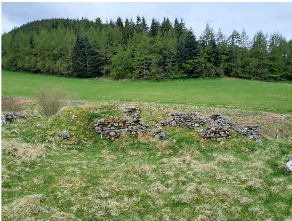
Plate 571: Kiln barn (Asset 167.4), facing northwest