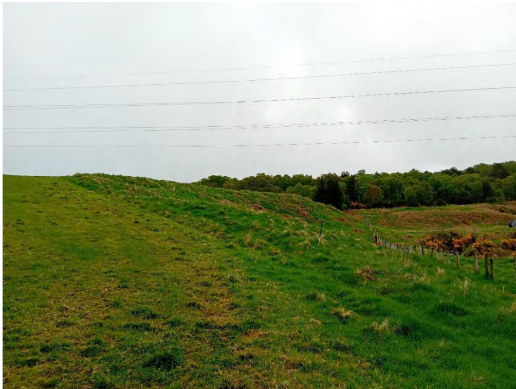
Plate 536: Possible earthwork (Asset 581.1), facing southeast