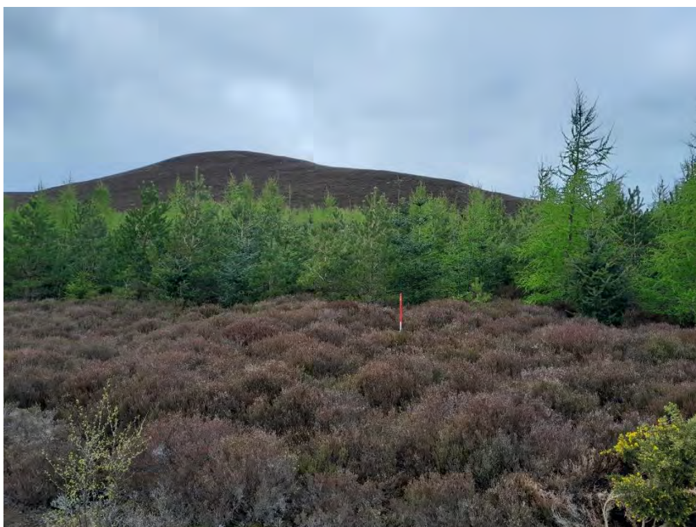
Plate 588: Hut circle (Asset 179.1; MHG28205), facing west