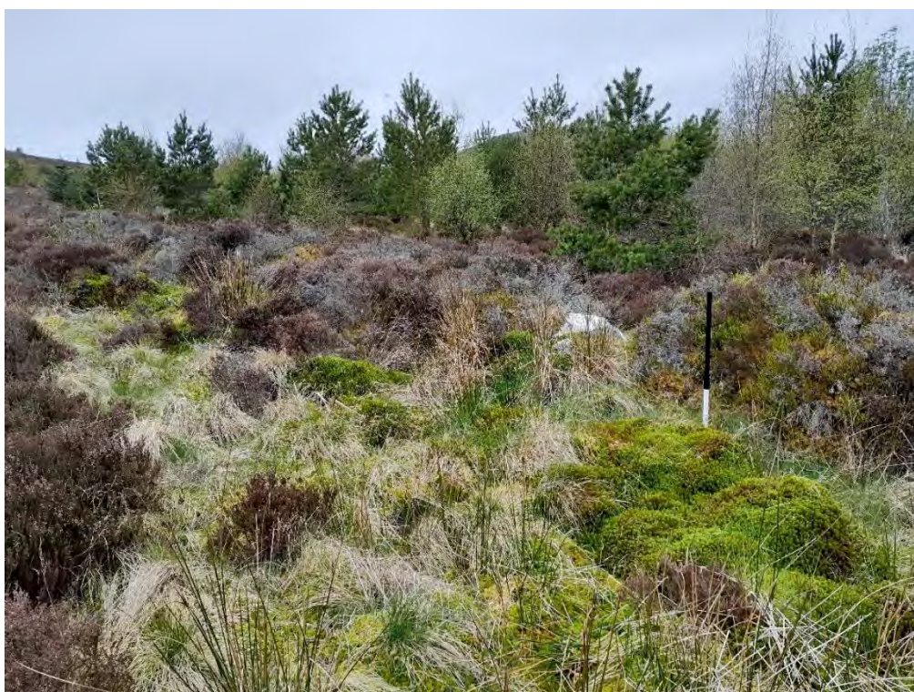
Plate 586: Dyke (Asset 342), facing west