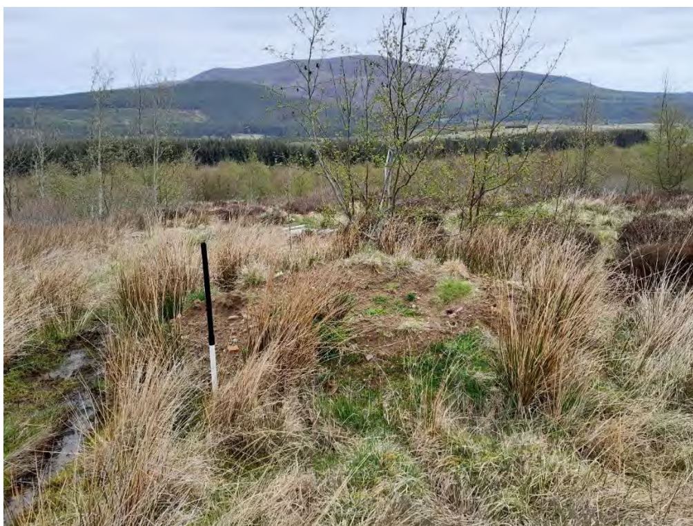
Plate 584: Soil bund (Asset 341.2), facing north