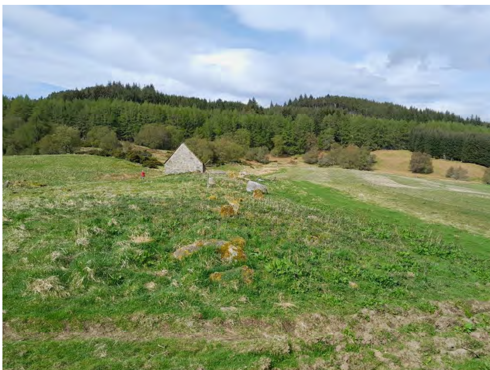
Plate 556: Dyke (Asset 352), facing west