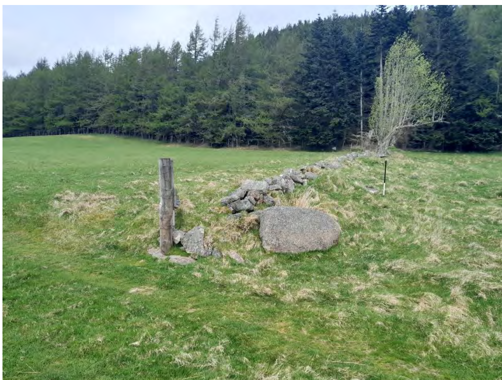
Plate 566: Dyke (Asset 361), facing north