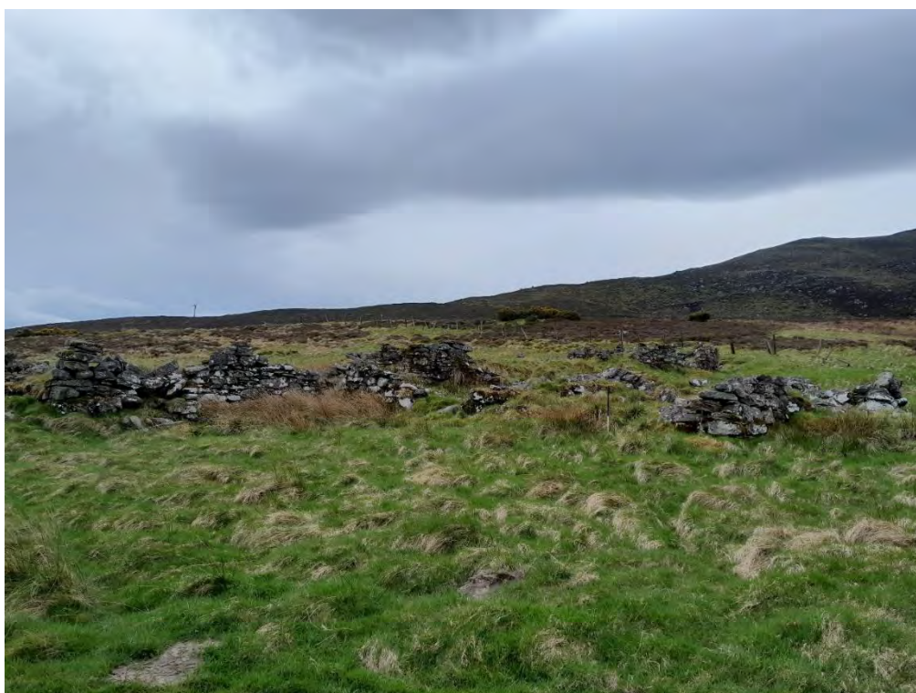
Plate 572: Building (Asset 167.6), facing southwest