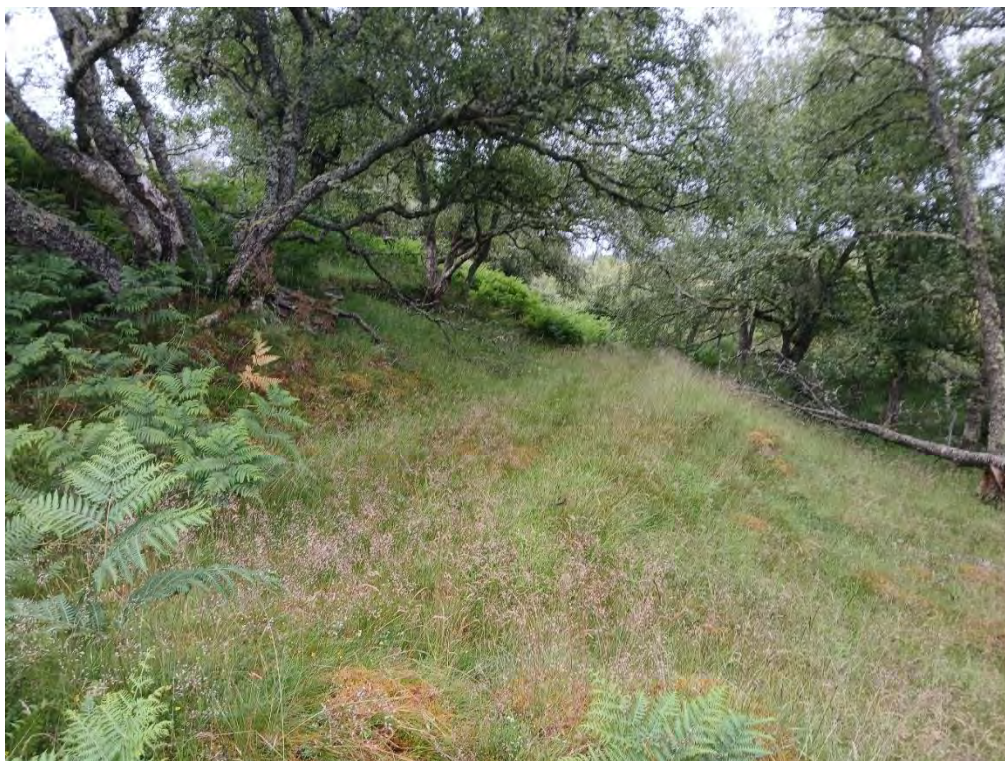
Plate 541: Dyke (Asset 1022), facing east