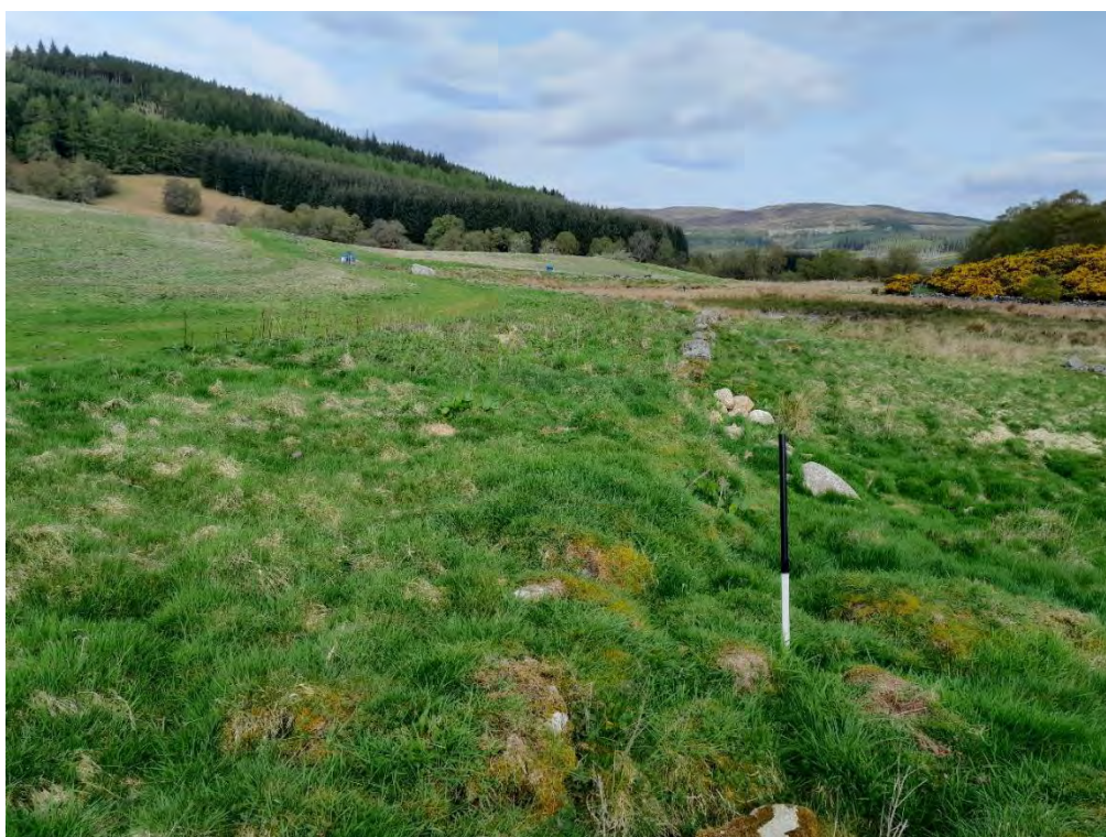
Plate 552: Enclosure (Asset 347), facing northwest