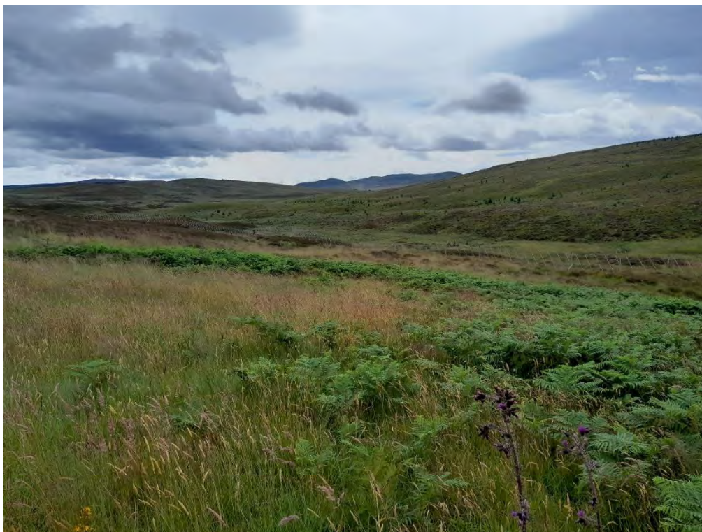
Plate 531: Bank (Asset 845), facing southeast