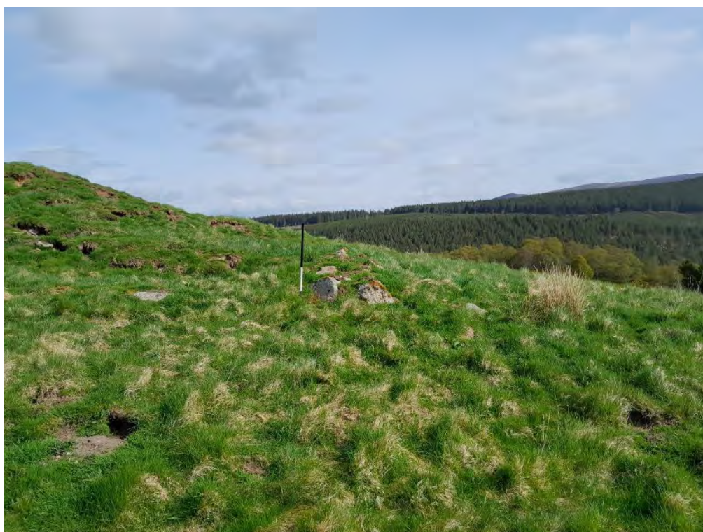
Plate 558: Clearance cairn (Asset 348.1), facing north