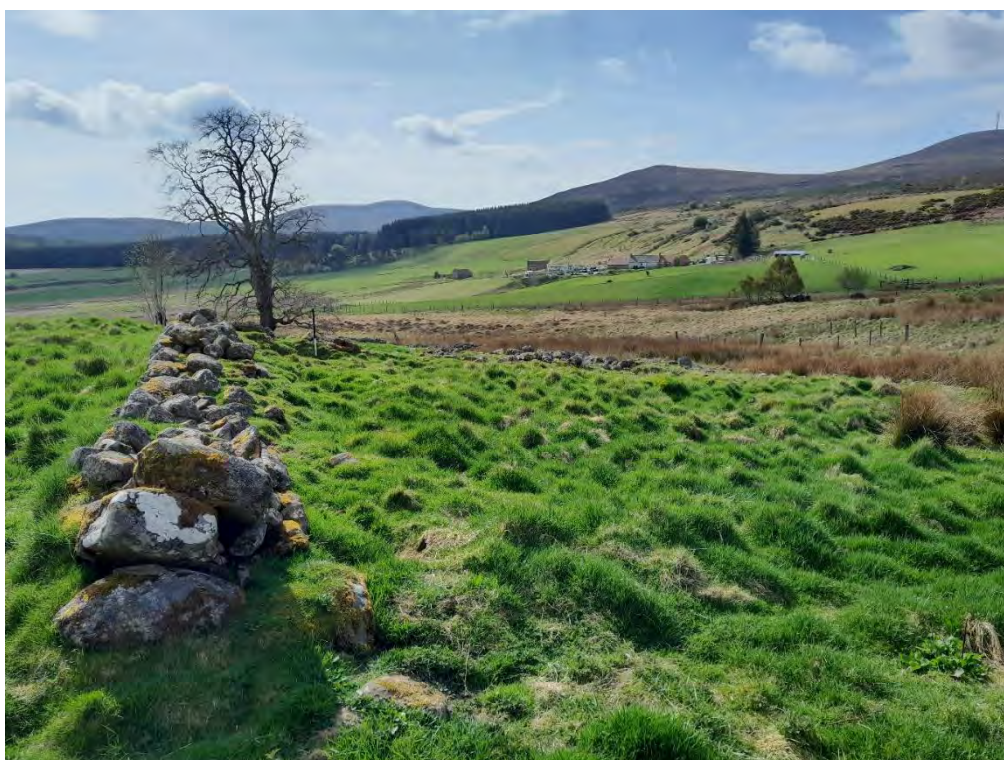
Plate 564: Dyke (Asset 349), facing southeast