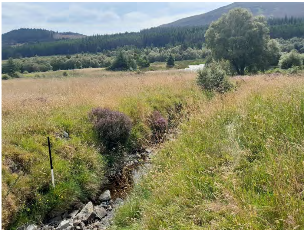
Plate 549: Lade (Asset 863), feeding artificial pond (Asset 864) beyond, facing south-southeast