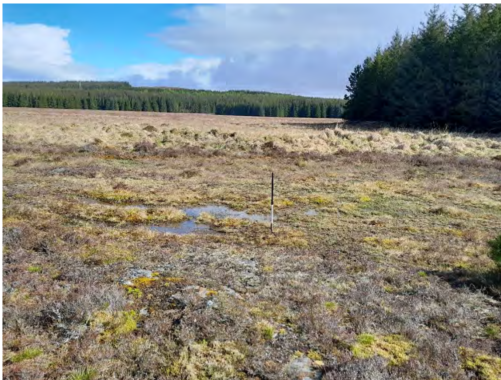
Plate 533: Dyke (Asset 576) in background, likely modern and related to a turning circle for forestry operations, facing north