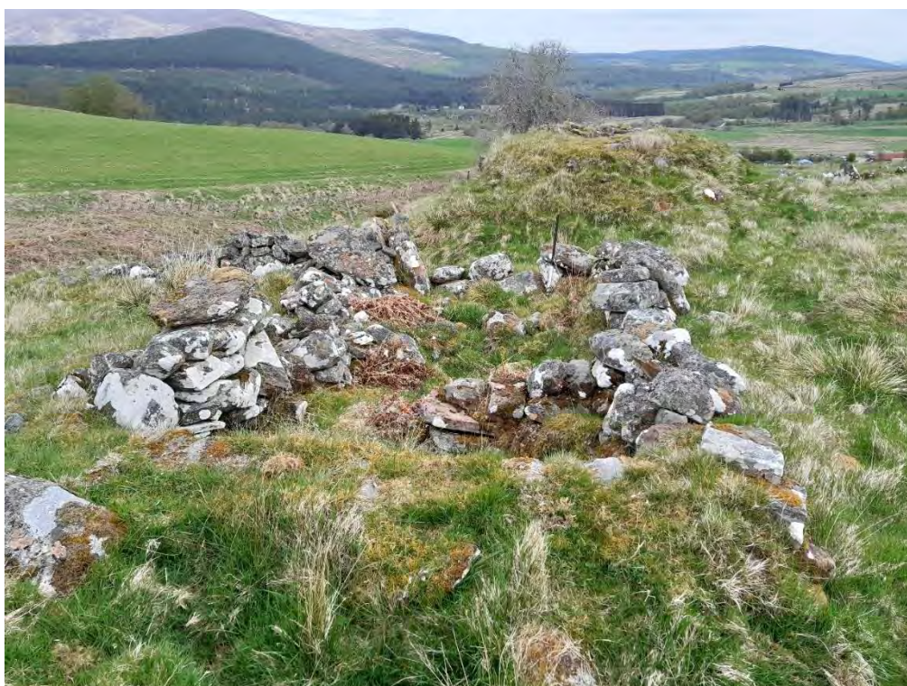
Plate 576: Pen (Asset 167.3) adjacent to enclosure (Asset 167.2), facing northeast