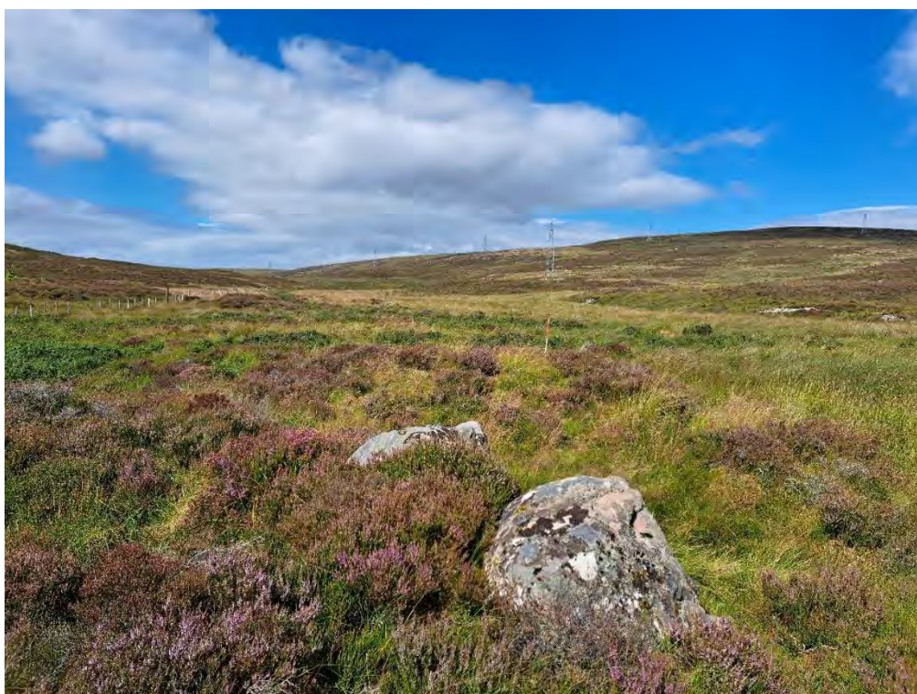
Plate 528: Possible building footings (Asset 860), facing north