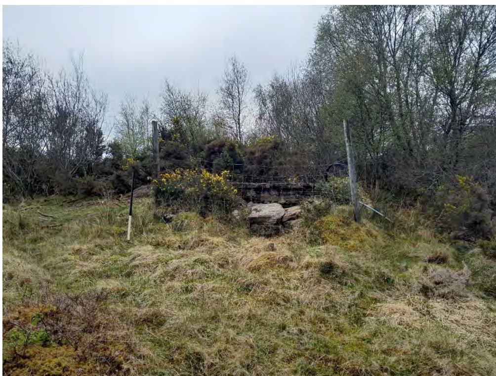
Plate 580: Water cistern (Asset 364), facing south