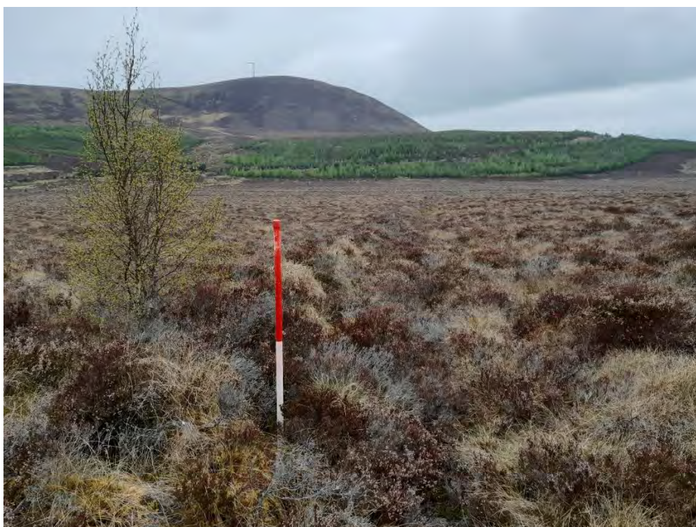
Plate 598: Drainage ditch, or peat grip (Asset 336.1), facing north