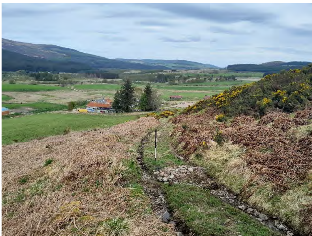
Plate 578: Track (Asset 362), facing east