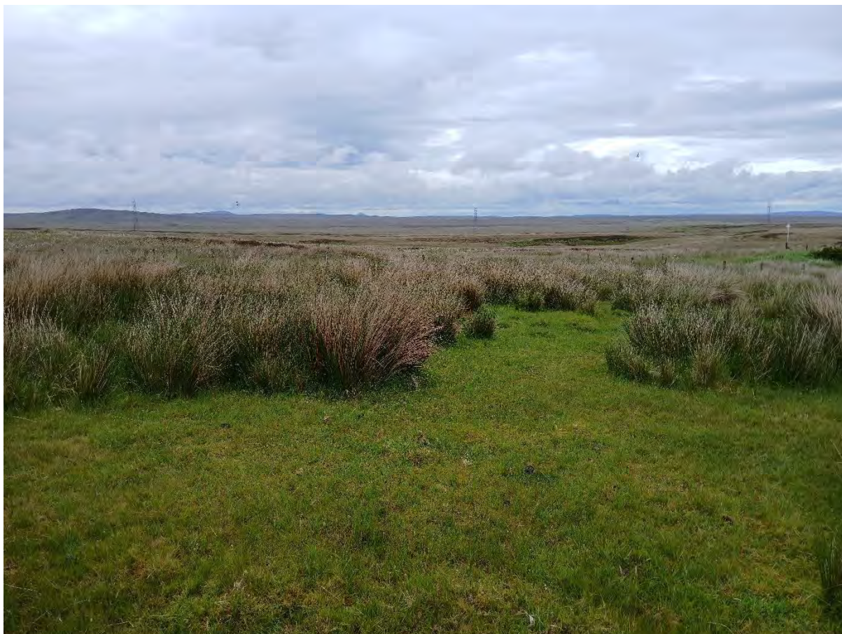
Plate 133: View west from Achkinloch chambered cairn Asset 79/SM419 and Achkinloch stone setting Asset 40/SM420 towards Proposed Development