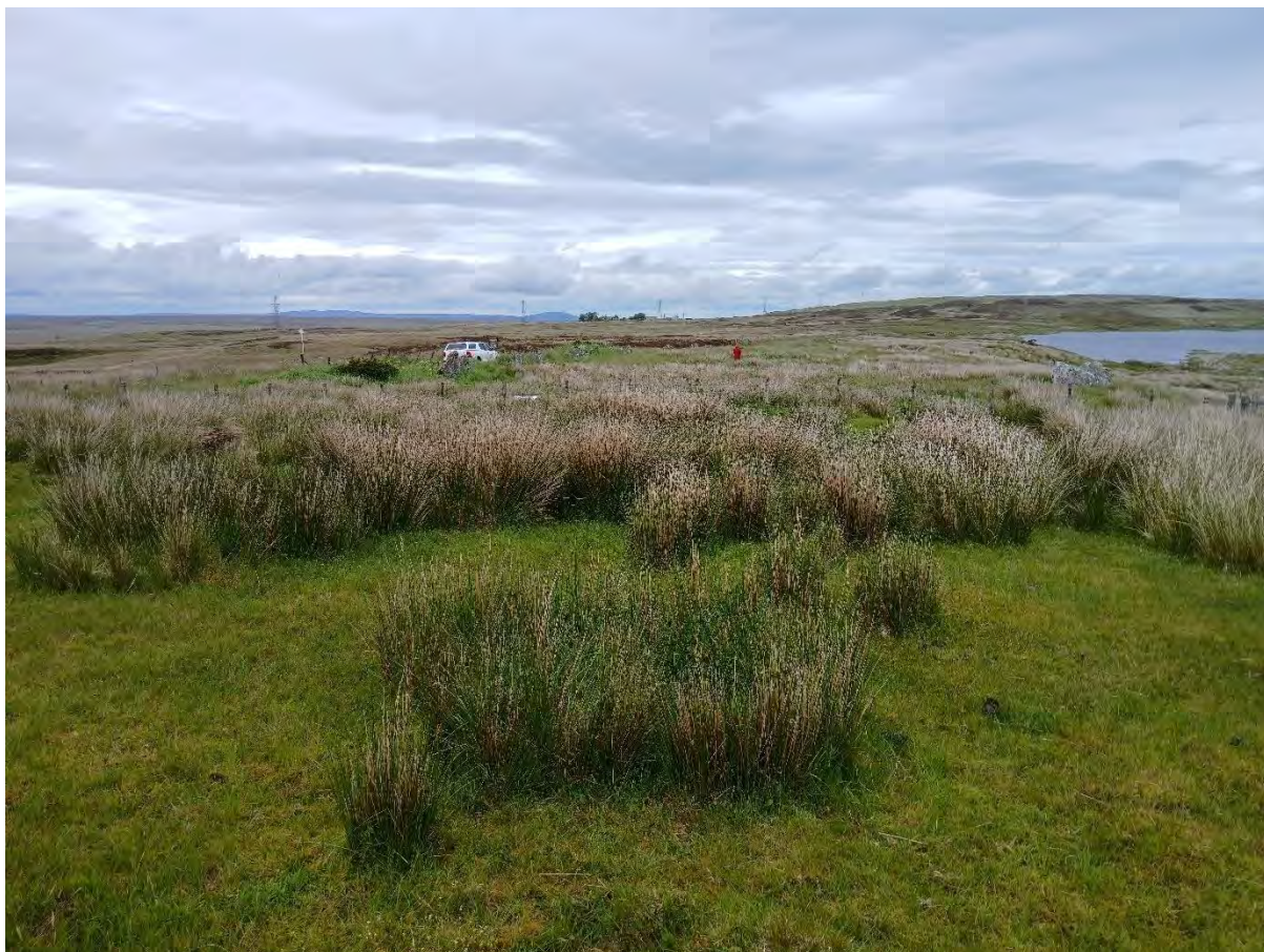
Plate 132: View northwest from Achkinloch chambered cairn Asset 79/SM419 towards Proposed Development, overlooking Achkinloch stone setting Asset 40/SM420