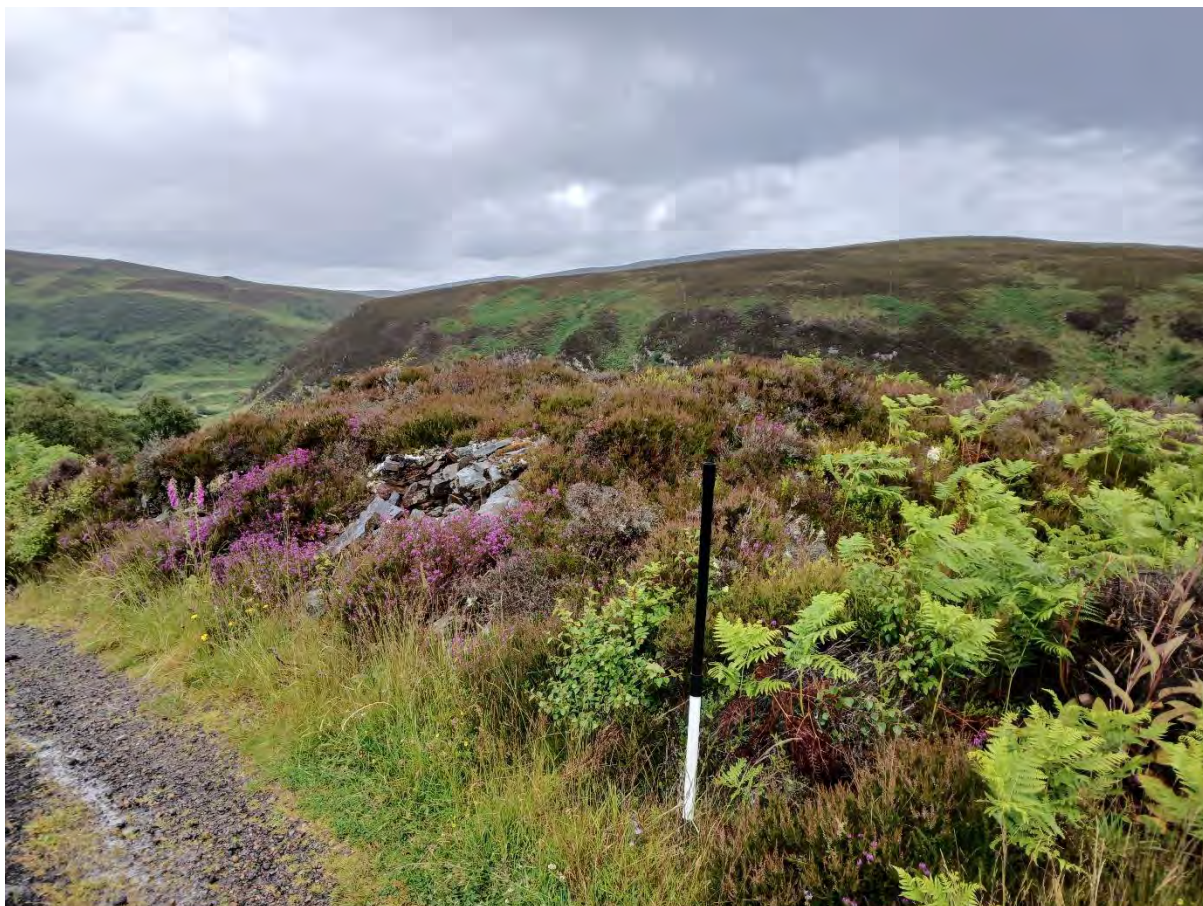
Plate 28: View northeast over Tulach Bad a Choilich broch (Asset 33/SM3477) with Tulach Bad a'Choilich prehistoric settlement Asset 32/SM3475 located atop the rise beyond