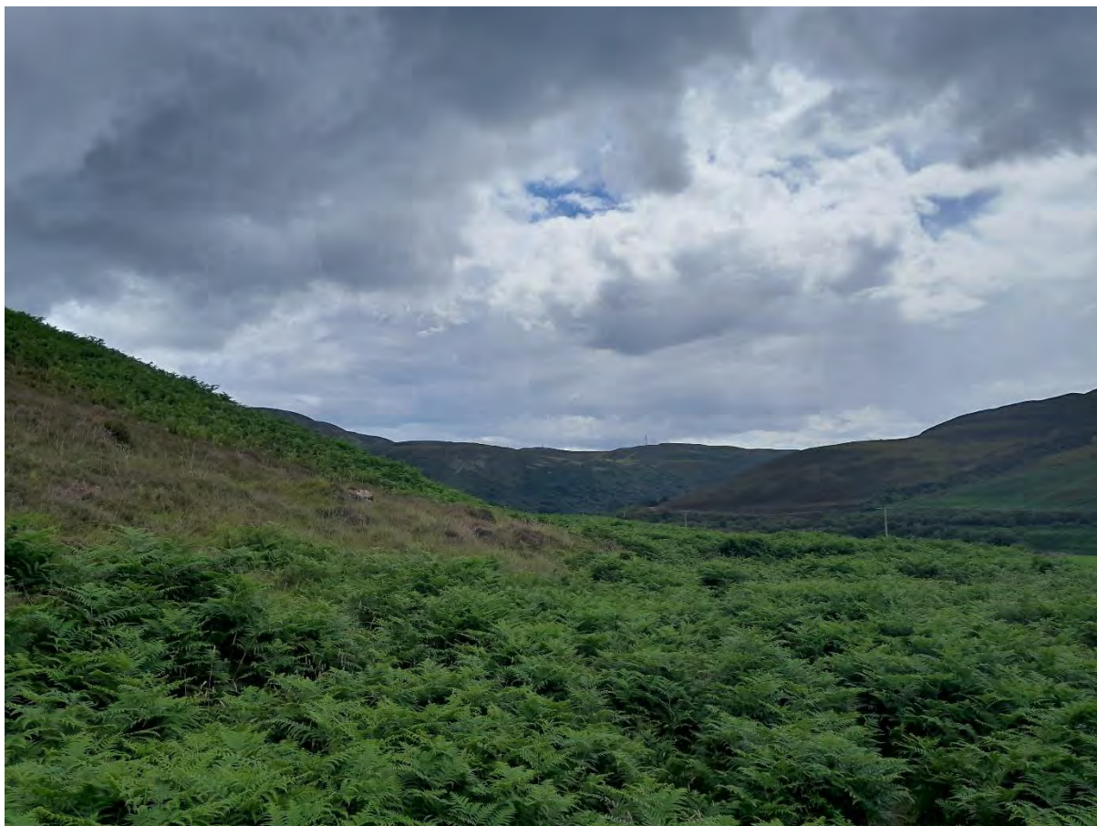
Plate 52: View southeast from Caen Burn West long cairn Asset 78/SM13647 towards Proposed Development spanning point over River Helmsdale across Strath Ullie