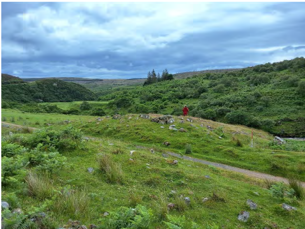
Plate 39: View southeast over Tulloch Turnal broch Asset 34/SM3440 towards spanning point of Proposed Development over Langwell Water