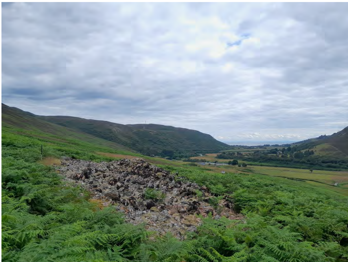
Plate 46: View south-southeast over Caen, long cairn Asset 70/SM1771