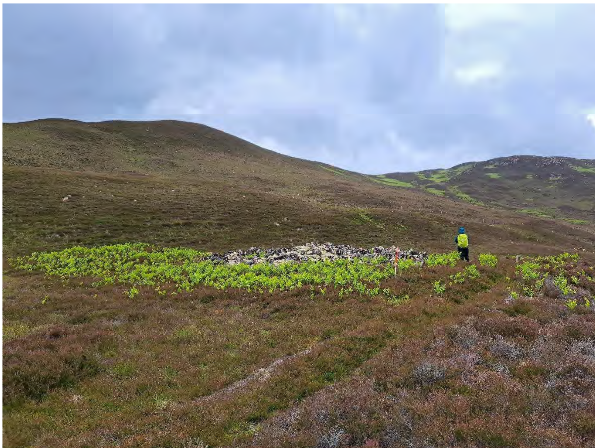
Plate 43: View northwest over Caen, long cairn Asset 52/SM432