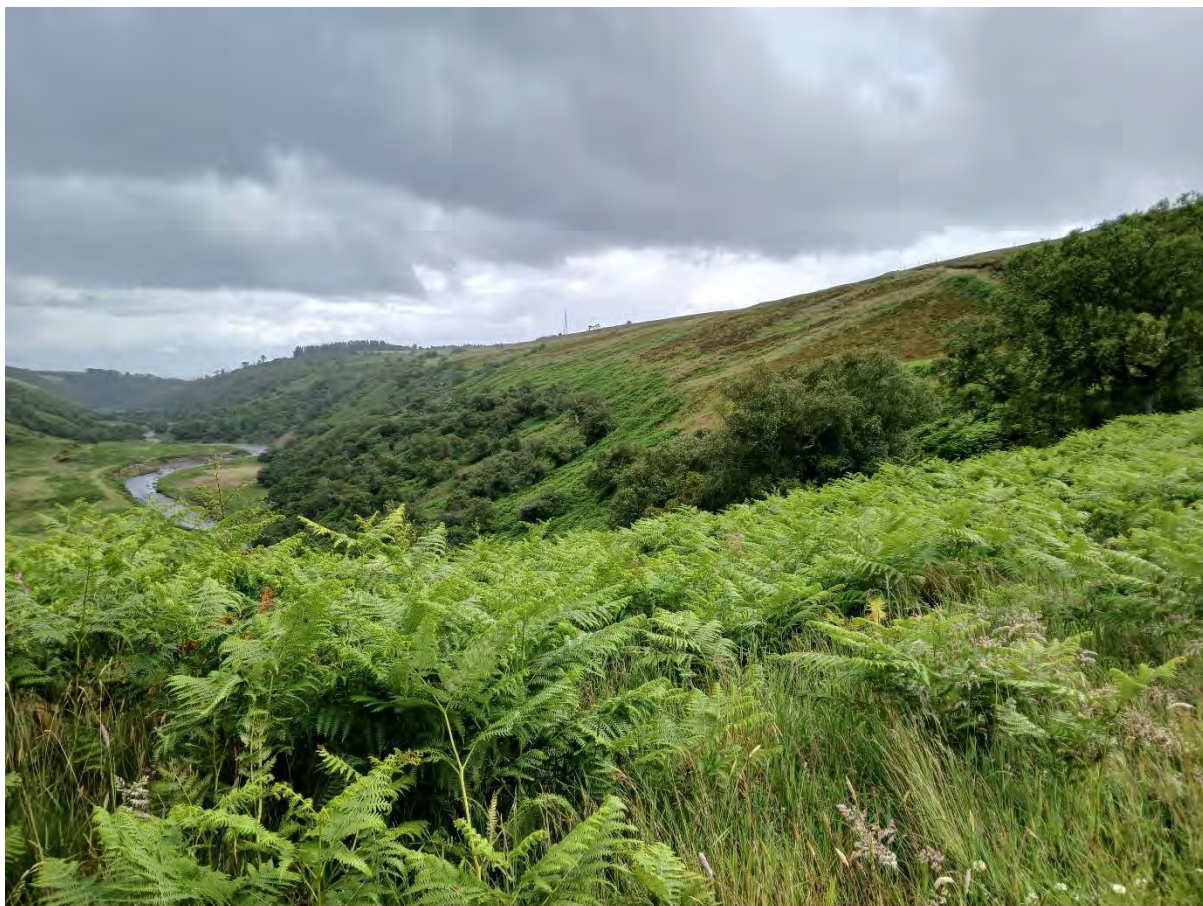
Plate 29: View southeast from Tulach Bad a Choilich broch (Asset 33/SM3477) towards the spanning point of the Proposed Development across the Berriedale Water