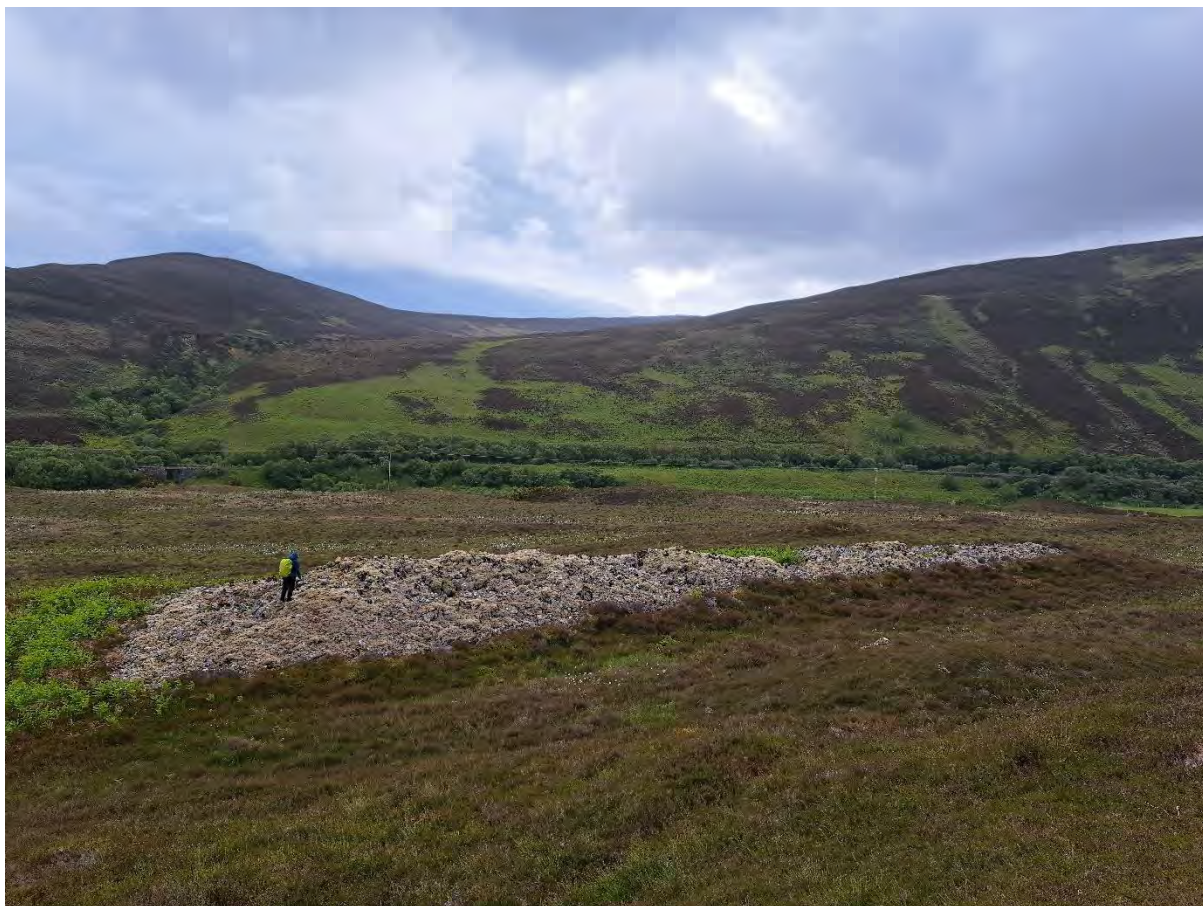
Plate 49: View south over long cairn of Asset 77/SM1770, with round cairn visible as a prominent low mound centre right, and hut circle to the right of this