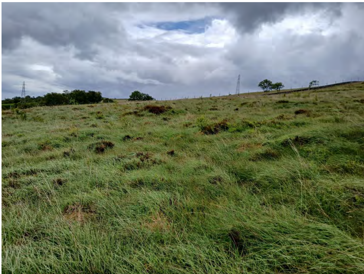
Plate 33: View south from Cnoc Fionn hut circle Asset 4/SM3559 towards Proposed Development