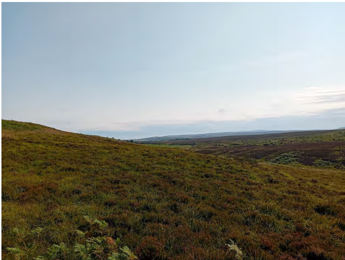
Plate 13: View south from prehistoric settlement Asset 1/SM6014 along the Houstry Burn and towards the Proposed Development