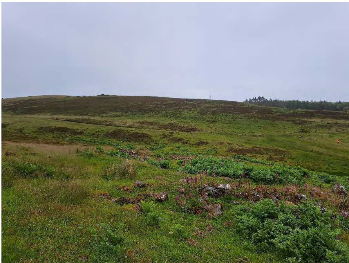
Plate 37: View east from Turnal Rock prehistoric settlement Asset 72/SM13631 towards non-designated settlement (Asset 816-819) and Proposed Development, North Tower 114 location (centre right)