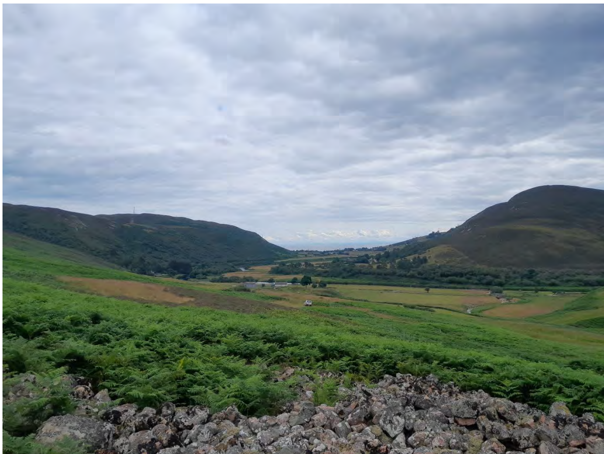
Plate 47: View south-southeast over Caen, long cairn Asset 70/SM1771 towards Helmsdale, North Tower 114 of the Proposed Development would be located in the foreground of the right side of the frame