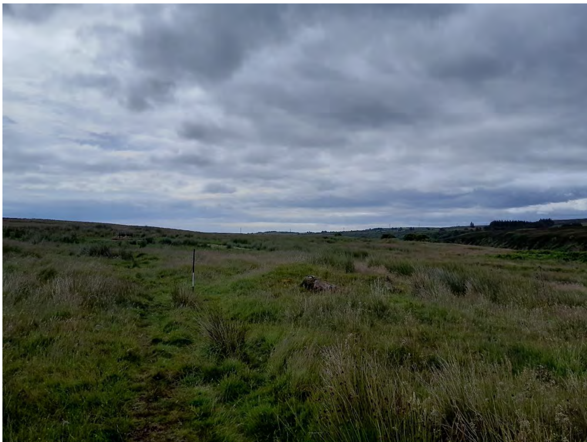
Plate 18: View southeast over Loedebest cairn Asset 15/SM5191 towards Proposed Development crossing point over the Dunbeath Water