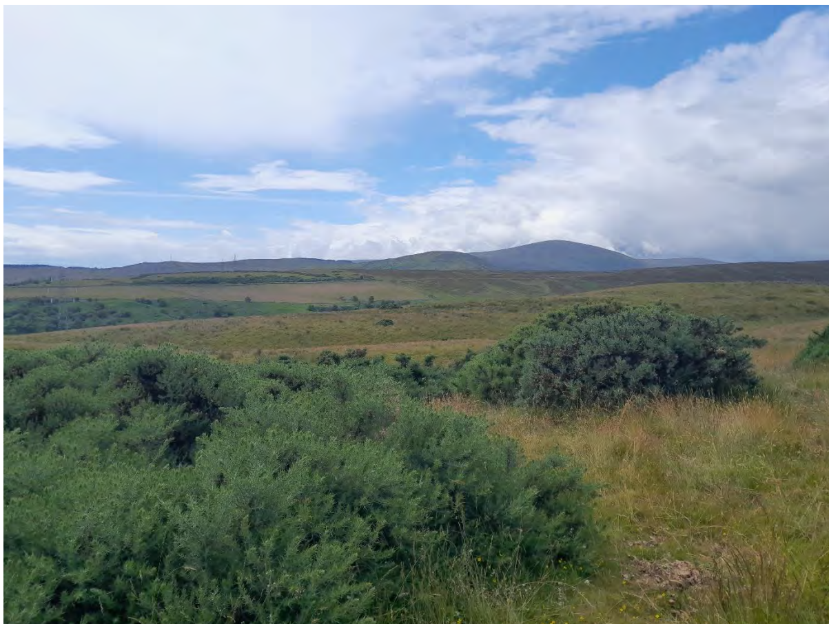
Plate 31: View west towards Proposed Development from Rinsary homestead Asset 31/SM3473