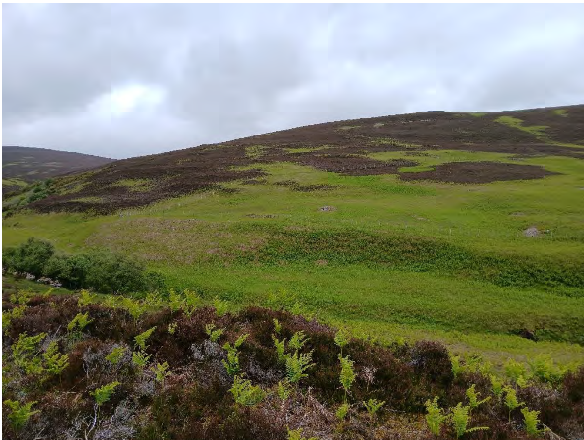
Plate 44: View northeast from Caen, long cairn Asset 52/SM432 to Caen, long cairn Asset 70/SM1771, upper right, below bracken