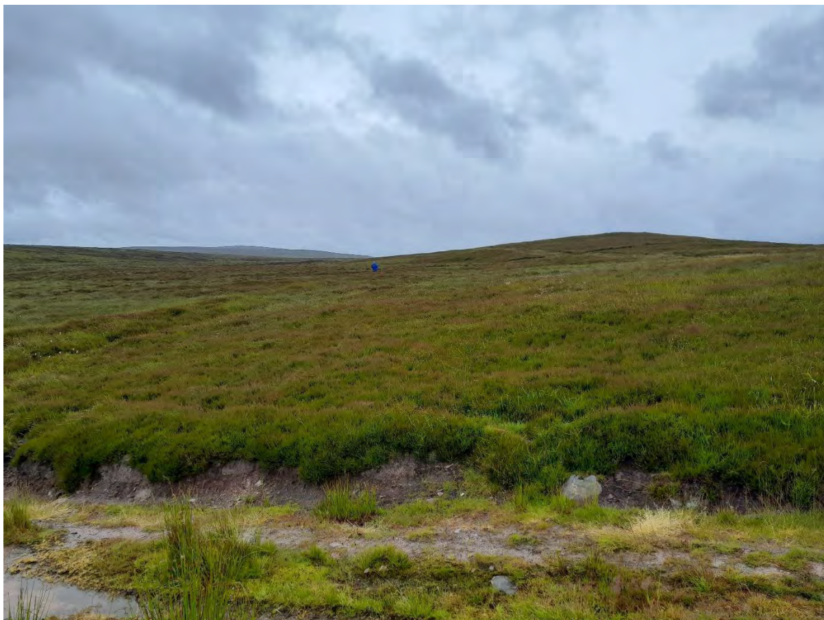
Plate 20: View north towards the Proposed Development from edge of Scheduled area for prehistoric and post-medieval settlement remains (Asset 44/SM512), and in the same sightline from Achorn broch (Asset 43/SM511; not accessible)