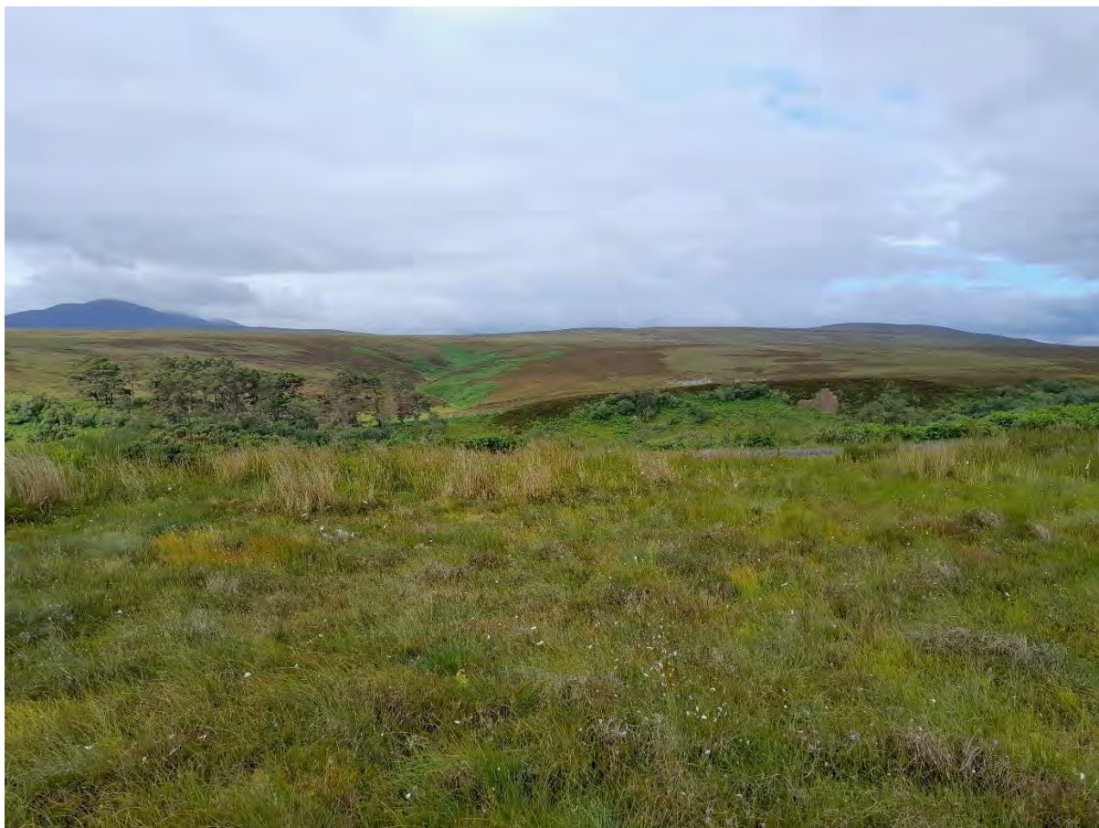
Plate 21: View northwest towards Achorn Bridge prehistoric and post-medieval settlement Asset 13/SM5150, visible on the further ridgeline and slope beyond the burn