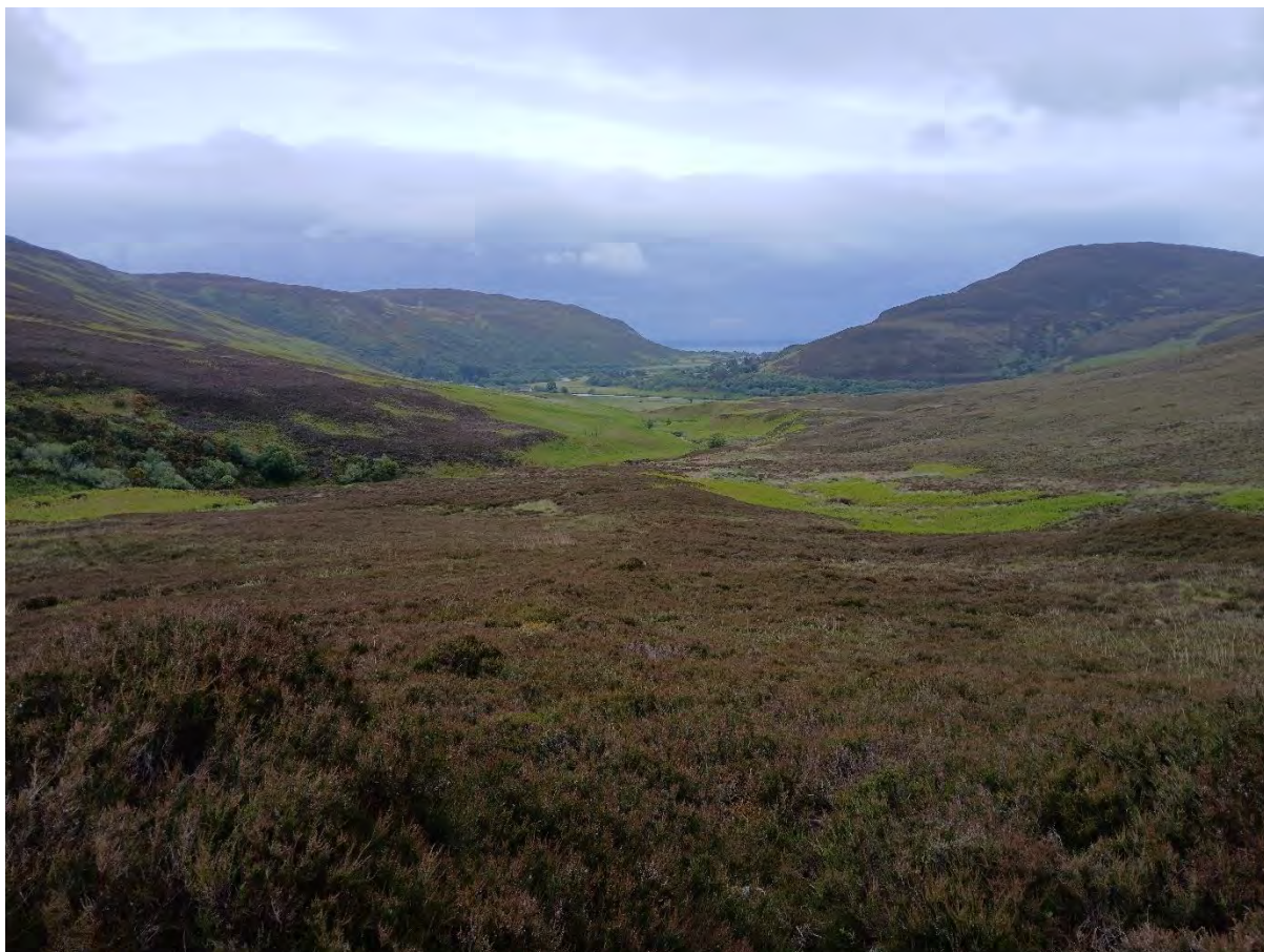
Plate 54: View south from Caen, hut circles and souterrain Asset 76/SM1841 towards Proposed Development spanning point over the Caen Burn