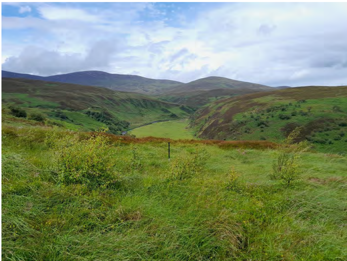
Plate 34: View over Cnoc Fionn hut circle Asset 3/SM3537, facing north