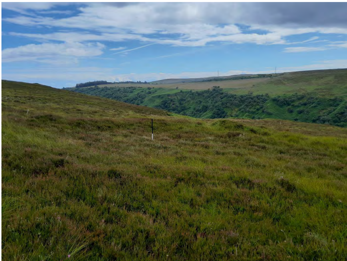
Plate 27: View over Tulach Bad a'Choilich prehistoric settlement Asset 32/SM3475 towards where Proposed Development would span the Berriedale Water