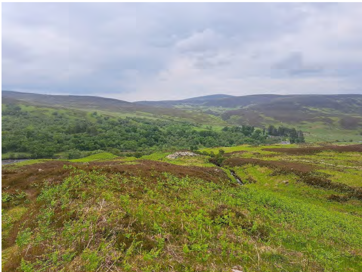
Plate 56: View northeast over Eldrable broch Asset 64/SM1863 towards Kilphedir broch Asset 65/SM1870 on opposing side of strath and other prehistoric settlement remains, upper centre right of frame