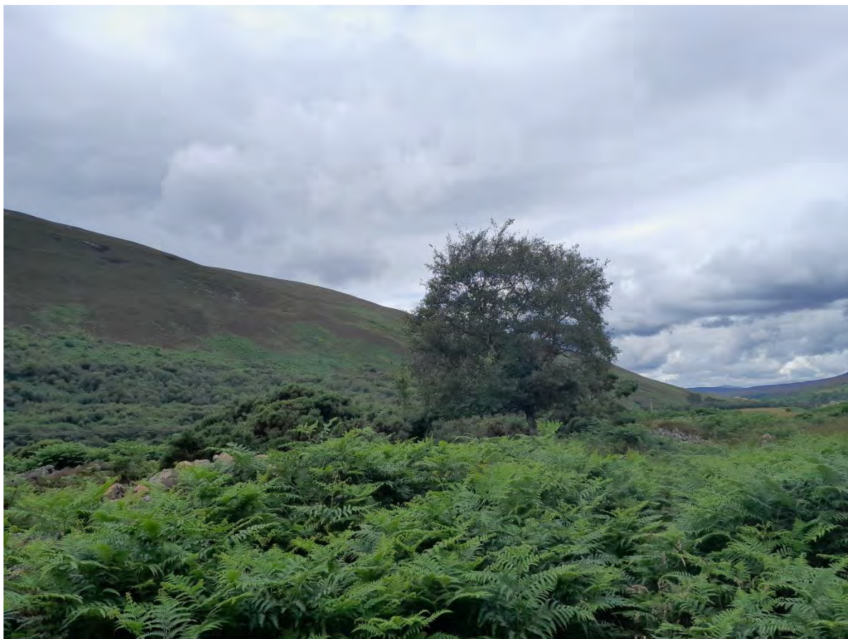
Plate 51: View west over Caen Burn West long cairn Asset 78/SM13647 under bracken