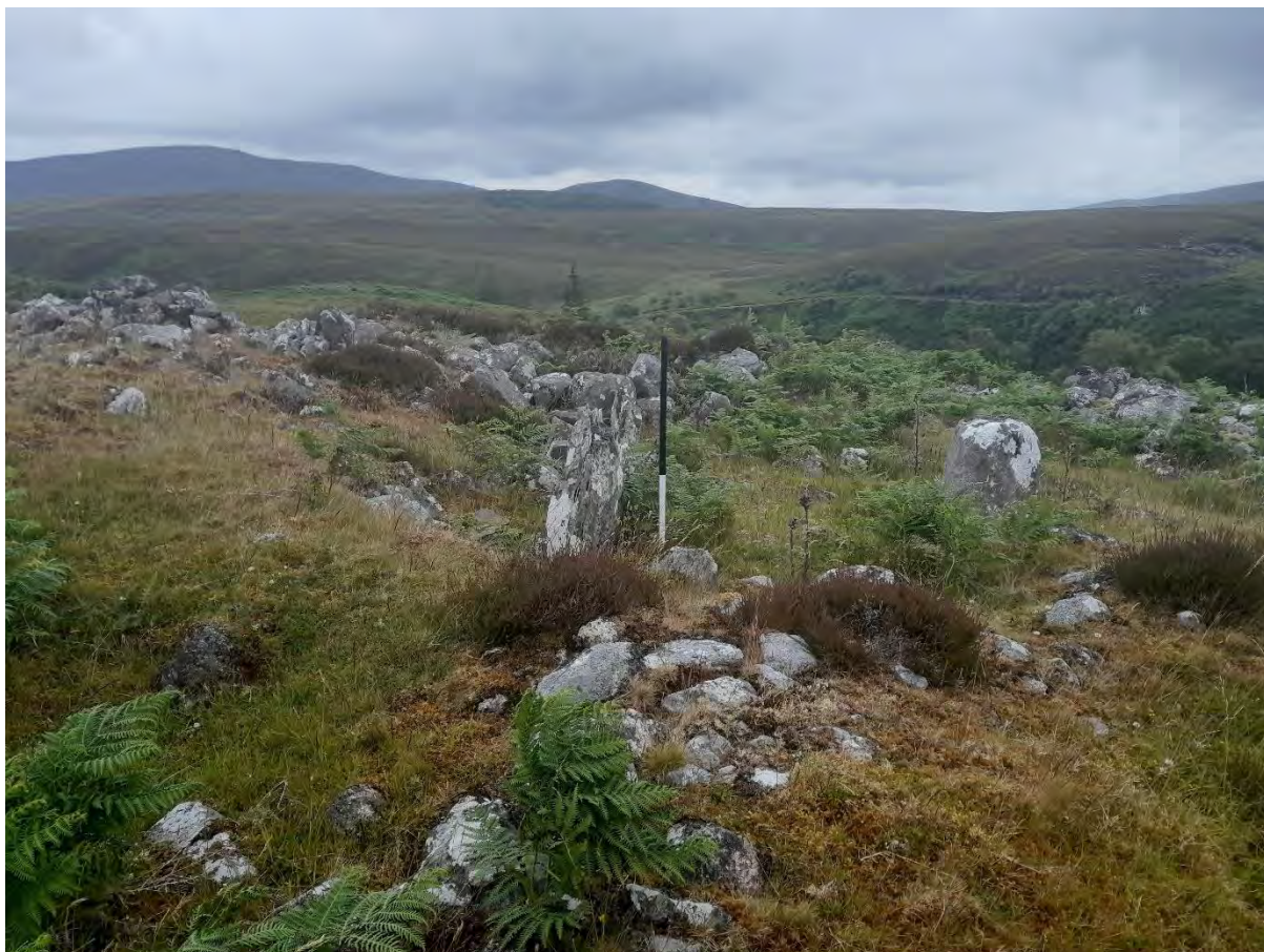
Plate 41: View north over Cnoc Bad Asgaraidh chambered cairn Asset 51/SM423