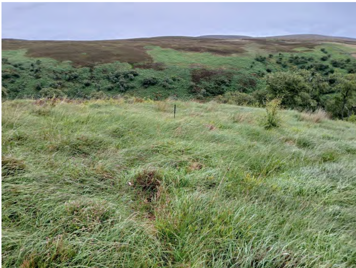
Plate 32: View over Cnoc Fionn hut circle Asset 4/SM3559, facing north