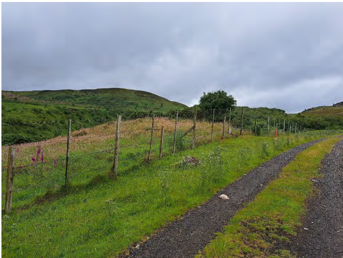
Plate 38: View west over Langwell Tulloch broch Asset 35/ SM3441