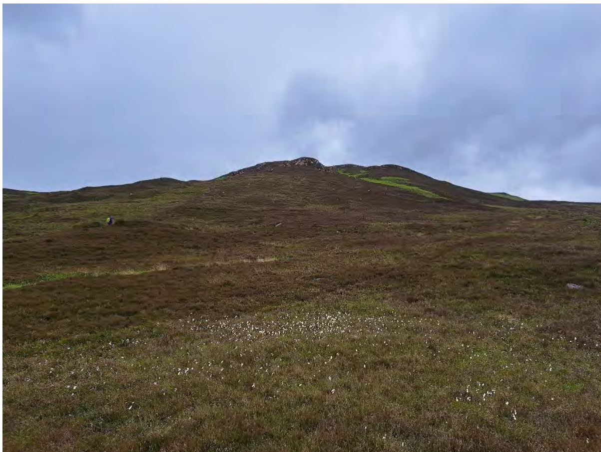
Plate 53: View northwest over Caen, hut circles and souterrain Asset 76/SM1841, towards hut circle and souterrain