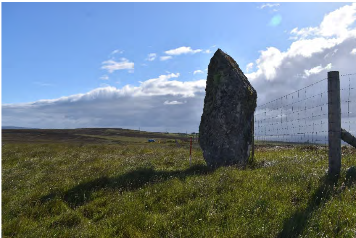
Plate 26: Upper Borgue standing stone Asset 49/SM502, facing southeast, Proposed Development to extend left to right across the dip in the middle distance