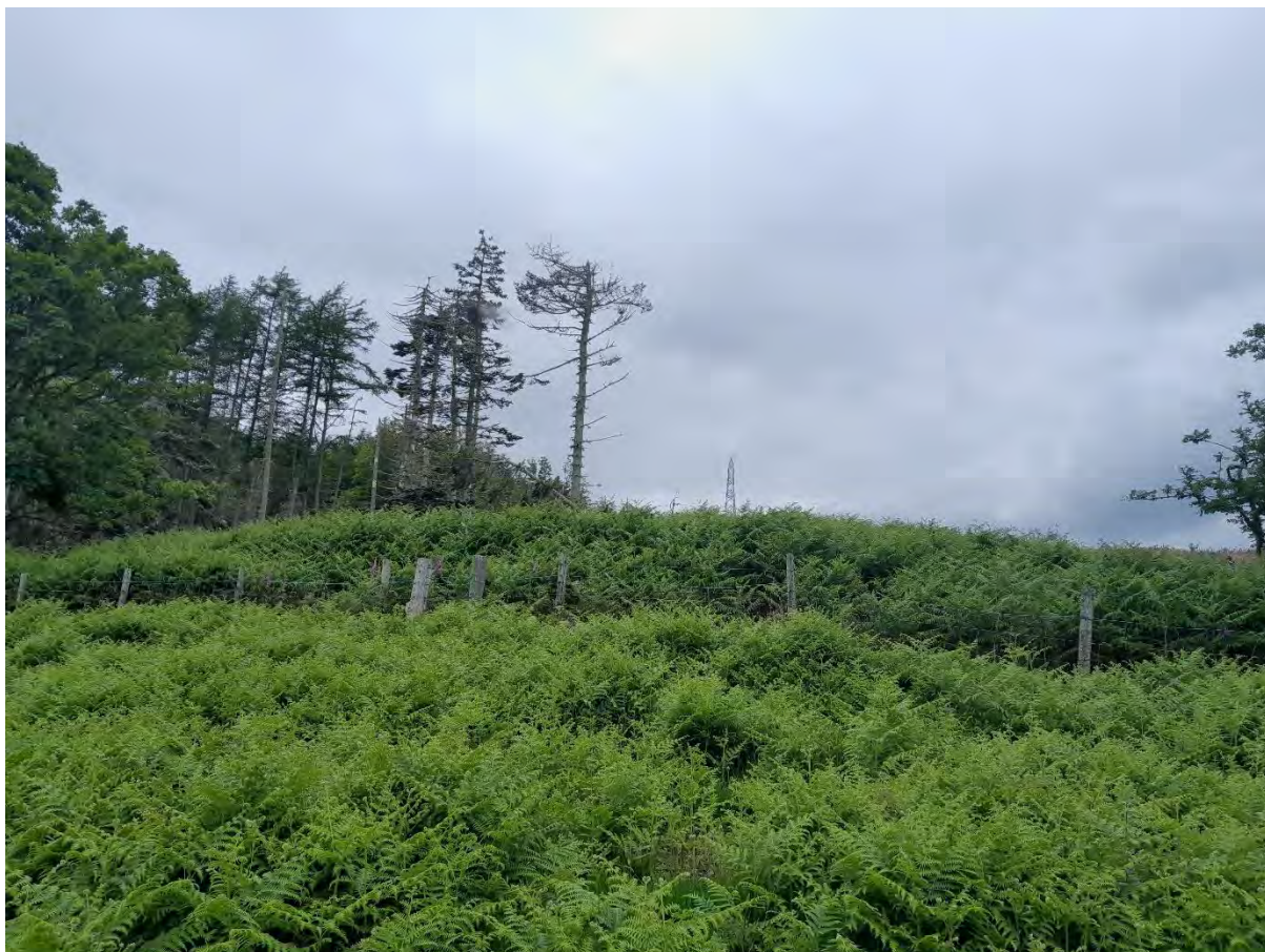
Plate 40: View northwest over location of Langwell Plantation souterrain Asset 88/SM3436 towards Proposed Development