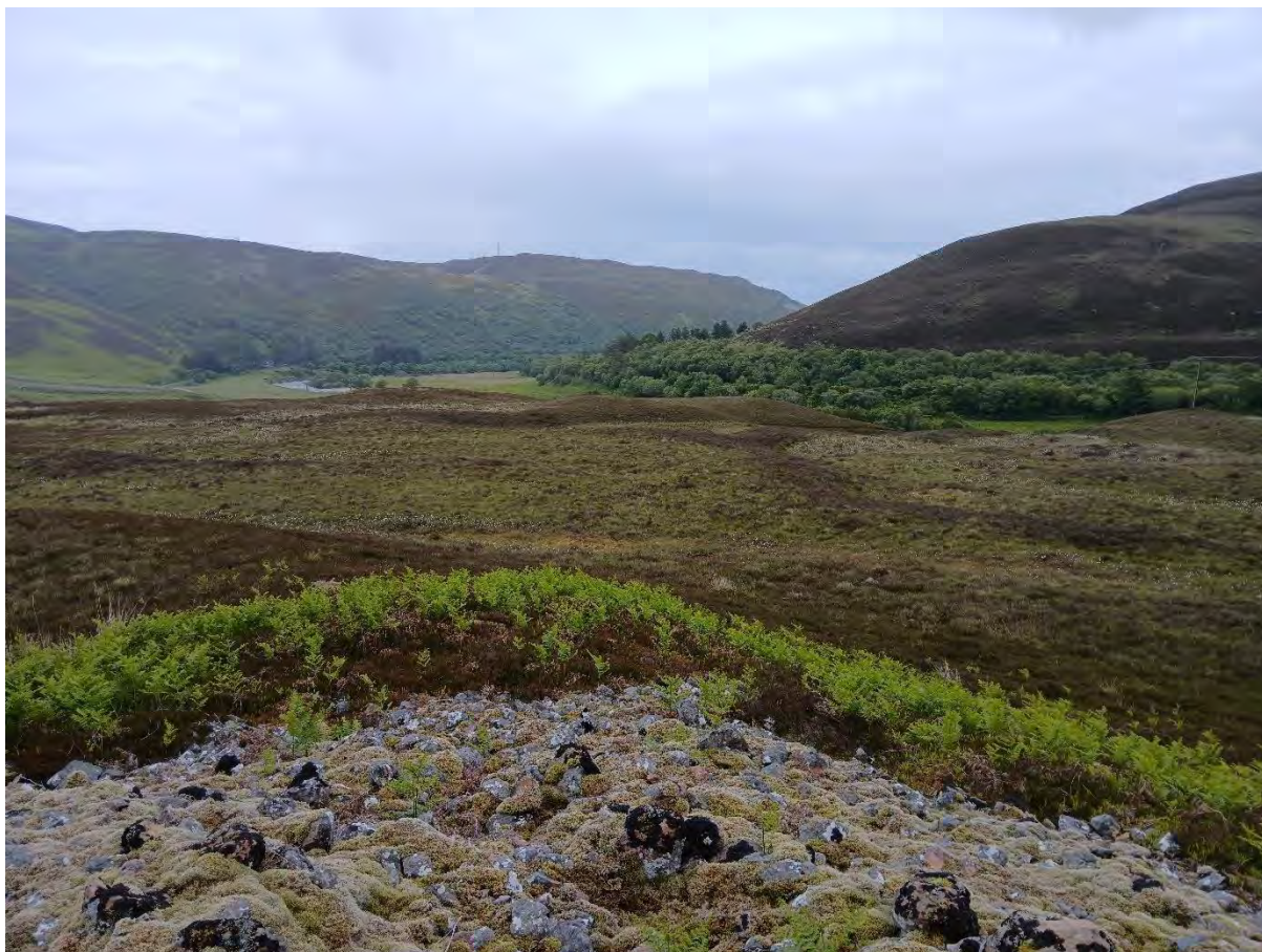
Plate 50: View over long cairn of Asset 77/SM1770 towards Proposed Development Tower 148