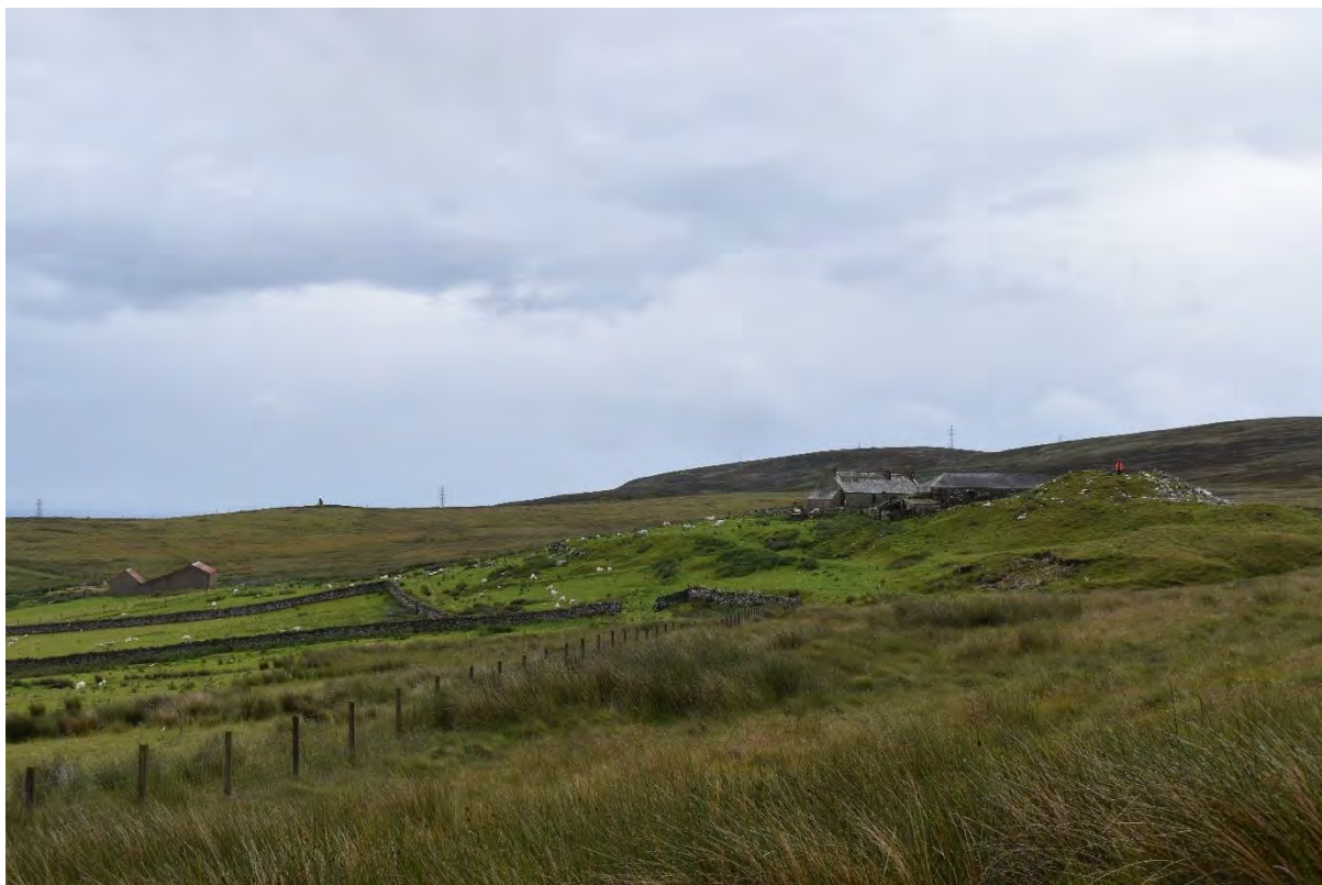
Plate 25: View south over Upper Borgue broch Asset 50/SM596 beside farmstead, with Upper Borgue standing stone Asset 49/SM502 on ridgeline beyond