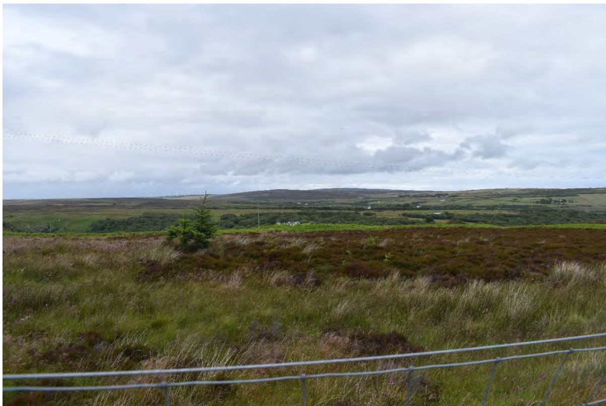
Plate 22: View northeast over Balcraggie Lodge prehistoric settlement Asset 30/SM3521, from adjacent roadside