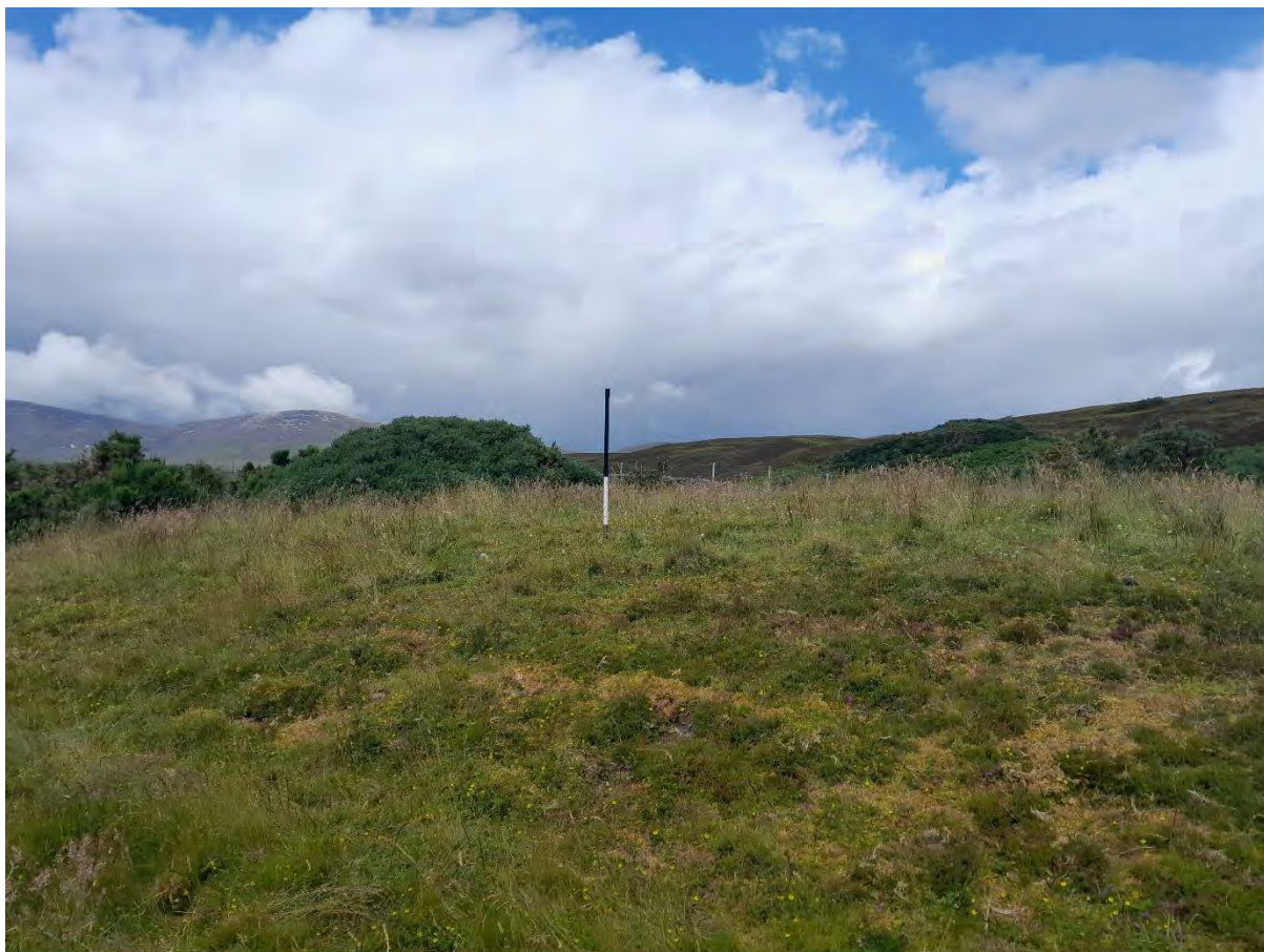
Plate 30: View north over Rinsary homestead Asset 31/SM3473