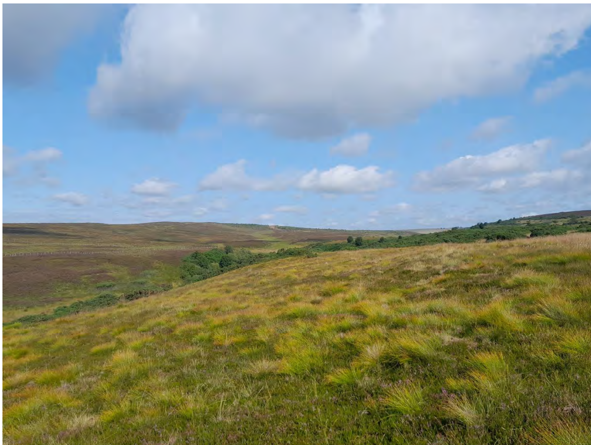
Plate 14: View north from prehistoric settlement Asset 17/SM5186 towards the Proposed Development along the Houstry Burn