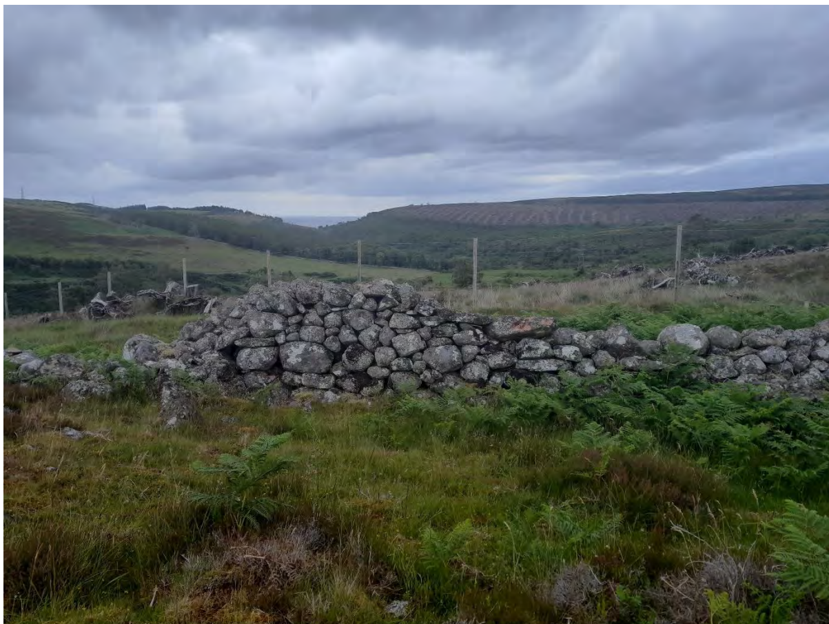
Plate 42: View east from Cnoc Bad Asgaraidh chambered cairn Asset 51/SM423 towards Proposed Development spanning point across the Langwell Water