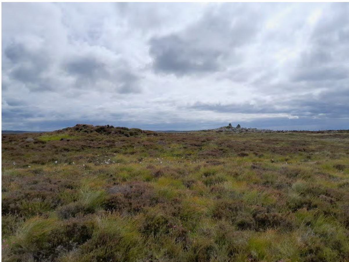
Plate 15: View east over Cairn Liath Asset 41/SM438, a round cairn (left) and long cairn (right)