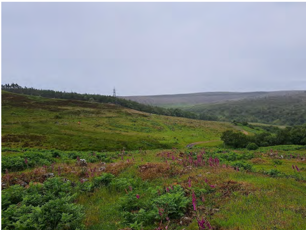
Plate 36: View southeast over Turnal Rock, prehistoric settlement Asset 72/SM13631, with Langwell Tulloch broch Asset 35/SM3441 situated on right side of track on middle ridgeline, Proposed Development would stand in foreground