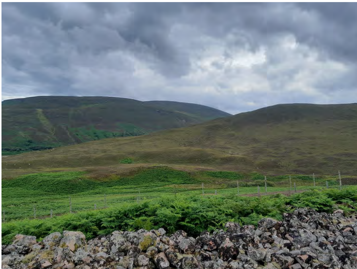
Plate 48: View west from Caen, long cairn Asset 70/SM1771 to Caen, long cairn Asset 52/SM432, centre left above river terrace