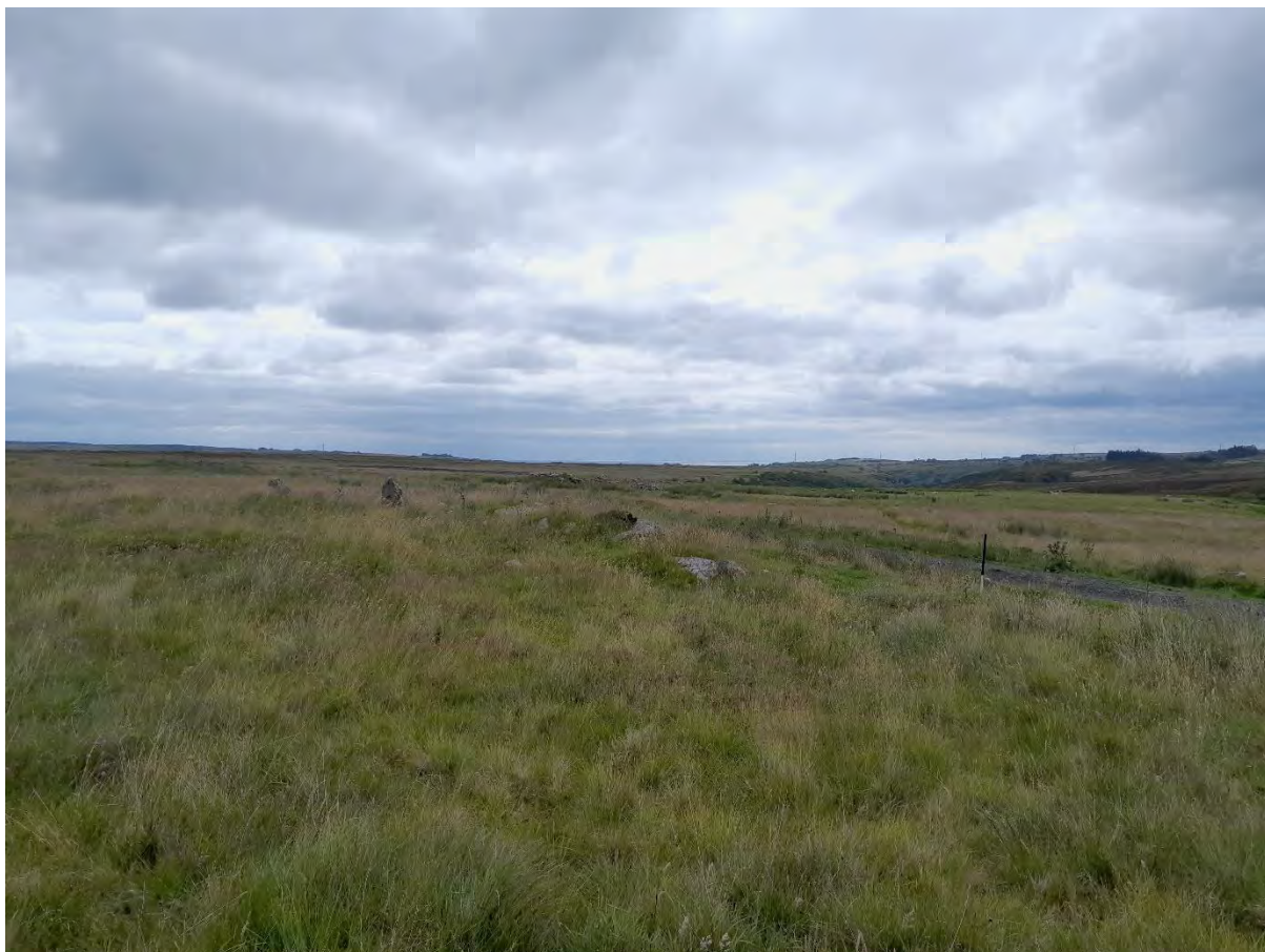
Plate 17: View southeast over Loedebest chambered cairn Asset 14/SM5163 towards Proposed Development, which would stand towards the ridgeline