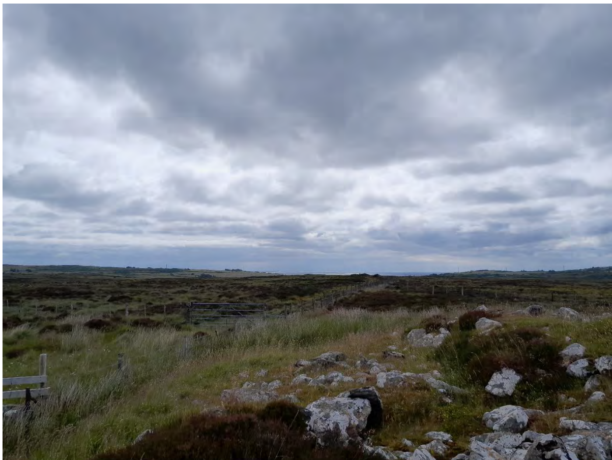
Plate 16: View southeast from the east end of the Carn Liath long cairn within Asset 41/SM438, illustrating the sea view that would be framed by towers from the Proposed Development, and the location of the non-designated probable cairn (Asset 836) below gorse in the middle distance