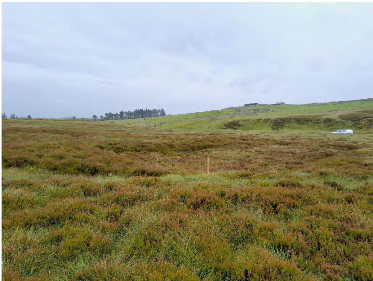
Plate 19: View south over Tower 86 with Achorn broch (Asset 43/SM511) visible on ridgeline, centre right, with the Achorn Burn containing prehistoric and post-medieval settlement remains (Asset 44/SM512) intervening in the dip of the burn