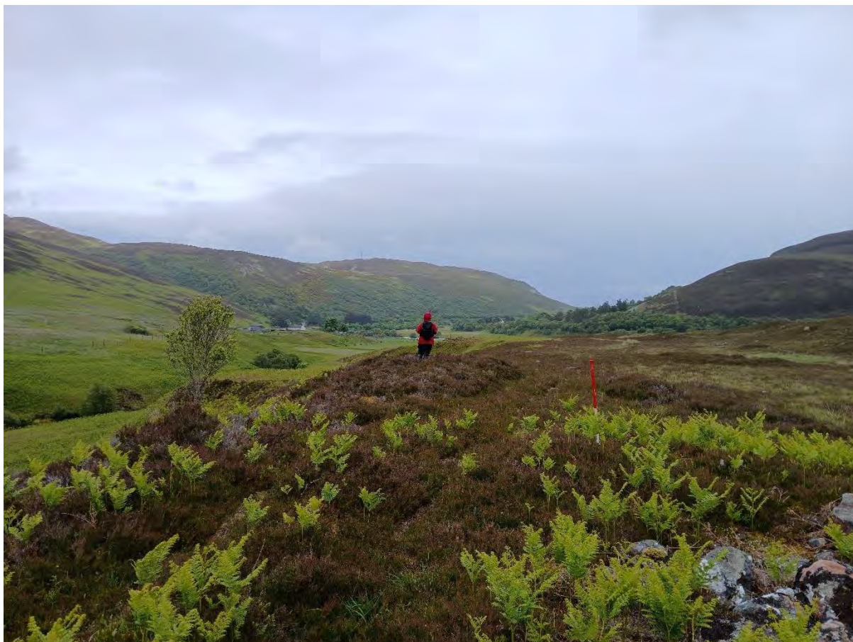
Plate 45: View southeast from Caen, long cairn Asset 52/SM432 to mouth of Strath Ullie at Helmsdale, the Proposed Development would span this view with North Tower 147 situated on the far left side of frame