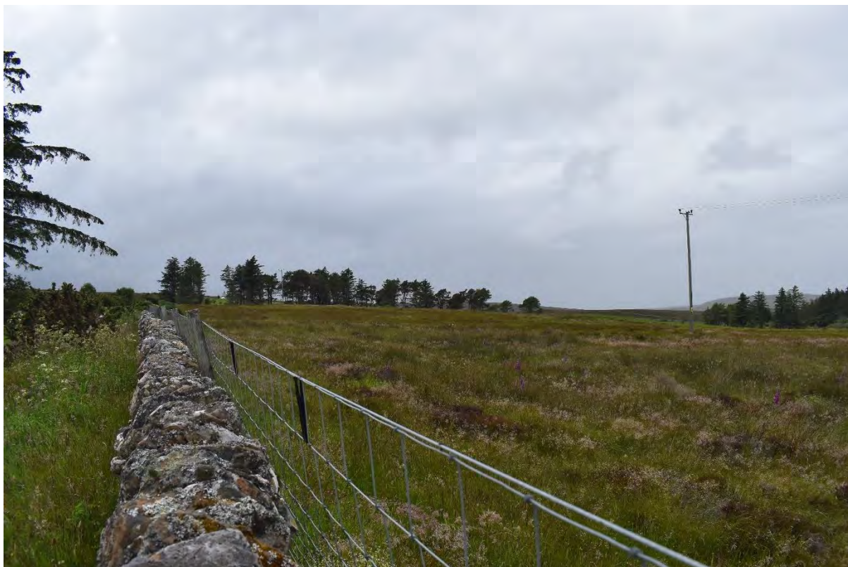
Plate 23: View west over prehistoric settlement Asset 30/SM3521 towards Proposed Development, which would stand beyond tree line, beyond which is also sits Achorn broch Asset 43/SM511