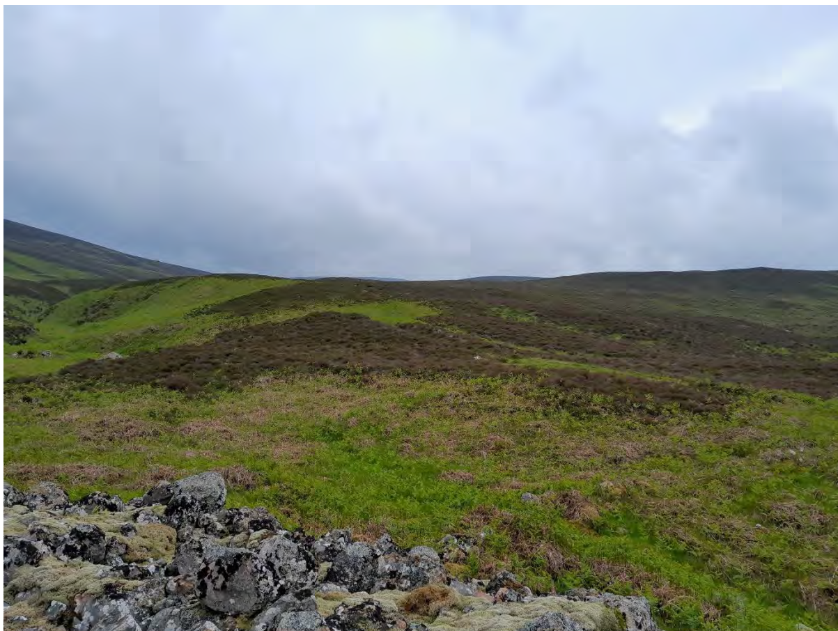
Plate 57: View south from Eldrable broch Asset 64/SM1863 towards Proposed Development, which would extend atop the strath's south side