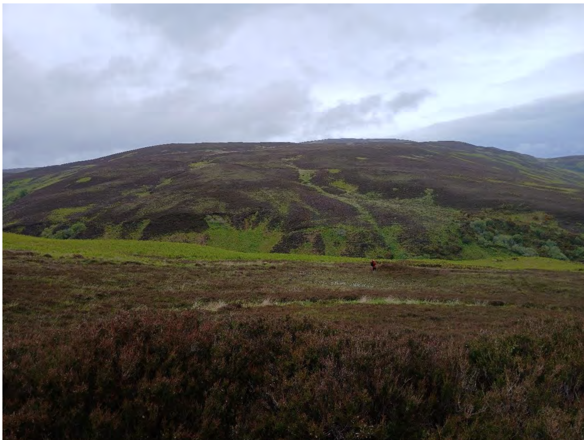
Plate 55: View south from Caen, hut circles and souterrain Asset 76/SM1841 towards hills over which the Proposed Development would extend on southeast side of the Caen Burn