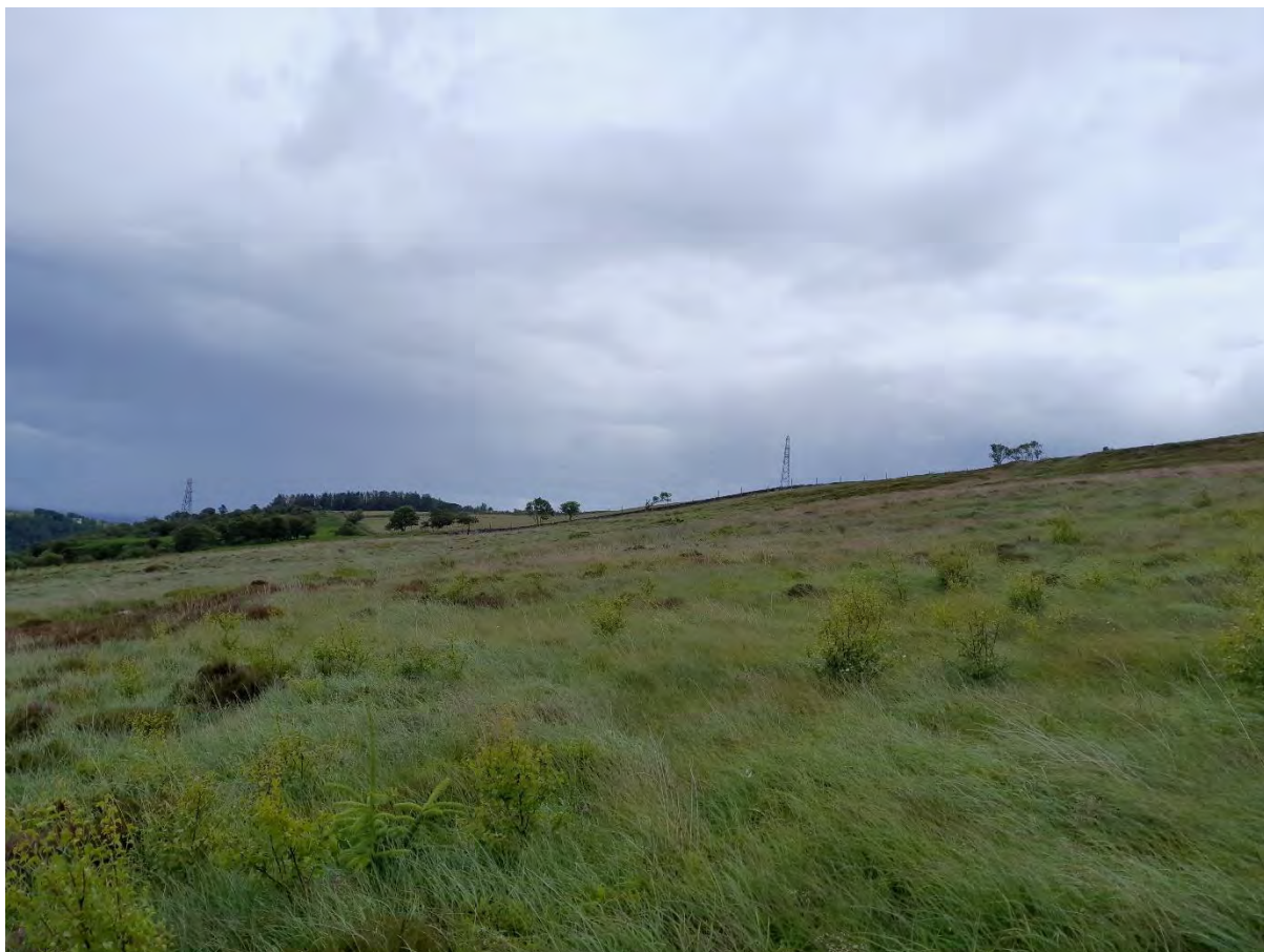
Plate 35: View south from Cnoc Fionn hut circle Asset 3/SM3537 towards Proposed Development