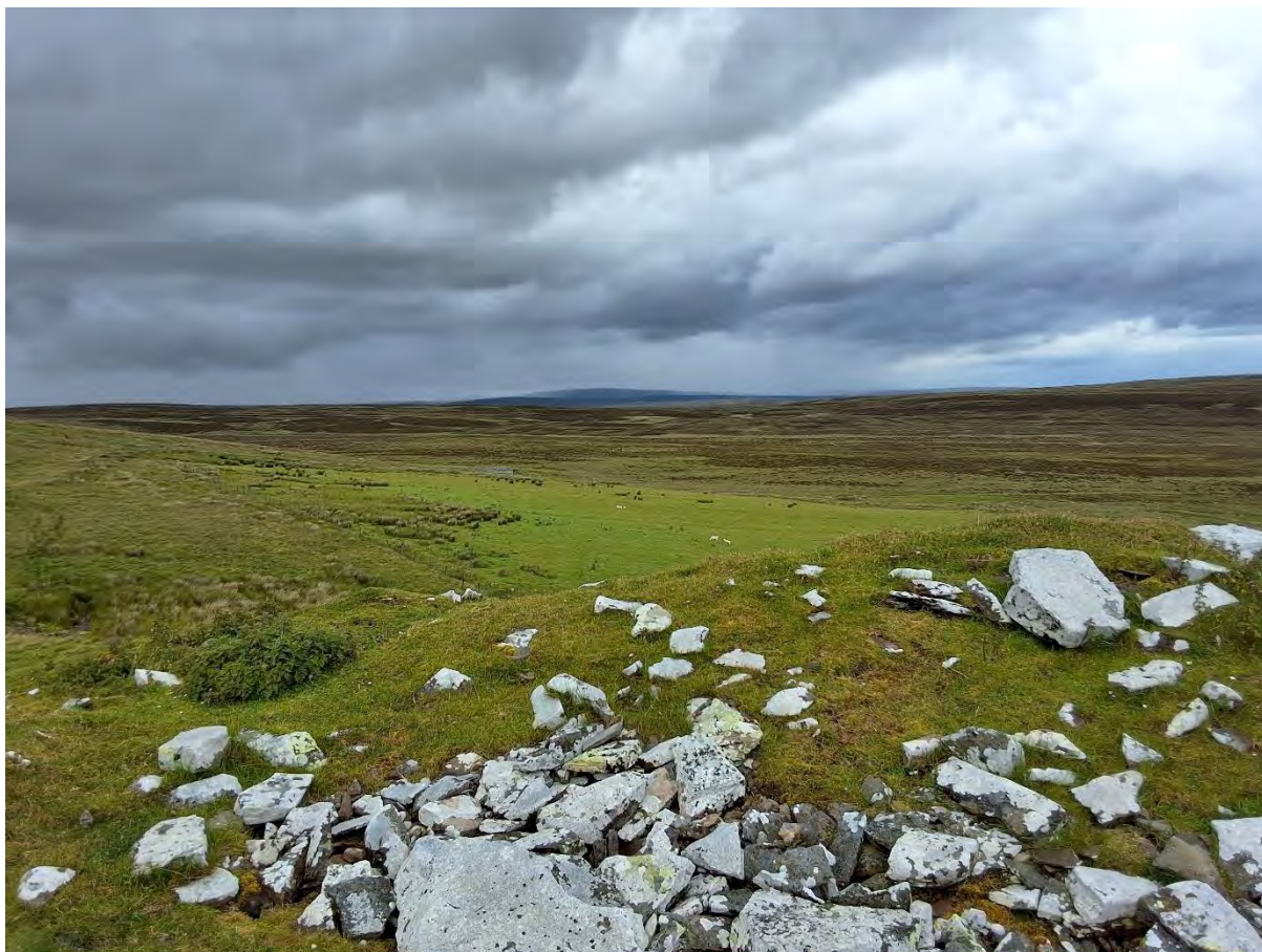
Plate 24: View northeast towards Proposed Development from atop Borgue broch Asset 50/SM502