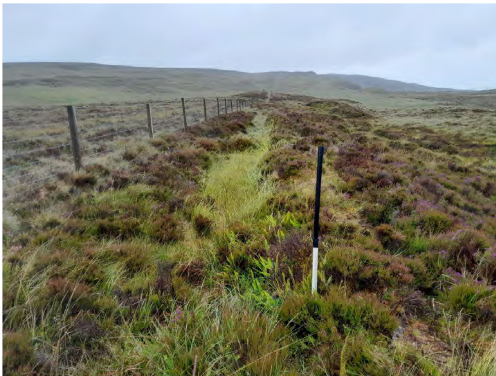
Plate 67: Ditch and bank (Asset 667), facing south