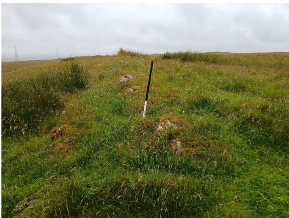
Plate 48: Dyke (Asset 673), facing north