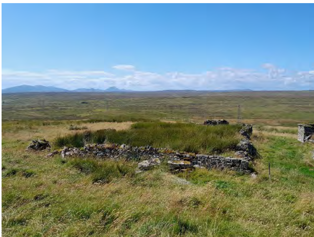
Plate 76: Kale yard (Asset 871.7), facing west