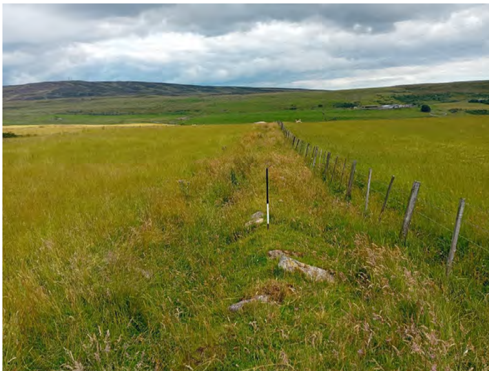
Plate 133: Stone and turf dyke (Asset 710), facing east