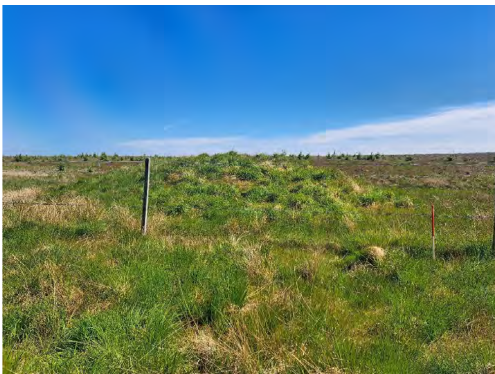
Plate 32: Mound (Asset 610), facing southeast