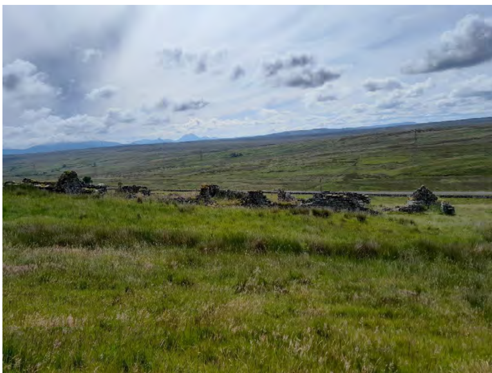
Plate 86: Long building (Asset 661.2) with smaller building (Asset 661.1) visible on right, facing west-southwest