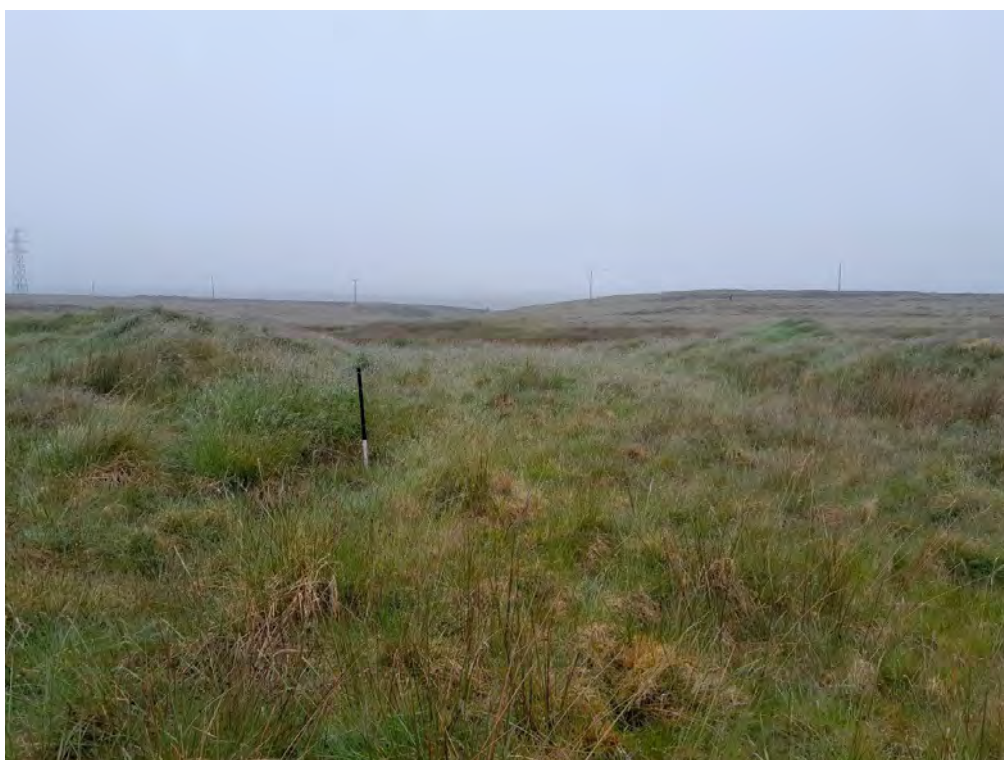
Plate 56: Track (Asset 612) through enclosure (Asset 613), facing southwest