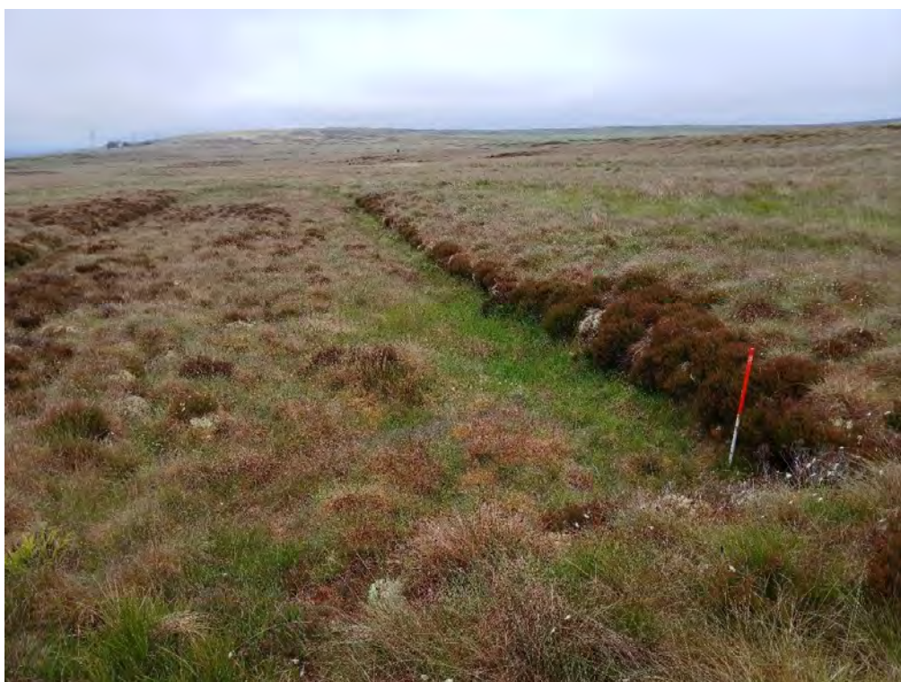
Plate 62: Peat cutting (Asset 620), facing north-northeast