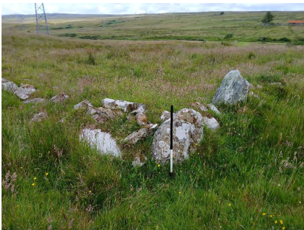
Plate 126: Drystone dyke (Asset 639), facing southwest