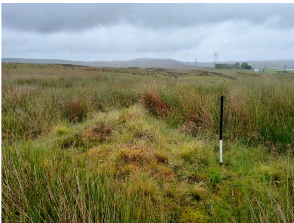
Plate 50: Hut circle (Asset 670), facing southeast