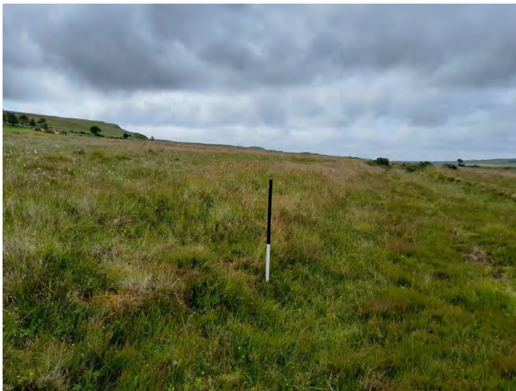
Plate 117: Turf bank (Asset 633), facing southeast