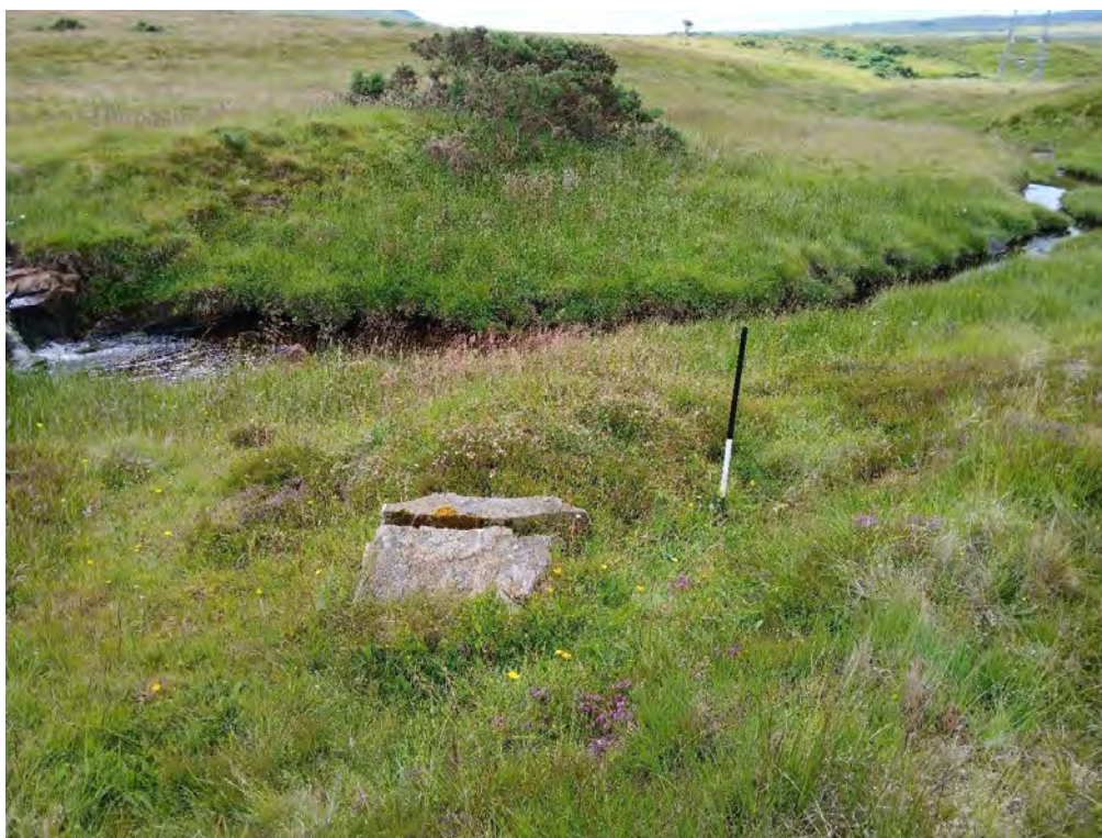
Plate 119: Clearance cairn (Asset 636), facing south