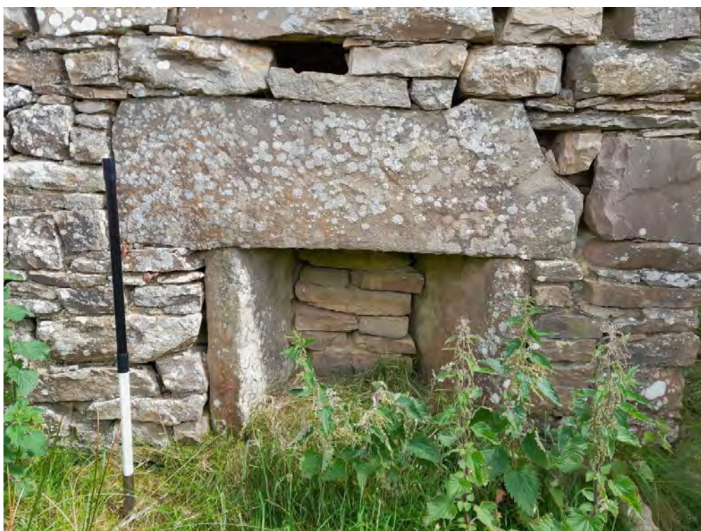
Plate 82: Fireplace within crofthouse (Asset 658.2), facing east