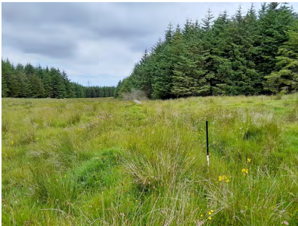
Plate 43: Degraded stone and turf dyke (Asset 678), facing northwest