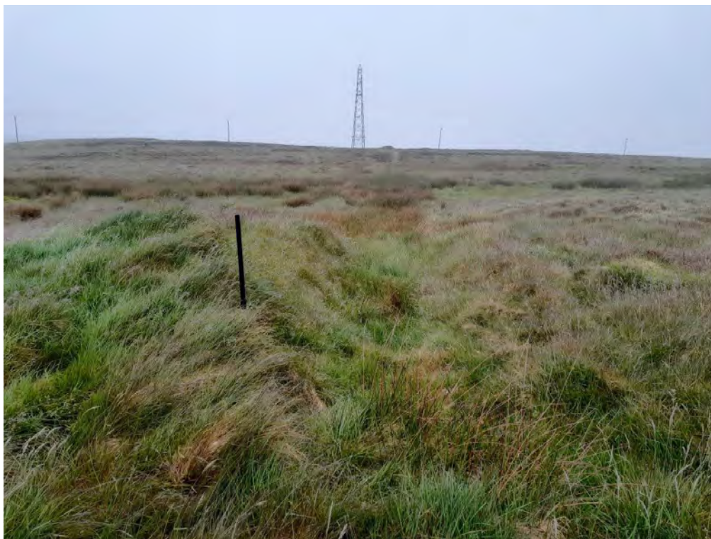
Plate 55: Enclosure (Asset 613), facing northwest