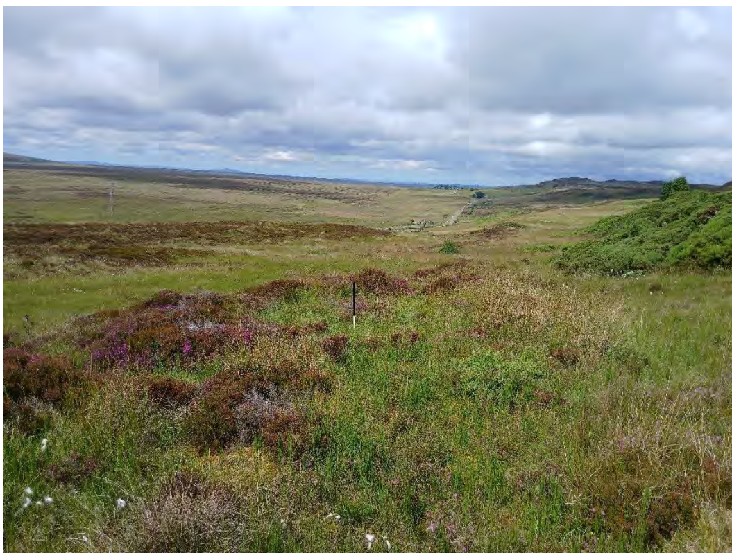
Plate 104: Hut circle (Asset 649), facing northwest