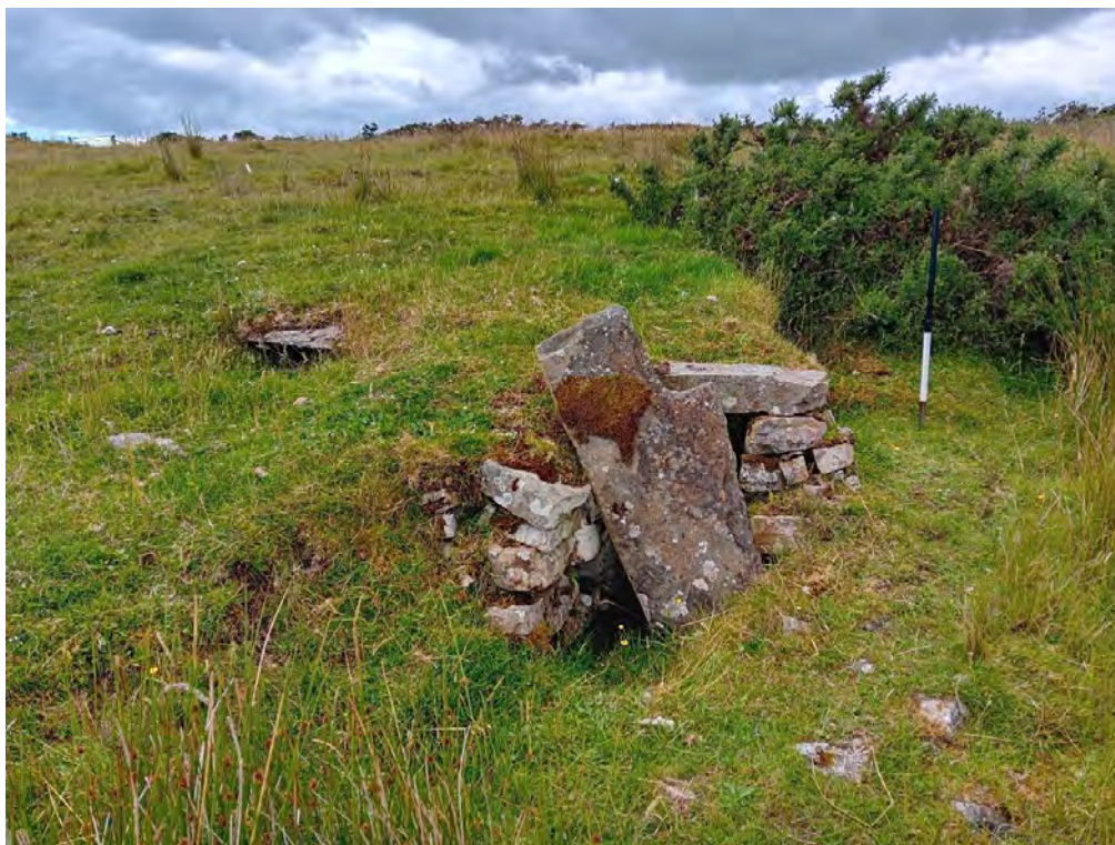
Plate 139: Subterranean structure (Asset 704), facing southwest