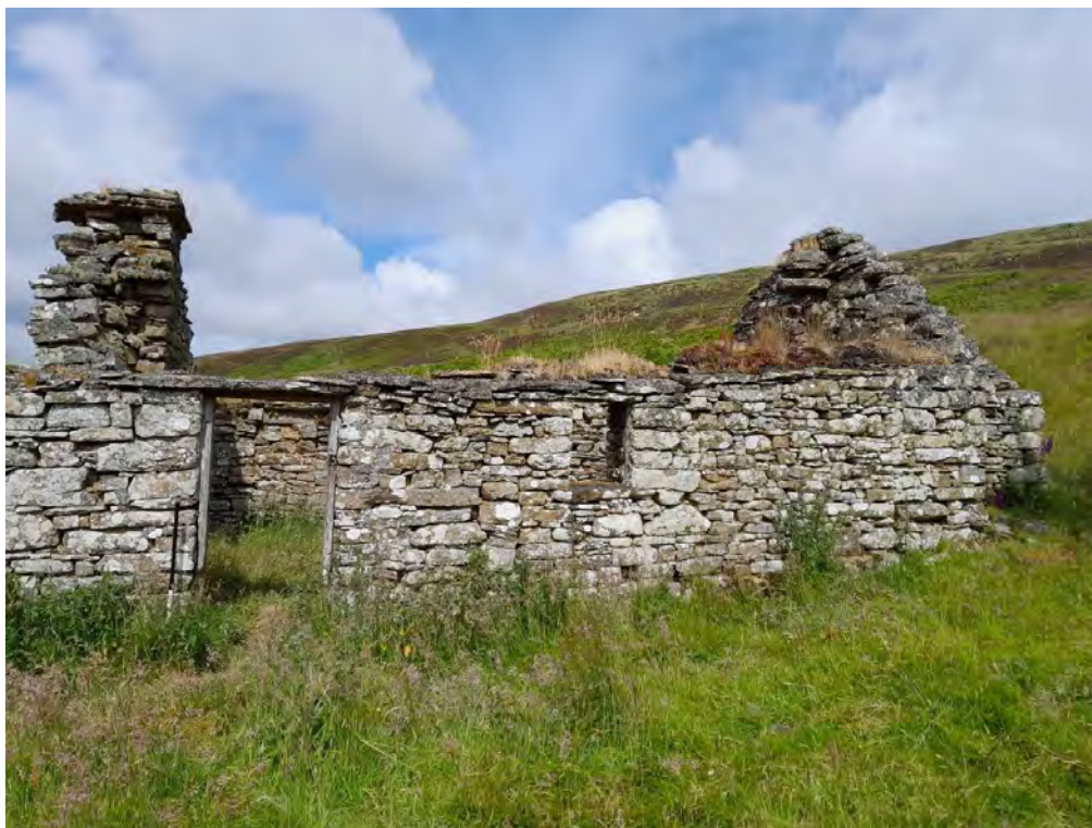
Plate 81: South elevation of croft (Asset 658.2), east side