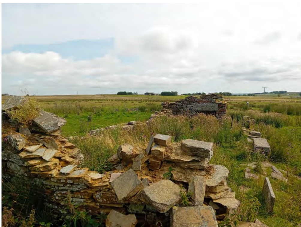
Plate 26: Building (Asset 155.2) forming east side of farmstead, facing east-southeast