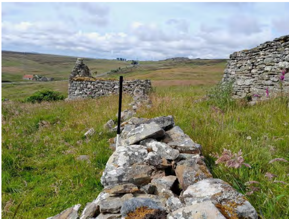
Plate 89: Enclosure wall (Asset 661.3) leading to building (Asset 661.1), corner of building (Asset 661.2) visible on right, facing north-northwest