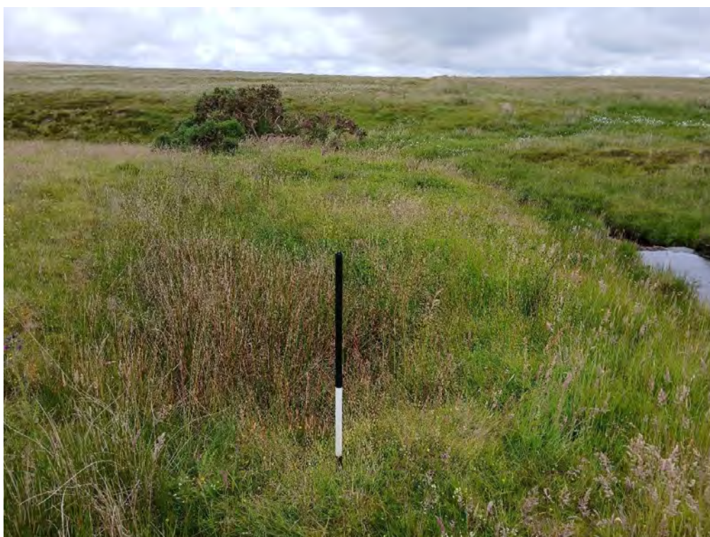
Plate 118: Rectangular hollow (Asset 634), possibly a robbed out building, facing southwest