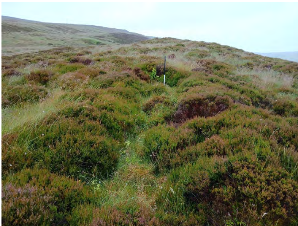
Plate 71: Shieling (Asset 664), facing south