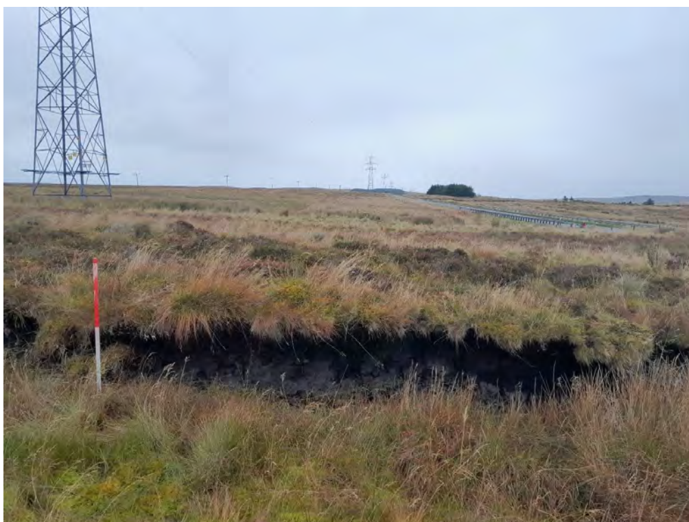
Plate 36: Peat cutting (Asset 1010.1), facing south