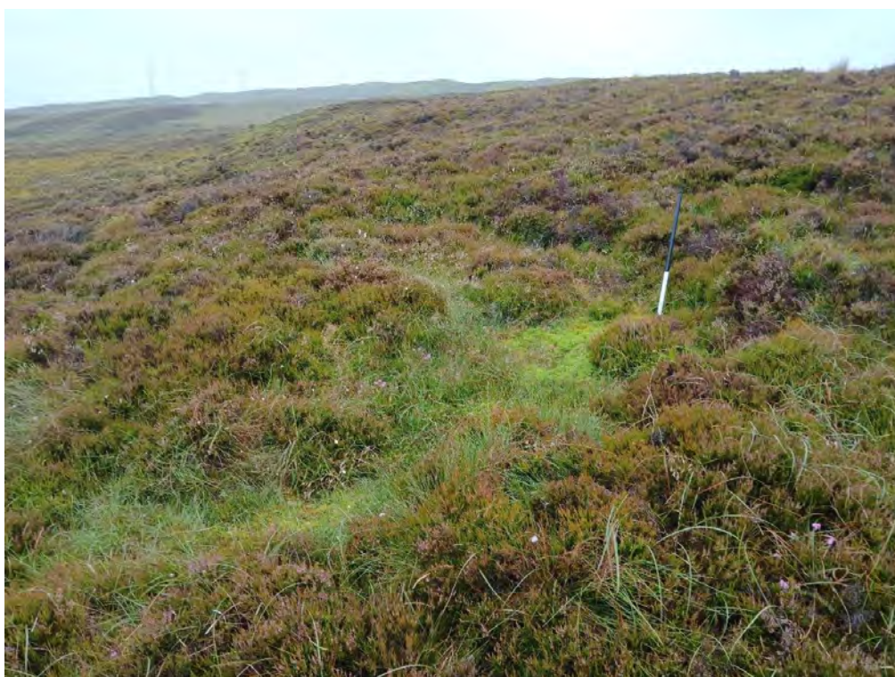
Plate 52: Small hollow, possible quarry, (Asset 669), facing north