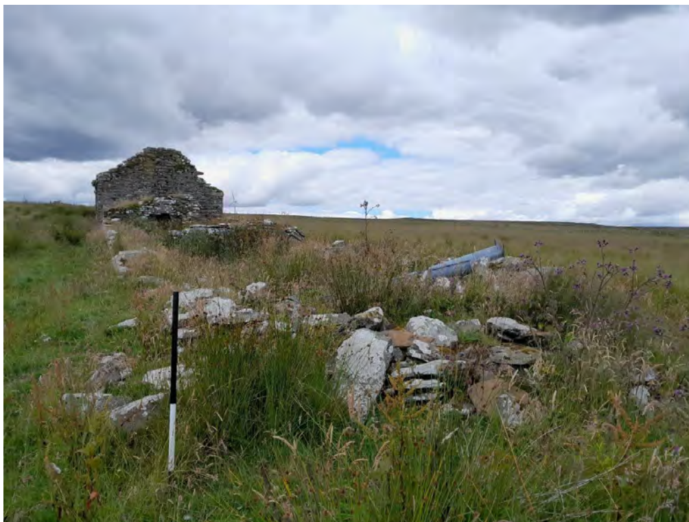
Plate 129: Crofthouse (Asset 703.2), facing west