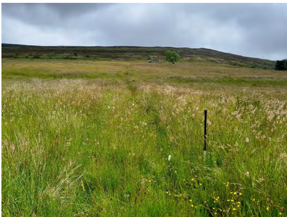
Plate 108: Ditch and bank (Asset 645) with croft house (Asset 628.1) in background, facing east