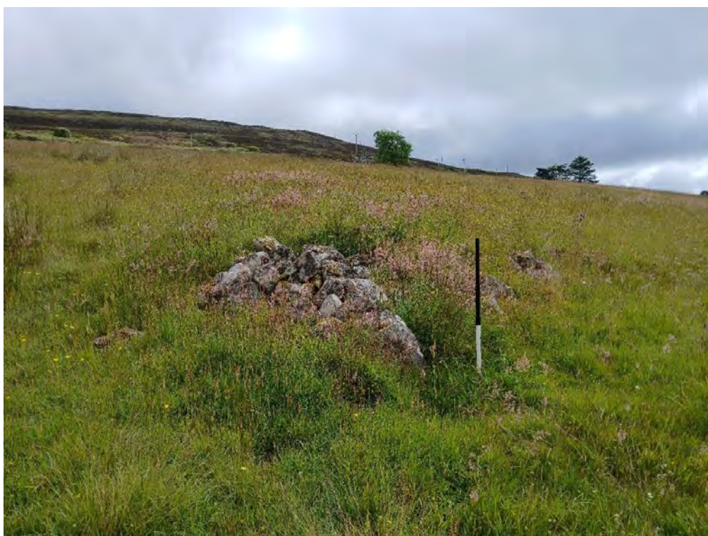
Plate 110: Clearance cairn (Asset 646), facing southeast