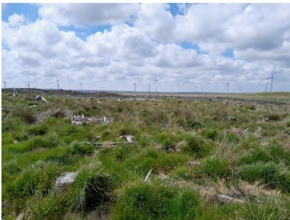
Plate 34: View over improved ground (Asset 608.3), facing west