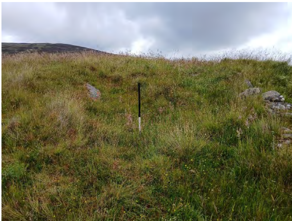
Plate 125: Hollow (Asset 638), a possible borrow pit or structure, facing east