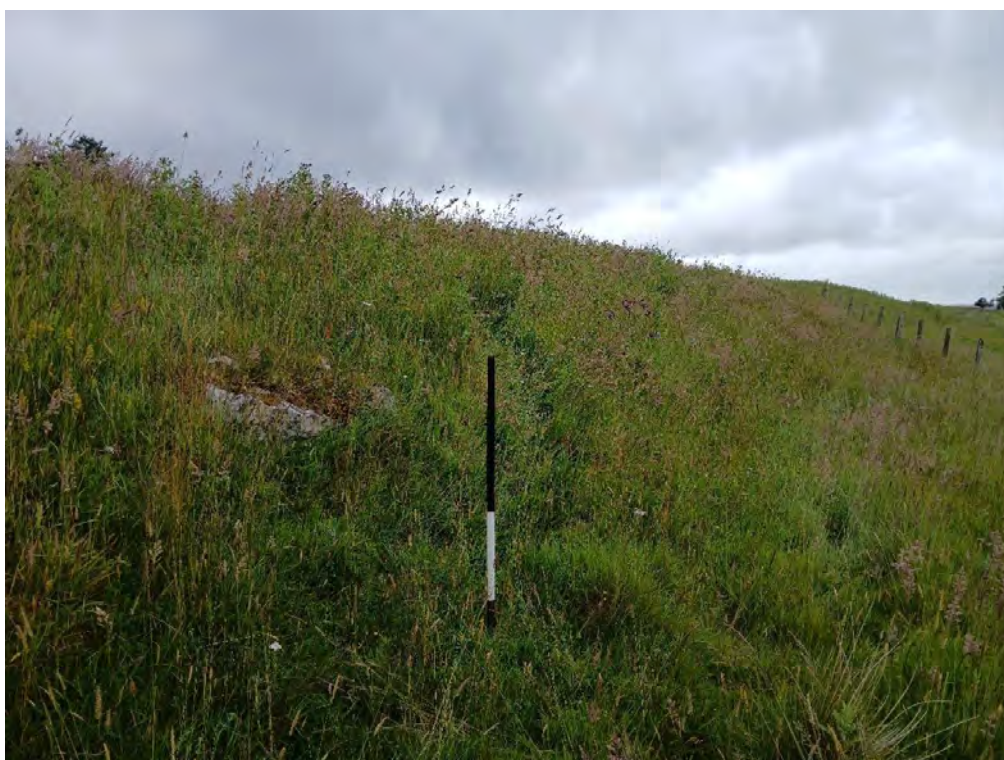
Plate 114: Revetment dyke (Asset 630), facing south-southeast