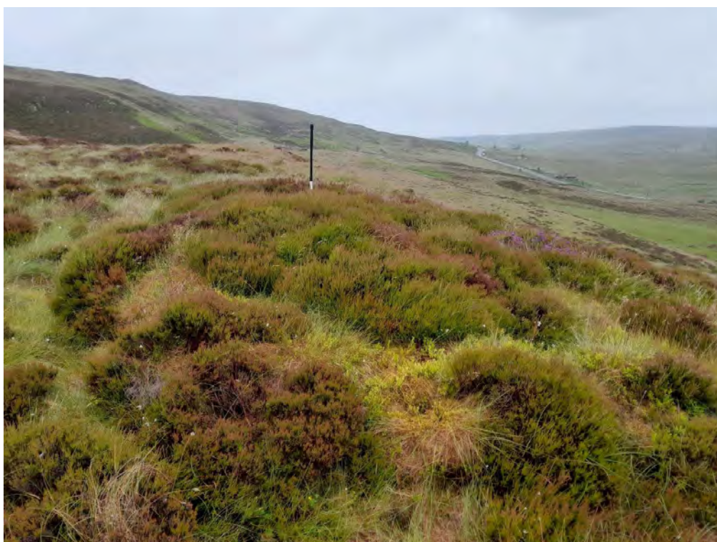
Plate 68: Shieling (Asset 663), facing southeast