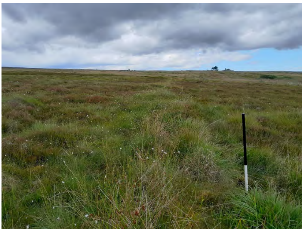
Plate 128: Drainage ditch (Asset 712), facing northwest