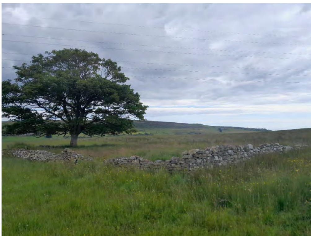
Plate 137: Enclosure (Asset 709), facing southeast