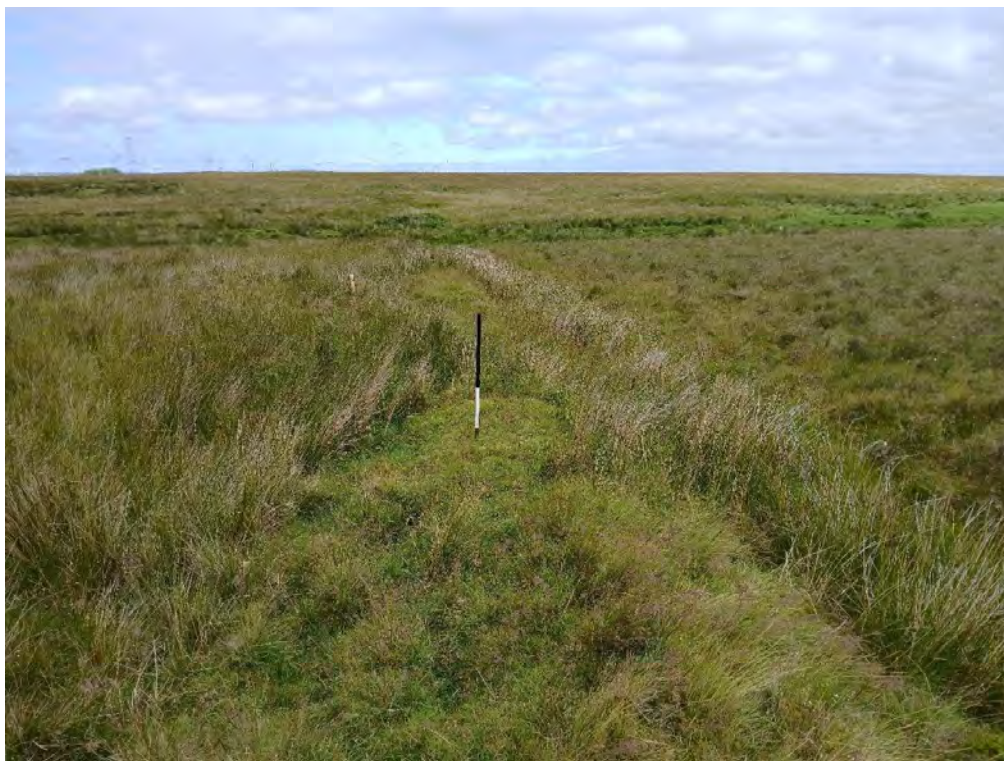
Plate 39: Enclosure dyke (Asset 681), facing north