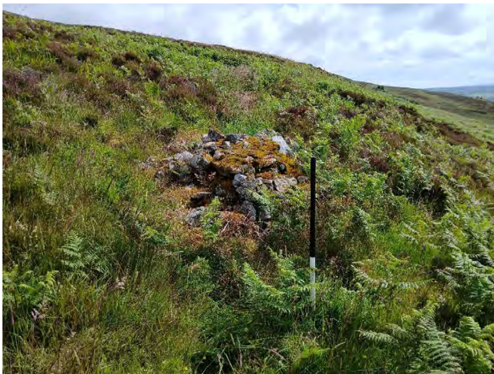
Plate 85: Clearance cairn (Asset 659), facing south