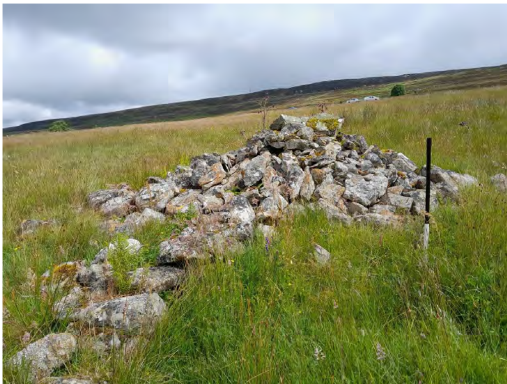
Plate 111: Clearance cairn (Asset 647), facing east