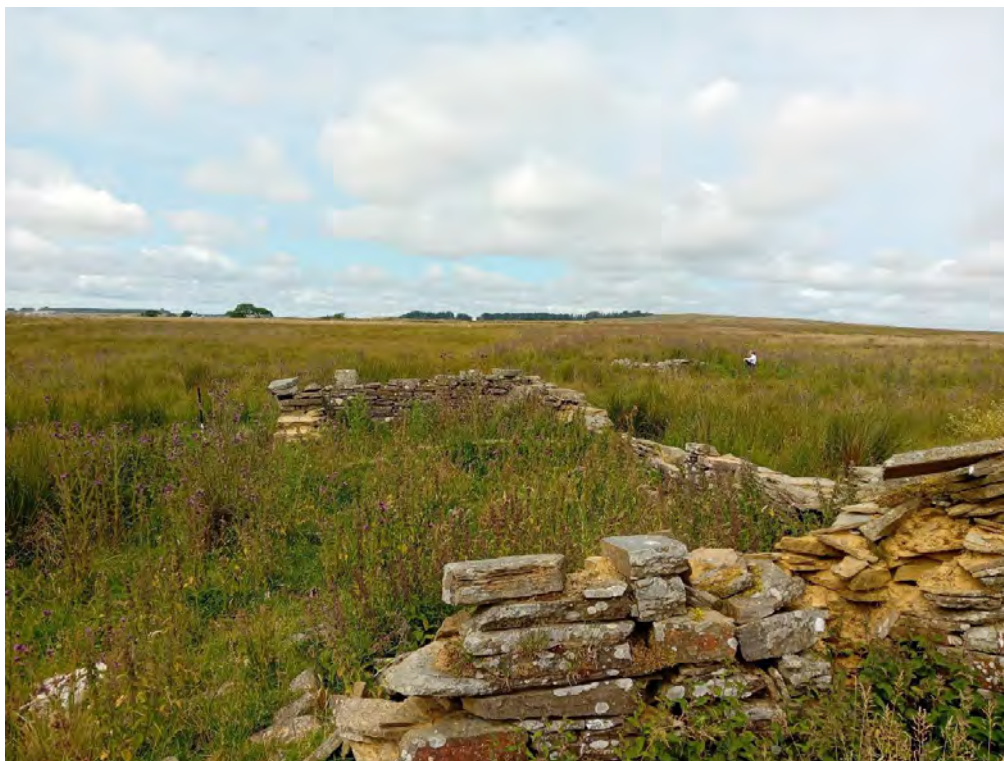
Plate 25: Building (Asset 155.1) forming west side of farmstead, facing north-northeast