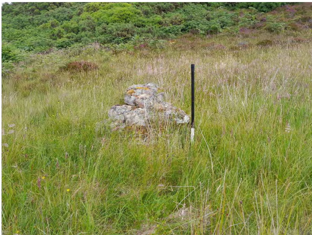
Plate 103: Fragment of drystone wall (Asset 652), facing east-northeast