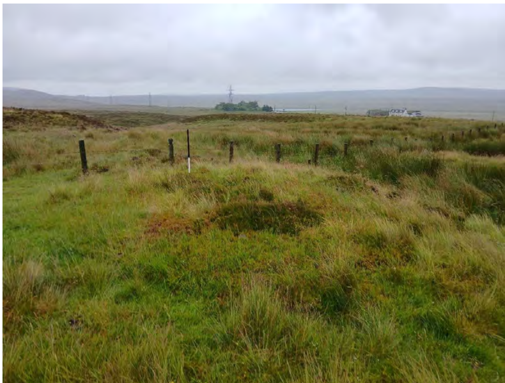
Plate 51: Shieling (Asset 671), facing south-southwest