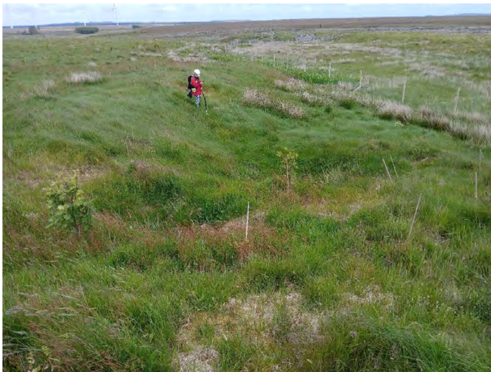
Plate 35: Quarry (Asset 607), facing northeast