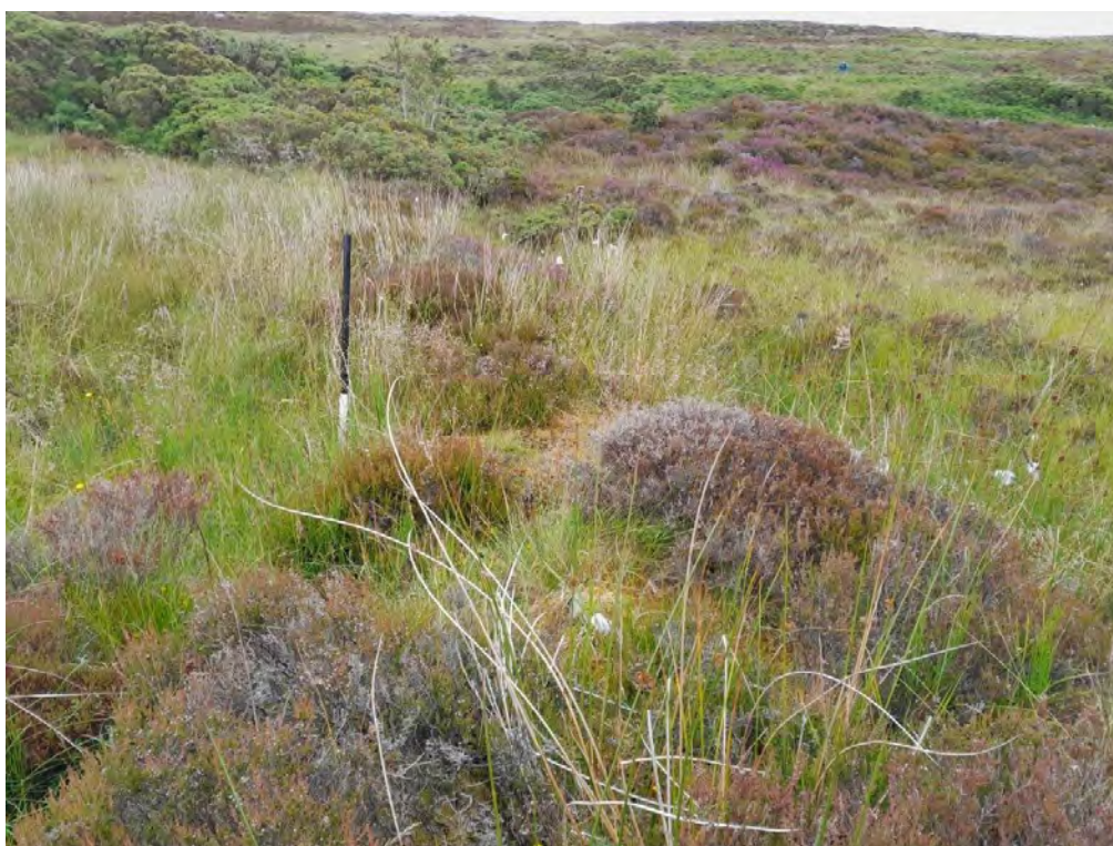
Plate 92: Drystone dyke (Asset 651), facing east