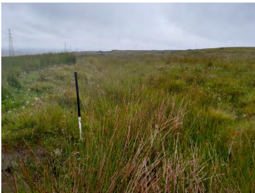
Plate 46: Ditch and bank (Asset 674), facing northeast