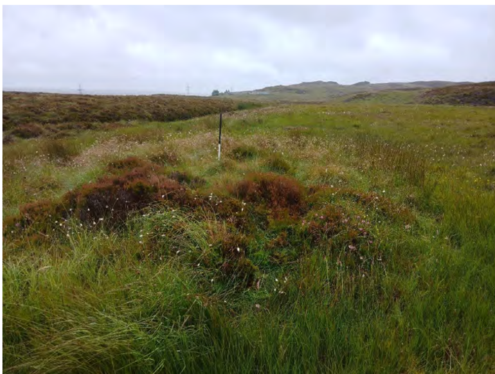
Plate 70: Shieling (Asset 666), facing northwest