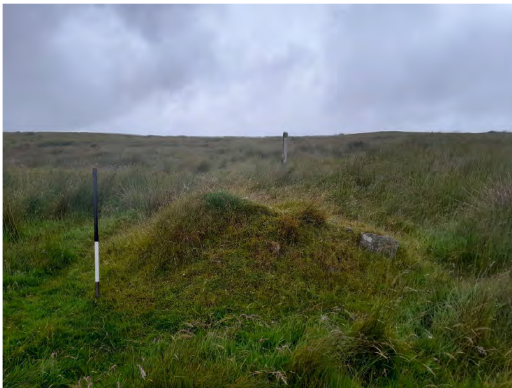
Plate 47: Clearance cairn (Asset 675), facing east-northeast