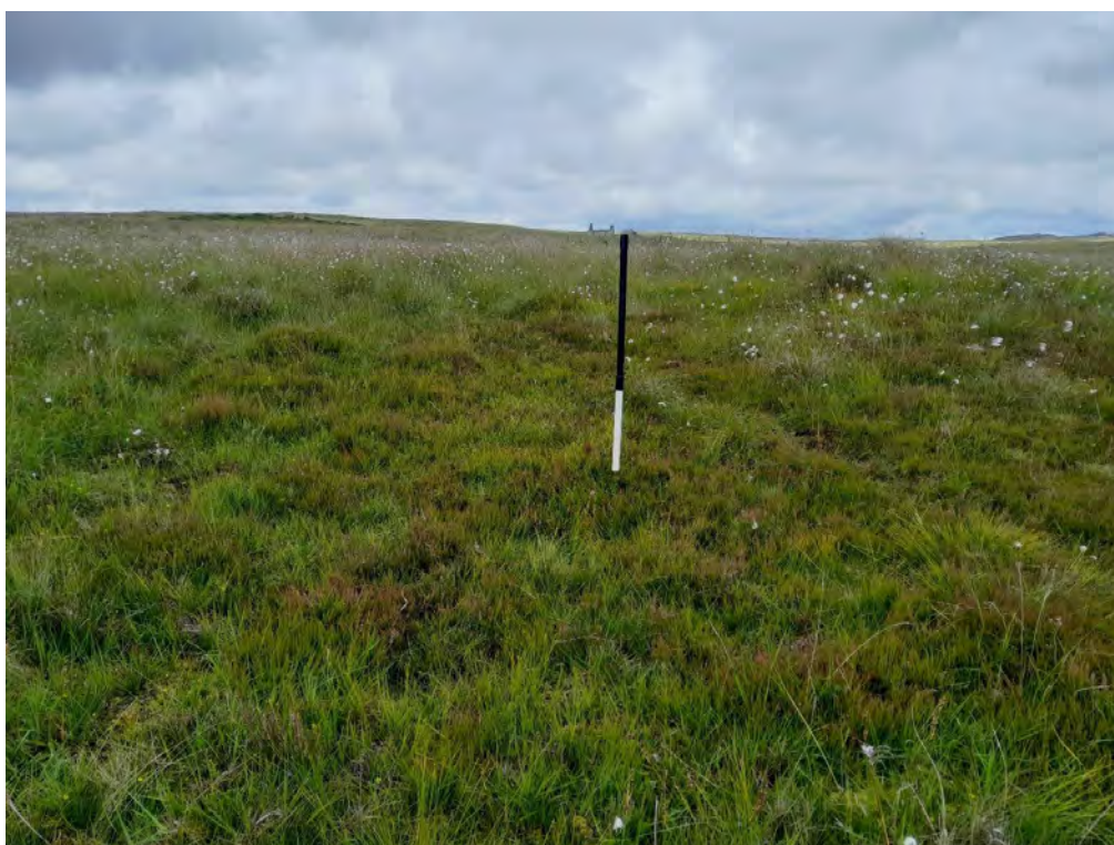
Plate 120: Possible structure (Asset 635), potentially a shieling, facing north-northwest