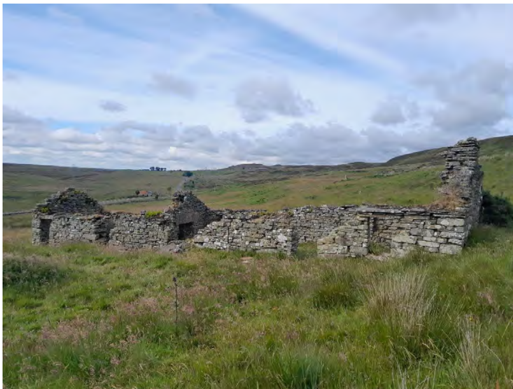
Plate 99: Croft house (Asset 650.3), facing west-northwest