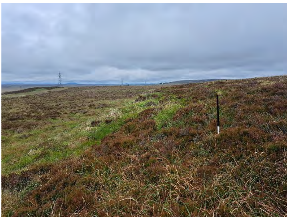
Plate 66: Track (Asset 623), facing northwest