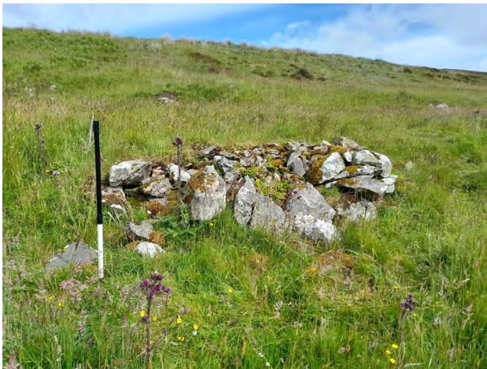
Plate 93: Clearance cairn (Asset 662), facing east-southeast