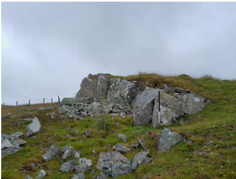
Plate 49: Quarry (Asset 672), facing northeast