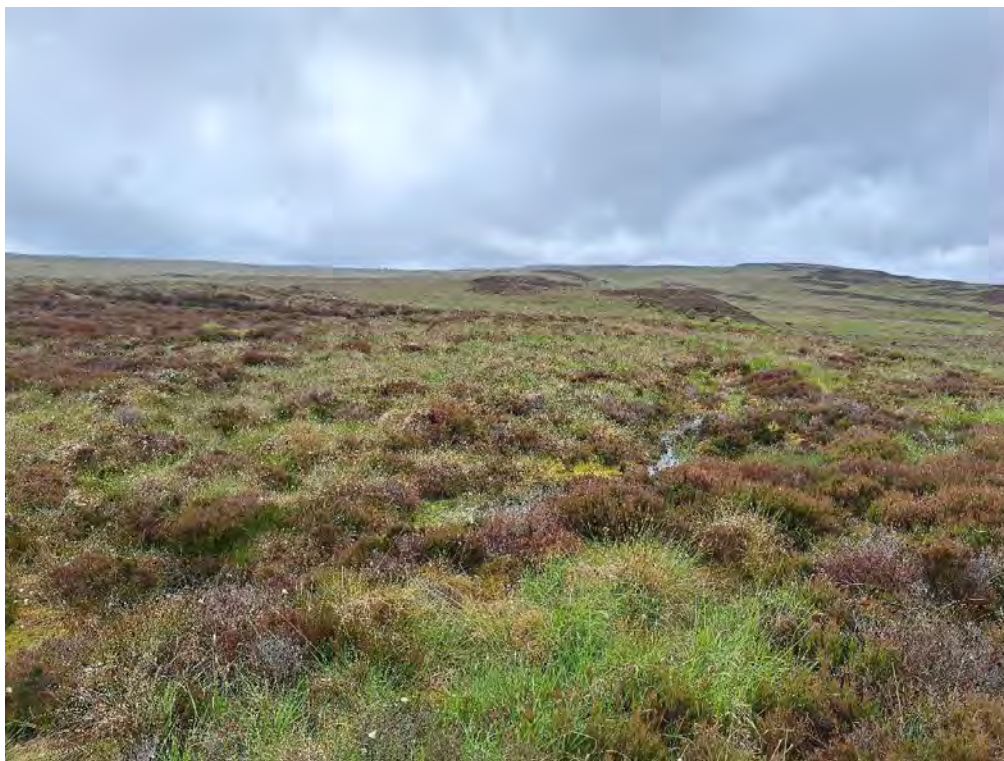
Plate 65: Peat cutting (Asset 624), facing southeast