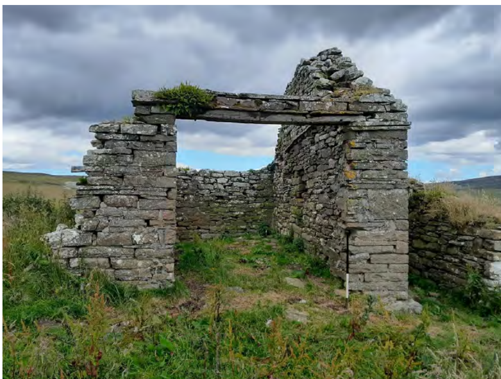
Plate 130: Byre or cart shed (Asset 703.3), facing north