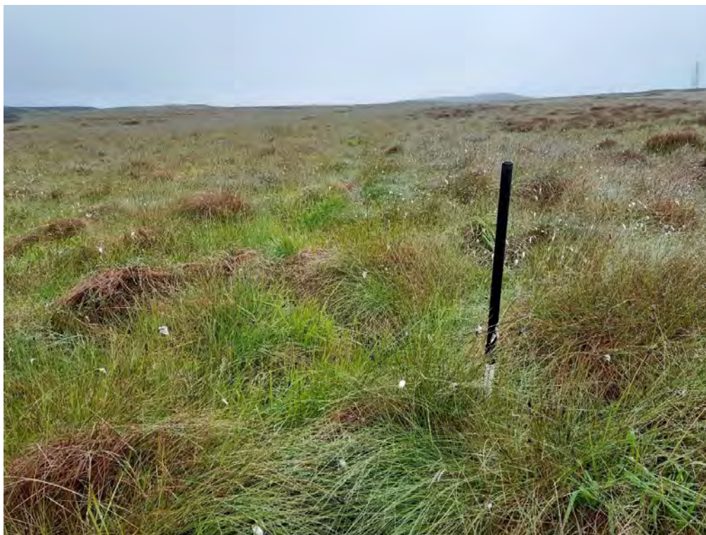
Plate 61: Drainage ditch and associated bank (Asset 619), facing south-southeast