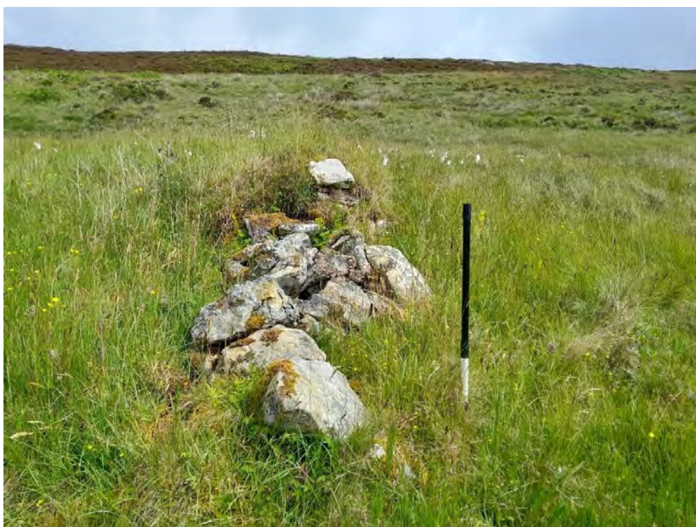
Plate 94: Length of drystone dyke (Asset 654), possible remnants of a pen, facing east