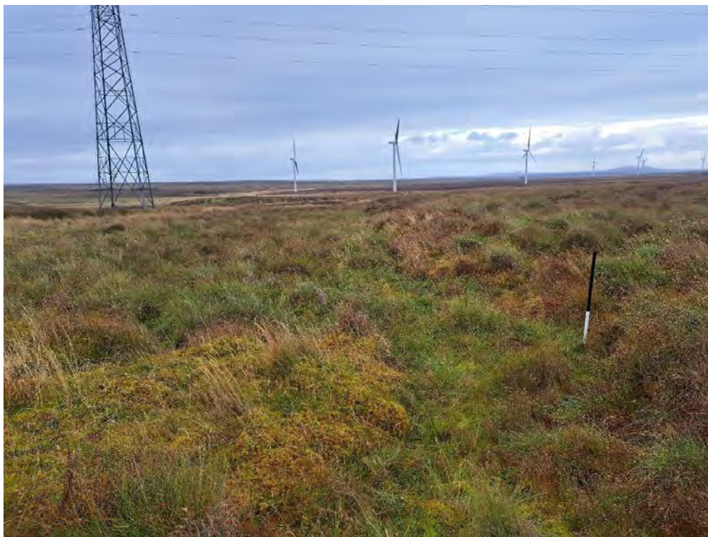
Plate 37: Peat cutting (Asset 1010.2), facing southwest