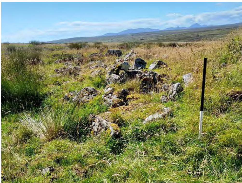
Plate 73: Clearance cairn (Asset 871.2), facing west-southwest