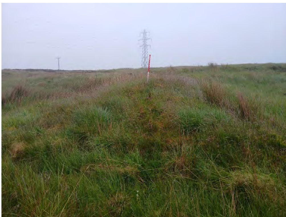
Plate 58: Mound (Asset 615), possible building, facing north-northwest