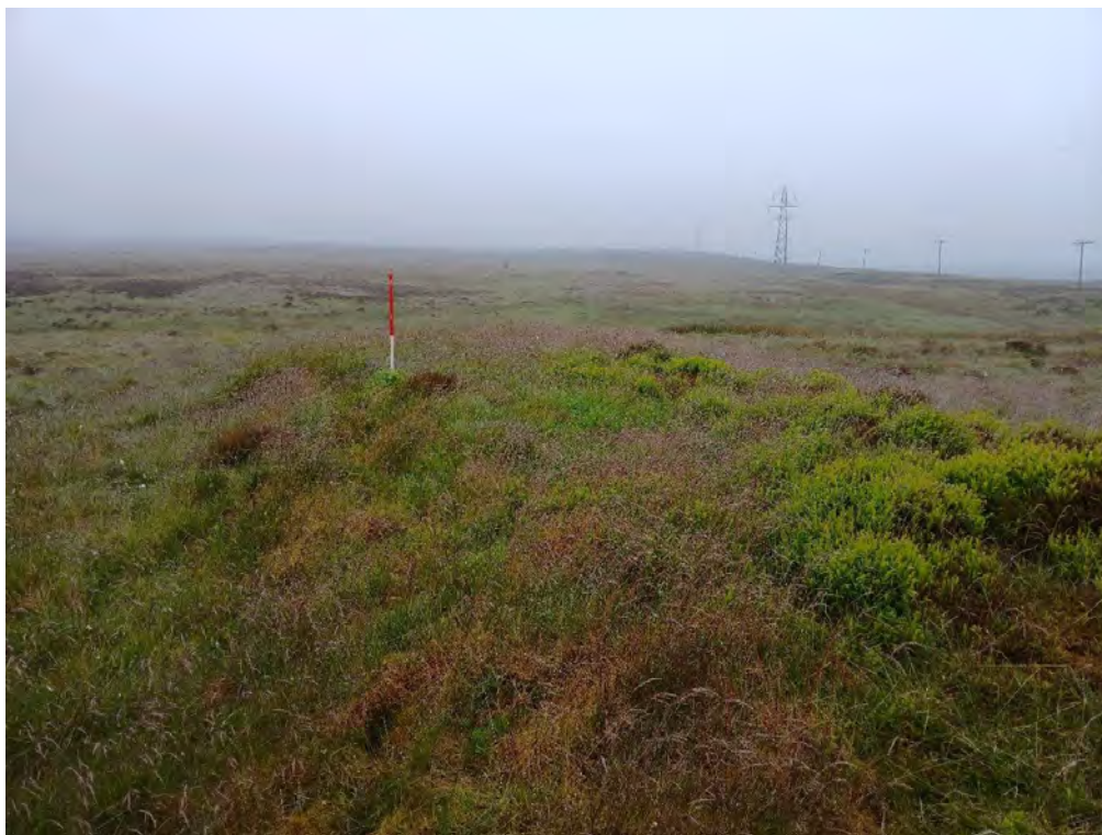
Plate 57: Mound (Asset 614), possible building, facing south-southeast