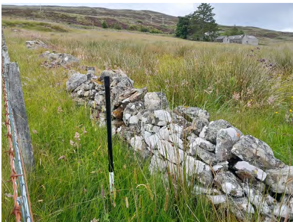
Plate 112: Drystone dyke (Asset 629), facing east-southeast