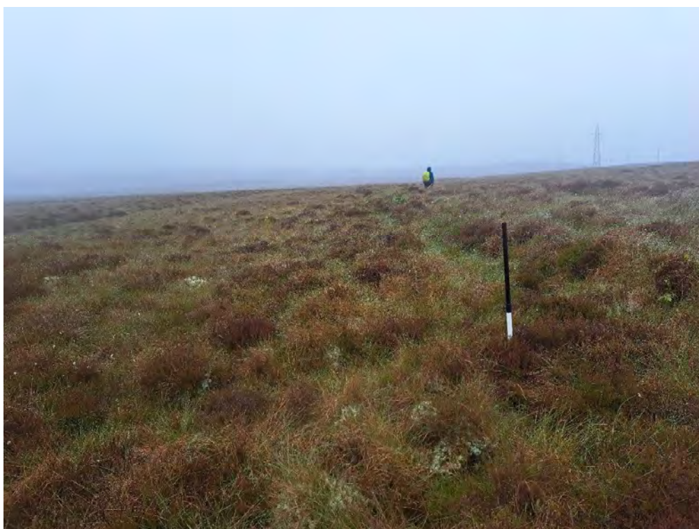
Plate 54: Peat cutting (Asset 611), facing south