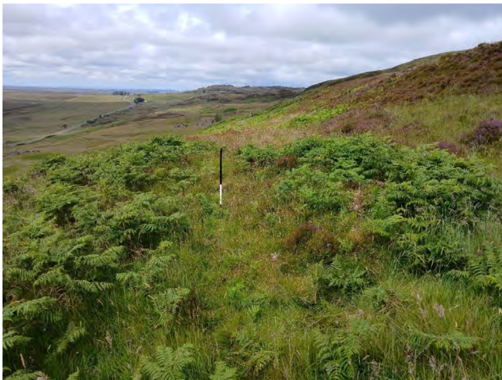
Plate 95: Possible hut circle (Asset 653), facing north