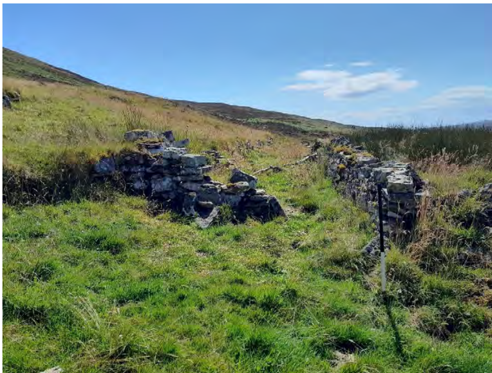
Plate 79: Track (Asset 871.5) between kale yard (Asset 871.7; right) and revetted portion of enclosure (Asset 871.8), facing south