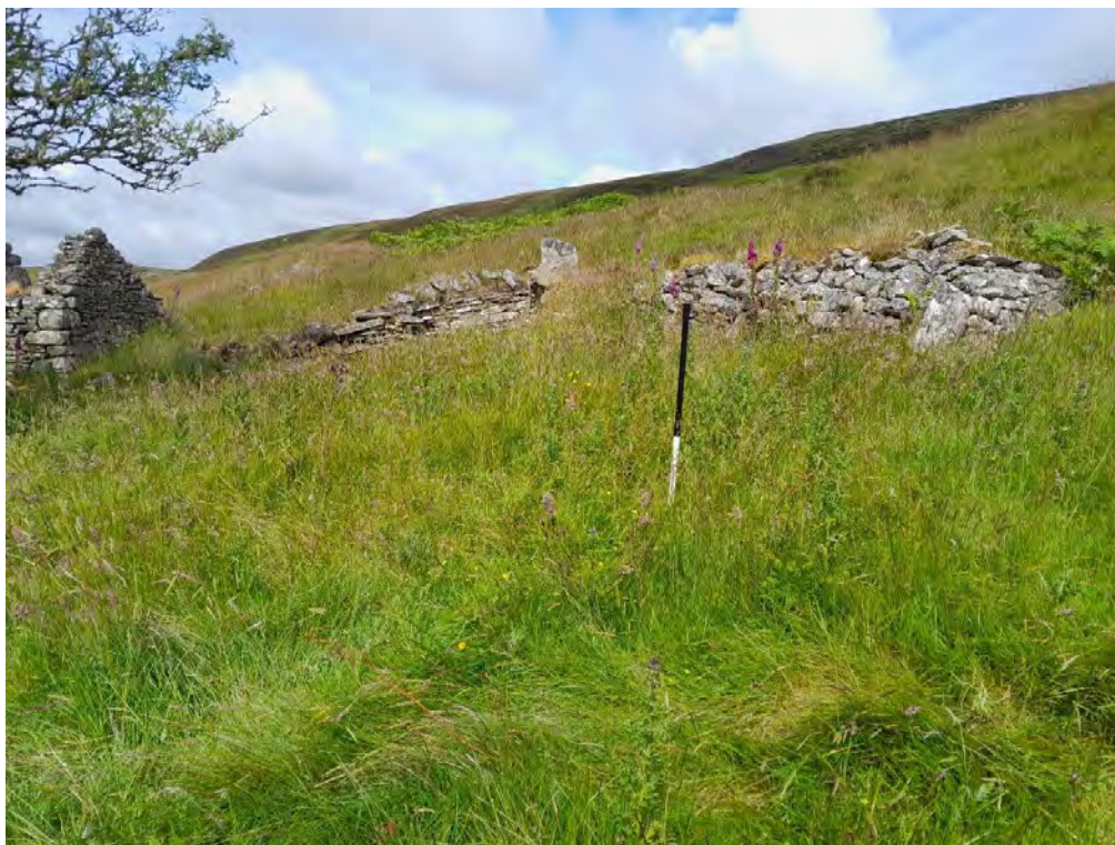
Plate 83: Enclosure (Asset 658.1) facing northeast