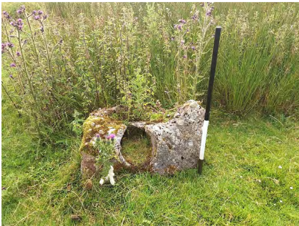
Plate 31: Concrete block (Asset 155.4) associated with farmstead (group Asset 155), facing southwest