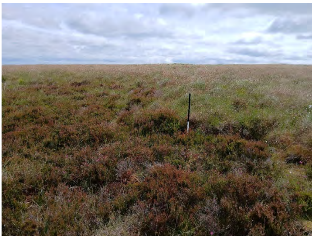
Plate 42: Peat cutting (Asset 680), facing east