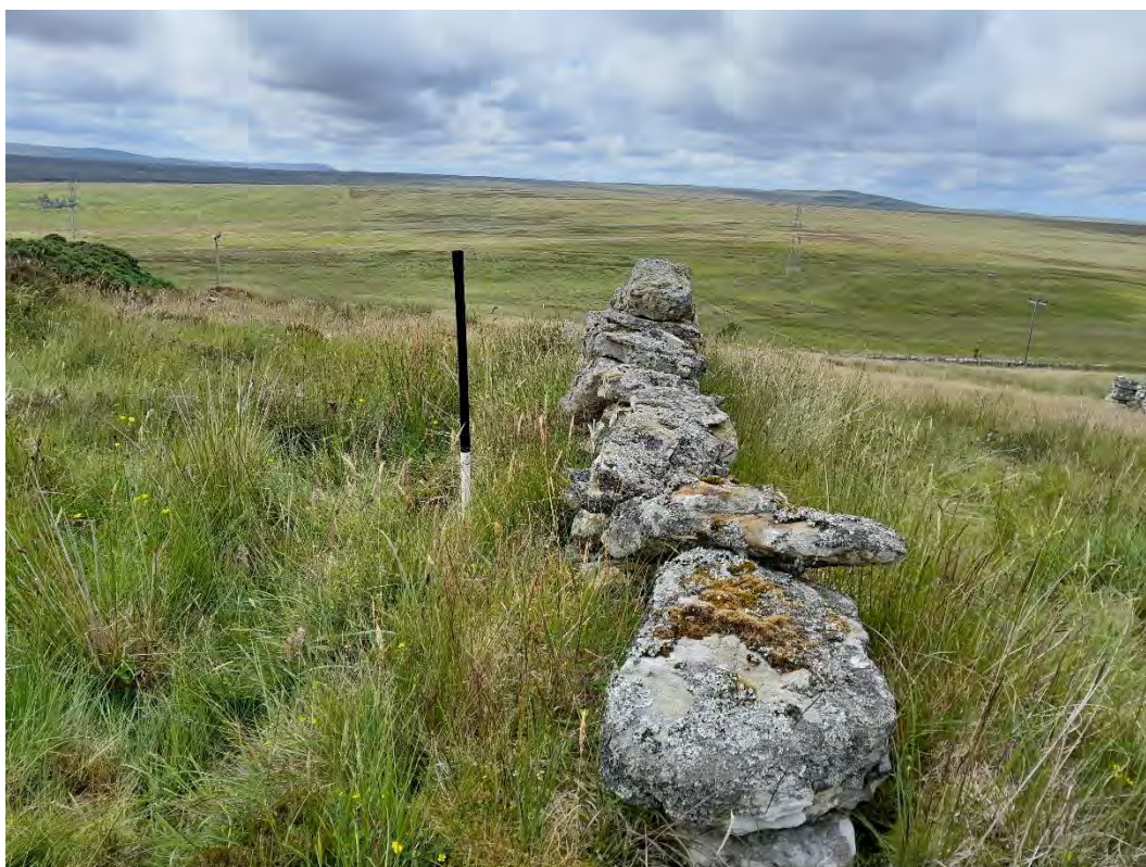
Plate 102: Enclosure (Asset 650.1), facing west