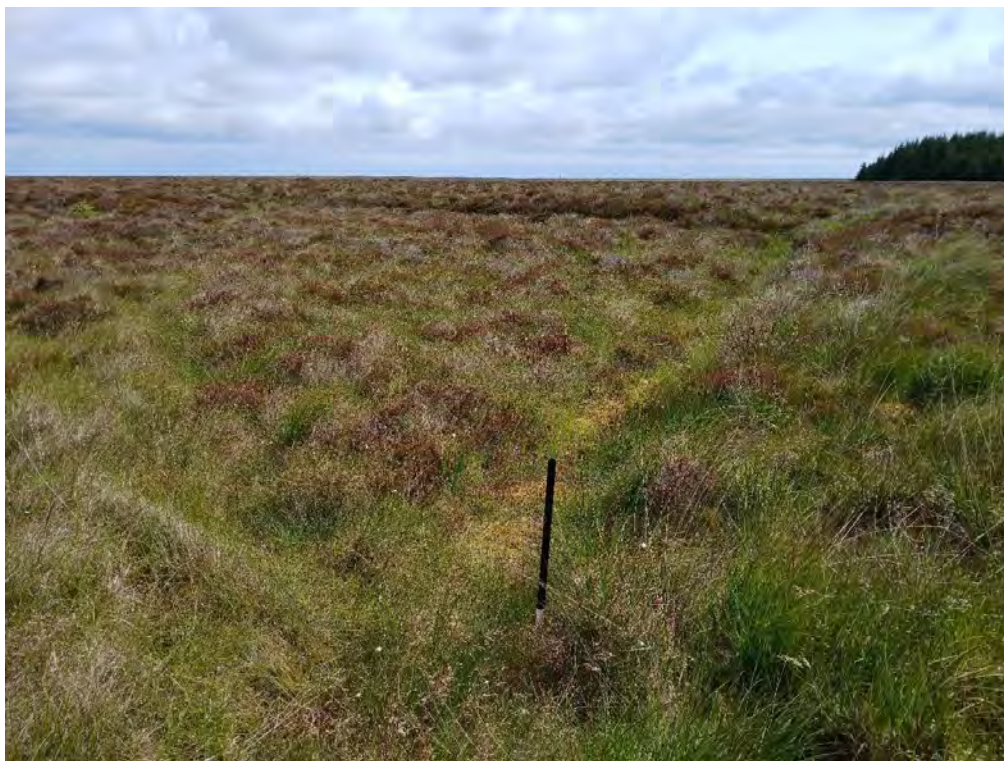
Plate 41: Peat cutting (Asset 679), facing northeast