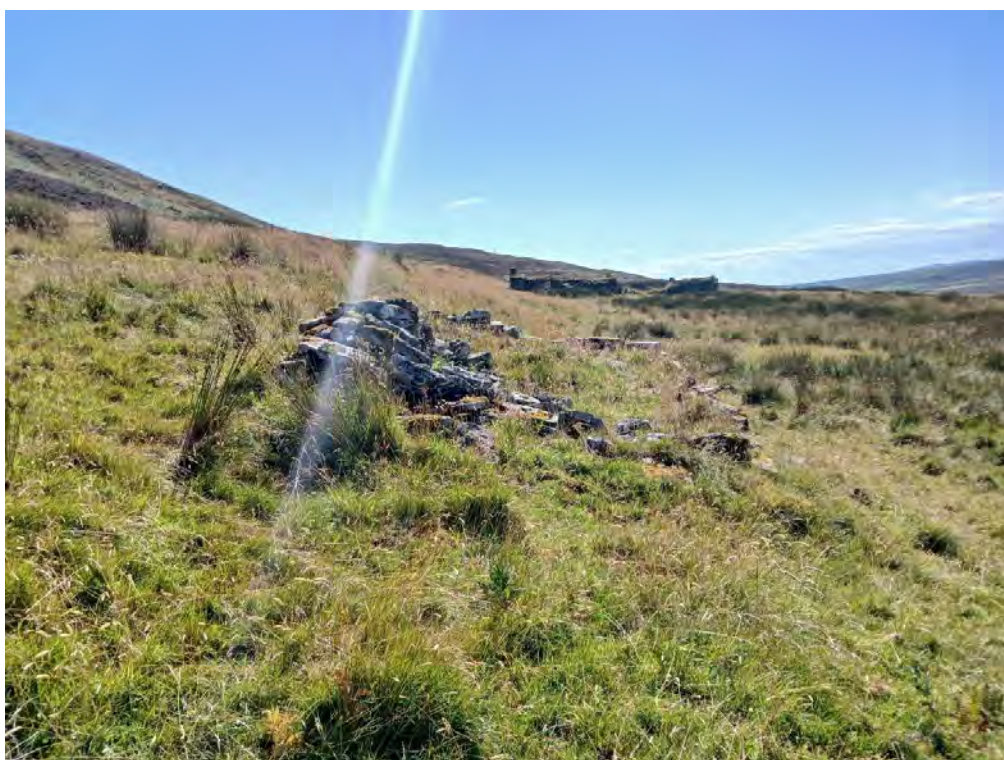
Plate 78: Building footing (Asset 871.3), facing south