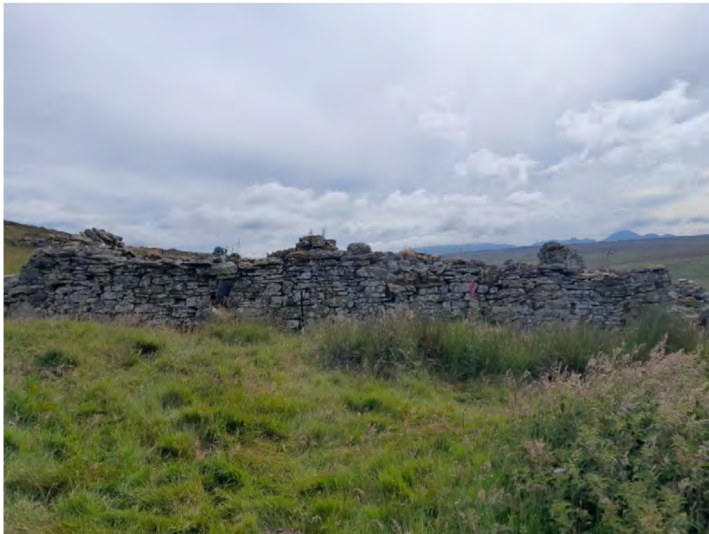
Plate 98: Crofthouse (Asset 650.2), facing southwest