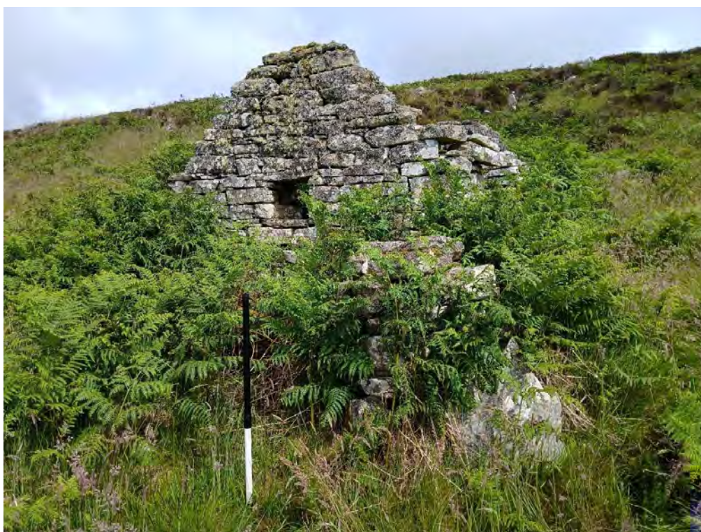
Plate 91: Building (Asset 655), facing northeast