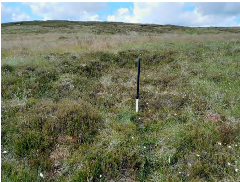
Plate 144: Hollow (Asset 781), facing southwest