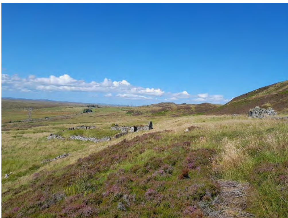
Plate 74: Farmstead complex (Asset 871), facing north-northwest