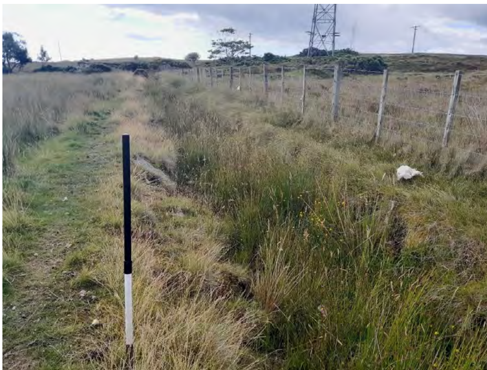
Plate 142: Ditch (Asset 699), facing south