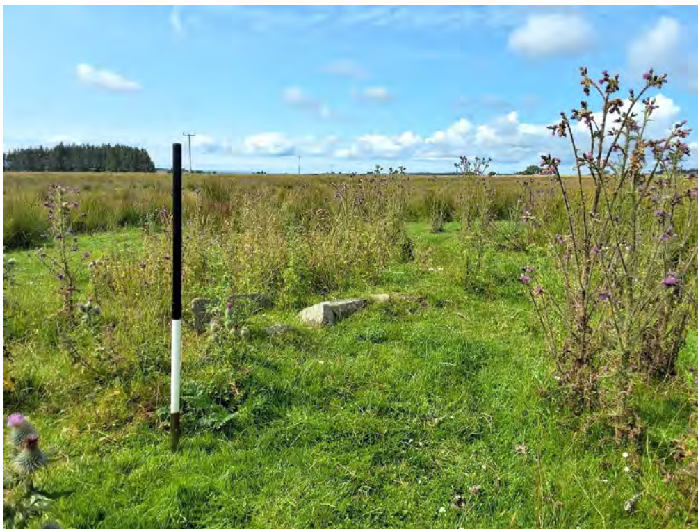
Plate 29: Enclosure dyke (Asset 115.6), facing west