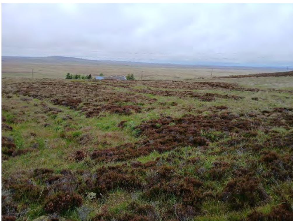
Plate 64: Peat cutting (Asset 622), facing northwest