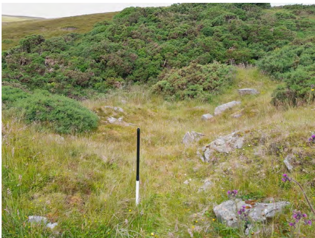
Plate 122: Quarry (Asset 640), facing northwest