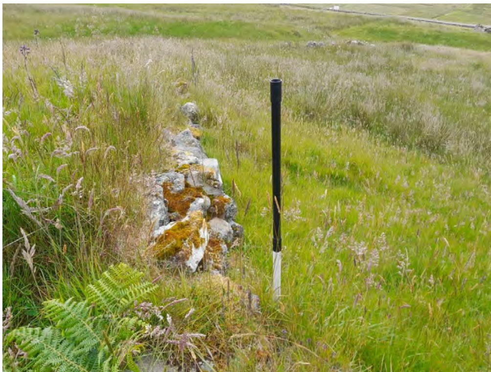
Plate 87: Enclosure (Asset 656), facing southwest