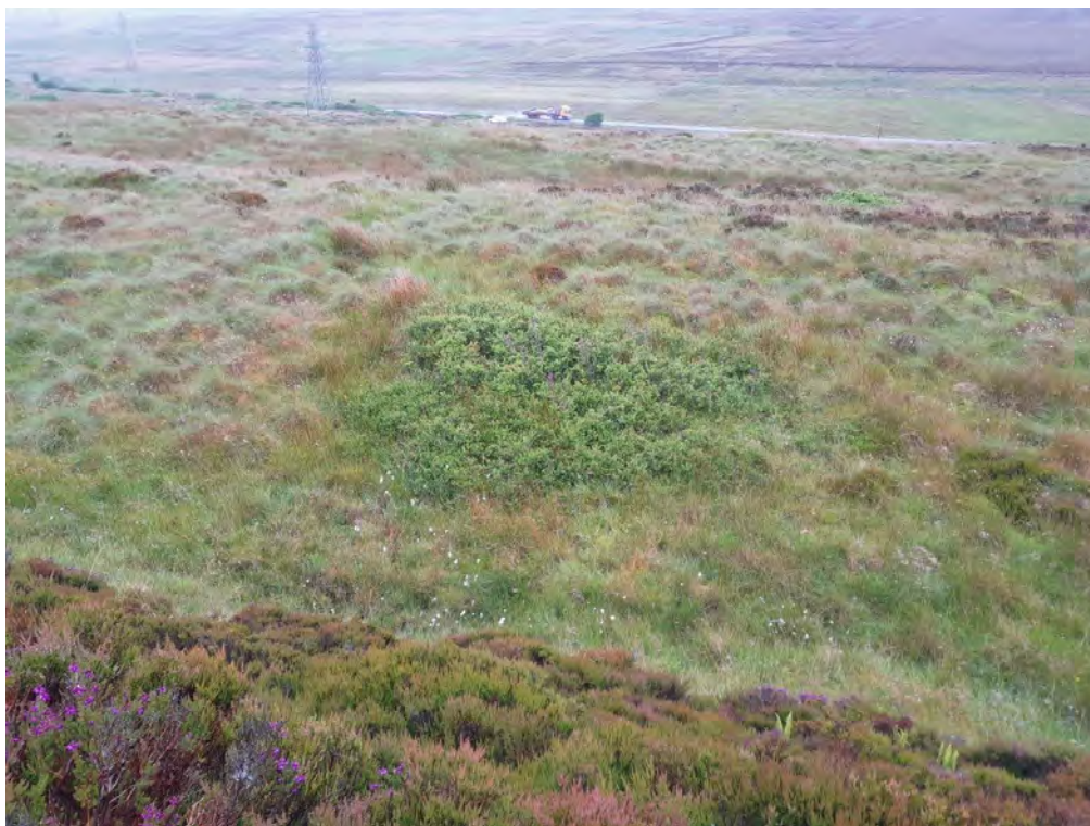
Plate 69: Shieling (Asset 665), facing west