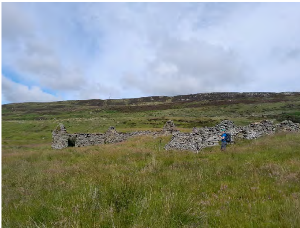
Plate 97: Crofthouses (Asset 650.3 (front) and 650.2 (back)) with linking revetment dyke (Asset 650.5), facing northeast