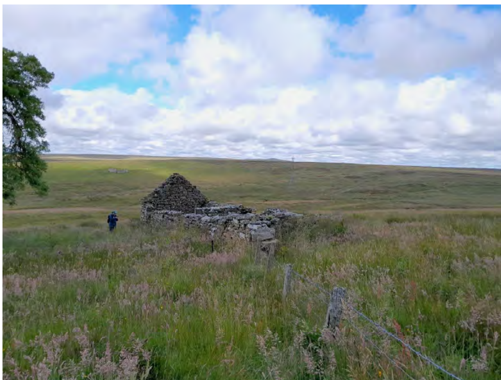
Plate 106: Crofthouse (Asset 628.1), facing west