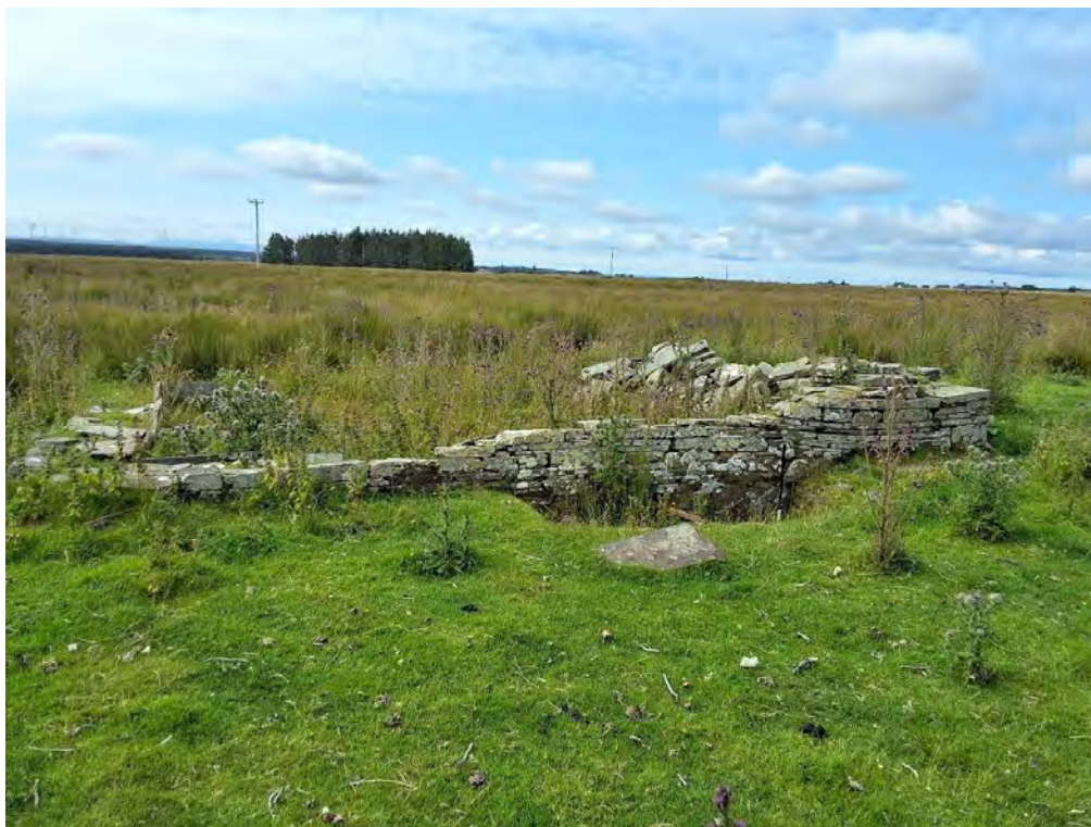
Plate 27: Building (Asset 155.3), facing southwest