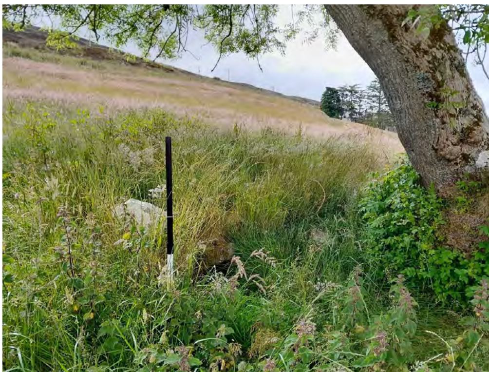
Plate 107: Revetment dyke (Asset 628.2), facing south-southwest