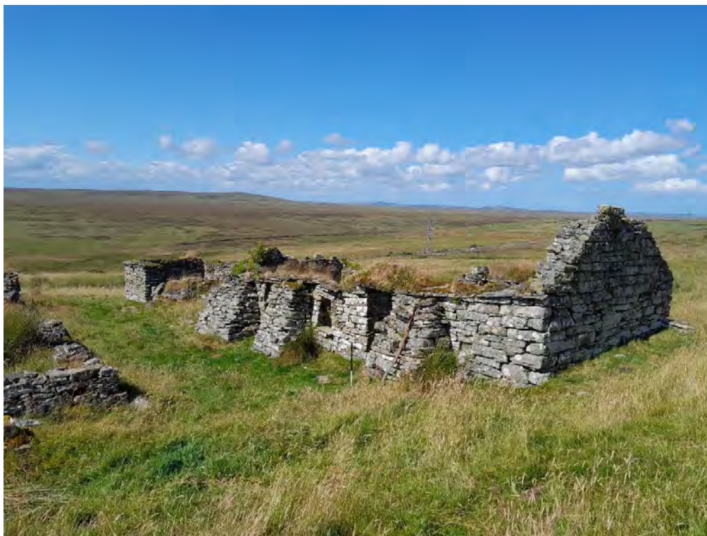
Plate 75: Crofthouse (Asset 871.4), facing northwest