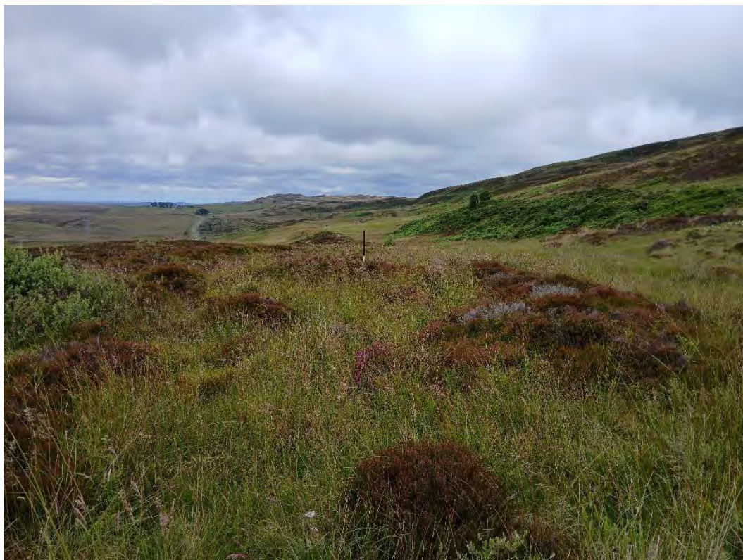
Plate 105: Hut circle (Asset 648), facing north