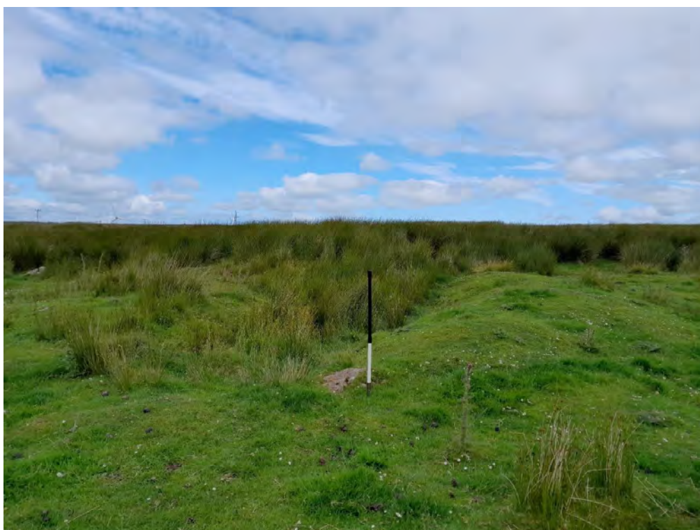
Plate 40: Bank-defined structure (Asset 682), facing north-northwest