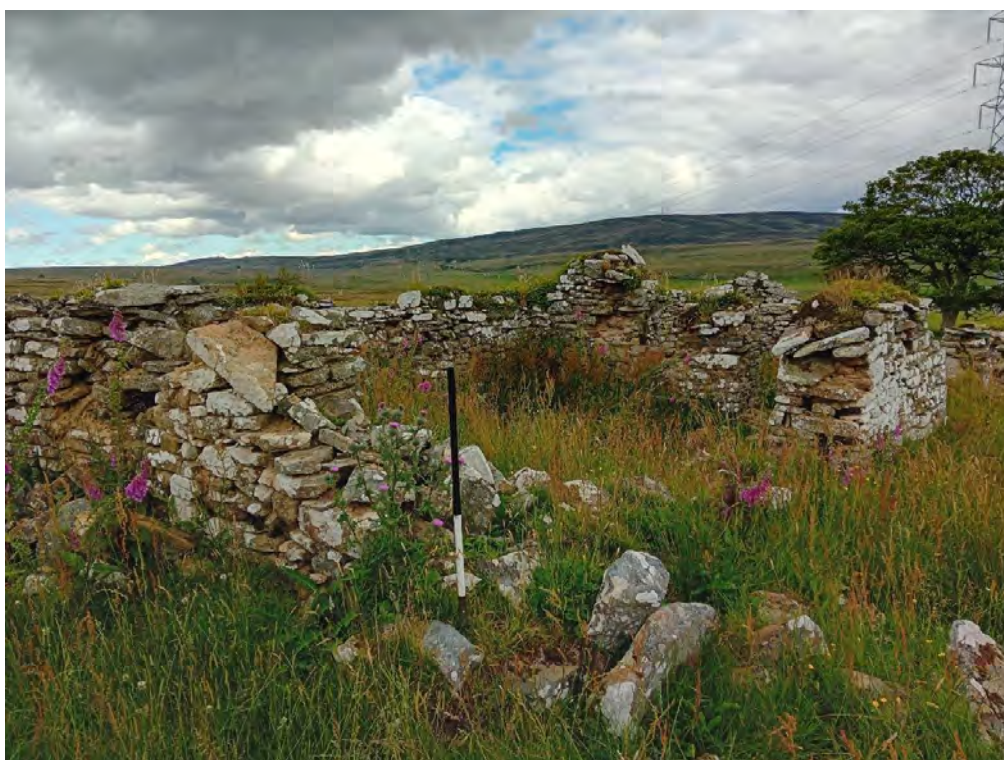
Plate 134: Ruinous crofthouse (Asset 707), facing northeast