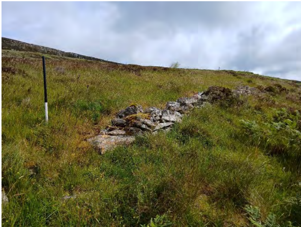
Plate 90: Enclosure (Asset 657), facing southeast