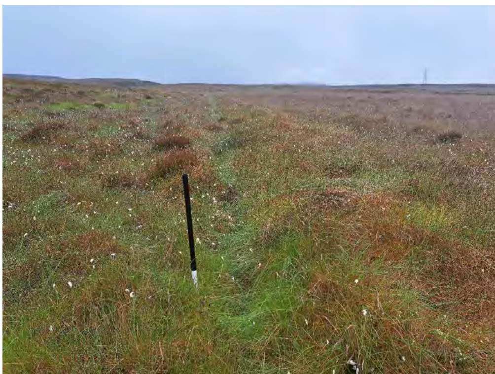
Plate 60: Drainage ditch and associated bank (Asset 618), facing south-southeast