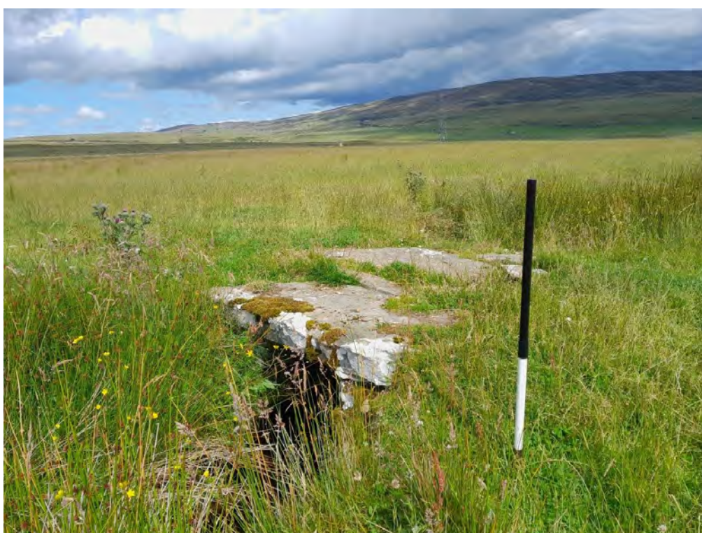
Plate 132: Bridge (Asset 711), facing north