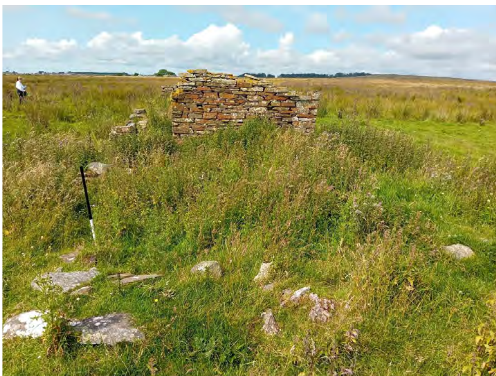
Plate 28: Pen (Asset 155.5) attached to building (Asset 155.2), facing north-northwest