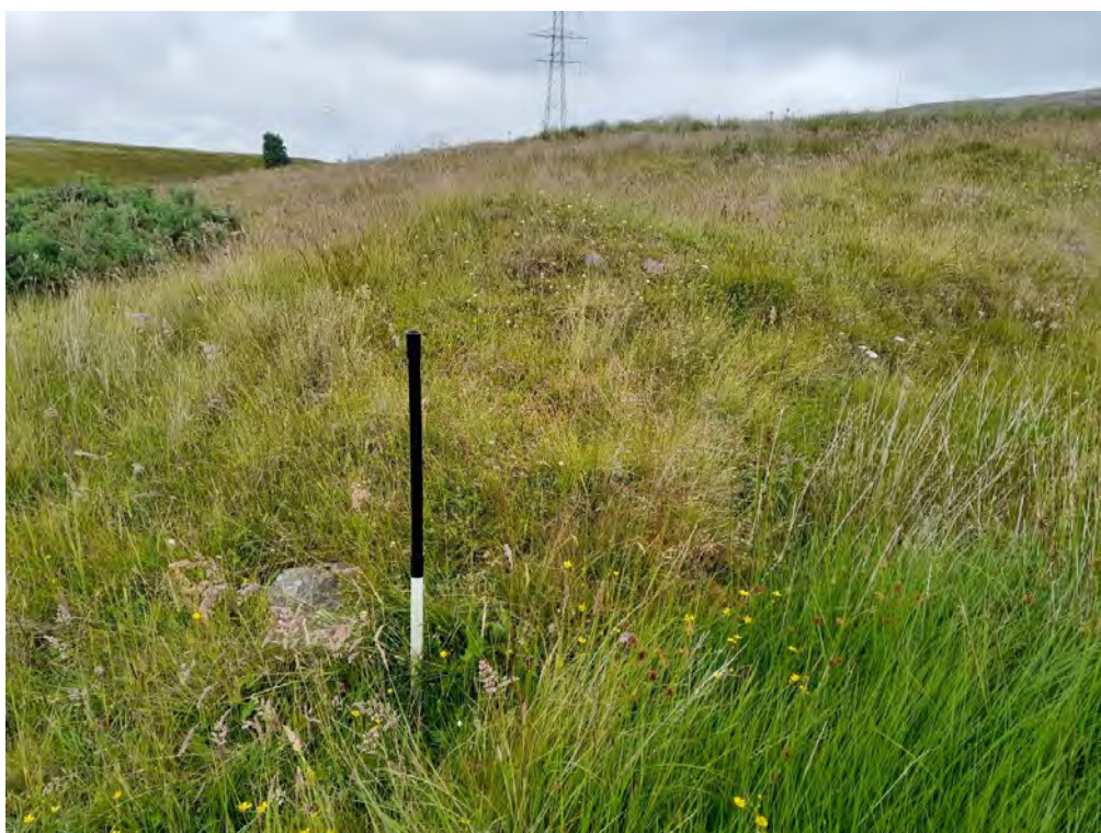
Plate 124: Clearance cairn (Asset 637.2), facing west