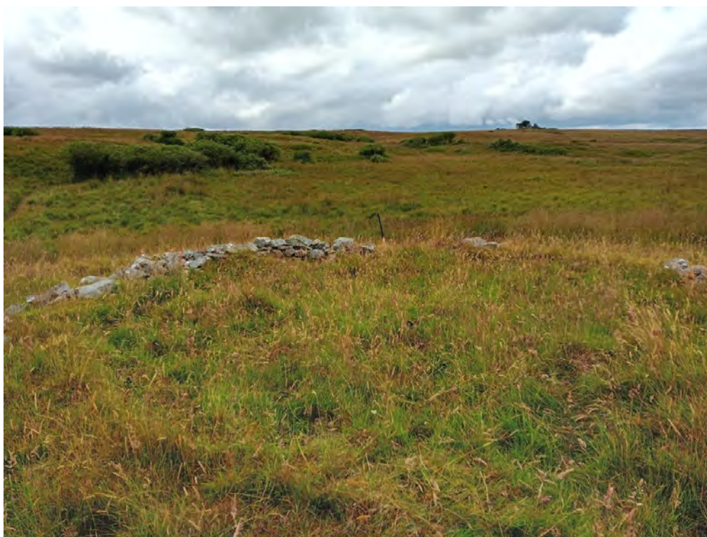
Plate 127: Circular enclosure (Asset 713), possible sheepfold, facing west-southwest