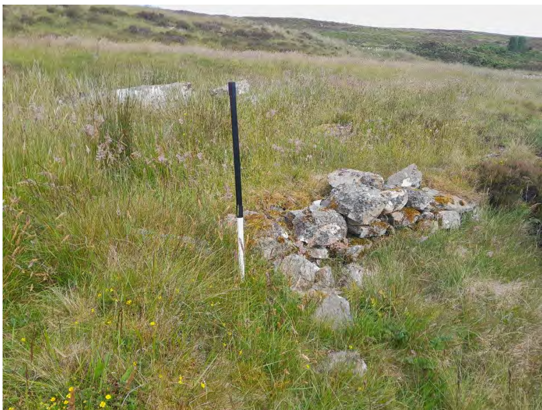
Plate 101: Revetment wall (Asset 650.1), facing southeast