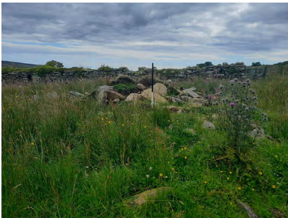
Plate 138: Clearance cairn (Asset 708) with croft house (Asset 707) beyond, facing south