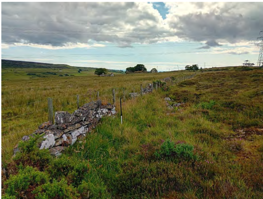
Plate 141: Drystone dyke (Asset 700), facing south