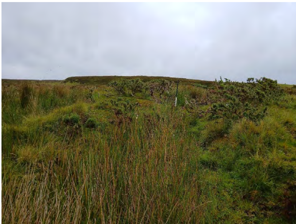
Plate 53: Turf bank and ditch (Asset 668), facing northeast