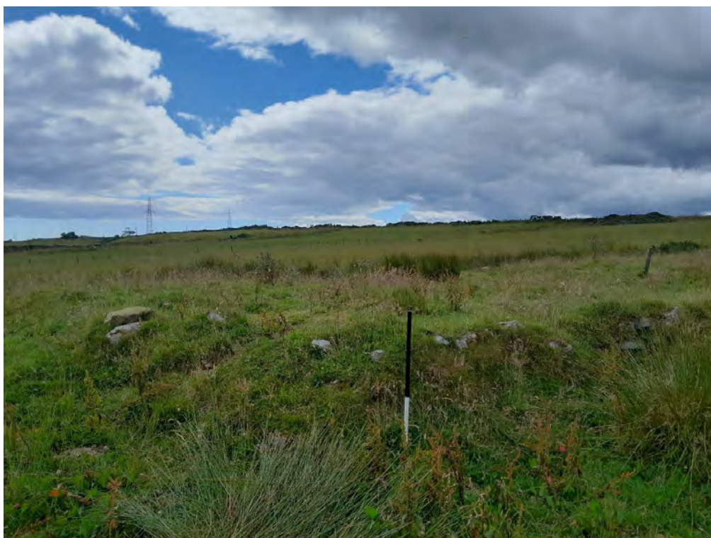
Plate 131: Enclosure (Asset 703.1), a possible kale yard, facing southwest