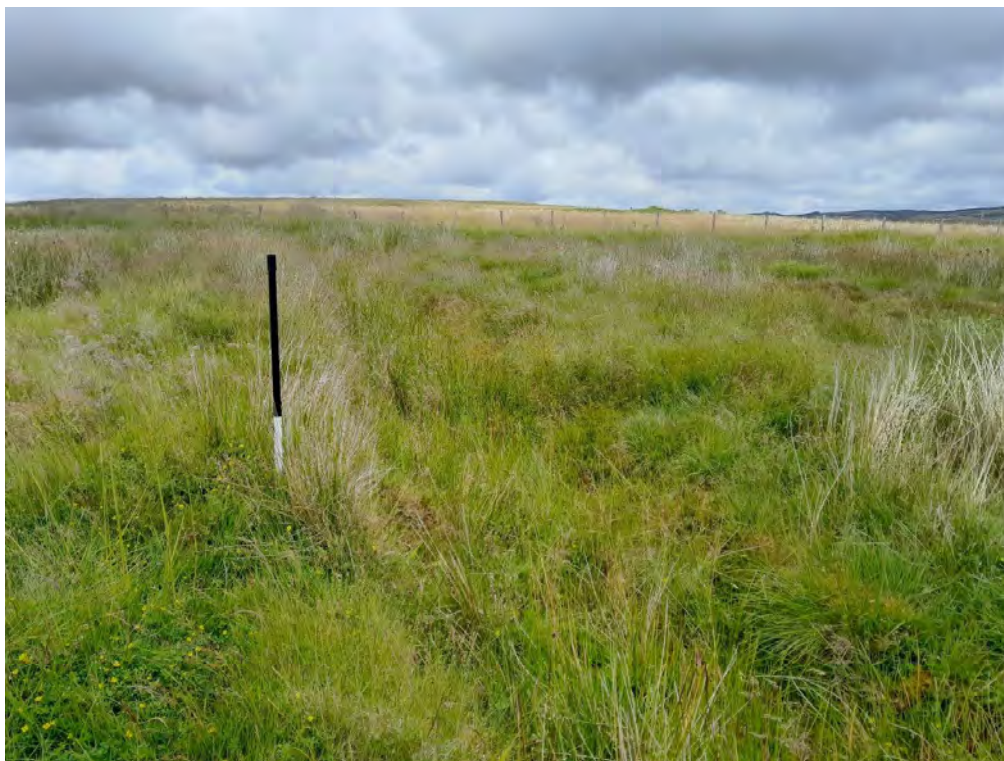
Plate 121: Drainage ditch (Asset 641), facing north