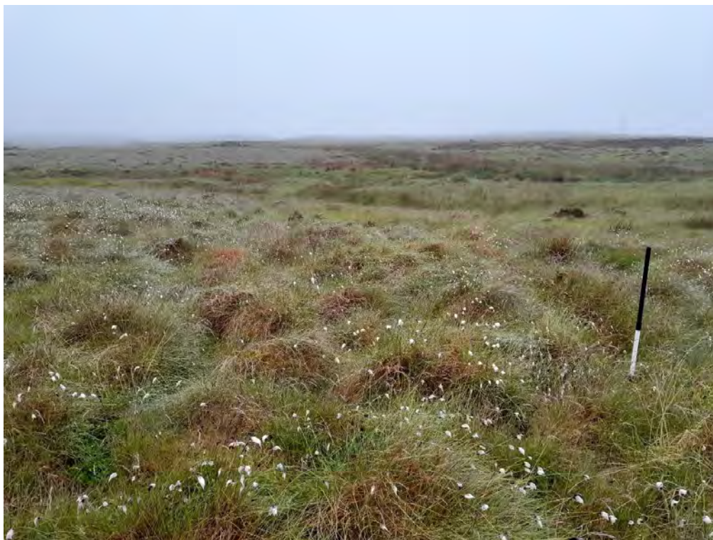
Plate 59: Possible building footings (Asset 616), facing south