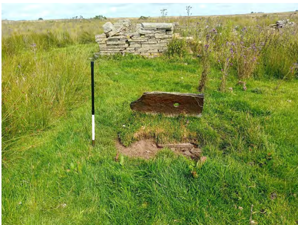
Plate 30: Possible storage pit (Asset 155.7), facing north