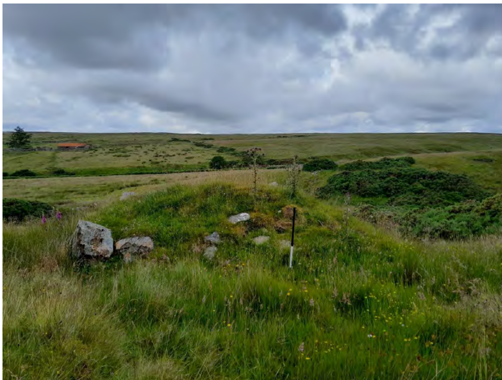
Plate 123: Clearance cairn (Asset 637.1), facing west