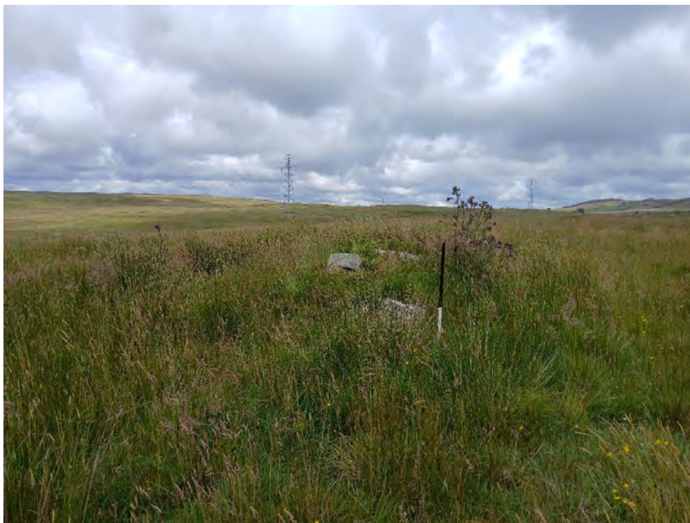
Plate 109: Clearance cairn (Asset 644), facing north