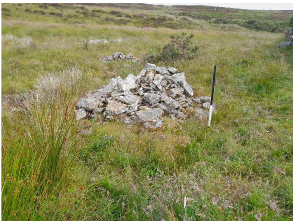
Plate 100: Clearance cairn (Asset 650.4), facing east-southeast