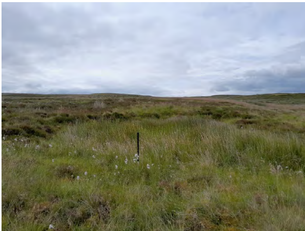
Plate 45: Possible hut circle (Asset 676), facing south