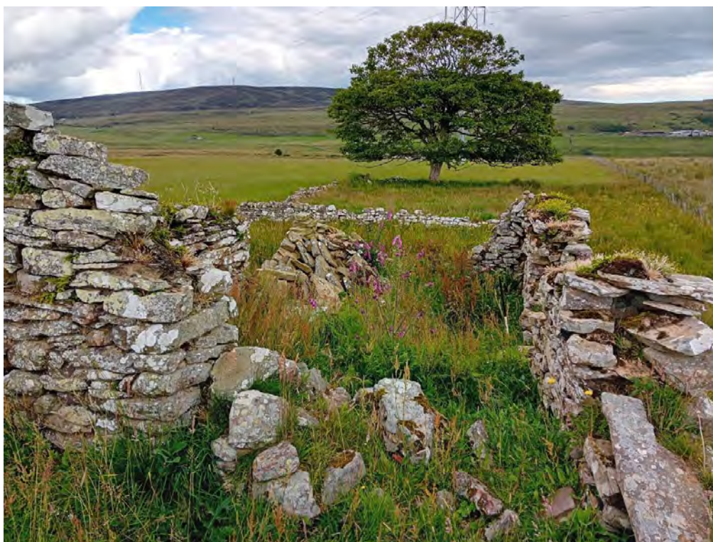
Plate 135: Ruinous crofthouse (Asset 707) with enclosure (Asset 709) beyond, facing northeast