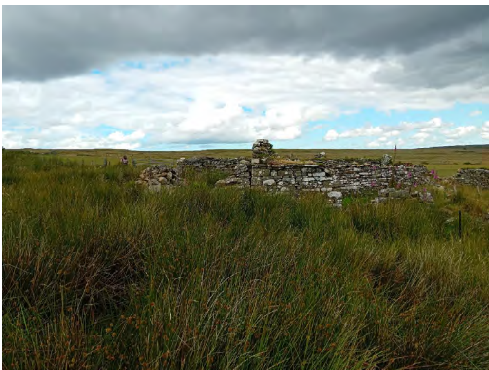
Plate 136: Building (Asset 706), facing northwest