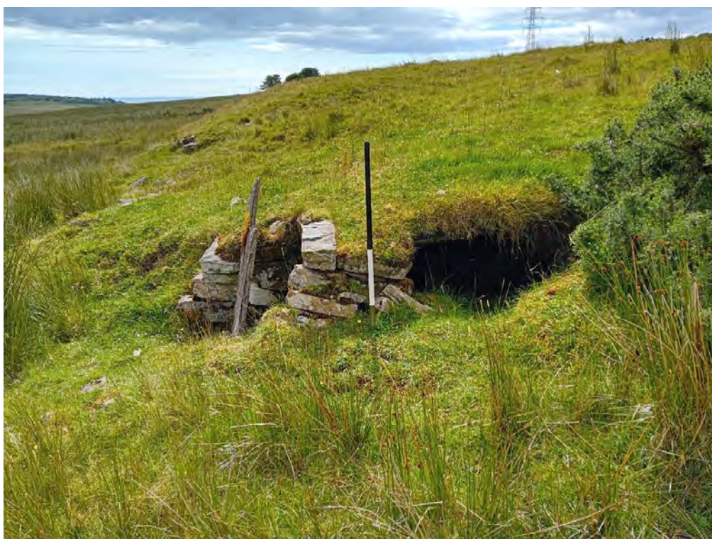
Plate 140: Subterranean structure (Asset 704), facing south