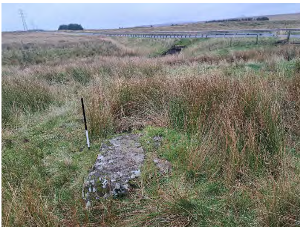
Plate 38: Stone slab (Asset 1011), facing southwest