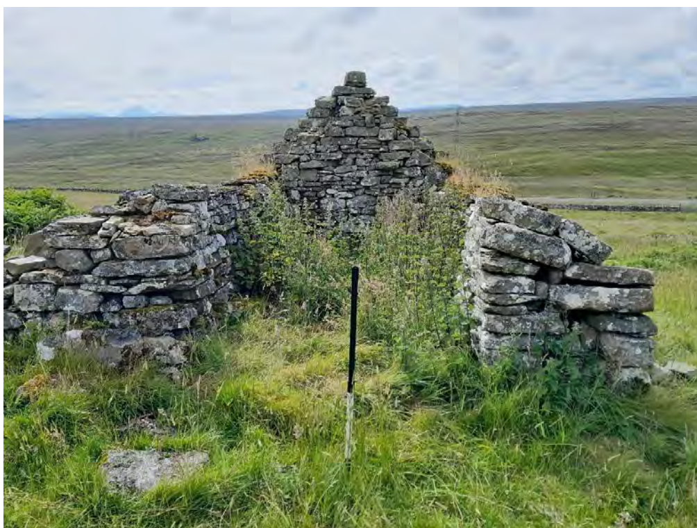
Plate 88: Building (Asset 661.1), facing west-southwest