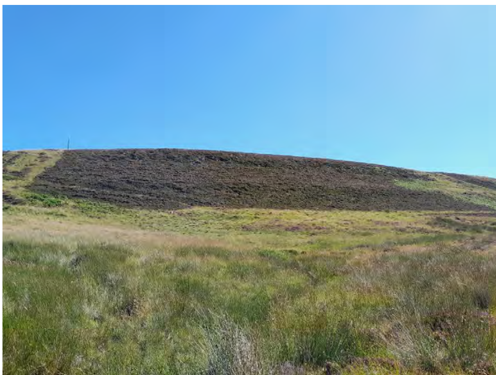
Plate 72: Degraded stone and turf dyke (Asset 871.1), facing east-northeast