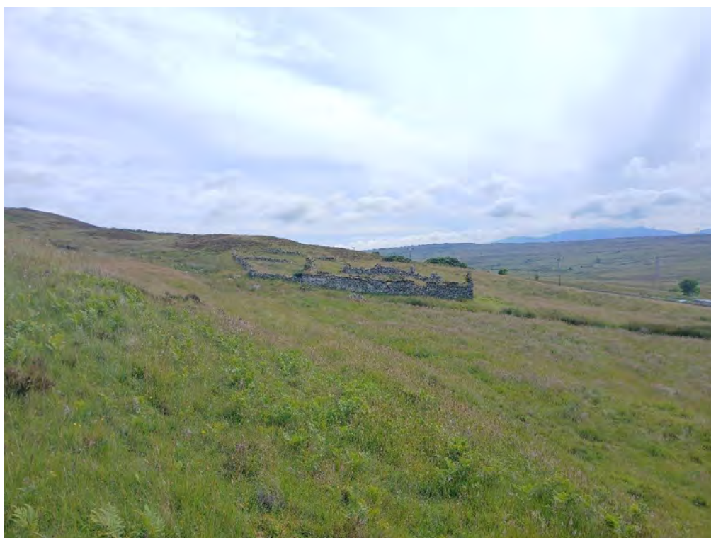
Plate 96: Farmstead complex (Asset 650), facing southwest