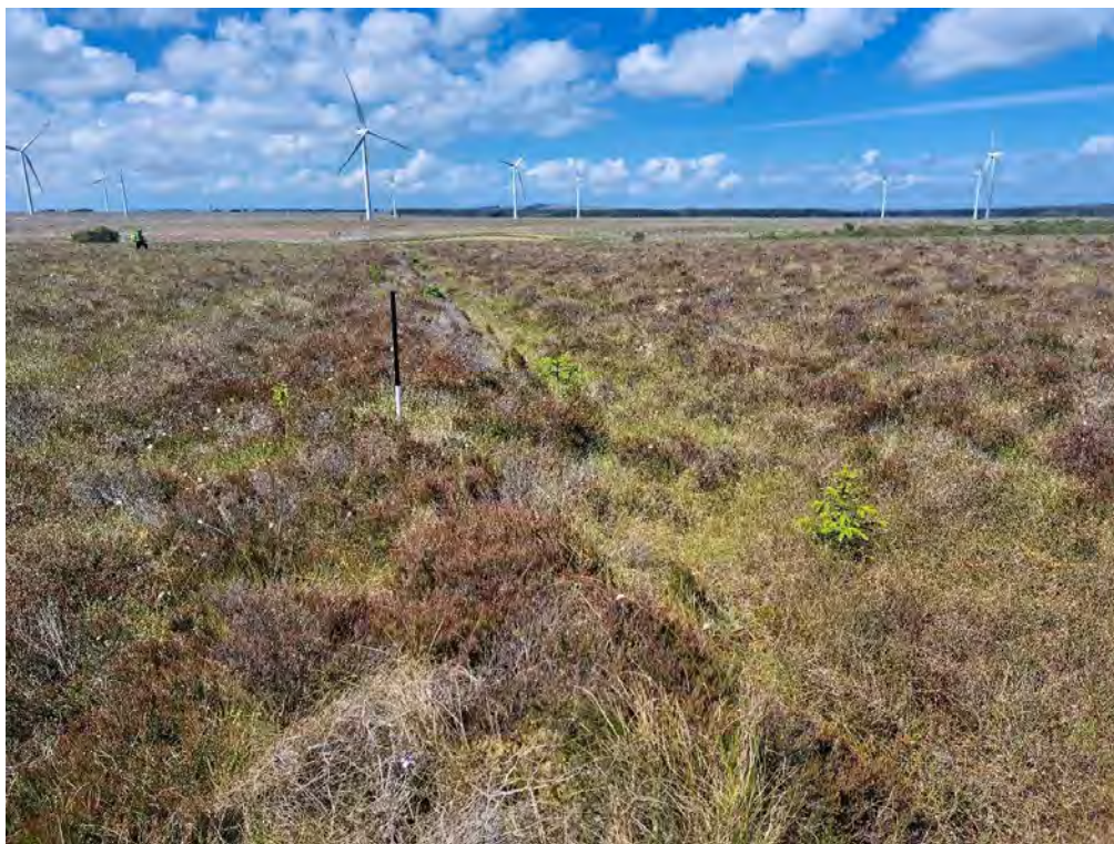
Plate 33: Drainage ditch (Asset 609), facing northwest