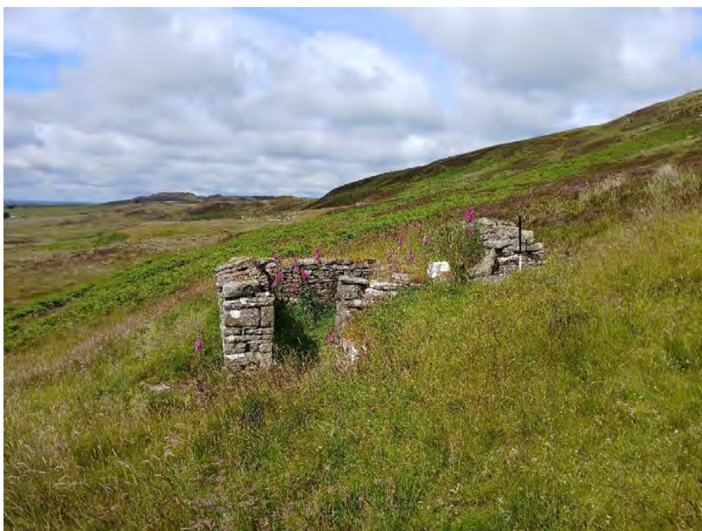
Plate 84: Revetted building (Asset 660), facing north