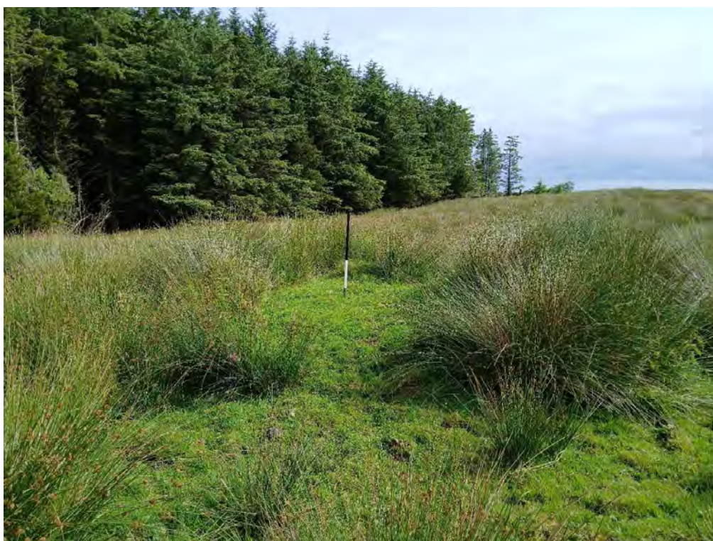
Plate 44: Mound (Asset 677), facing northeast