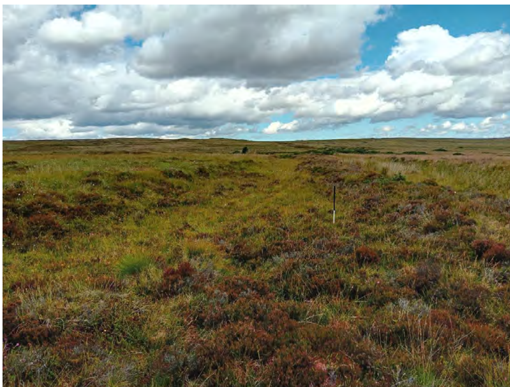
Plate 143: Relict track (Asset 701), facing north