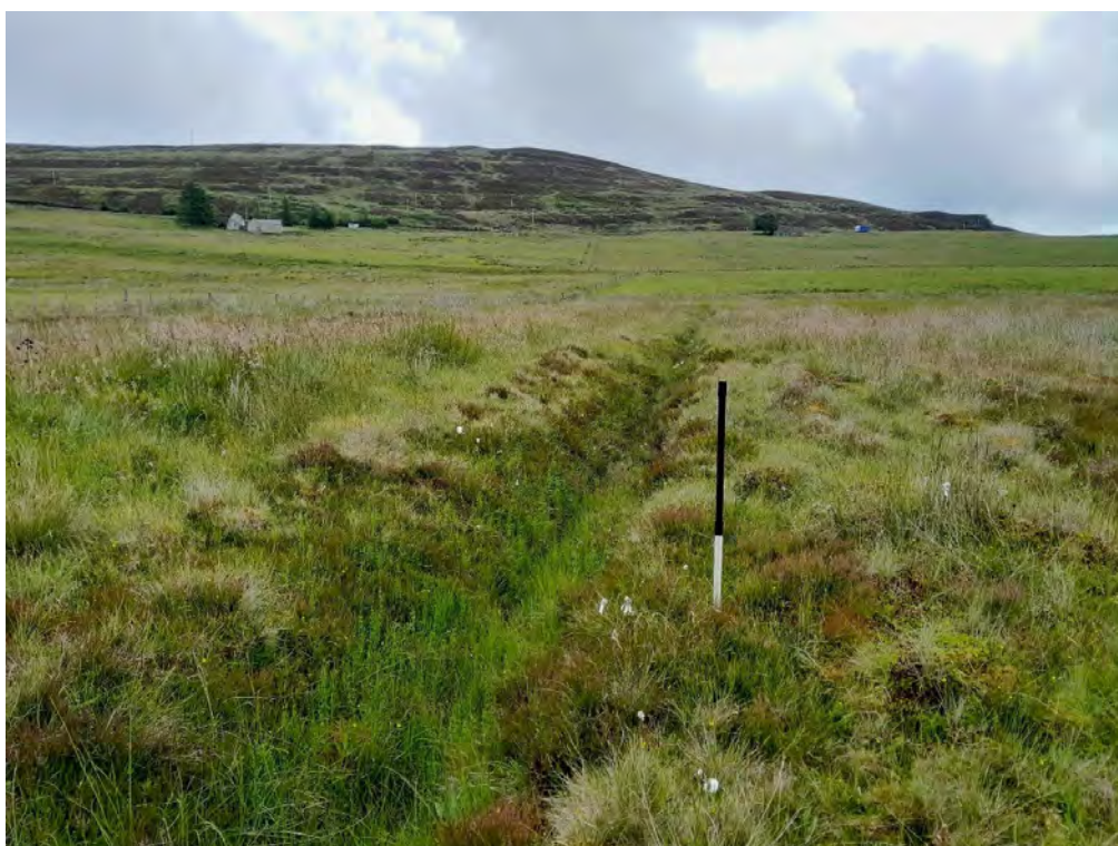
Plate 116: Drainage ditch (Asset 632.2), facing southeast