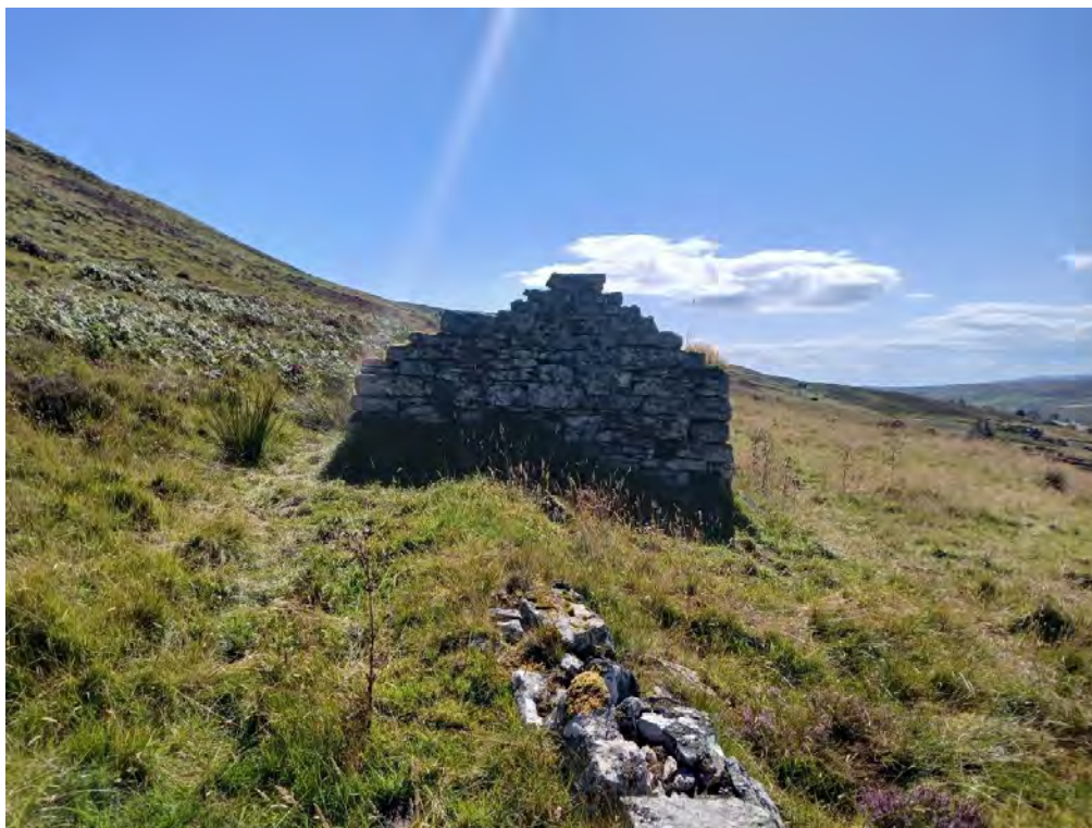
Plate 77: Building (Asset 871.6) attached to enclosure (Asset 871.8), facing south-southeast