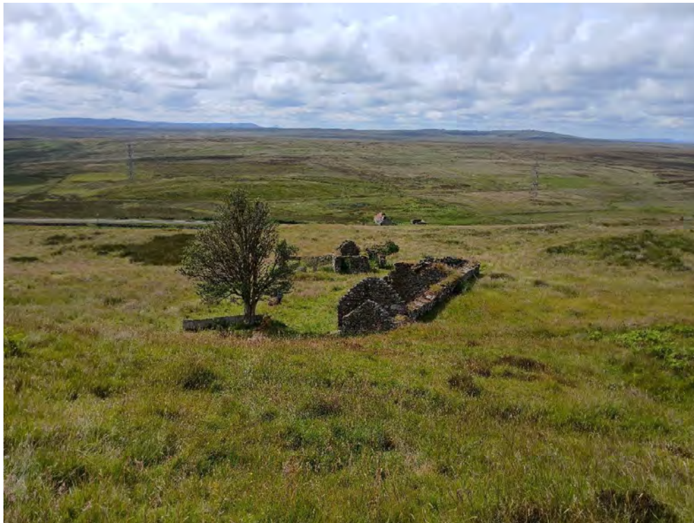
Plate 80: Farmstead complex (Asset 658), with main croft house (Asset 658.2) in centre, facing west