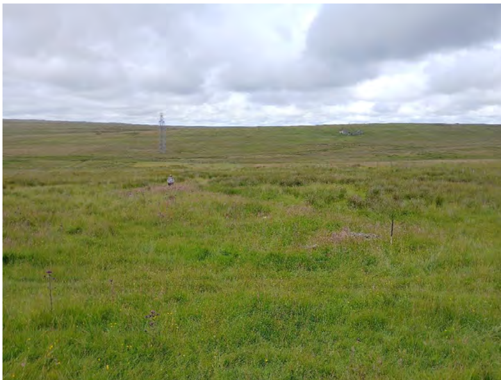
Plate 113: Footings for building (Asset 631), facing west-northwest