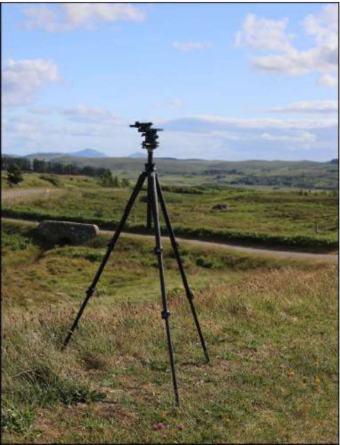
Grid Reference: 290196 964007