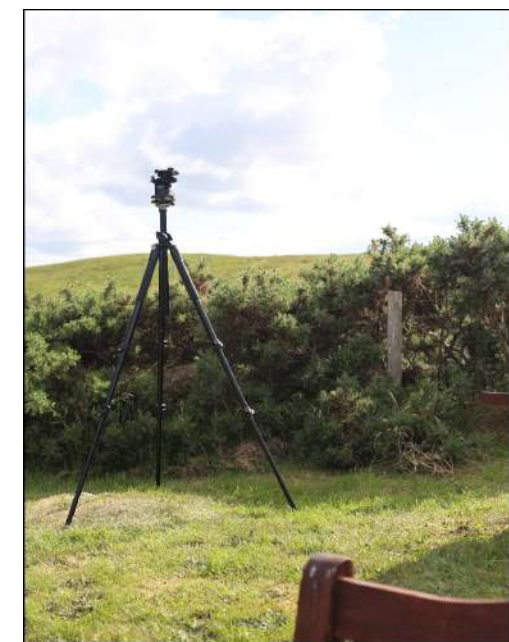
Grid Reference: 287642 965055