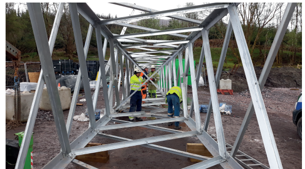
Cable sealing end tower assembly

Safety is always our first priority at SSEN Transmission and with this in mind, we ask that you please remain vigilant of signage or direction around the construction works and do not enter our working areas. Users of the access tracks are asked to obey signage and are reminded that large vehicles and construction traffic are also using the tracks.